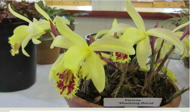
Ian Steele's Pleione Shantung 'Ducat'