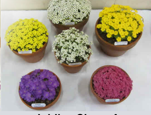
Jubilee Class A was initiated in 1993 for the SRGC 60th Anniversary Golden Jubilee. It is for 6 pans limited in size to 17.5 cm outside diameter [6"]