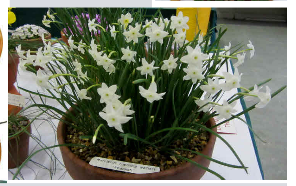
Carole & Ian Bainbridge seem to be the only people in Scotland who can turn out super pans of Narcissus rupicola watieri 'Abaleish'. Even N. rupicola itself is rarely seen these days. It used to be cheap and easy to get but not now!