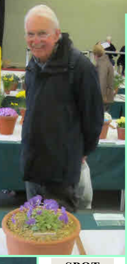
SPOT A FRIEND