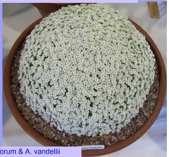
Androsace studiosorum & A. vandellii