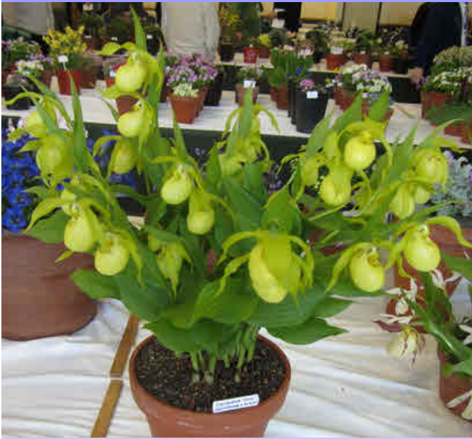
A Certificate of Merit for Cyril Lafong's Cypripedium 'Ursel' which is a cross between C. fasciolatum and C. henryi