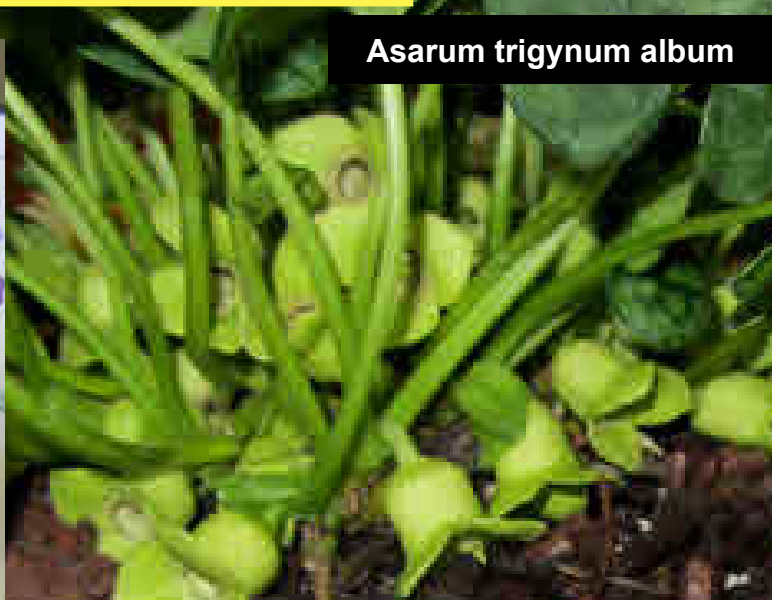
Asarum trigynum album