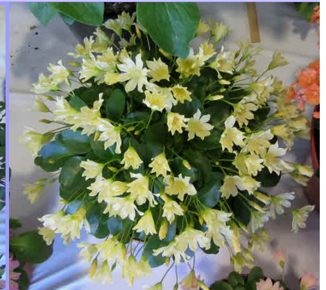
A wonderful Lewisia cotyledon between two exceptional Lewisia tweedyi plants