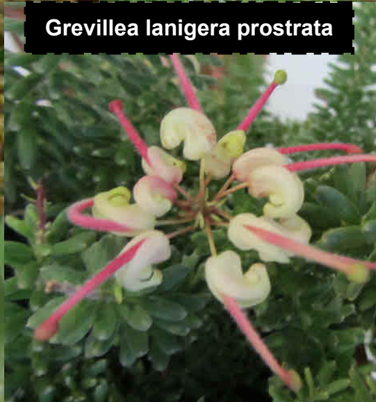
Grevillea lanigera prostrata