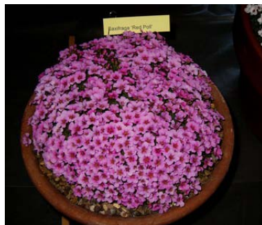
Saxifraga Red Poll