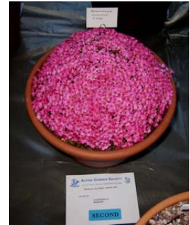
Saxifraga Coolock Kate