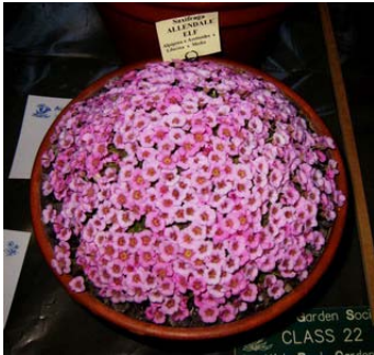
Saxifraga Allendale Elf