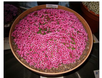
Saxifraga Lismore Carmine