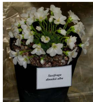
Saxifraga dinnikii alba