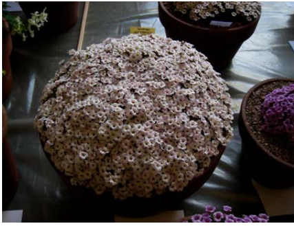
Saxifraga Allendale Hybrid