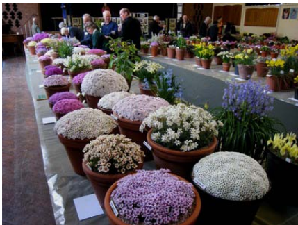
The show hall, during judging.

Once the classes have been judged the judges get together to find the best plant in the show and other special awards.