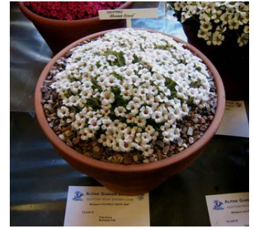
Saxifraga Allendale Accord