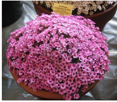
Saxifraga Your Success