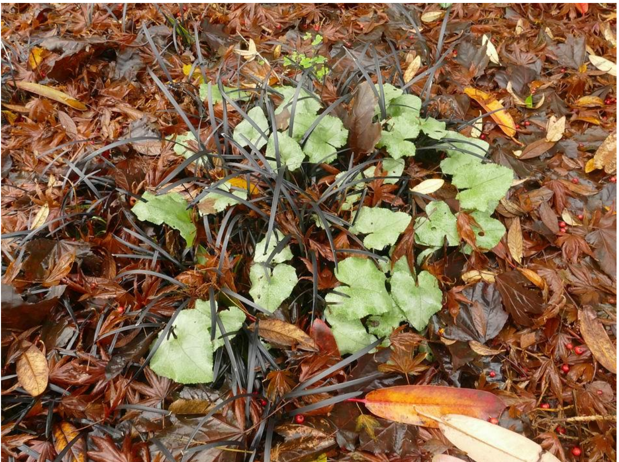
The scene is further enhanced here as the Cyclamen shares the ground with Ophiopogon planiscapus 'Nigrescens'.