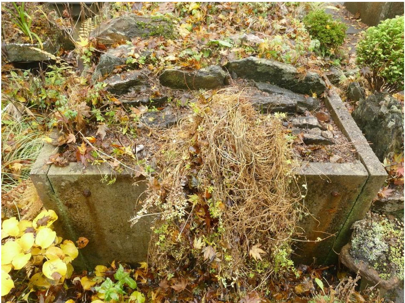
The stems spread out from a small area of root stock and now the frosts has stopped the growth I remove the mat to allow the bulbs that also grow there to see the light.