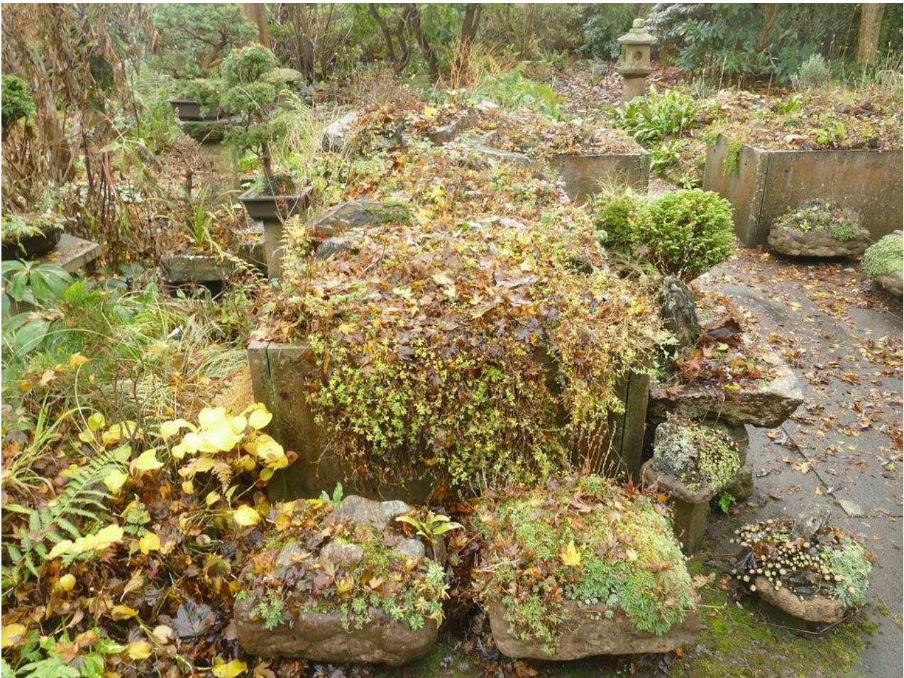
Among the many annual routines which mark the changing of a season is when I lift away of the growth mat of the Cyananthus lobatus hybrid cascading over this end of the slab bed.