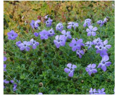
A reminder of the plant in flower.

Now the old growth is cleared I see that the plant is not really asleep because next years shoots are already emerging the same as they are on this Cyananthus micophylus which also grows in this bed.