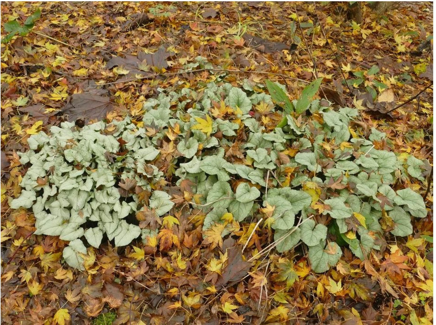
I love the way the recently emerged leaves of Cyclamen hederifolium contrast with those of the Acers which have finished their annual cycle and now cover the ground.