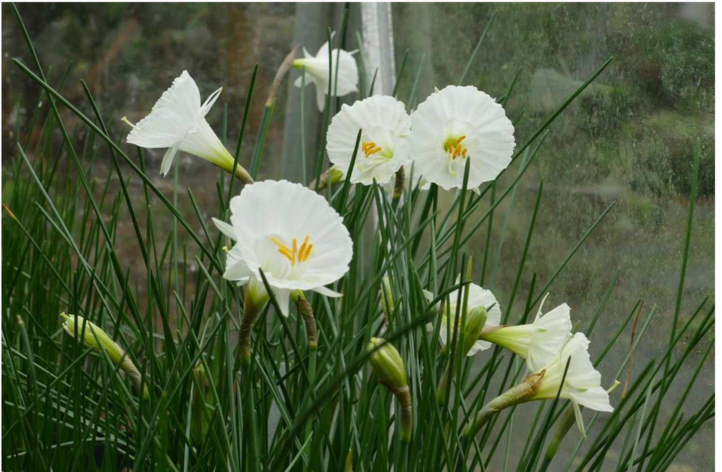
Narcissus 'Craigton Choirster'