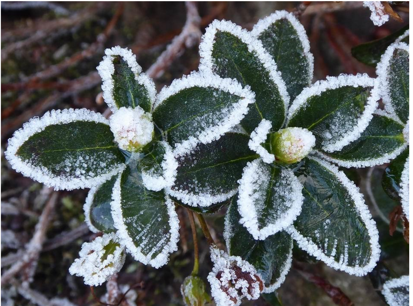
Rhododendron buds encrusted with frost make a very seasonal image.