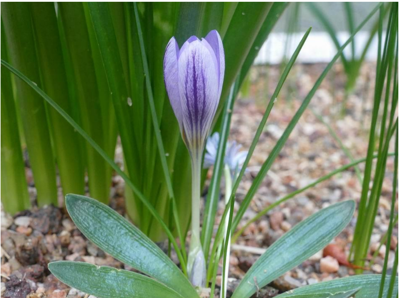
While this Crocus laevigatus is growing in one of the bub house sand beds.