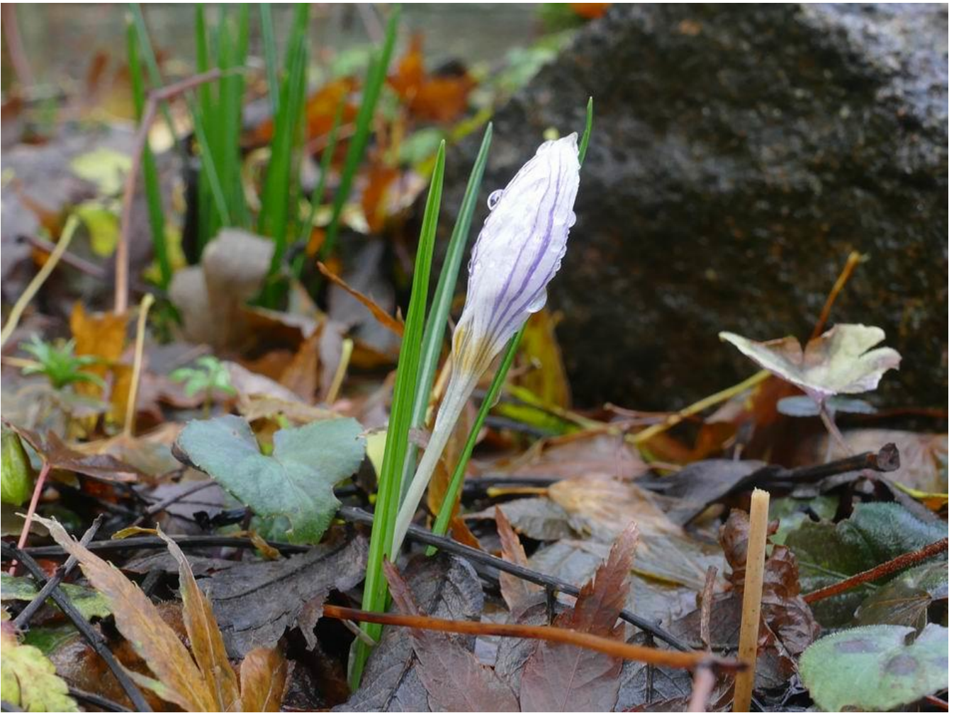
Crocus laevigatus flowering is now flowering outside in a slab bed.