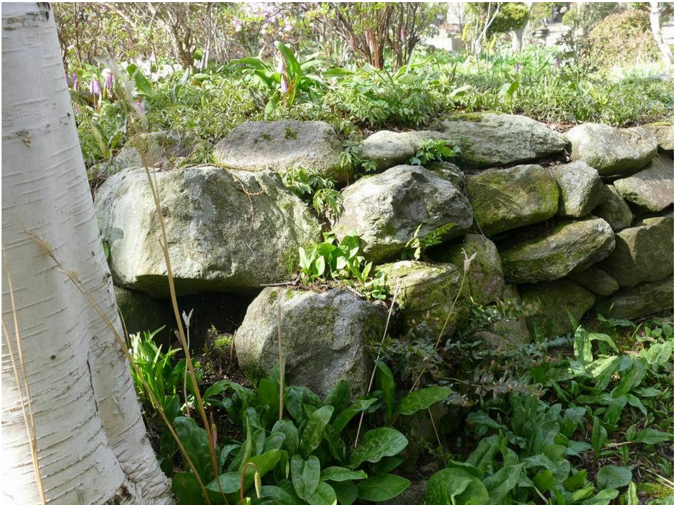
One of my long term projects is to get more plants growing in this section of wall I had to rebuild a few years ago, A group of Erythronium can be seen on a ledge towards the left see detail below.