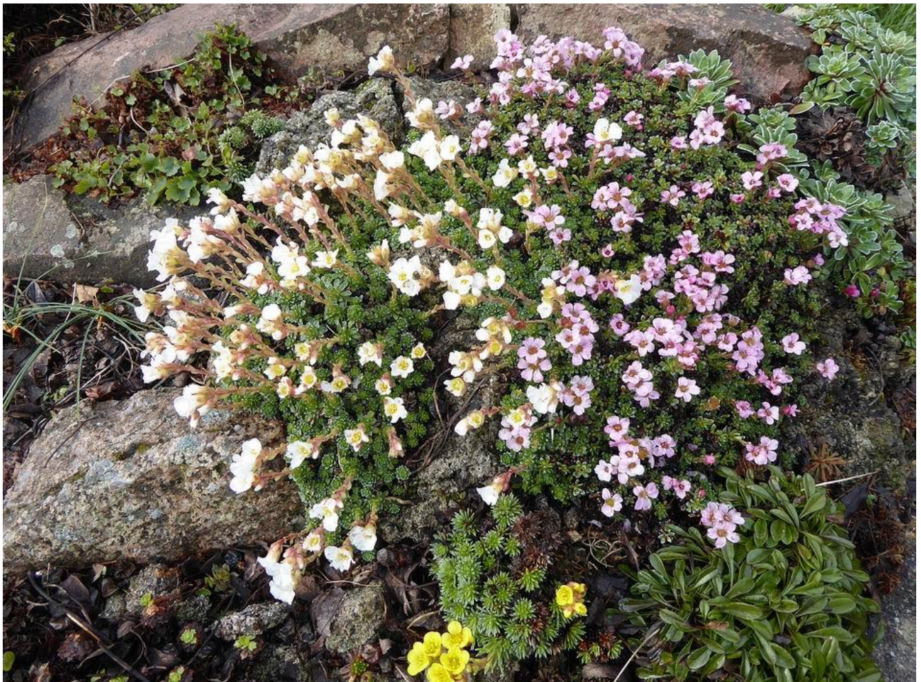
Saxifrages after the snow.