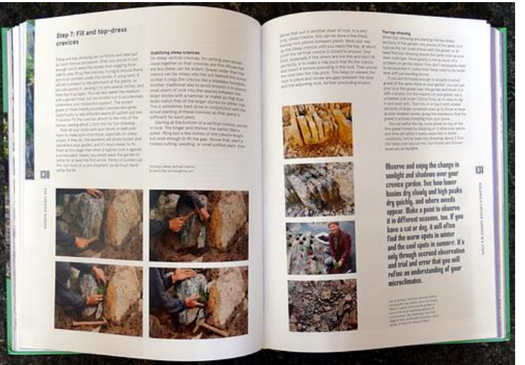
The above selection of images are just a sample of the clear attractive layout of the book.