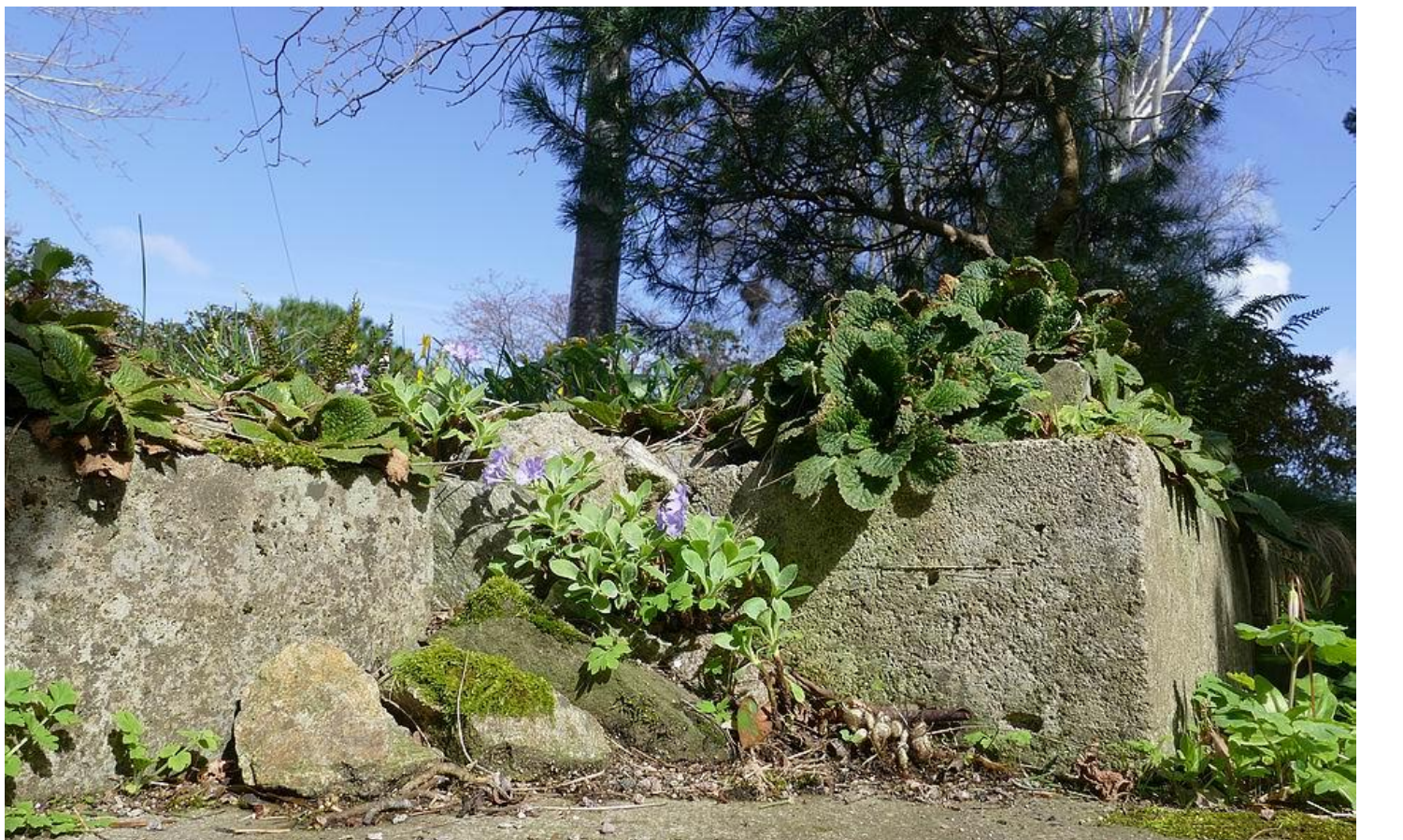
The book shows crevice gardens of all sizes and we have made good use of this style across the garden such as this tiny section of crevice used to resolve an ugly joint between two troughs that form the edges to a raised bed