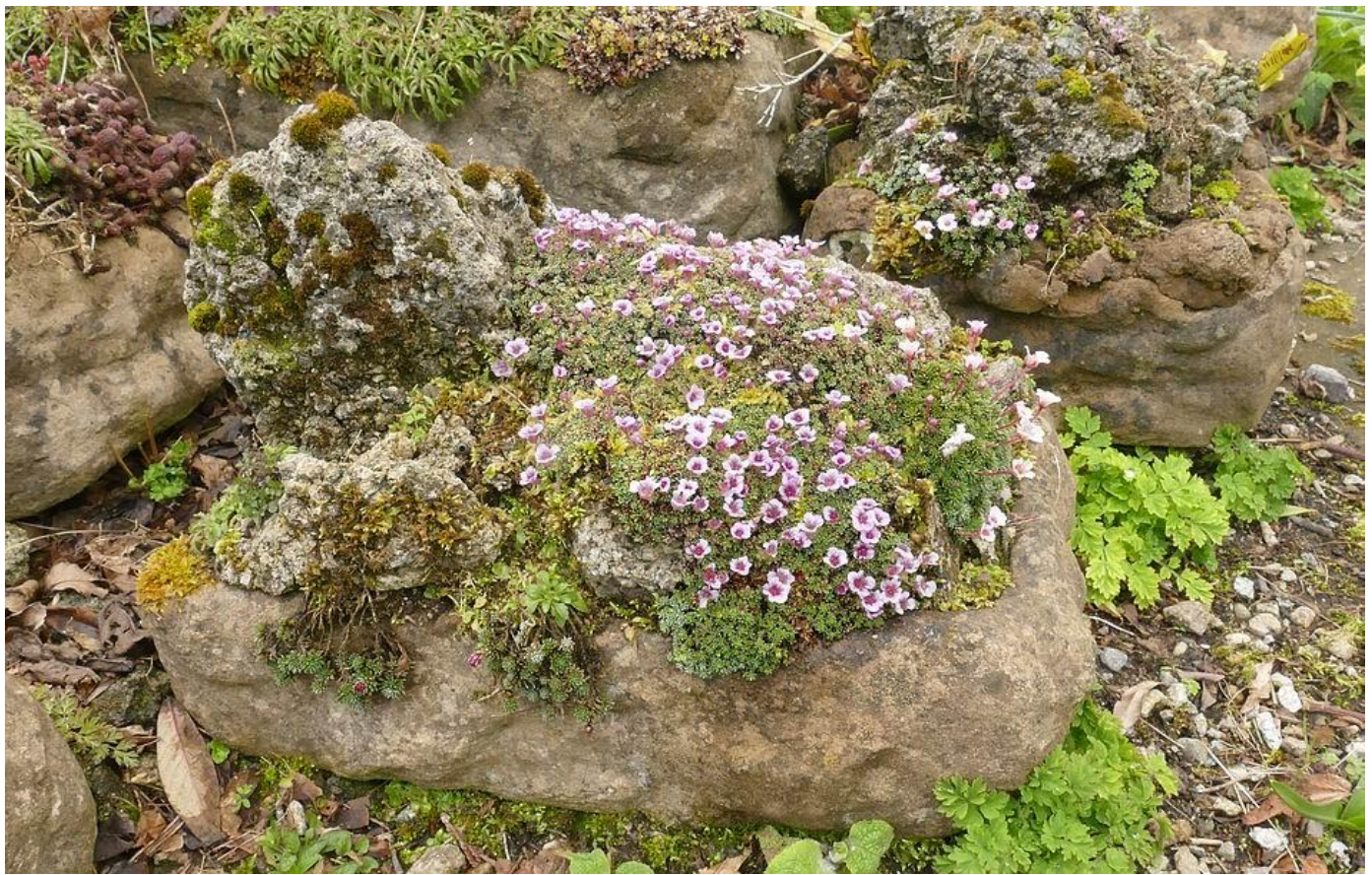
One saxifrage is doing especially well in this rocky landscaped trough.