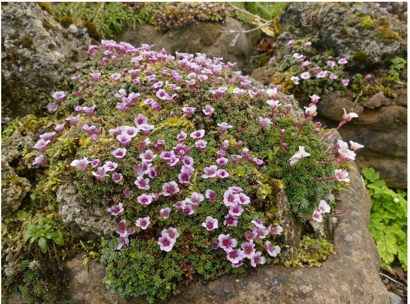
All the saxifrages here were planted at the same time but with very different results the main plant has spread out well surrounding a second clone which can be seen to the right while others are struggling to survive. The position and orientation of the trough can make a big difference to the fortune of the plants.