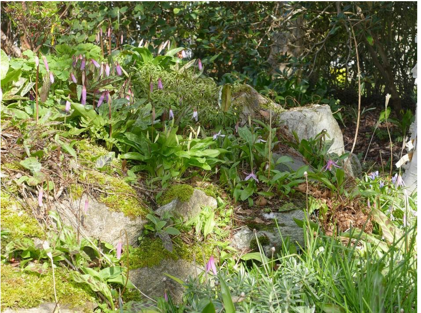
Erythronium are self-seeding and growing in the crevices of this rock wall.