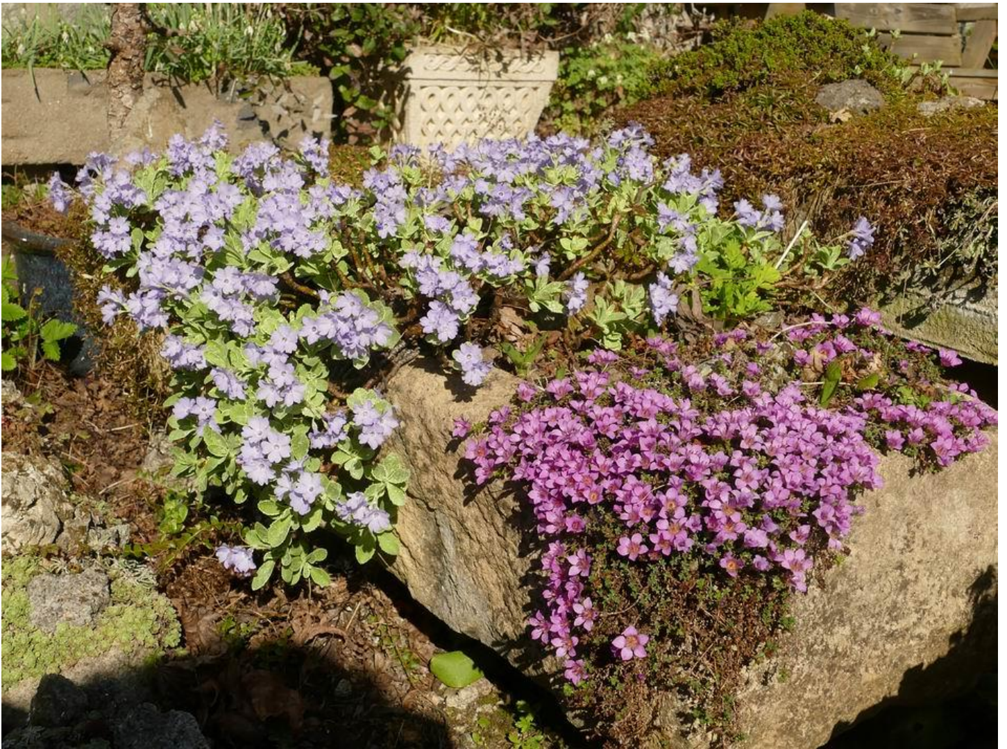
Primula marginata and Saxifraga oppositifolia 'Theoden' have been growing in this trough for over thirty years surviving in the very gritty free draining soil.