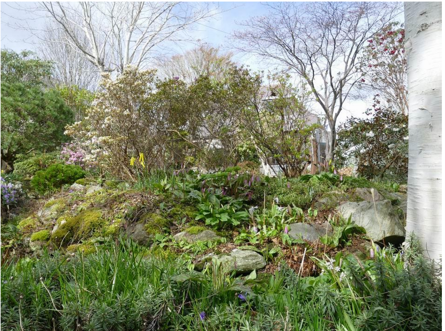
Erythronium may not spring to mind when you are planting a crevice garden but again I was guided by nature when some seed fell into one of the gaps in the wall. I added a helping hand scattering seed into more cracks and now we have some self-seeding colonies of erythroniums growing in the walls as well as above and below them.