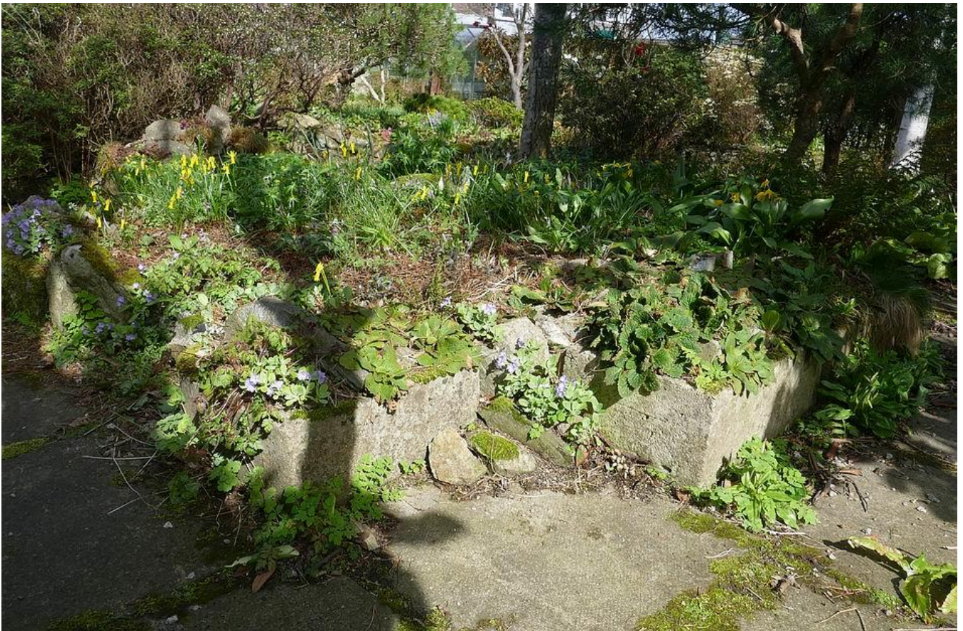
A number of troughs are positioned to form some of the edges of this raised bed.