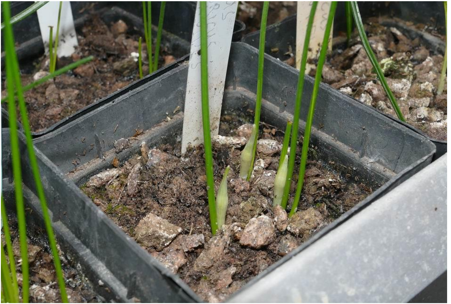
This small pot of Narcissus cantabricus petunioides shows that these flowering bulbs have just a single leaf, the flower stem will also act in a similar way to a leaf and feed the bulb as well as supporting the flower.