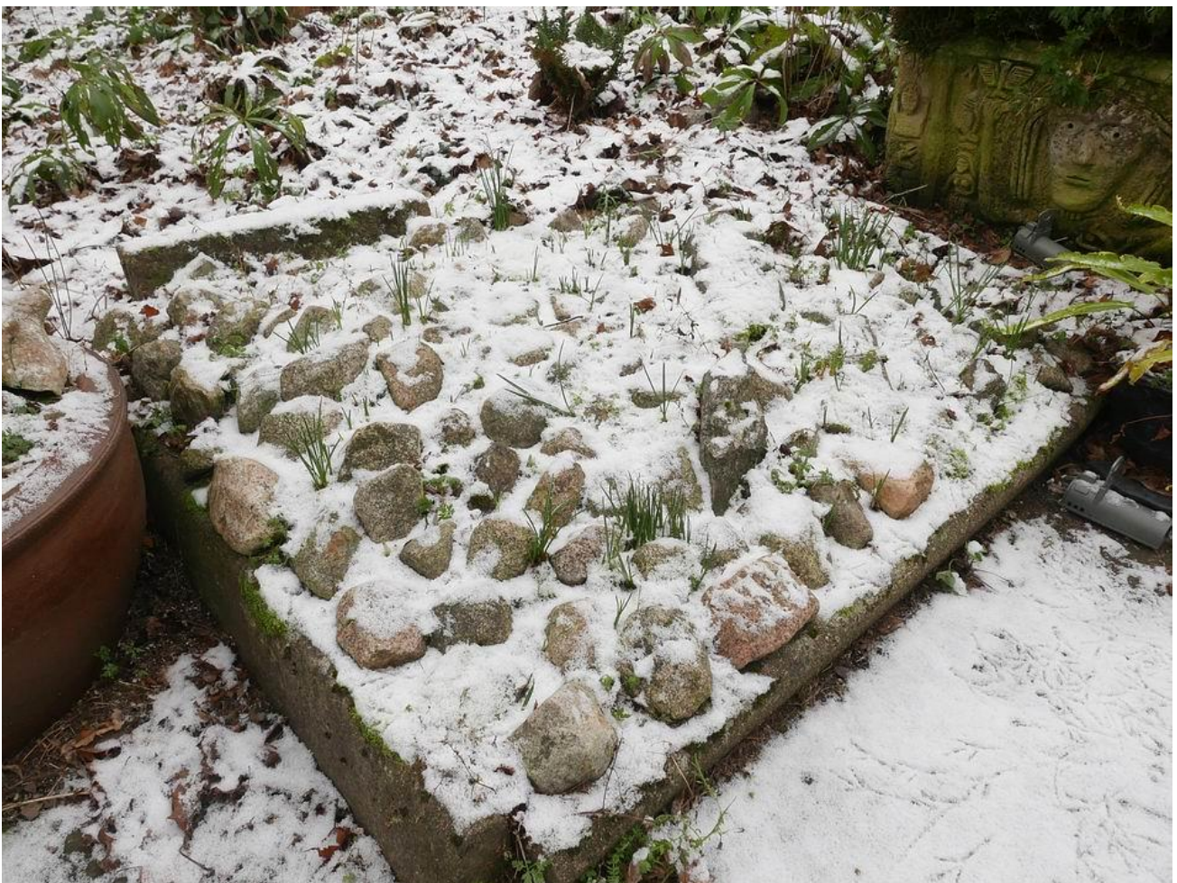
The cobble bed under a thin covering of snow is one of a number of beds that will feature more in the months to come.