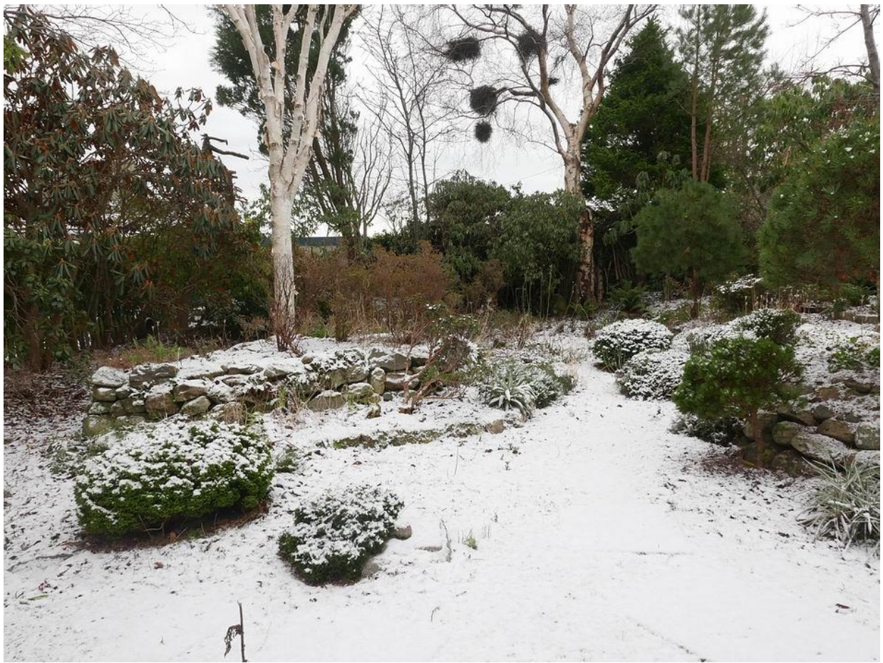
Even a light covering of snow makes the hard landscaping and evergreens in a garden stand out.