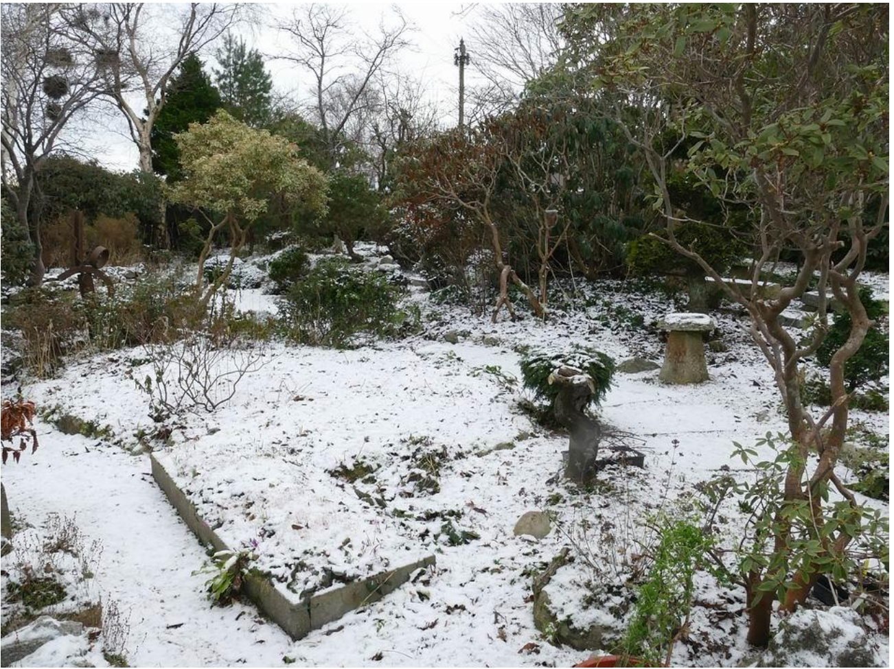
A cold coloured scene looking across one bed that will provide the earliest colour - it is fascinating to think of all the bulbs in the ground just waiting for their turn to burst into flower and growth.