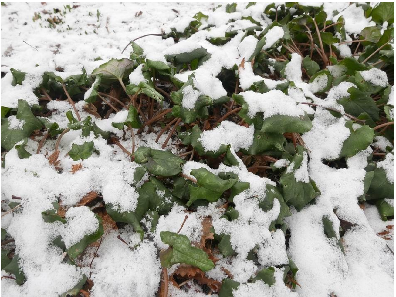
This is a silver leaved form of Cyclamen hederifolium but the silver is hidden when it is frozen.