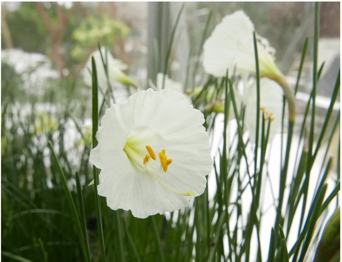
Narcissus 'Craigton Chorister'