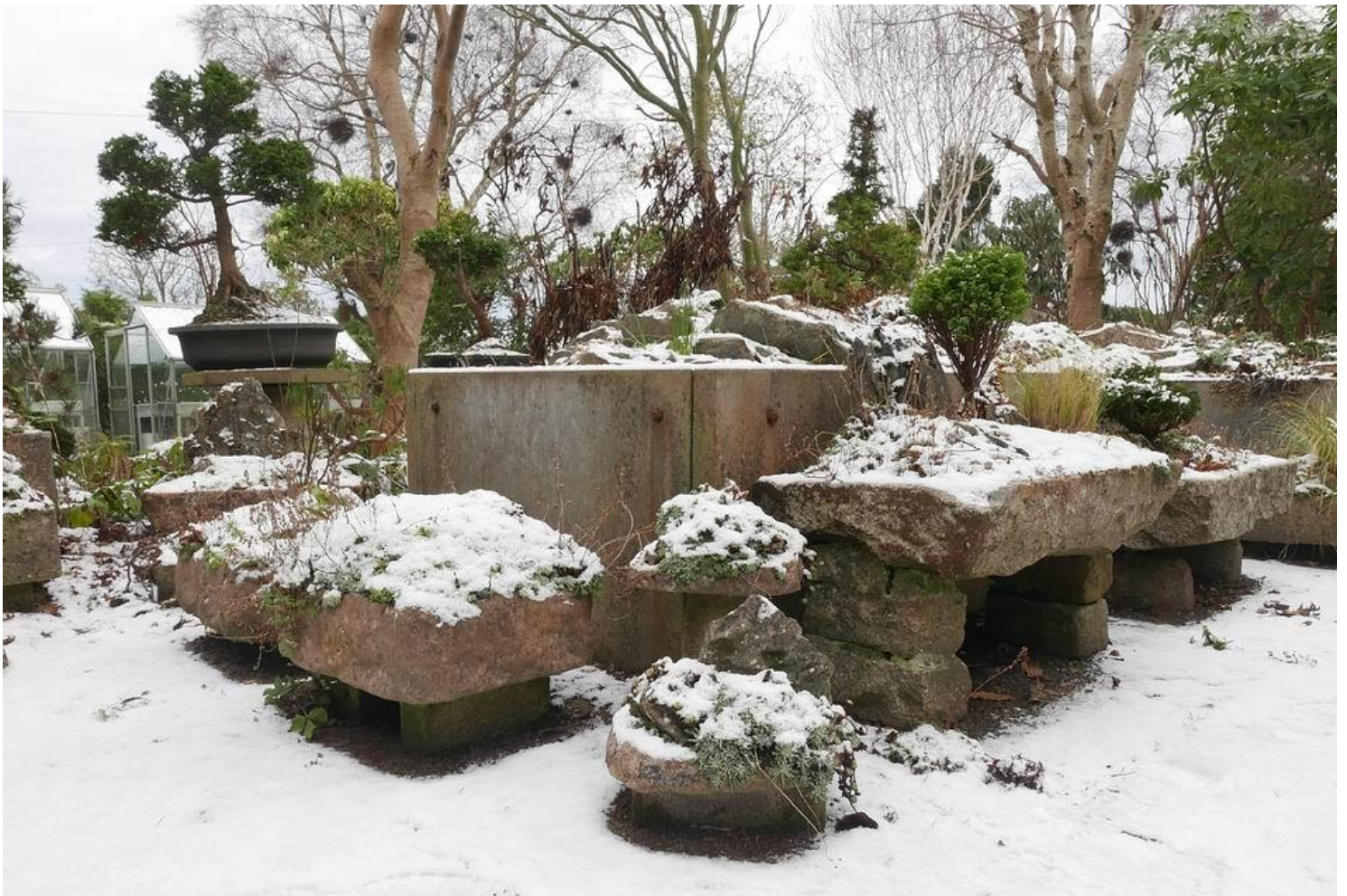
Making, landscaping, planting and maintaining troughs is the topic for my next Zoom lecture and I have been enjoying going through all the trough pictures I have taken over many years.