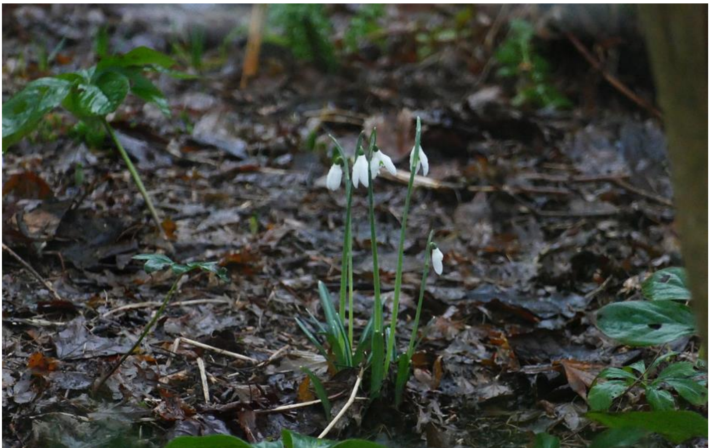
This is always the first Snowdrop to flower for us.