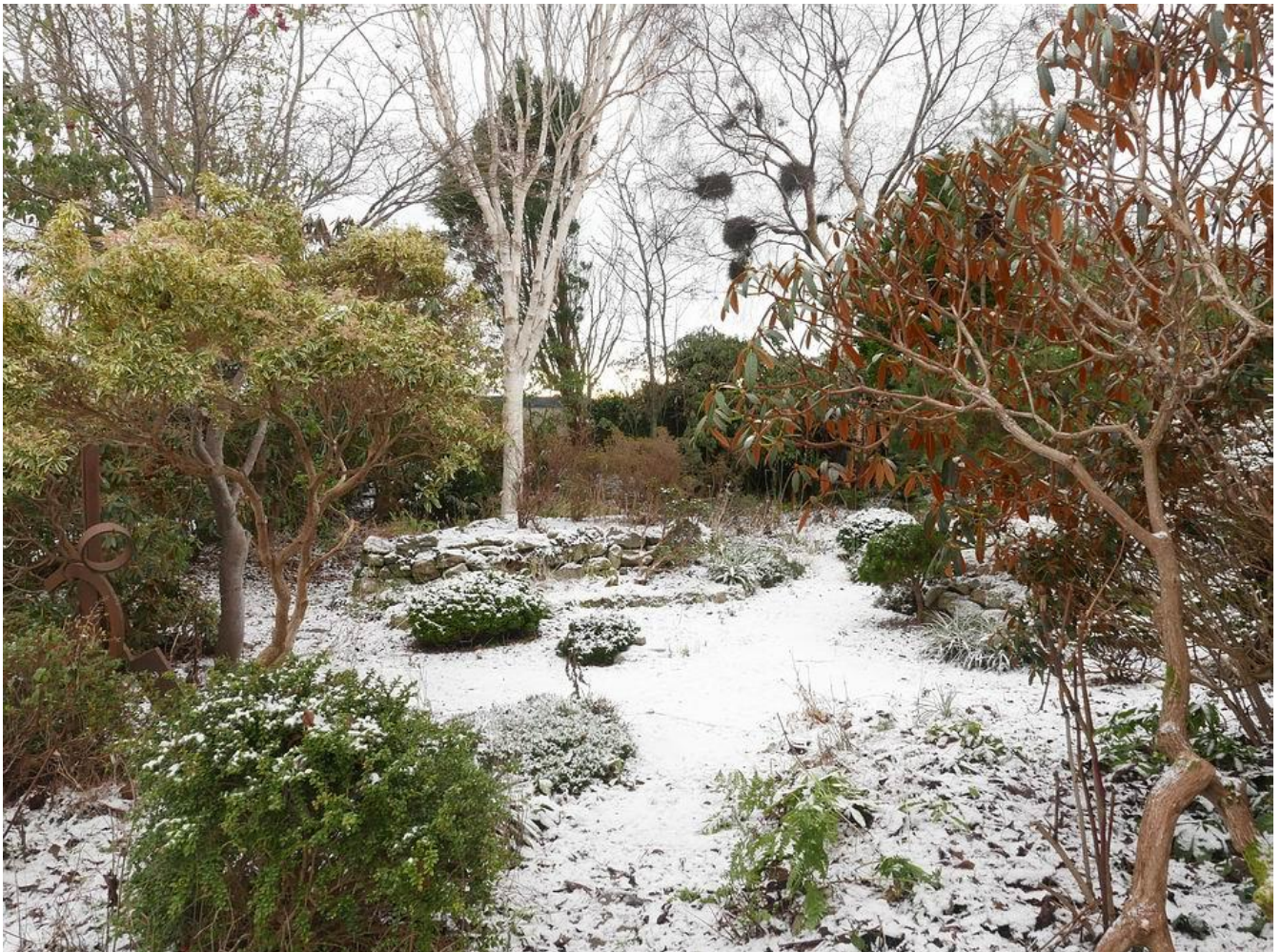
The Pieris and Rhododendron bring some warm colours to another cold scene.