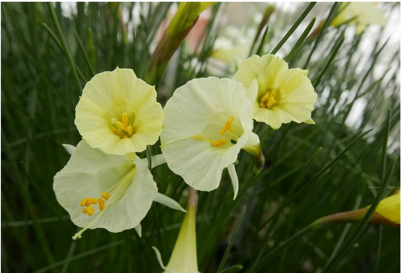
Group of Narcissus seedlings growing in the sand bed.

subjects that are occupying me. We have been in isolation since last March when Covid struck and all my travel and lectures were cancelled and now many are back in lockdown that will last well into the year when the roll out of the vaccines offers some protection. The cover picture shows the Narcissus flowering in the bulb houses which I do check every day whatever the weather but the cold and very low light levels make it difficult to get pictures of the quality that I desire. I am also revising my talk on Troughs, which are also shown on the cover, for a Zoom presentation that I am giving early next month. I have given a number of Zoom talks since lock down and while it is not the same as being in front of an audience it is a good way to sustain our interests until it is safe for us to travel.