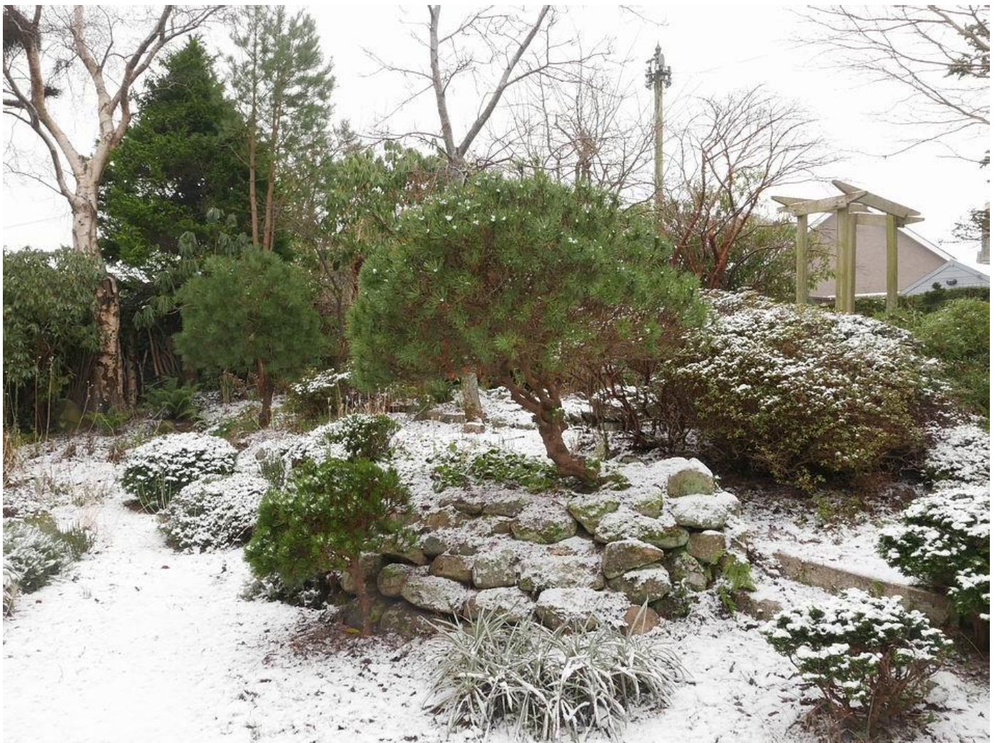
On the raised wall the small pines make a big statement especially at this time of year when there are few other subjects to distract your eye.