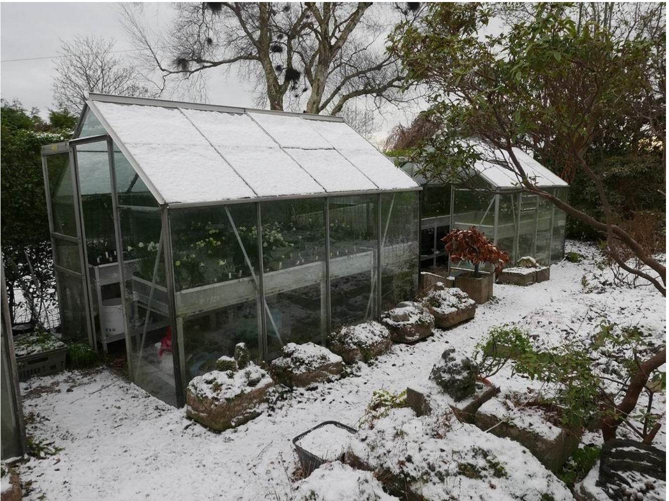
When I venture out to check on the bulb houses I usually take the long way back around the garden.