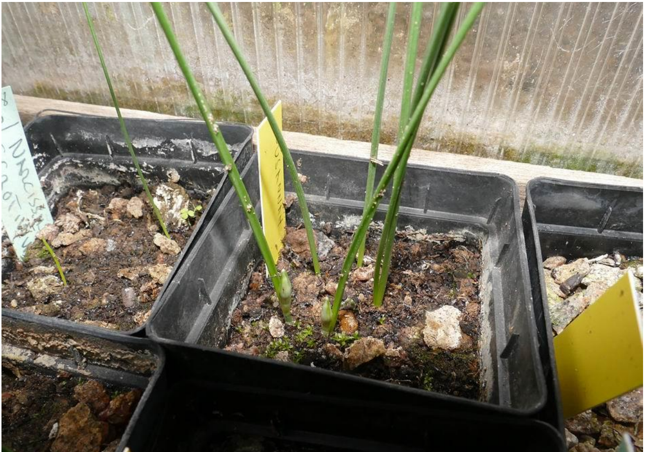
A pot of my own hybrid cross of Narcissus x Susannah - a naturally occurring hybrid between Narcissus triandrus and Narcissus cantabricus , note these flowering bulbs also have but a single leaf – inherited from its pollen parent.