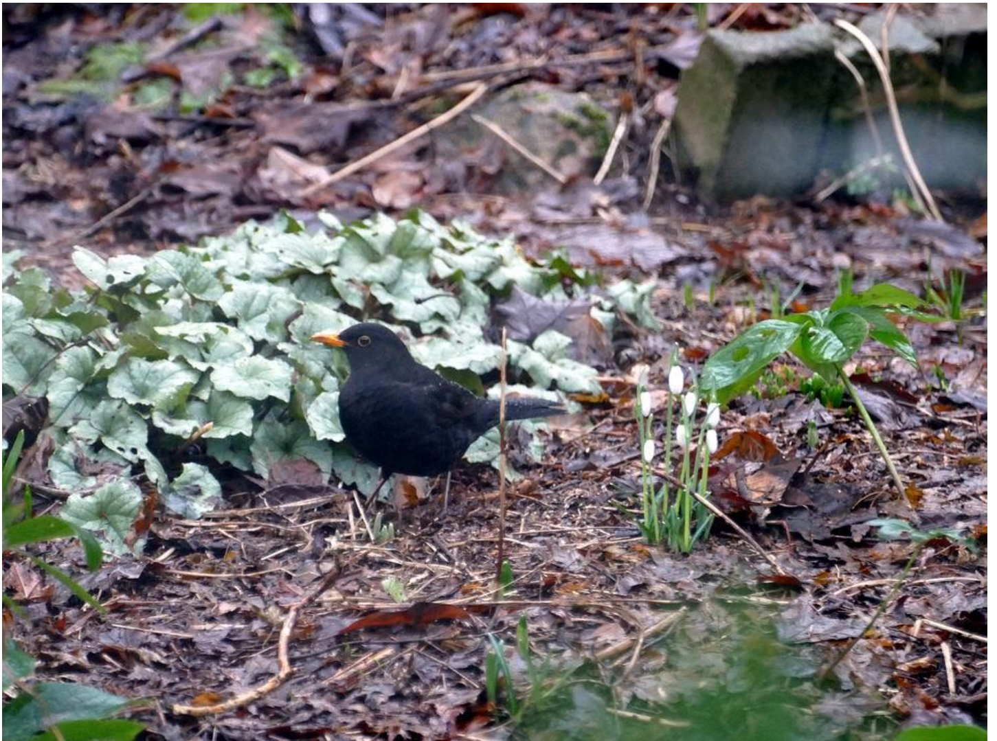
Cyclamen, Blackbird and Galanthus pictured through the window.