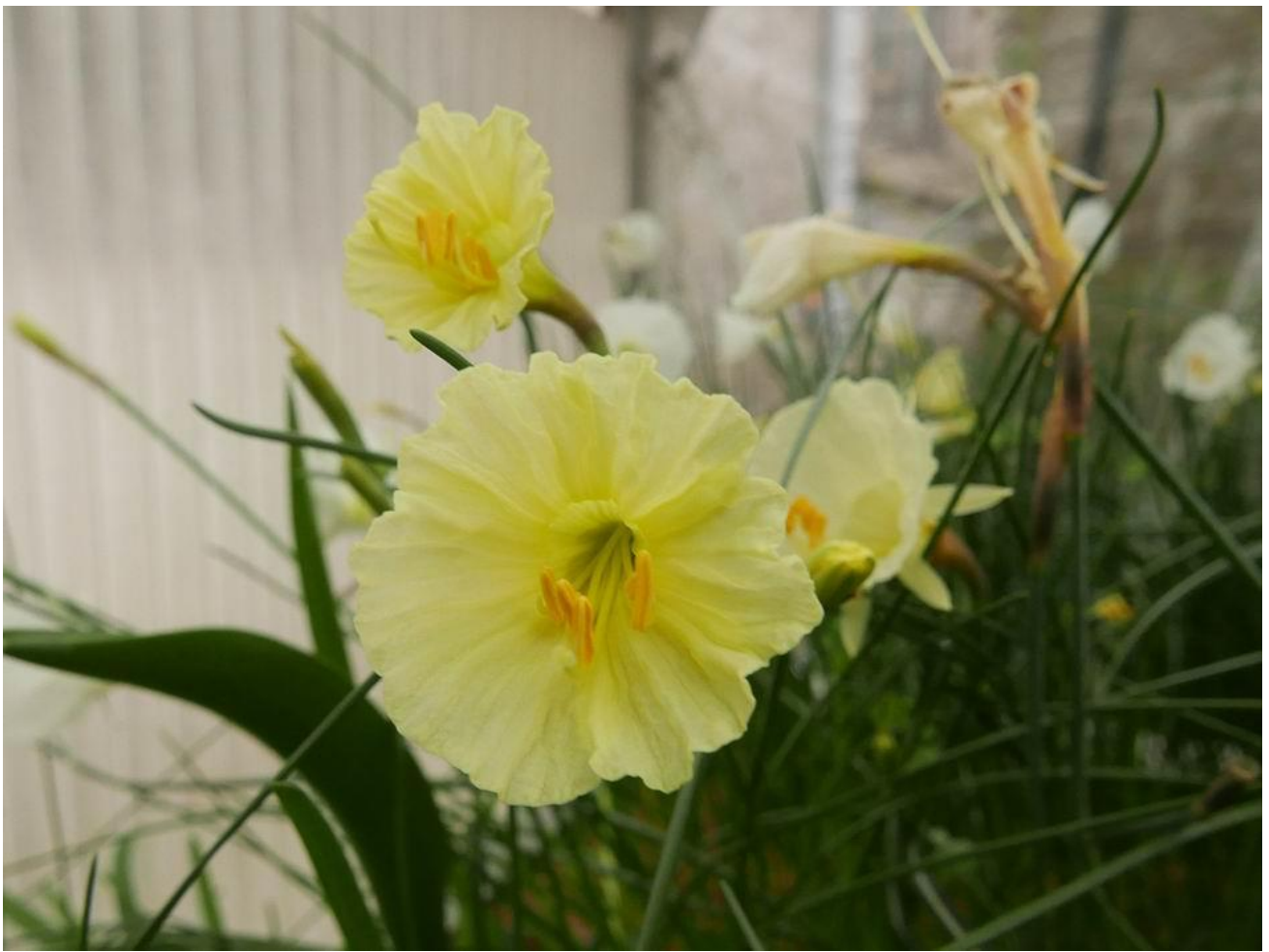
I like the flowers with a crenulated corona such as this nice yellow seedling.