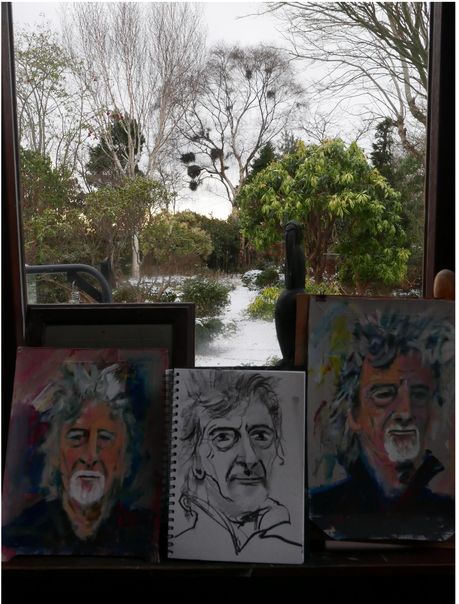
I round off for this week with the view from where I sit to read, write, draw and watch the birds.....