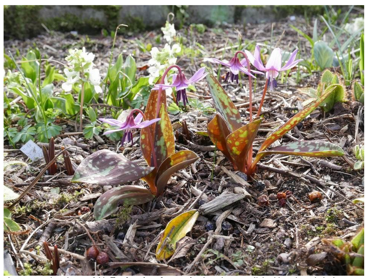
I had to post another picture of this Erythronium dens-canis where the strong light shines through the leaves highlighting the contrasting pattern of colours.