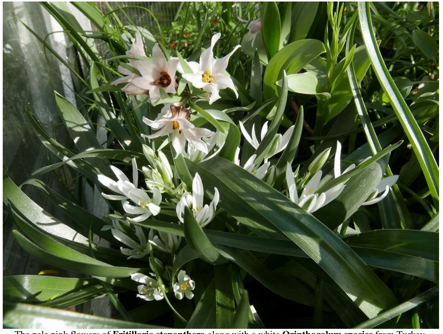
The pale pink flowers of Fritillaria stenanthera along with a white Orinthogalum species from Turkey.