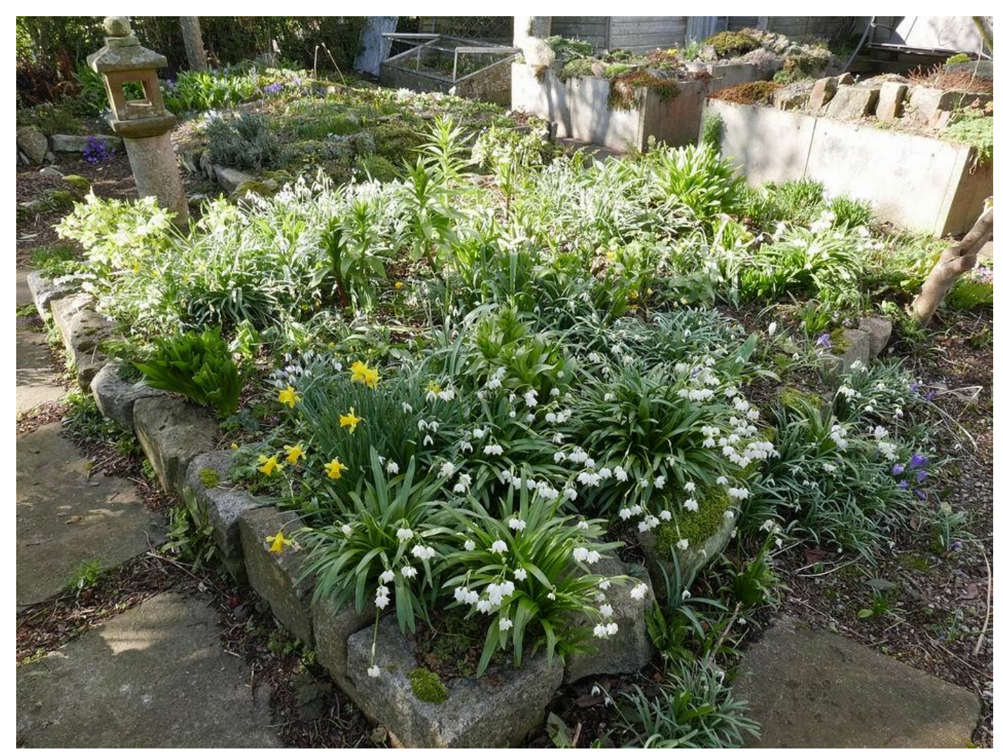
The first of the Galanthus flowers in the bulb bed are now going over but the white is being replaced by the Leucojum flowers which as they open that bit later will last for a while longer.