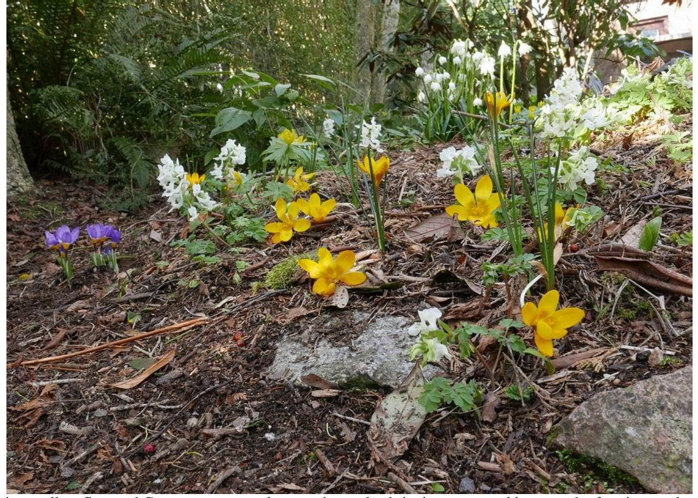
Various yellow flowered Crocus are scattered across the garden bringing a seasonal harmony by forming a colour link across the various different beds.