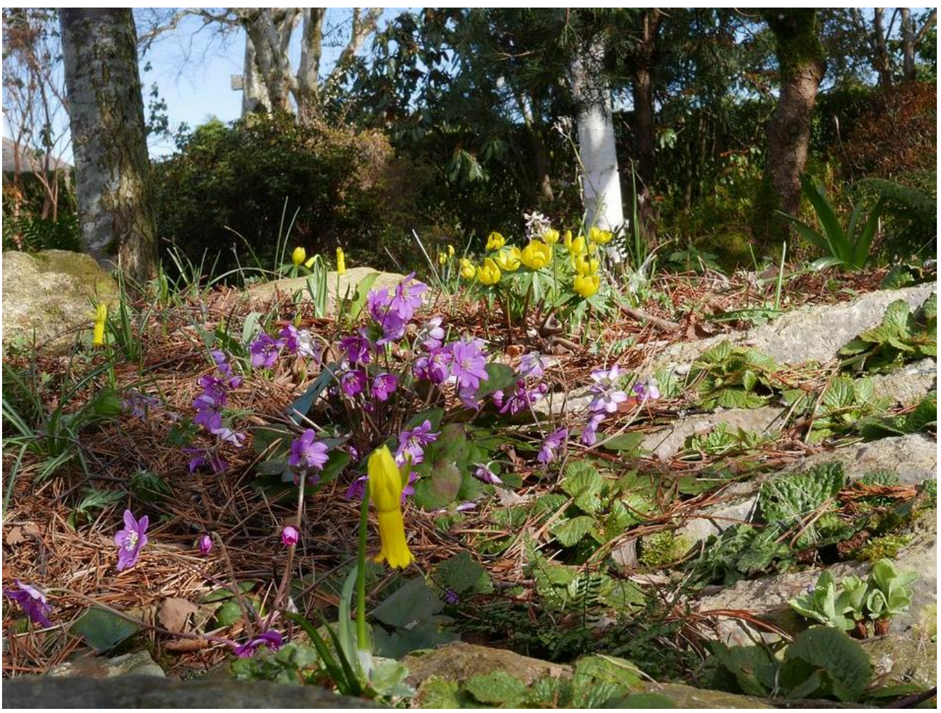
Two views showing how the early colour is developing in the new bed by the pond with Narcissus cyclamineus, Hepatica nobilis, Eranthis 'Guinea Gold' with Erythronium caucasicum in the wider view below.