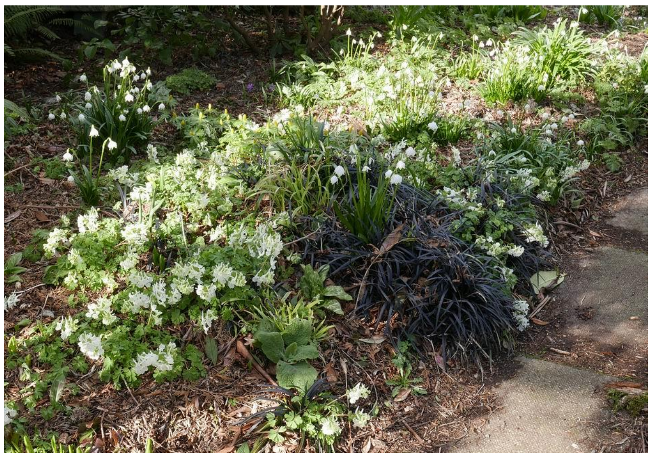
Similarily I encourage waves of creamy white coloured Corydalis malkensis to flow around the garden by scattering the seed when it ripens in May, just before the whole plant disappears back underground until next year leaving the space for other plants to also thrive.