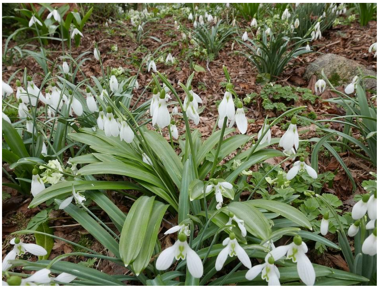
Galanthus 'Craigton Twin' is a Galanthus plicatus hybrid the largest bulbs of which regularly have two flowers per stem while the stems of the smaller bulbs have the more normal single flower.