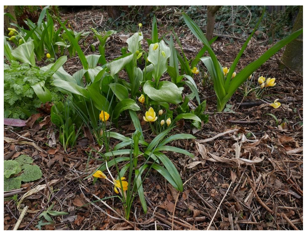
Here more yellow Crocus continue the pattern this time being joined by the yellow buds showing colour on Erythronium tuolumnense.