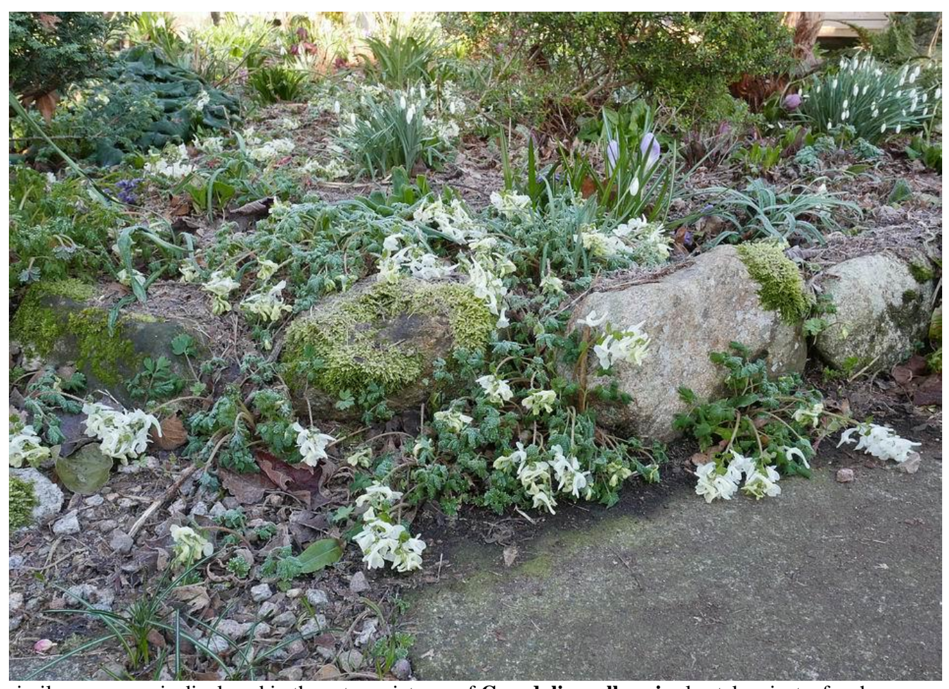
A similar sequence is displayed in these two pictures of Corydalis malkensis also taken just a few hours apart.