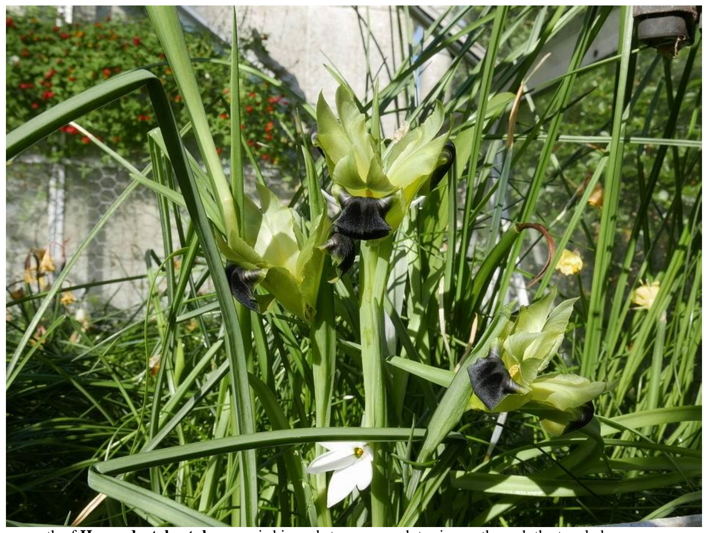
The growth of Hermodactylus tuberosus is big and strong enough to rise up through the tangled green mass.