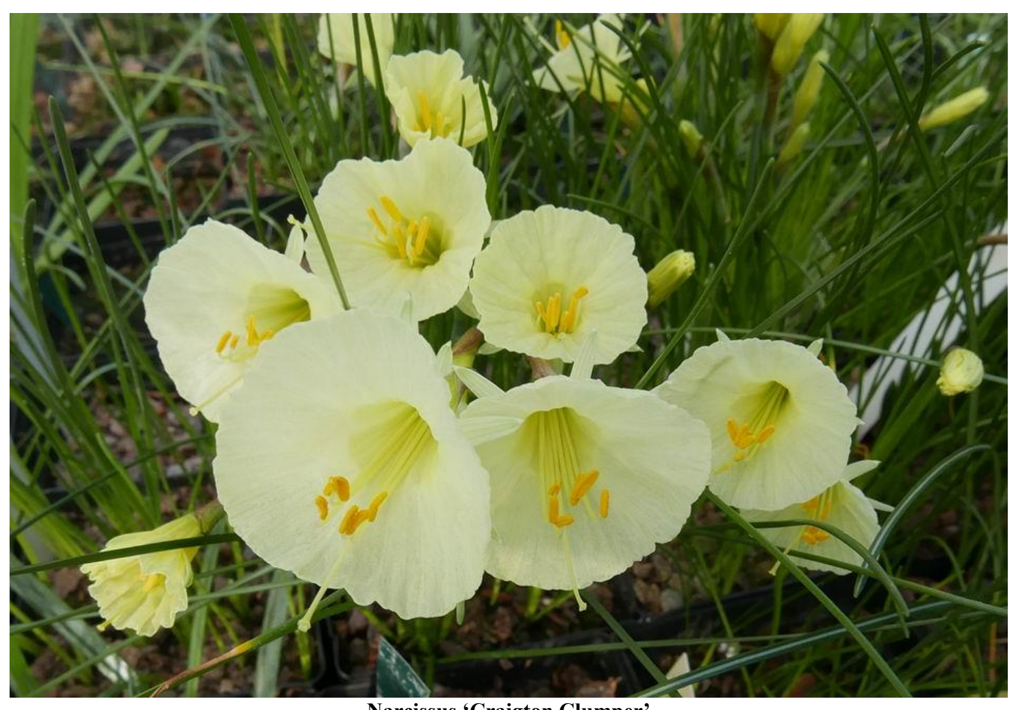
Narcissus 'Craigton Clumper' I selected and named 'Craigton Clumper' from a group of Nacissus romieuxii seedlings because of the remarkable speed at which the bulbs increased.