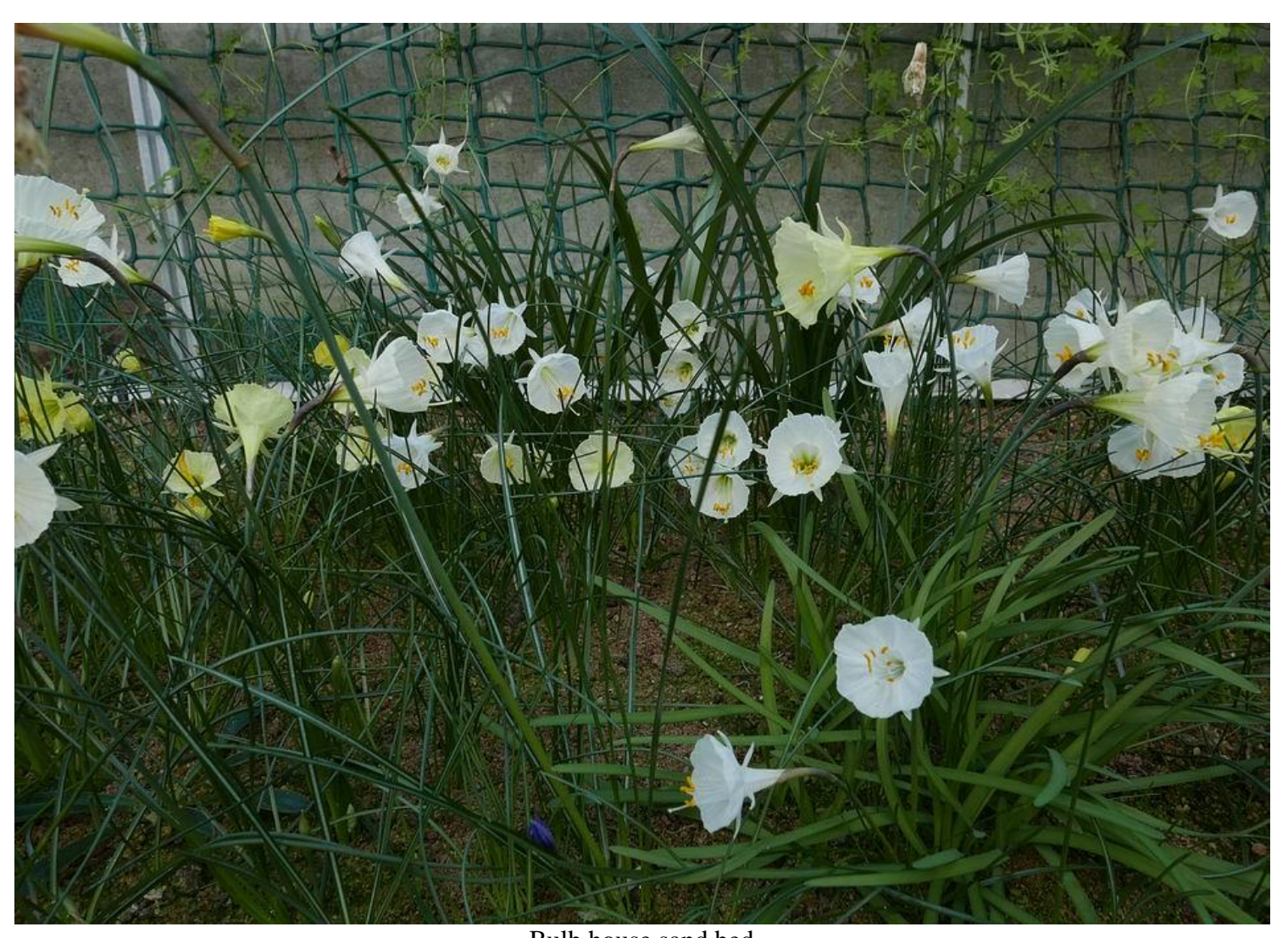
Bulb house sand bed.