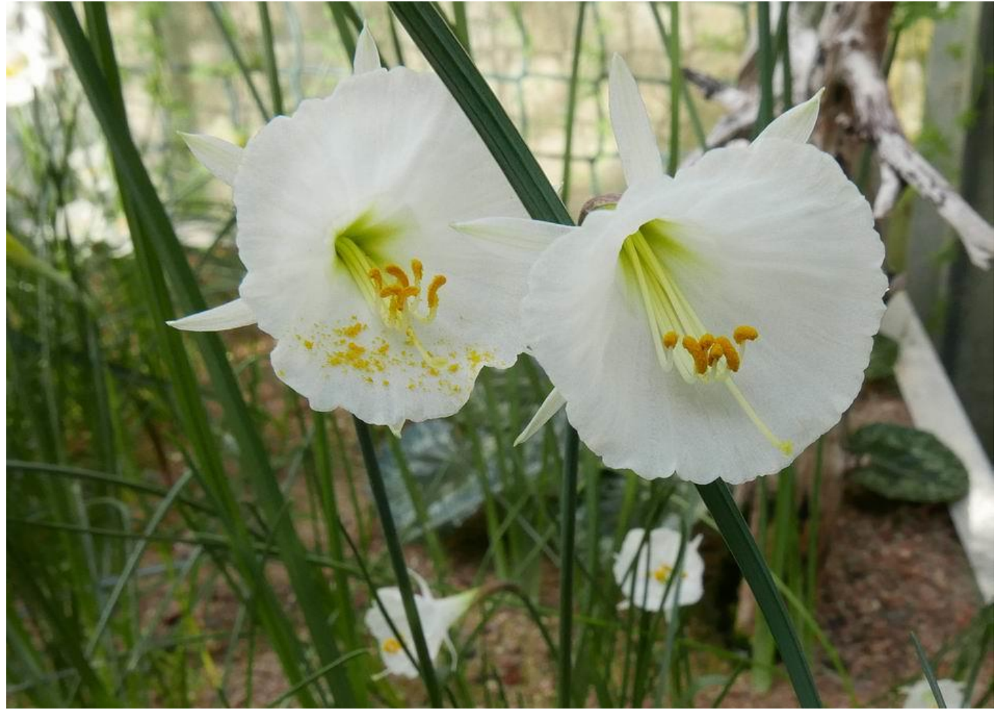
Because there are no flying insects at this time of year it is up to me to transfer the pollen on to the stigma when it is ripe.