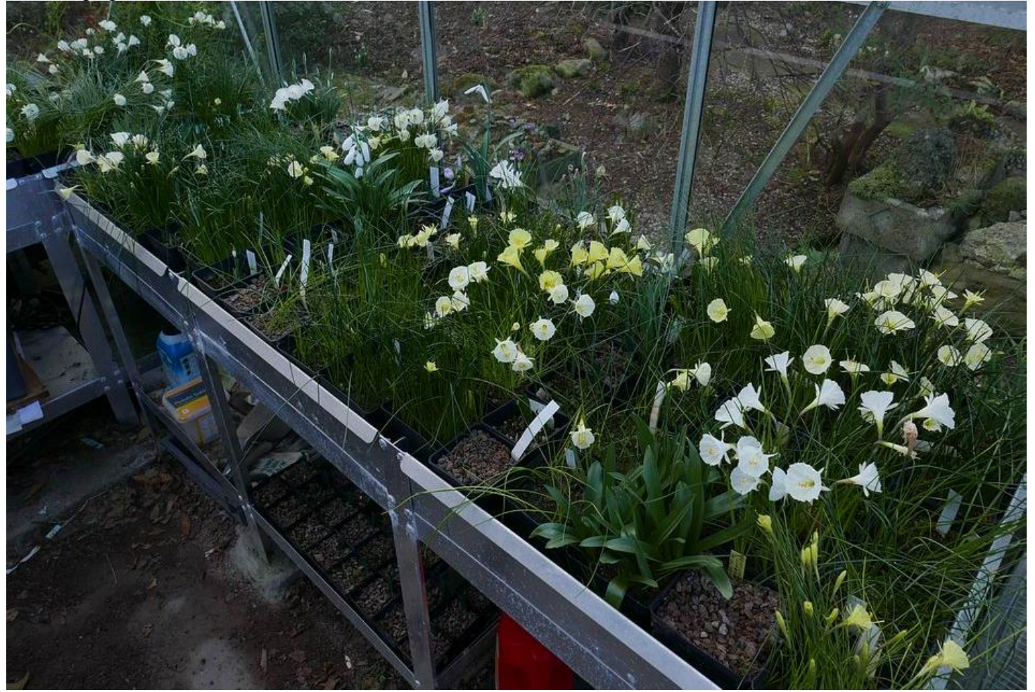
This weekend we were frost free so I was out with my watering cans, as our outside water is still turned off, watering the pots showing growth, I am doing this on average every second week when the weather is not freezing or there is excessive damp in the air. I add about quarter to half strength tomato-type liquid plant food to each watering can.