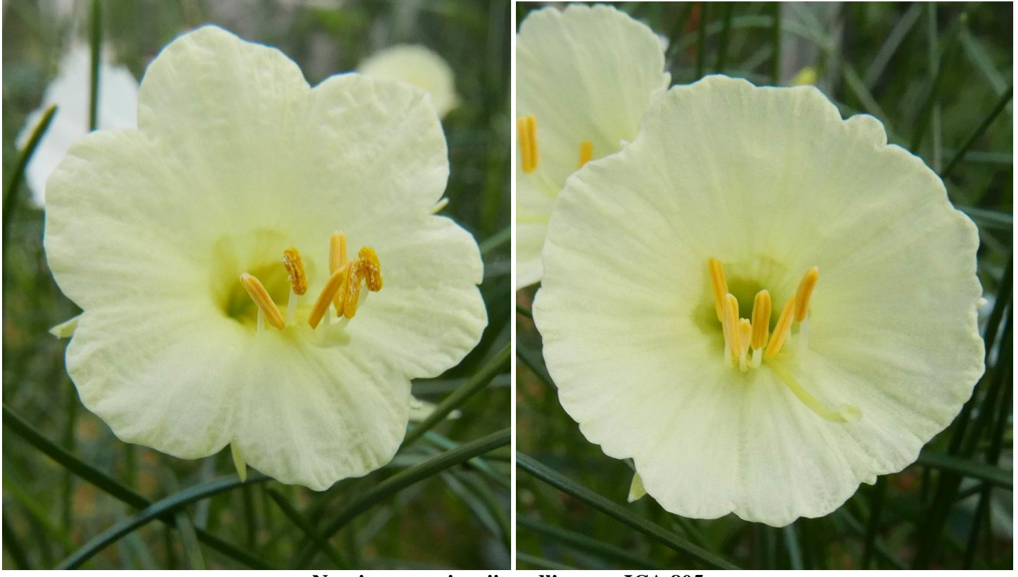
Narcissus romieuxii seedlings ex JCA 805