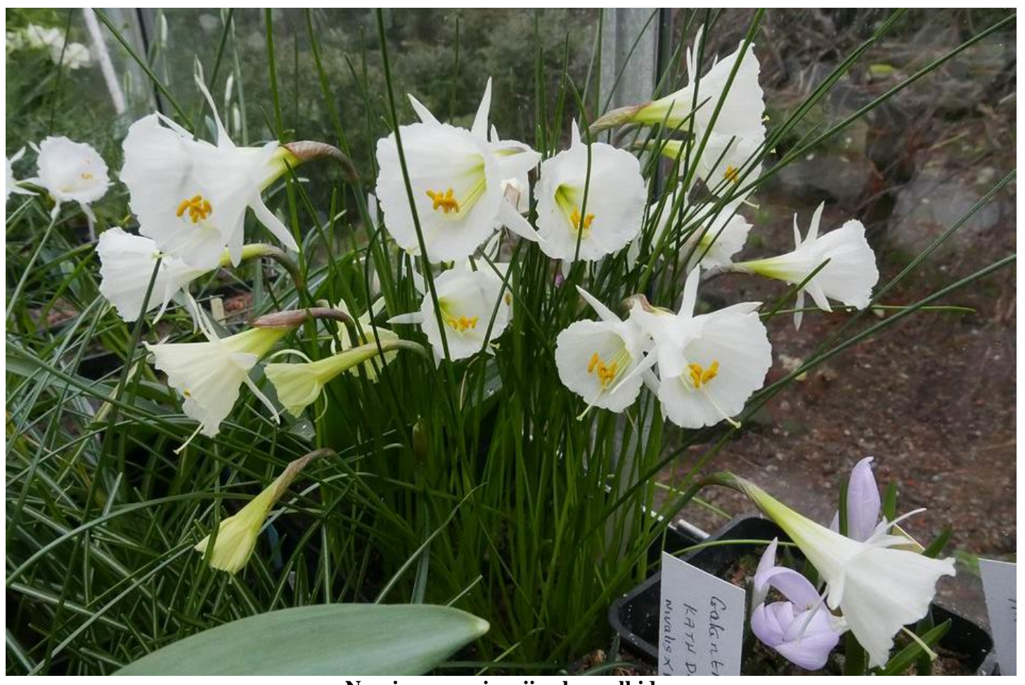
Narcissus romieuxii subsp. albidus