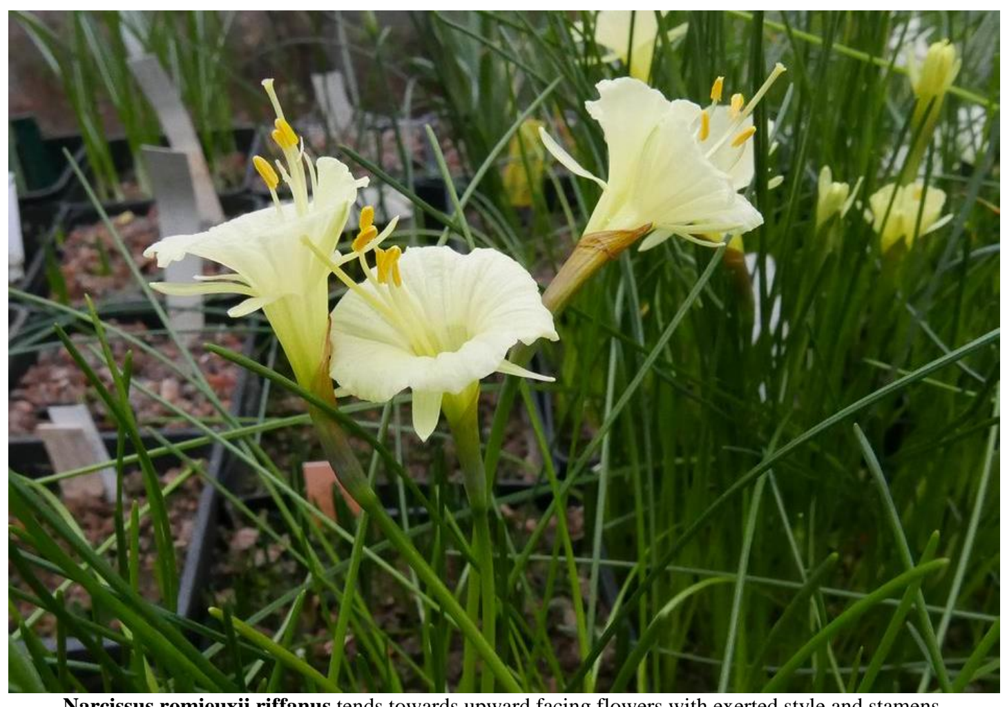
Narcissus romieuxii riffanus tends towards upward facing flowers with exerted style and stamens.