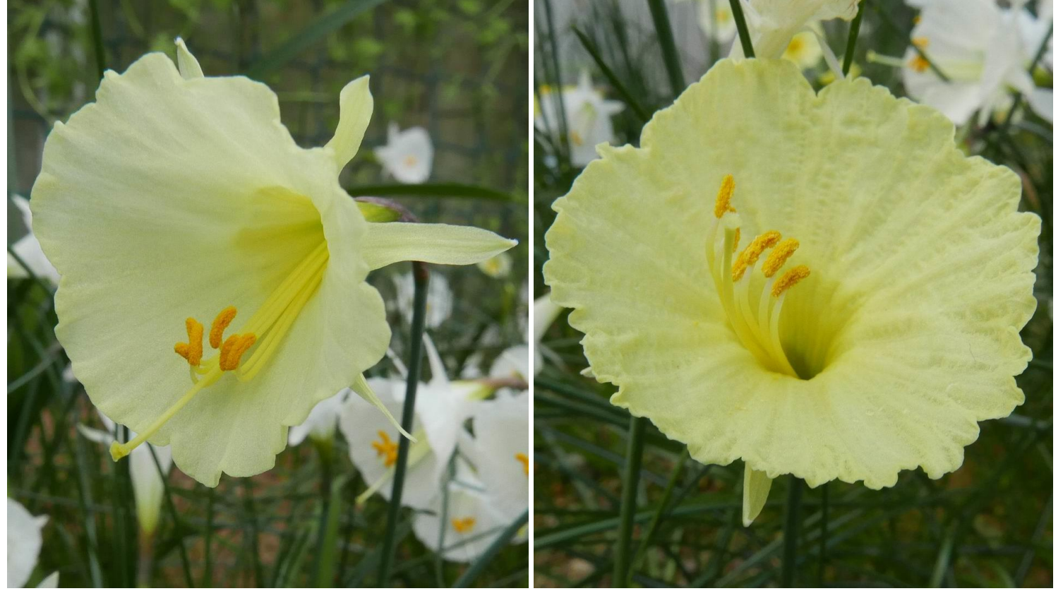
Narcissus bulbocodium hybrid