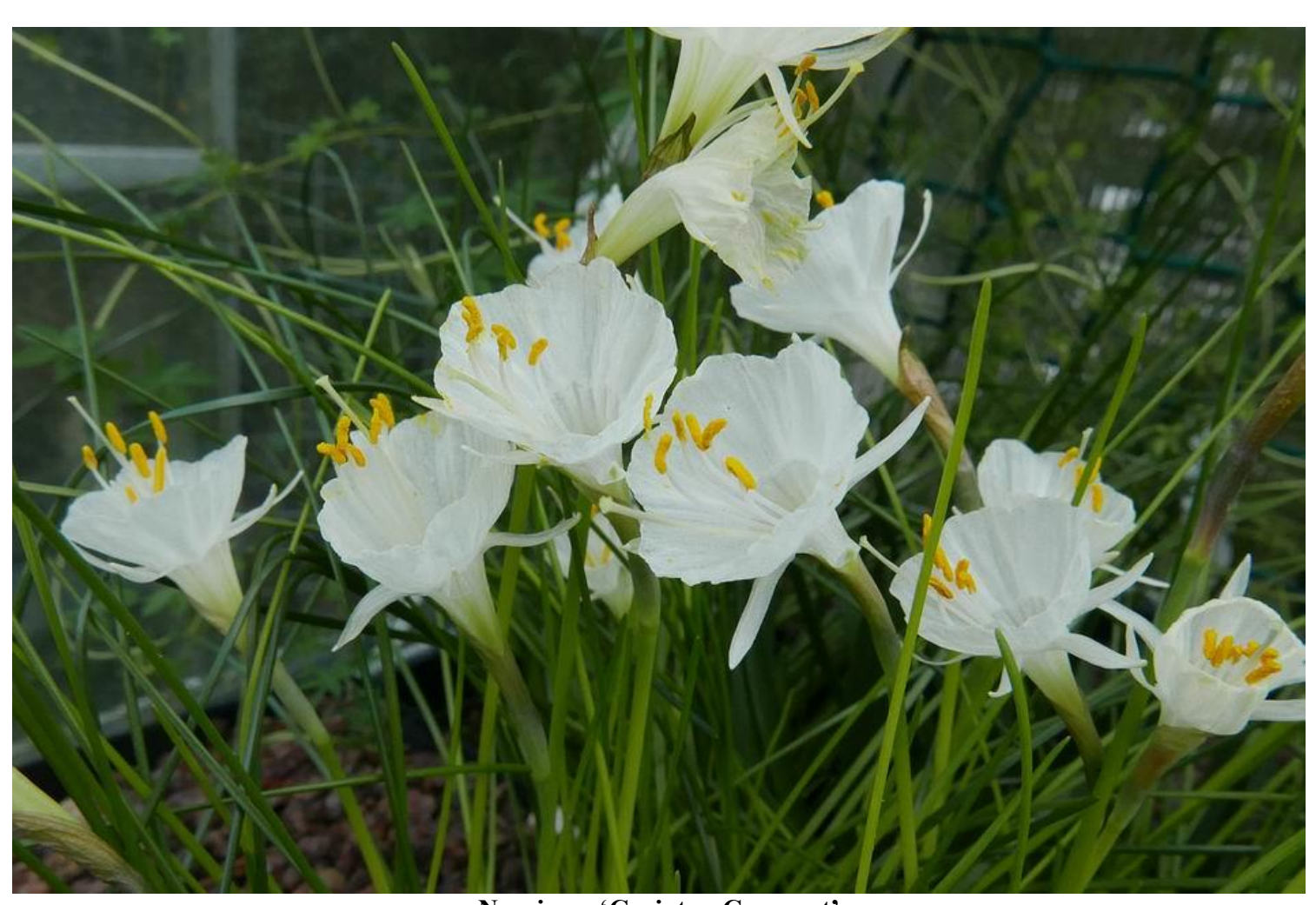
Narcissus 'Craigton Compact'

Narcissus 'Craigton Compact' I have decided that I will name this short stemmed hybrid Narcissus 'Craigton Compact' and will send some bulbs to a few friends in the summer for them to trial.