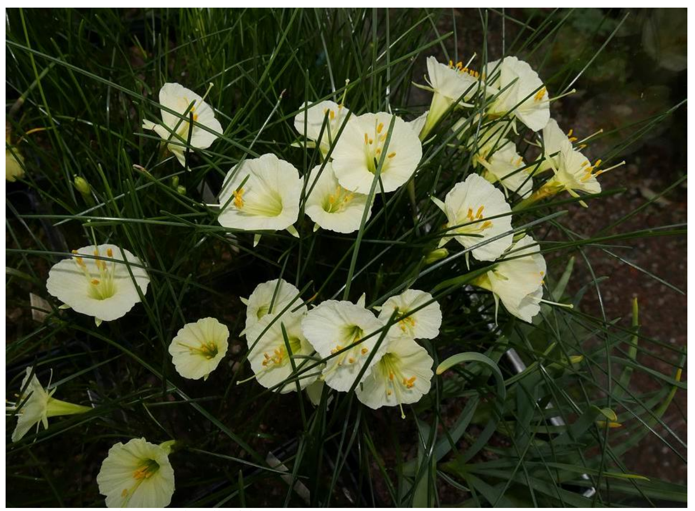
This is my pot of Narcissus romieuxii JCA 805 which was raised from that original introduction – we received some bulbs from the late Harold Esselmont and have kept them going by the bulbs ever since. I would speculate that the good number of Narcissus romieuxii forms and hybrids that we all grow are related to the JCA805 introduction. The JCA 805 collection had a wide genetic variation – some of the forms raised from the original seed were less tolerant of cultivation and dwindled those that were more adaptable are the ones that persist to this day. Subsequent seed raised bulbs from the original and subsequent sowings also display a wide variation especially if hybridised.