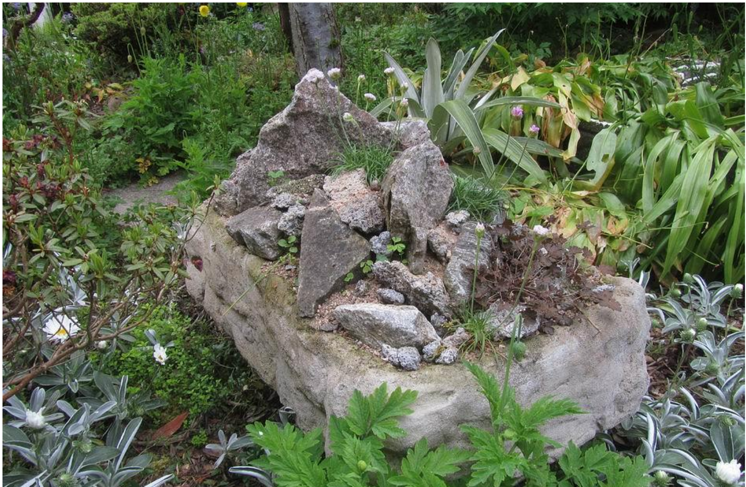
Another view shows the high landscaping made from a mixture of limestone and broken concrete – the planting medium is sharp sand.