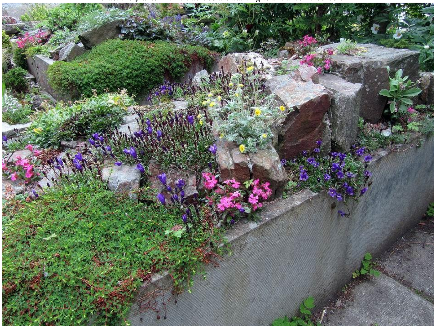
All raised from seed - Edrianthus serpyllifolius , Potentilla pulvinaris and Silene caroliniana 'Red Wherry'.