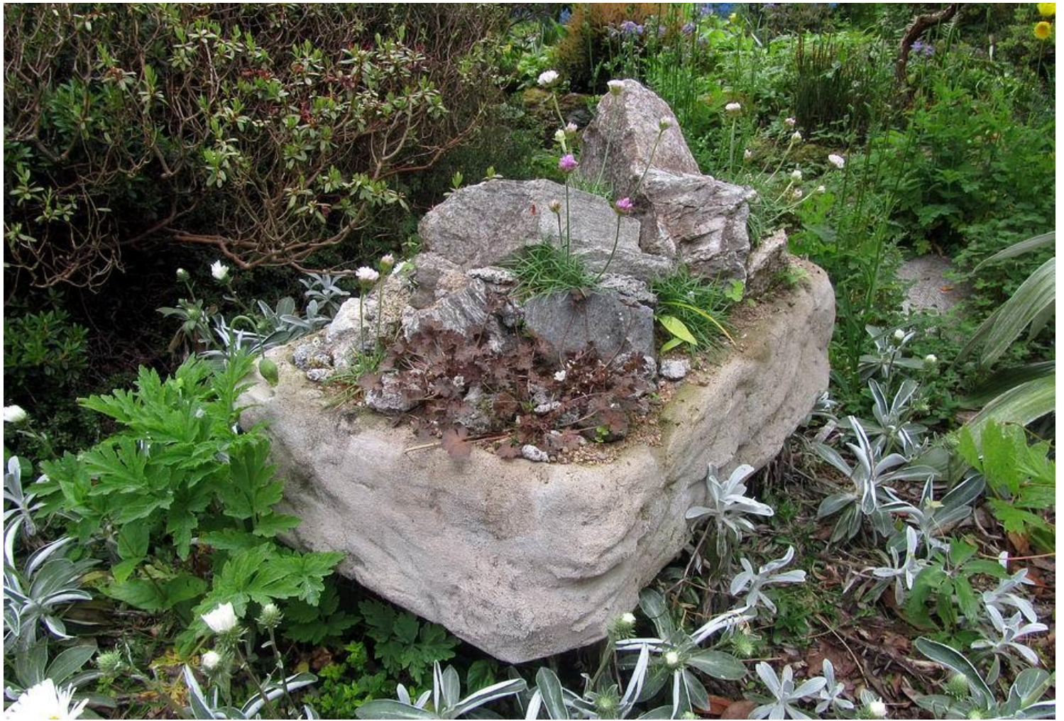
I made this trough last year and have planted it up over the autumn and spring with Armeria maritima cuttings collected from the seaside and Geranium sessiliflorum Bronze raised from New Zealand seed sown in 2014.