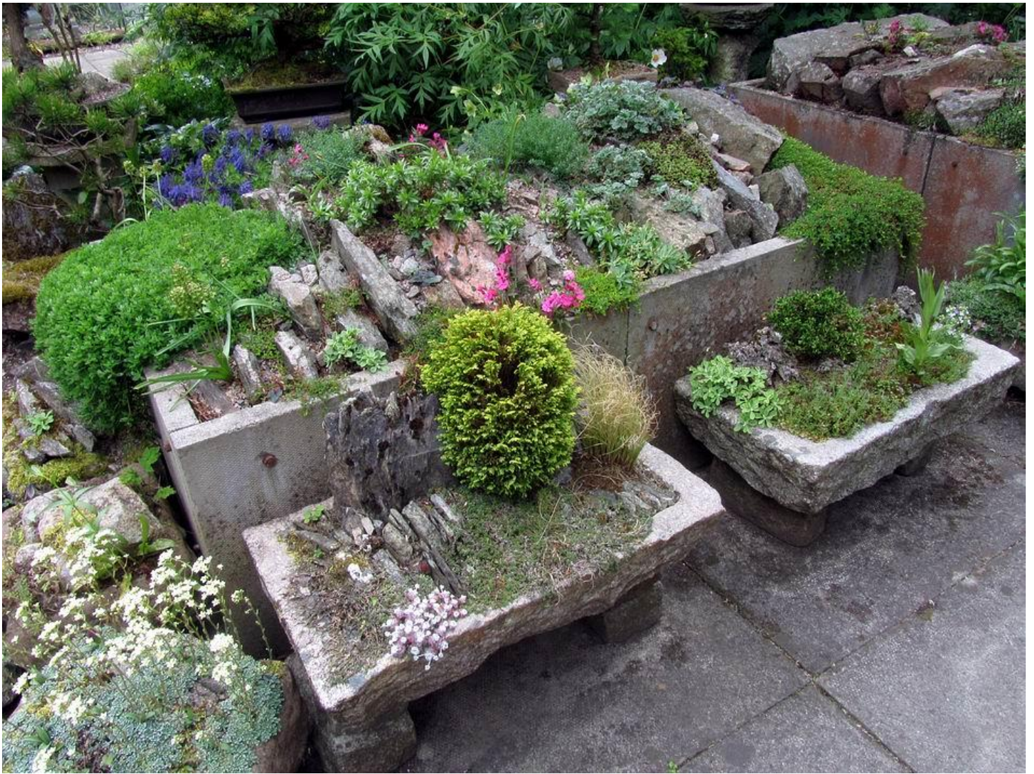
More troughs surround the North Eastern slab bed – the two in the foreground are cut from granite.