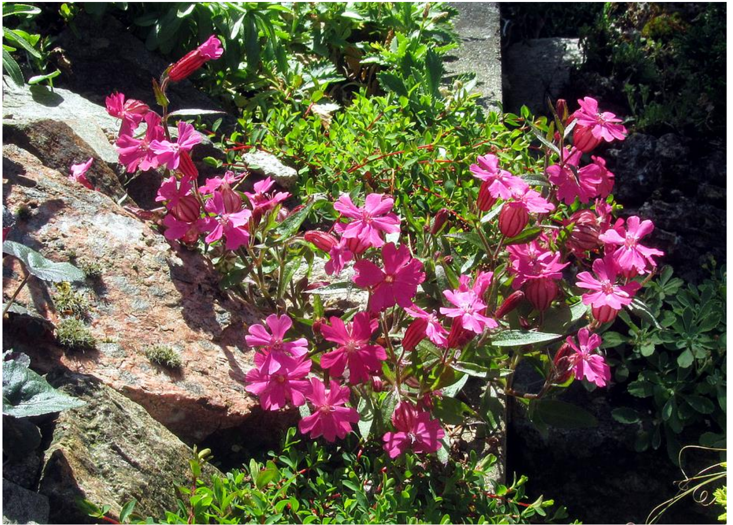
Silene caroliniana 'Red Wherry' in the sun above and in shade below – we received seeds of this from a friend in Ireland a couple of years ago, this spring the seedlings were big enough to be planted out in situ so we now have a number of plants adding their splash of pink.