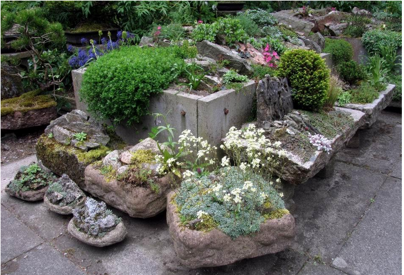
Another view – note the trough in the foreground with the saxifrage flowers.