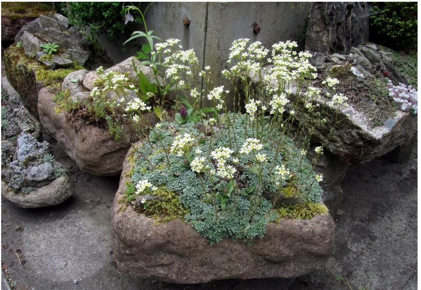
This trough was planted with a single form of Saxifraga and over the years other plants have tried to move in – most I considered to be weeds and have removed but careful observation will show some very welcome self-seeders.