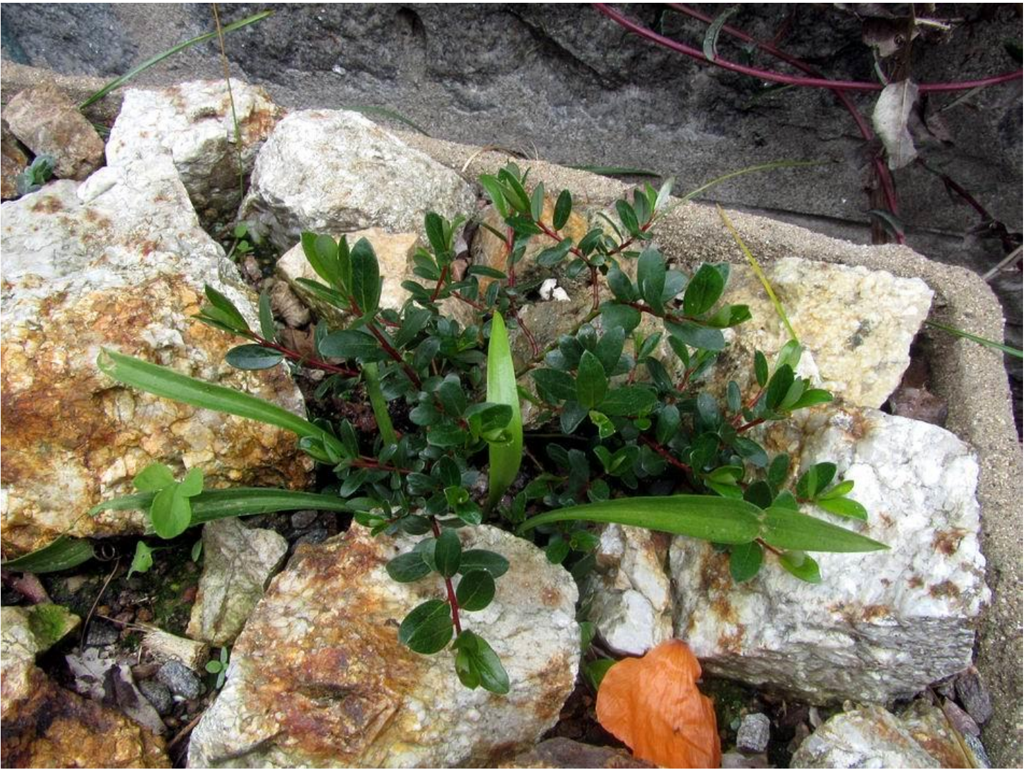
Salix retusa (I think)