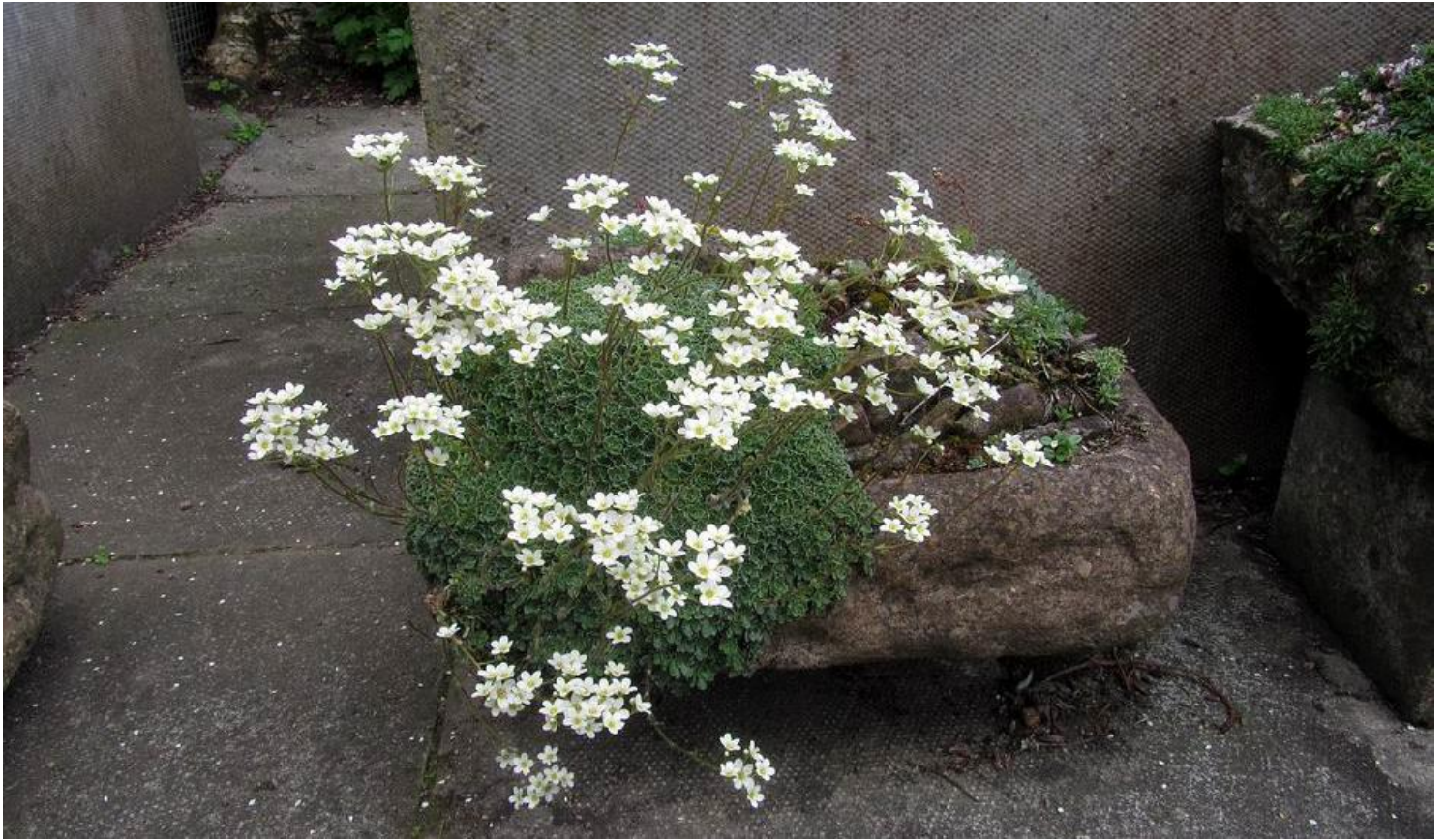
This silver saxifrage likes climbing out of the trough and down the side.