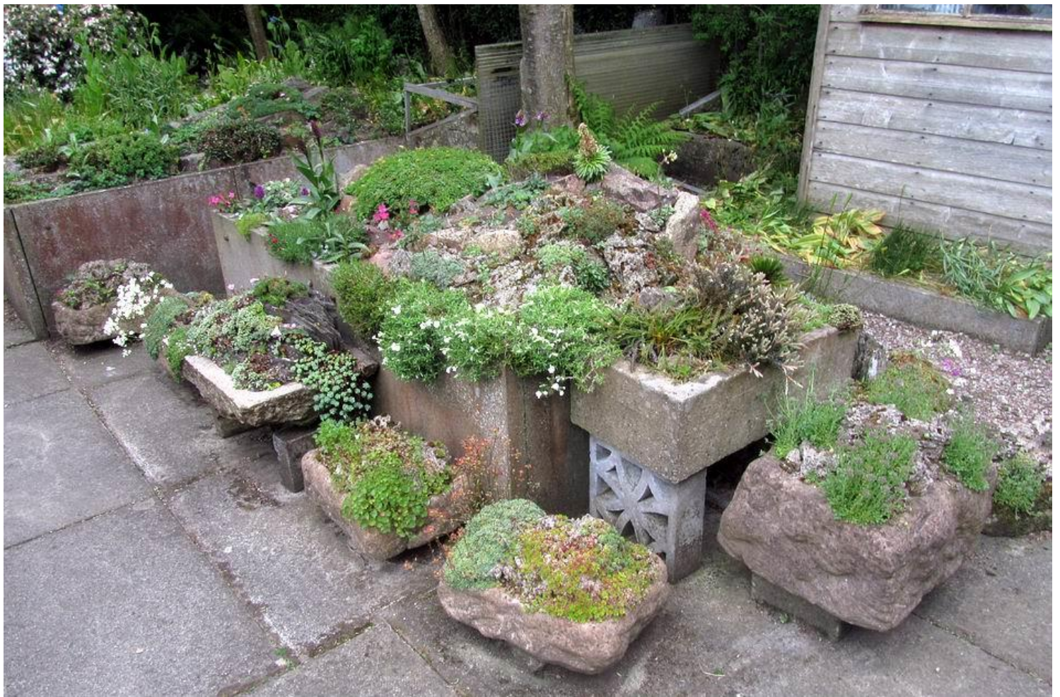
Another view over two of the slab beds with troughs grouped around them, you can see our plant of Saxifaga longifolia flowering on the top of the nearest raised bed.