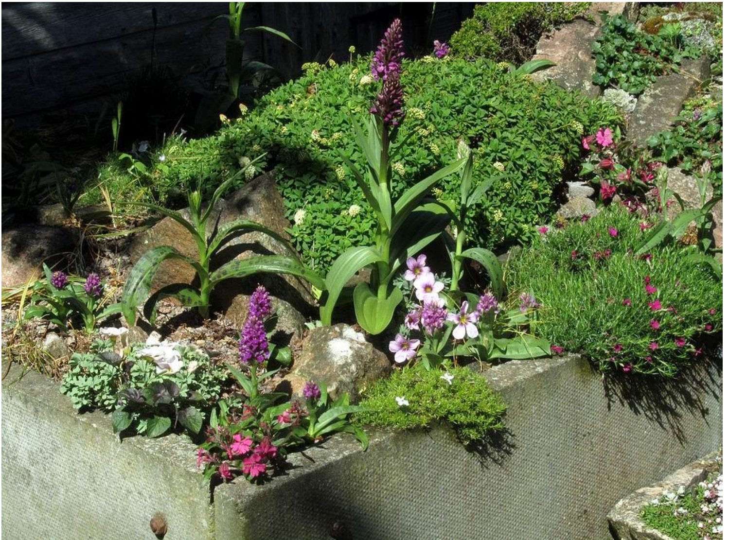
The smaller orchids are Dactylorhiza purpurella the taller ones are seedlings that have obviously hybridised.