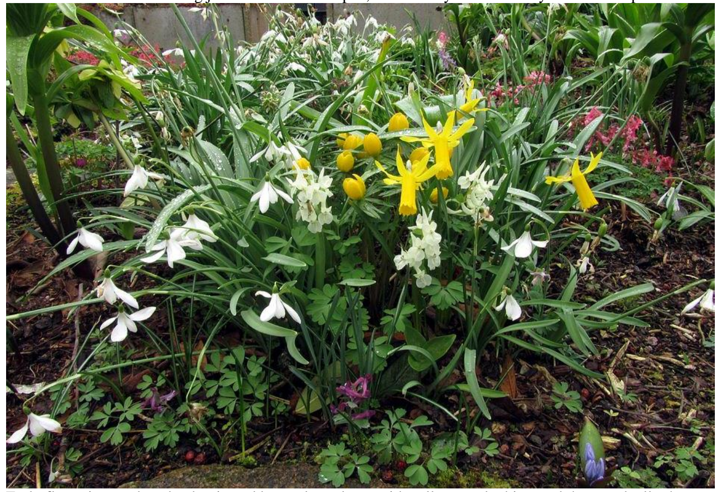
Early flowering tends to be dominated by cooler colours with yellows and whites and then gradually the warmer colours appear especially noticeable among the Corydalis solida where reds and pinks are prevalent.

Although the same seasonal cycle comes round every year the garden varies depending on the inconstant weather conditions we get. Some years the flowering of some plants may be simultaneous, others there will be an overlap with the flowers of one fading just as some others open, then other years there may be no overlap at all.