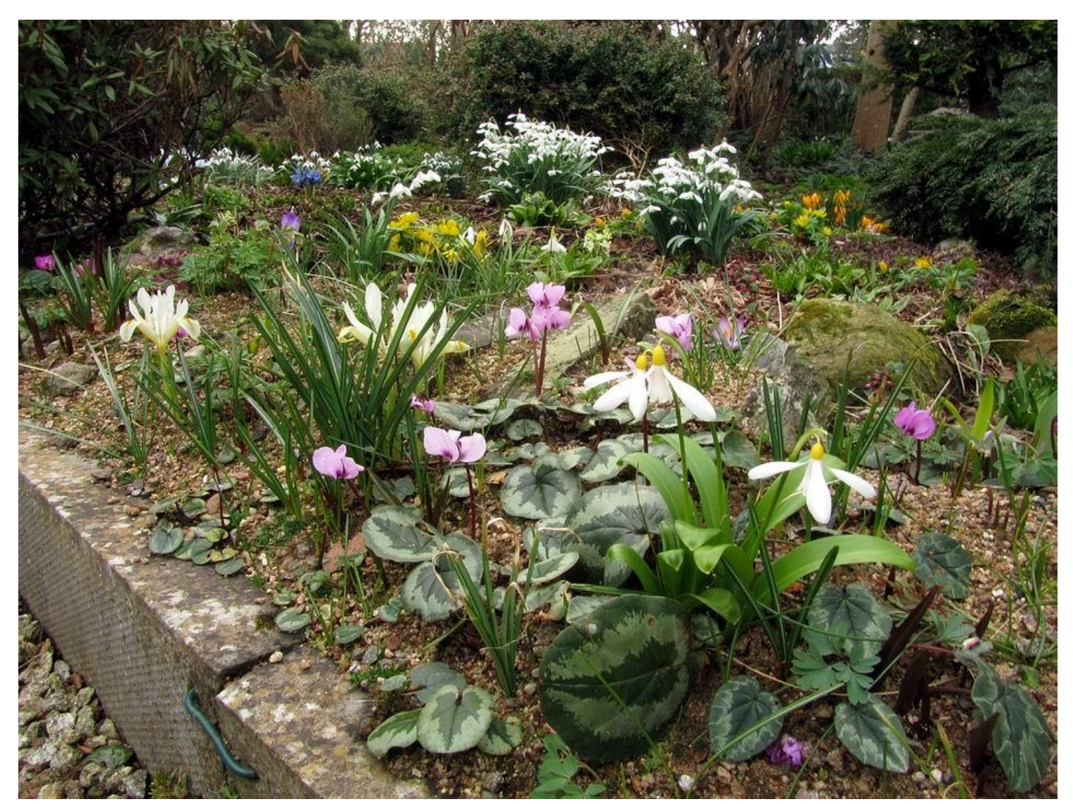
That same bed shown above is seen in the background behind one of the sand beds which is also filled with a variety of flowers. Iris, Cyclamen and Galanthus are seen here.