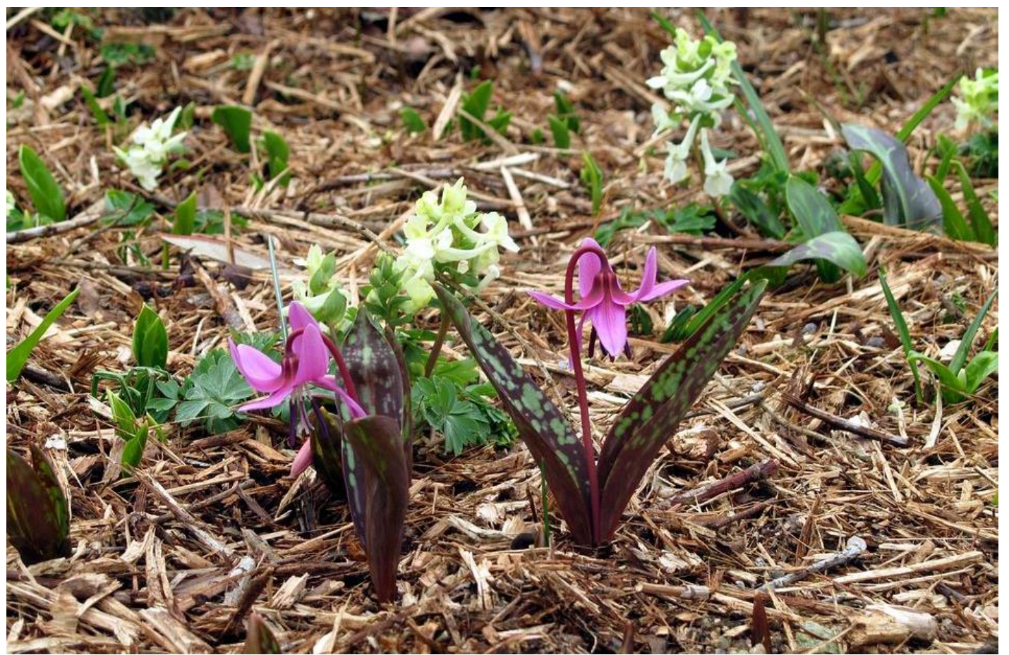
Erythronium dens canis and Corydalis malkensis growing in the plunge bed. These Erythroniums are grown in square plastic mesh baskets and the Corydalis just seeds around adding charm and without causing problems.