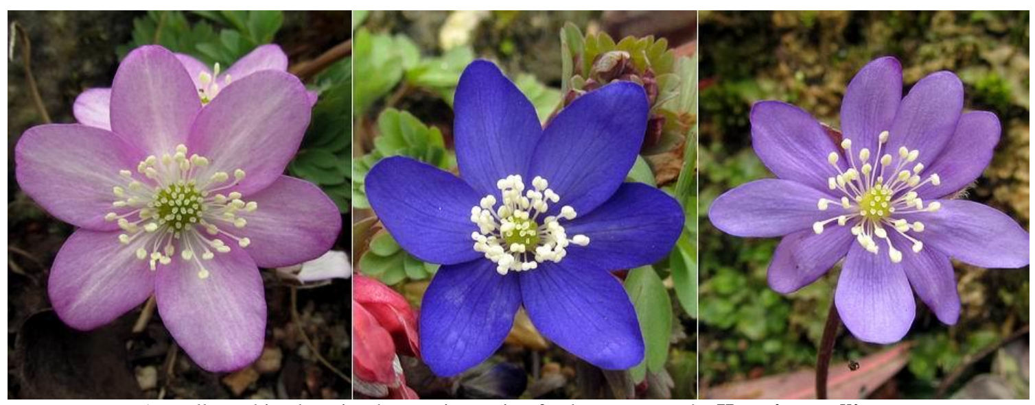
As well as white there is a harmonious mix of colours among the Hepatica seedlings .

A chance self-seeding of a Corydalis beside a Hepatica elsewhere in the garden gave me the inspiration for this small bed between the path and the Erythronium plunge. Nature showed me how attractive and appropriate this combination can be so a few years ago I reworked this area landscaping it with broken concrete blocks and planting it up with Corydalis and Hepatica seedlings: now each year we can enjoy the wonderful combination of colours.