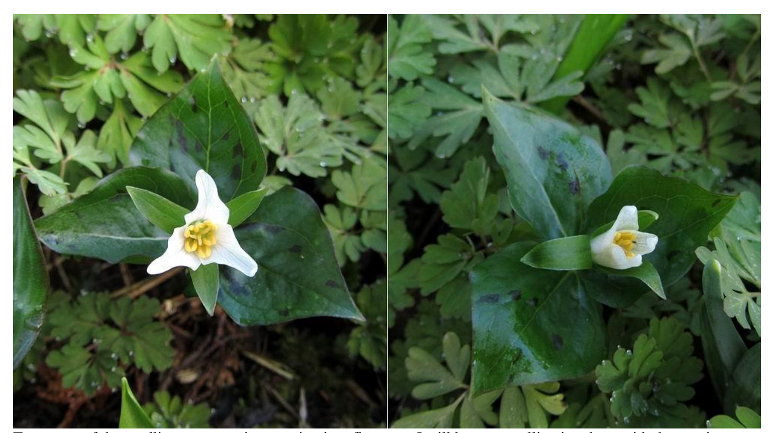
Two more of the seedlings are now just coming into flower so I will be cross pollinating them with the previous plant. You will also notice that the previous plant has much more attractive dark markings on the leaves than these two have – this dark mottling on the leaves is what distinguishes the maculosum form from typical T. ovatum.

I showed this plant of Trillium ovatum forma maculosum two weeks ago as the flowers first opened; now that the anthocyanin has developed the flowers appear pink. I hope that this also means that I was successful in my attempts to self-pollinate the plant and that seed will result.