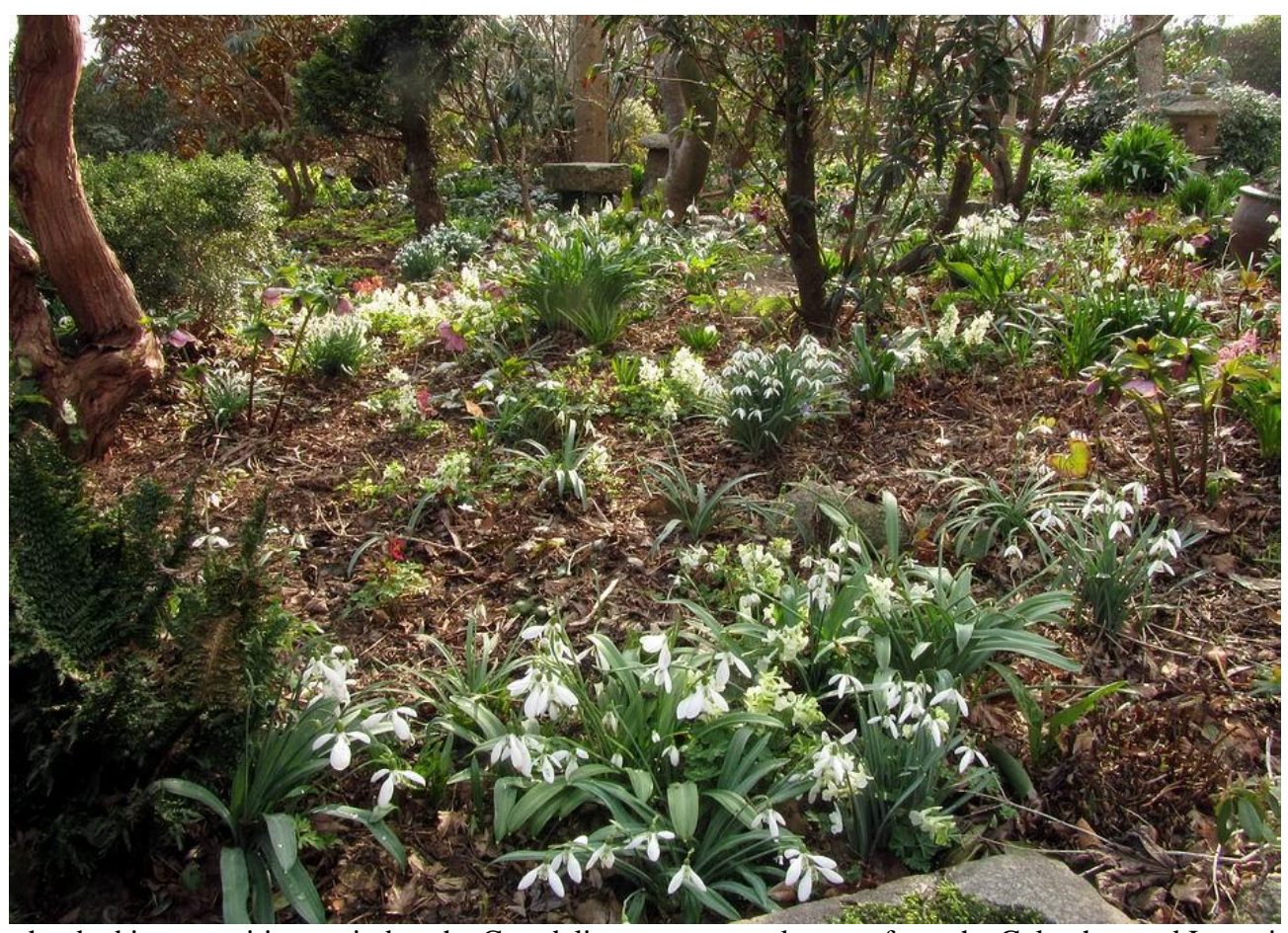
Another bed in a transition period as the Corydalis emerges to take over from the Galanthus and Leucojum.