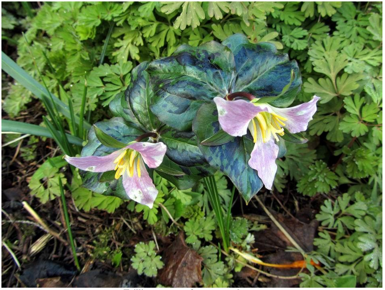
Trillium ovatum forma maculosum

I showed this plant of Trillium ovatum forma maculosum two weeks ago as the flowers first opened; now that the anthocyanin has developed the flowers appear pink. I hope that this also means that I was successful in my attempts to self-pollinate the plant and that seed will result.