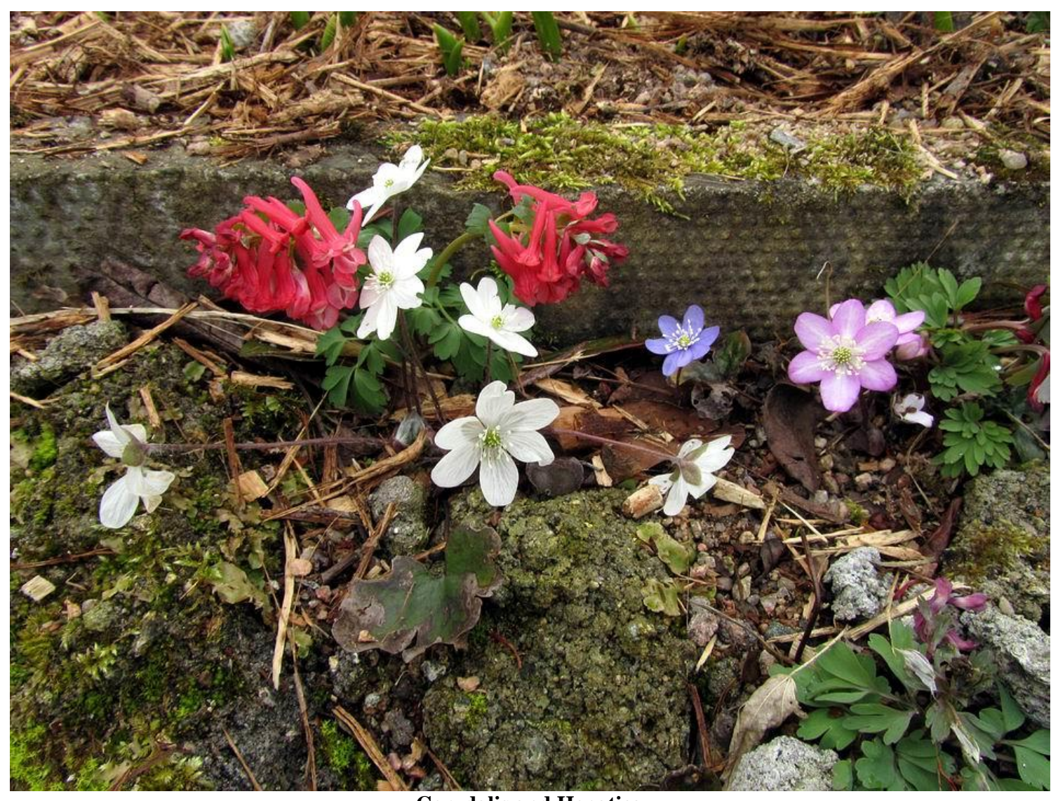
Corydalis and Hepatica.

At his time of year the garden changes by the minute especially when we have sunny days and extended daylight now we have passed the spring equinox. Despite the cool air conditions the sun does warm the ground enough for many of the early risers to burst into flower.