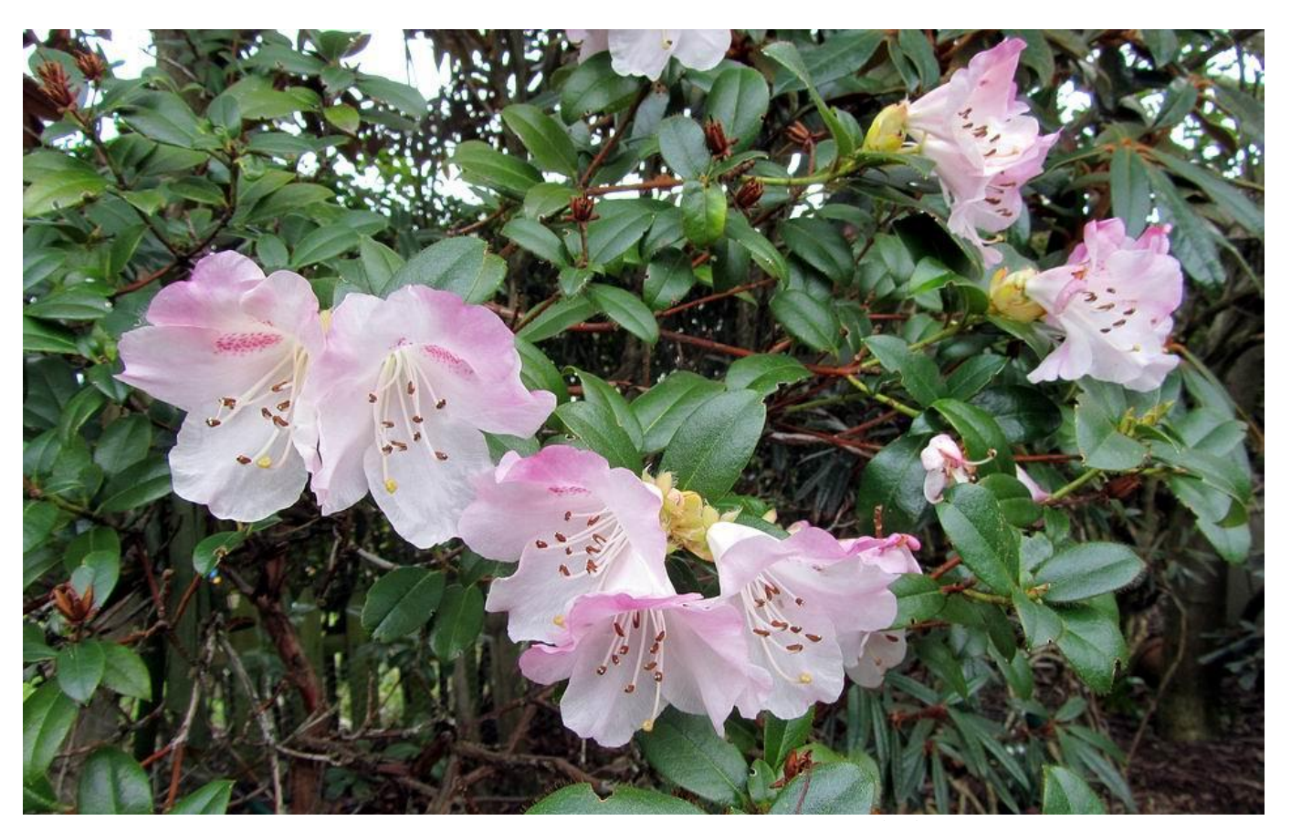
The pink Hepatica coordinate perfectly with the flowers of Rhododendron cilpinense always one of the first into flower in our garden – so far this year they have not been frosted!

There are plenty species of Hepatica that are perfectly hardy in our garden such as this pink form of H.nobilis that comes perfectly true in colour as it seeds around the garden. Sometimes I remove the old leaves in the winter: obviously I have not done so with this group.