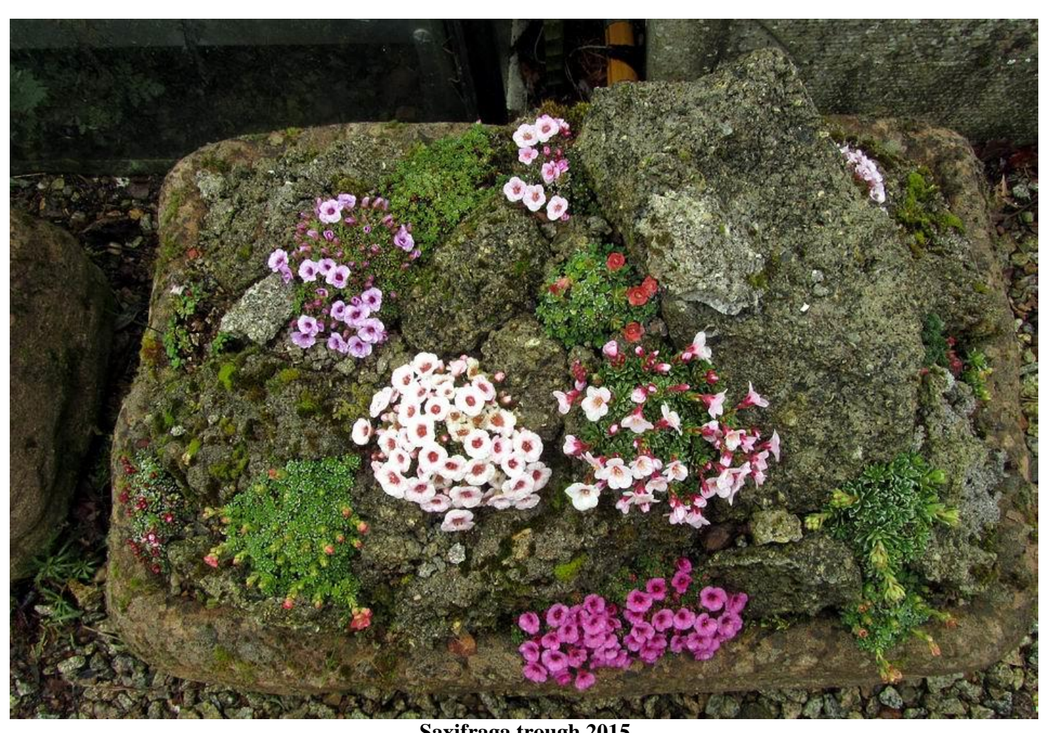
Saxifraga trough 2015

Now I can both see the names and also how well the plants are growing.