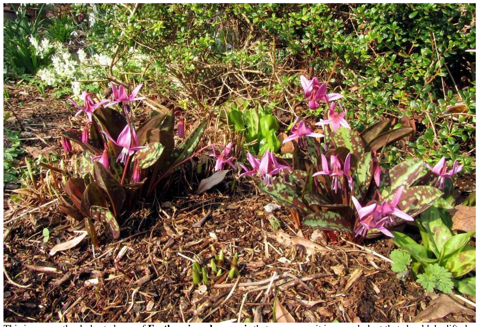
This is among the darkest clones of Erythronium dens canis that we grow – it is a good plant that should be lifted and divided every three to five years – this helps spread it around and keeps it flowering well.