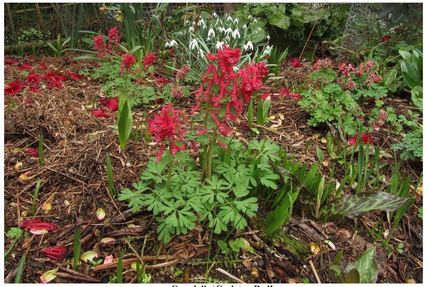
Corydalis 'Craigton Red'

Red flowers wind blasted off Rhododendron thomsonii scatter the ground in support of Corydalis 'Craigton Red'