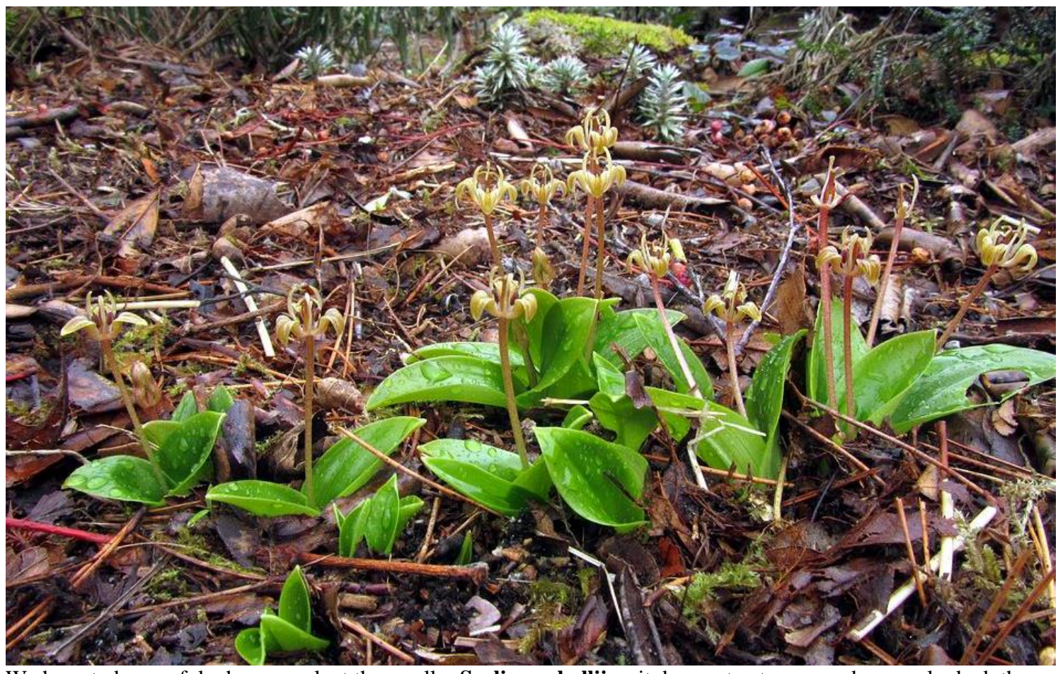
We have to be careful where we plant the smaller Scoliopus hallii so it does not get swamped or overlooked, then we can see and appreciate its tiny subtly coloured flowers as they emerge.