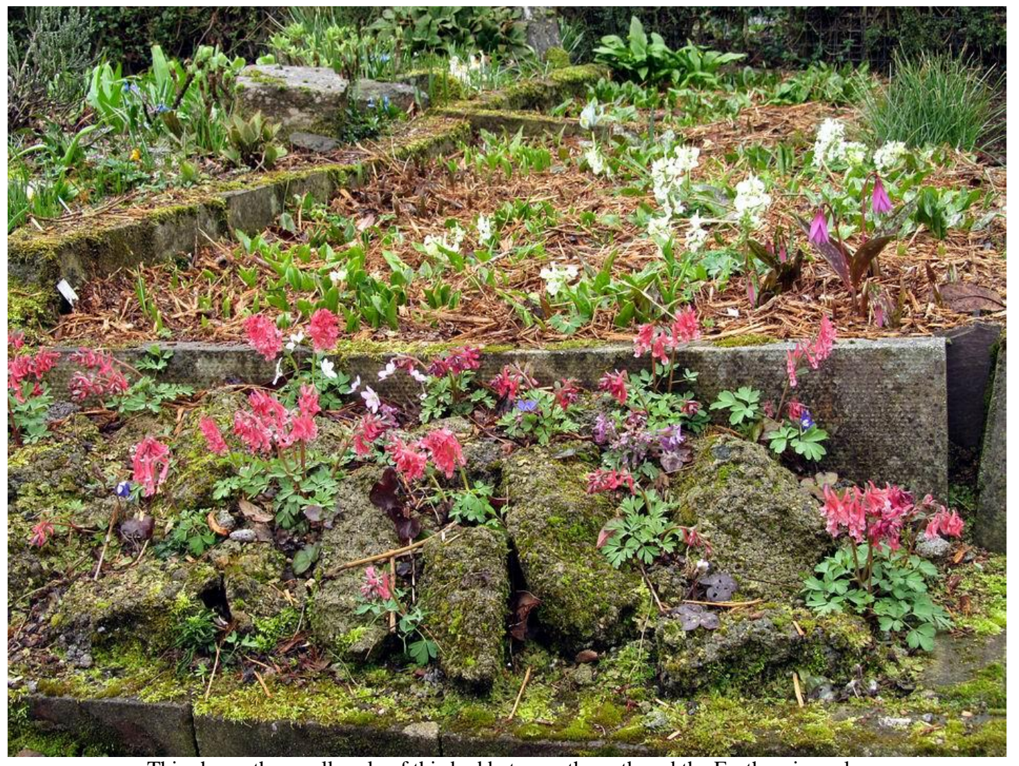
This shows the small scale of this bed between the path and the Erythronium plunge. Check out the latest <u>Bulb Log video diary supplement</u> now available through the SRGC Forum.