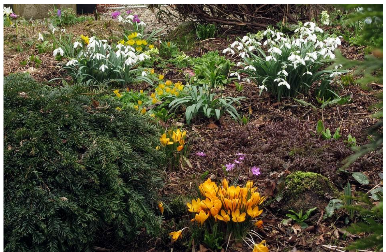
Galanthus and Eranthis flowers start to go past their best in this bed but they will soon be replaced by Corydalis, Anemone and Erythronium while Crocus and Hepatica flowers help bridge the gap.