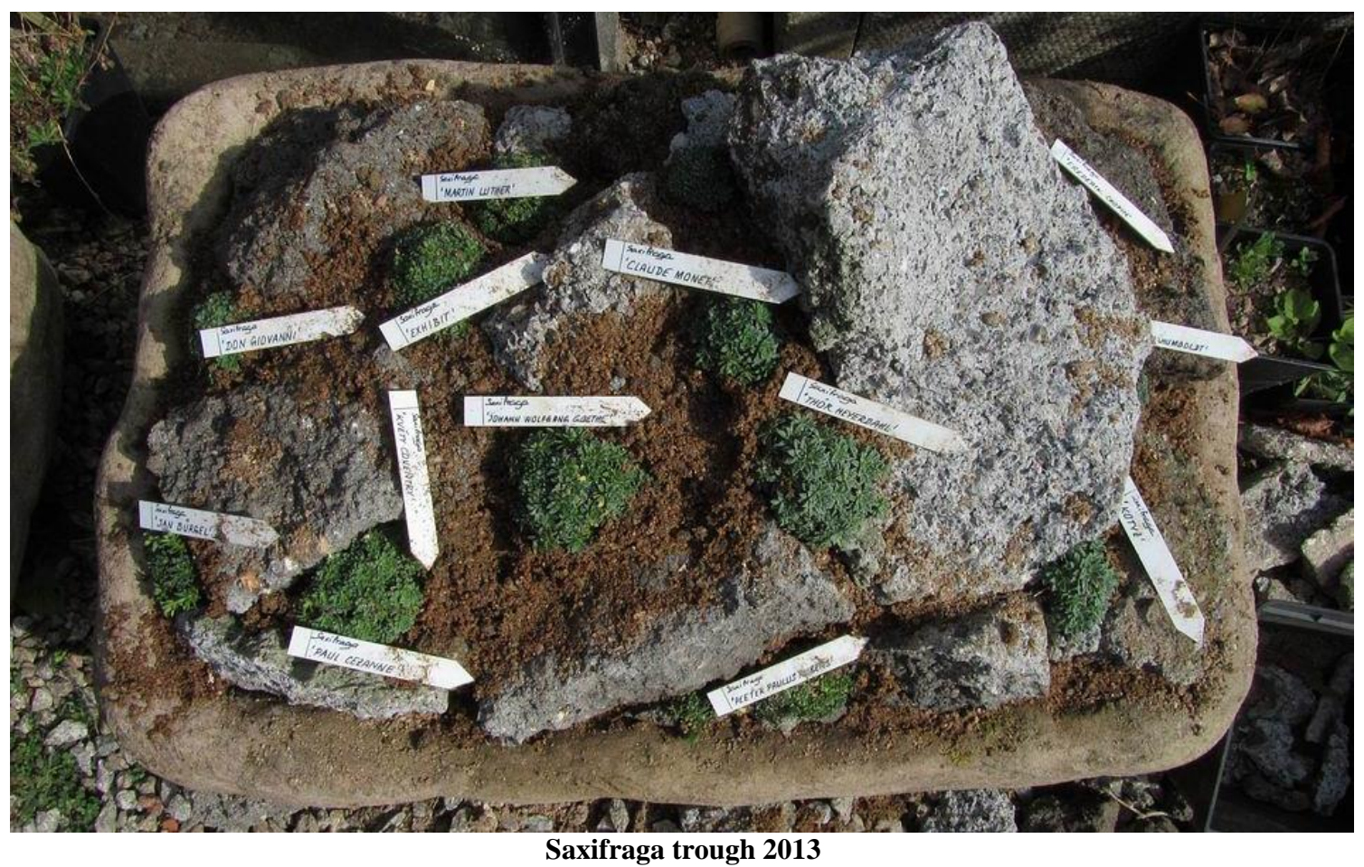
In 2013 I planted up this trough with Saxifrages from the Czech Republic and as I hate labels spoiling the look I take pictures of the labels next to the plants at planting time - this acts as my reminder and record of the plants.