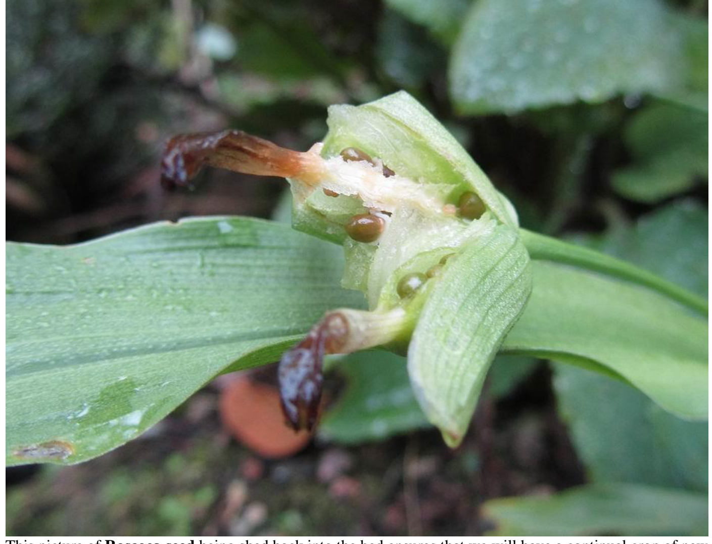
This picture of Roscoea seed being shed back into the bed ensures that we will have a continual crop of new seedlings appearing around these plants.