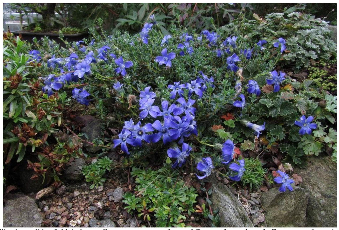
I like them all but I think the smaller more compact plants of Cyananthus microphyllus are my favourites.