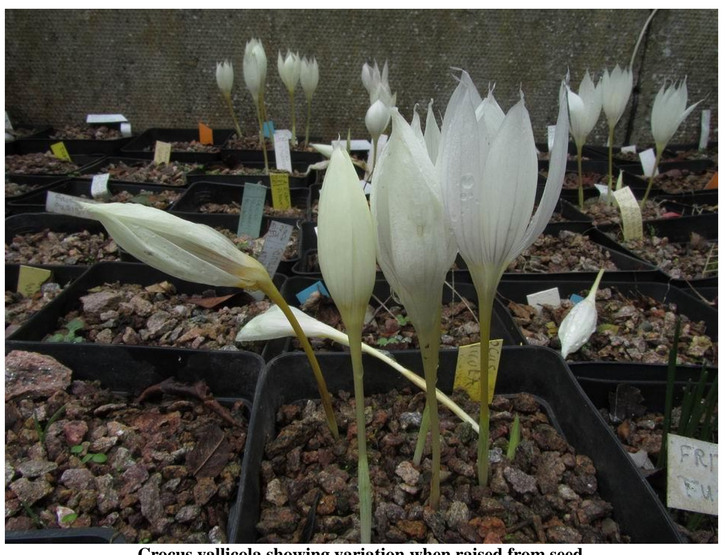
Crocus vallicola showing variation when raised from seed.