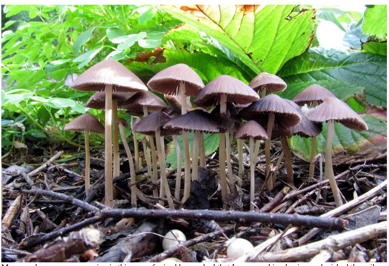
More mushrooms are appearing in this area of raised humus bed that I am reworking having replenished the soil with some of our own garden compost. Some people worry about the presence of mushrooms in their gardens and want to know how to get rid of them – I welcome them as a sign that we have a bio diverse, healthy natural soil.