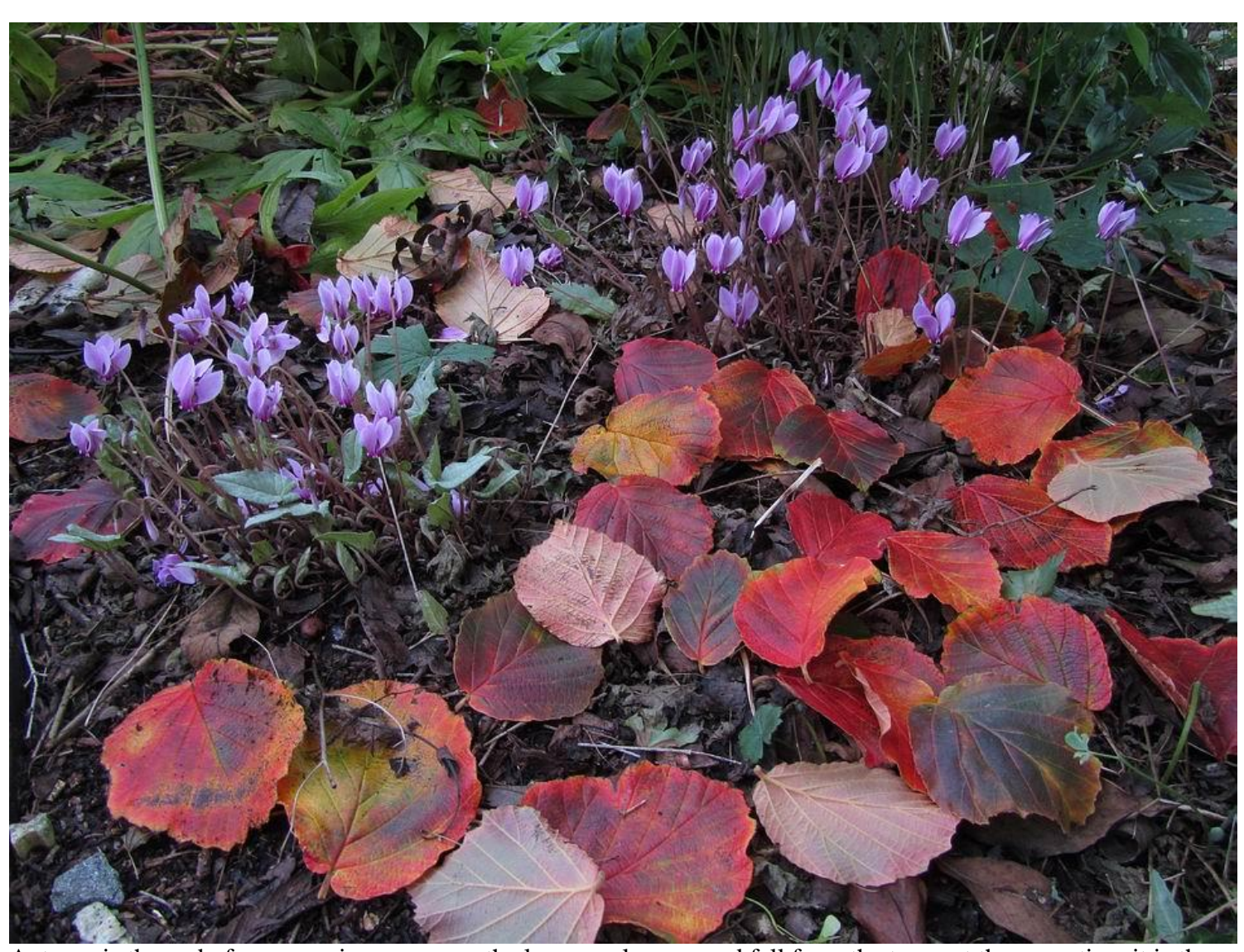
Autumn is the end of one growing season as the leaves colour up and fall from the trees at the same time it is the start of another as the autumn bulbs including Cyclamen hederifolium start to bloom and produce their new crop of leaves that will last all the way through to July next year.....