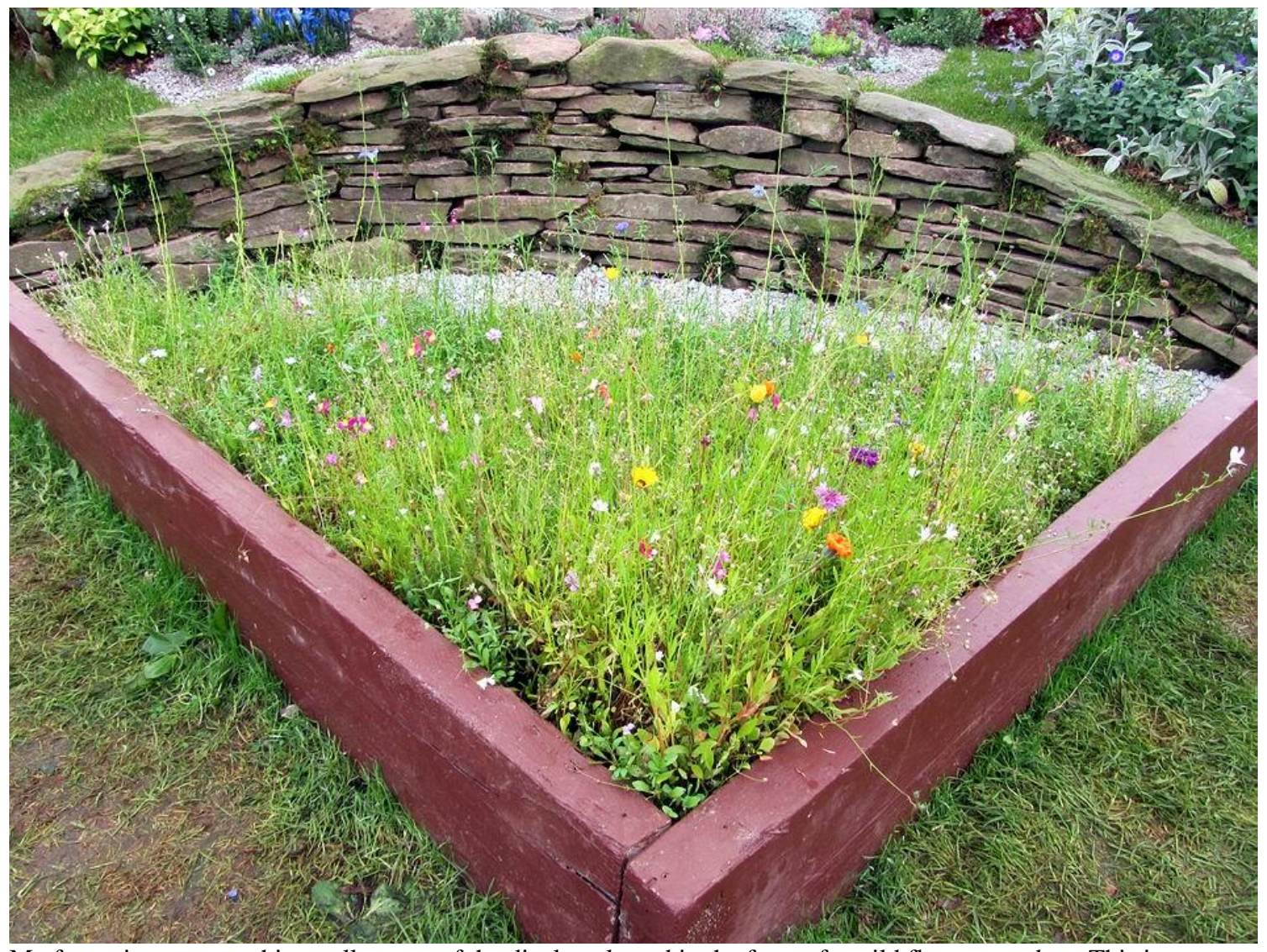
My favourite part was this small corner of the display planted in the form of a wild flower meadow. This is not an easy thing to do and bring along for a weekend of display such as this but it does show us what we could all achieve in even a small area – a planting that not only looks attractive also greatly benefits all of nature's creatures.