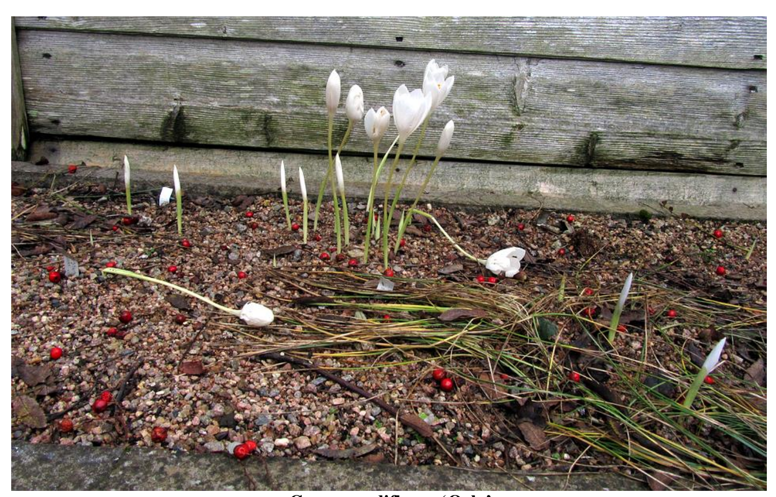
Crocus nudiflorus 'Orla'

Crocus nudiflorus sends out stolons that form cormlets at their tip allowing this plant to spread over a wide area, the white form is no different. The main planting here is in a mesh plunge basket all the flowers at any distance have spread there by means of these stolons—they are all through this sand bed. The retreating leaves in the foreground are those of Crocus pelistericus which are only now dying back.