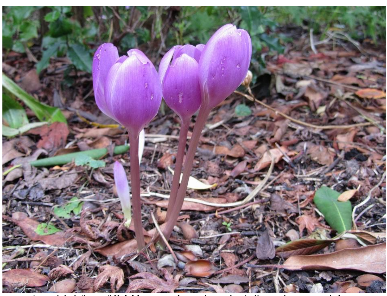
A good dark form of Colchicum speciosum is another indicator that autumn is here.