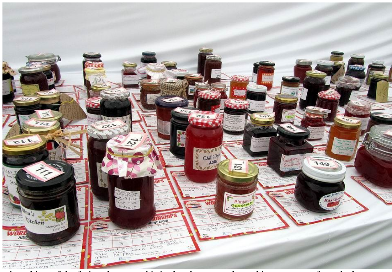
While on the subject of the fruits of autumn this is also the season for making preserves from the harvest and for those preserves to be entered into the competition at the autumn shows of horticultural societies.