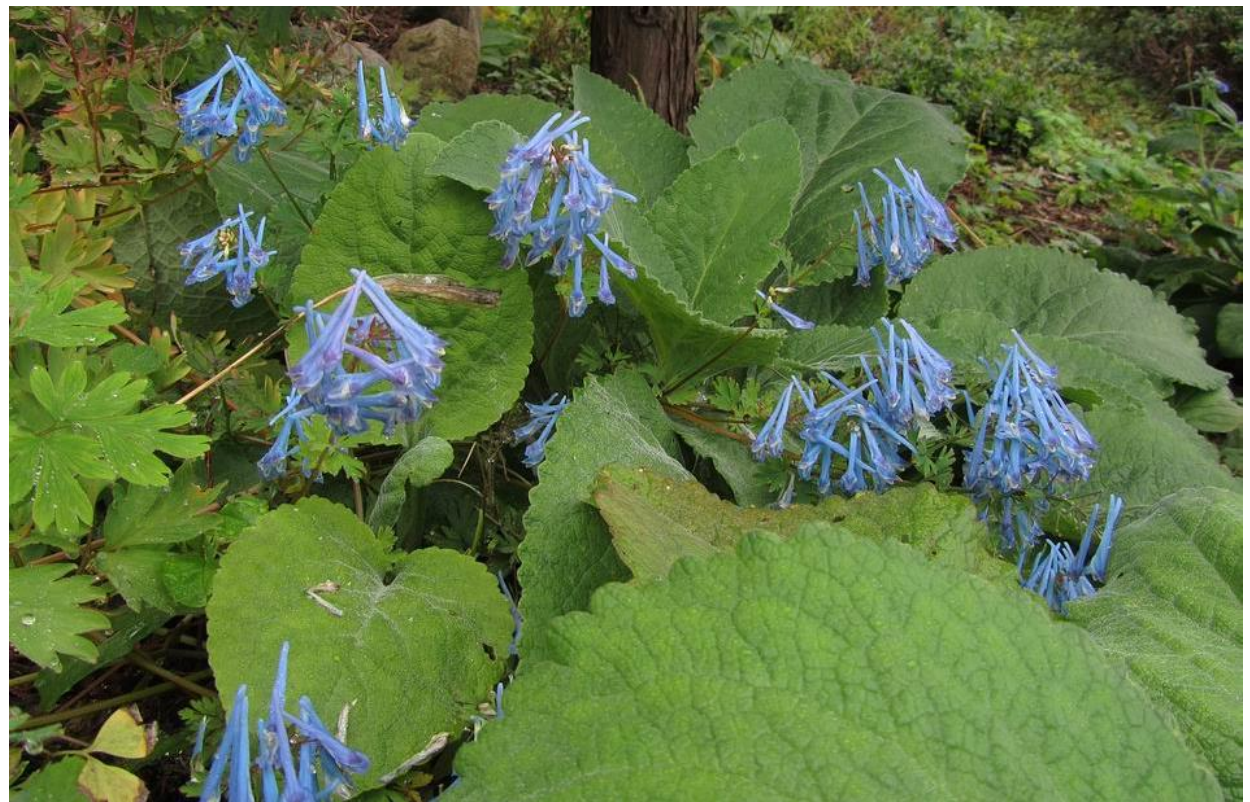
Corydalis 'Craigton Blue' flowers again this autumn pushing through and contrasting with the Digitalis leaves.