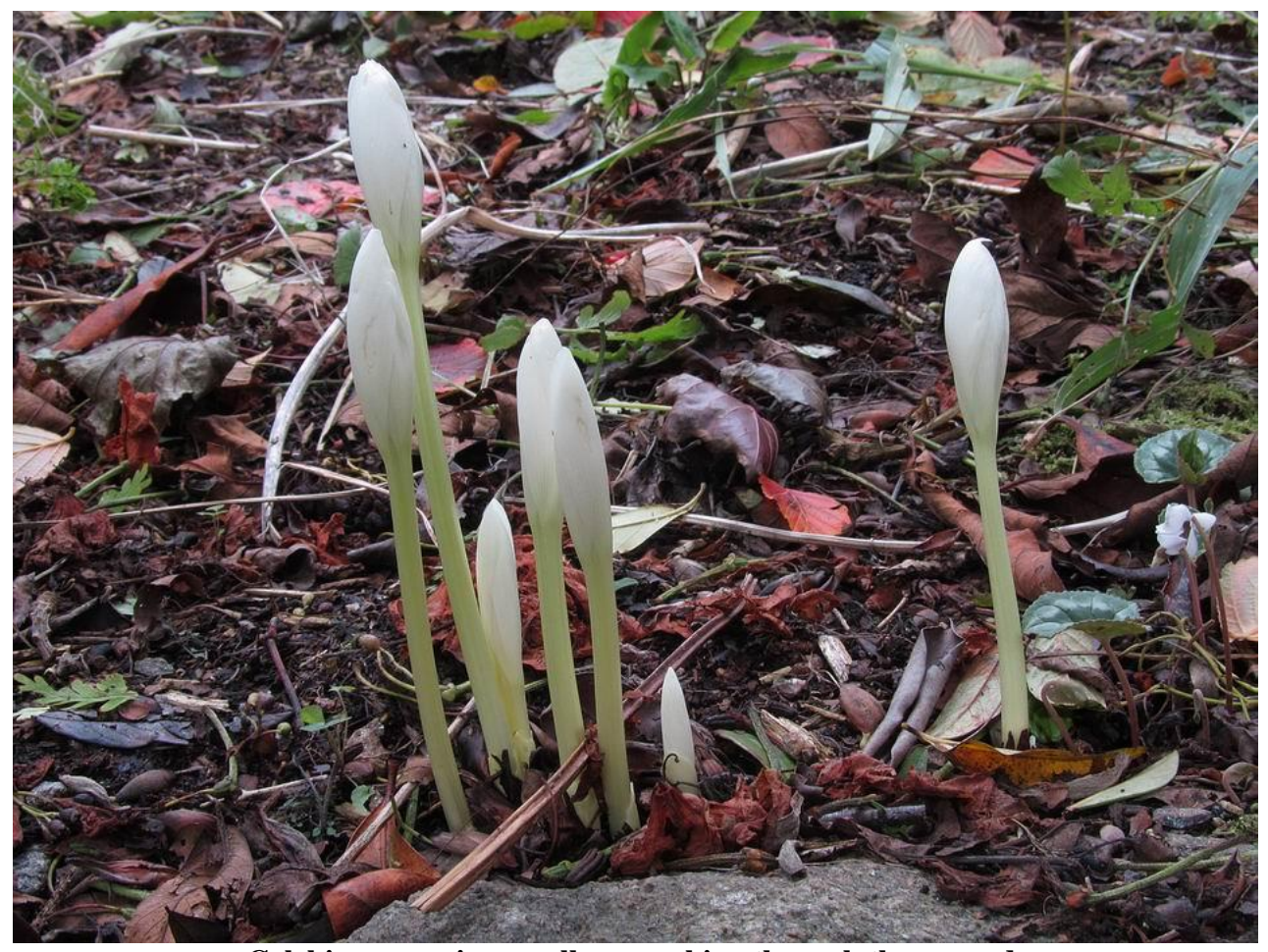
Colchicum speciosum album pushing through the ground.