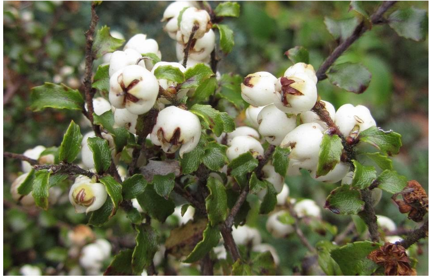
Not all that looks like a berry is a berry – if you look closely at Gaultheria what looks like a large berry is in fact a swollen fleshy calyx surrounding a dry seed capsule.