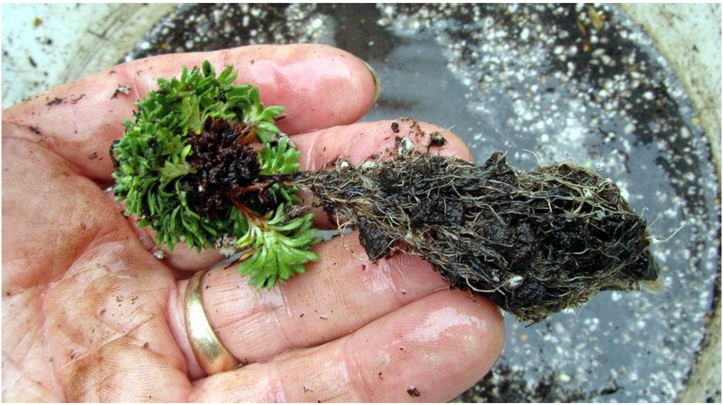
One more dip and shake will remove all but the lumps that the roots have penetrated.

Whenever I but plants I always wash away as much of the nurseries' potting mix away from around the roots – the only time I would not do this is in the winter but then I would not be planting them anyway. Although we are well into autumn the temperatures are still mild enough to ensure some root growth to allow the plants to settle in before the onset of the cold of winter – I believe a ground temperature of above 8C will allow slow root growth and in the troughs the temperature is still in double digits. Supporting the root ball with my fingers I dip it into a bucket of water and shake it around until as much of the mix is washed away as is possible without damaging the roots.