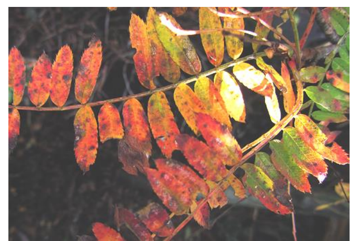
Due to the small leaflets that make up the leaves of most species when they turn yellow/red and fall in the autumn they are not such a problem on the ground.

We have many trees that bear berries in our garden including Sorbus hupeihensis. Sorbus are great trees for smaller gardens because most do not get very large and once they reach their size their growth rate slows down. Every year they give us flowers in the spring along with attractive leaves then berries in the autumn for both us and the birds to enjoy.