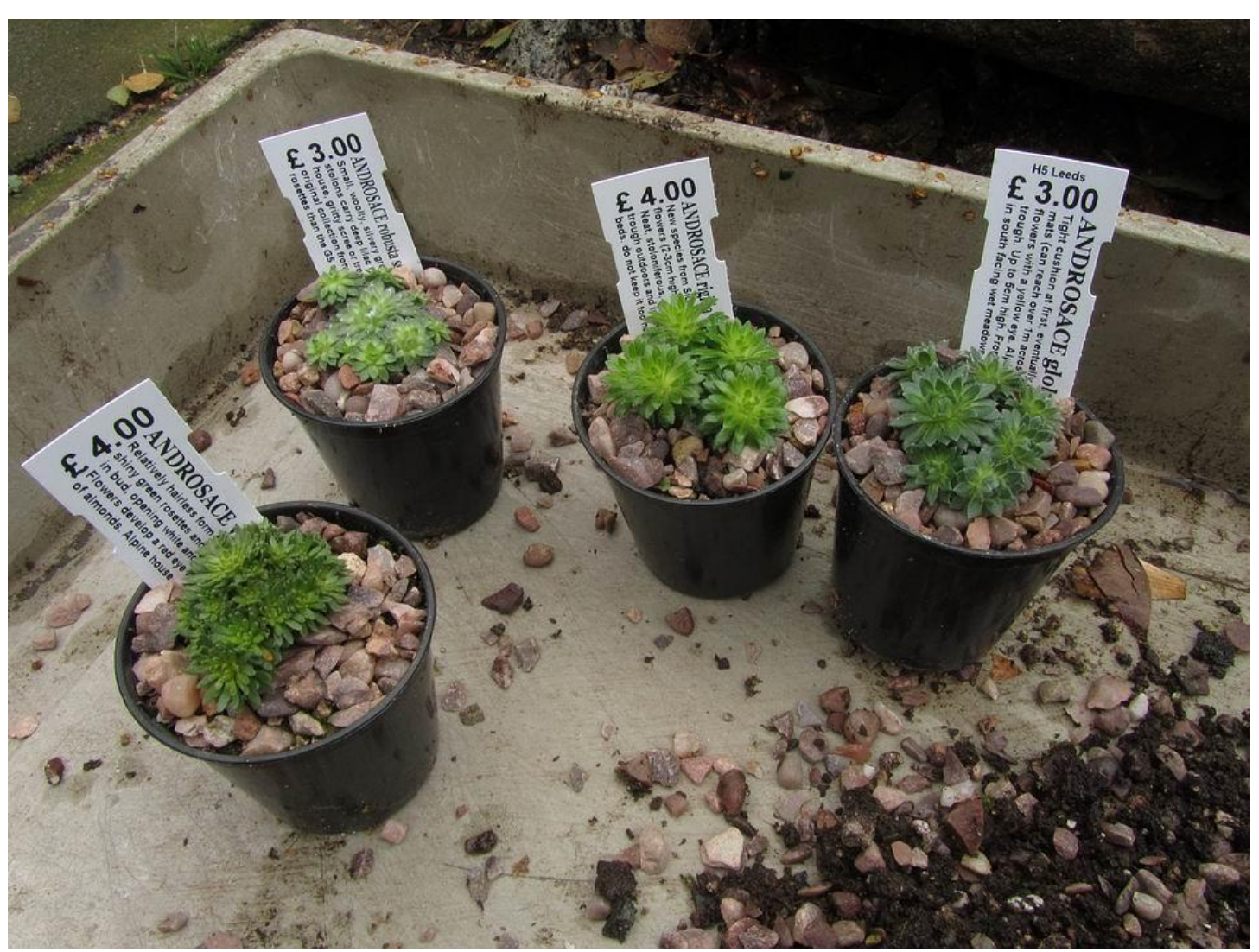
Some surprise was expressed at the sight of me buying some plants at the recent SRGC Discussion Weekend. Most people know I prefer to raise my plants from seeds but sometimes I am tempted and there was an excellent selection of Androsaces on offer– just what I wanted for two troughs that I have, already landscaped and awaiting plants.