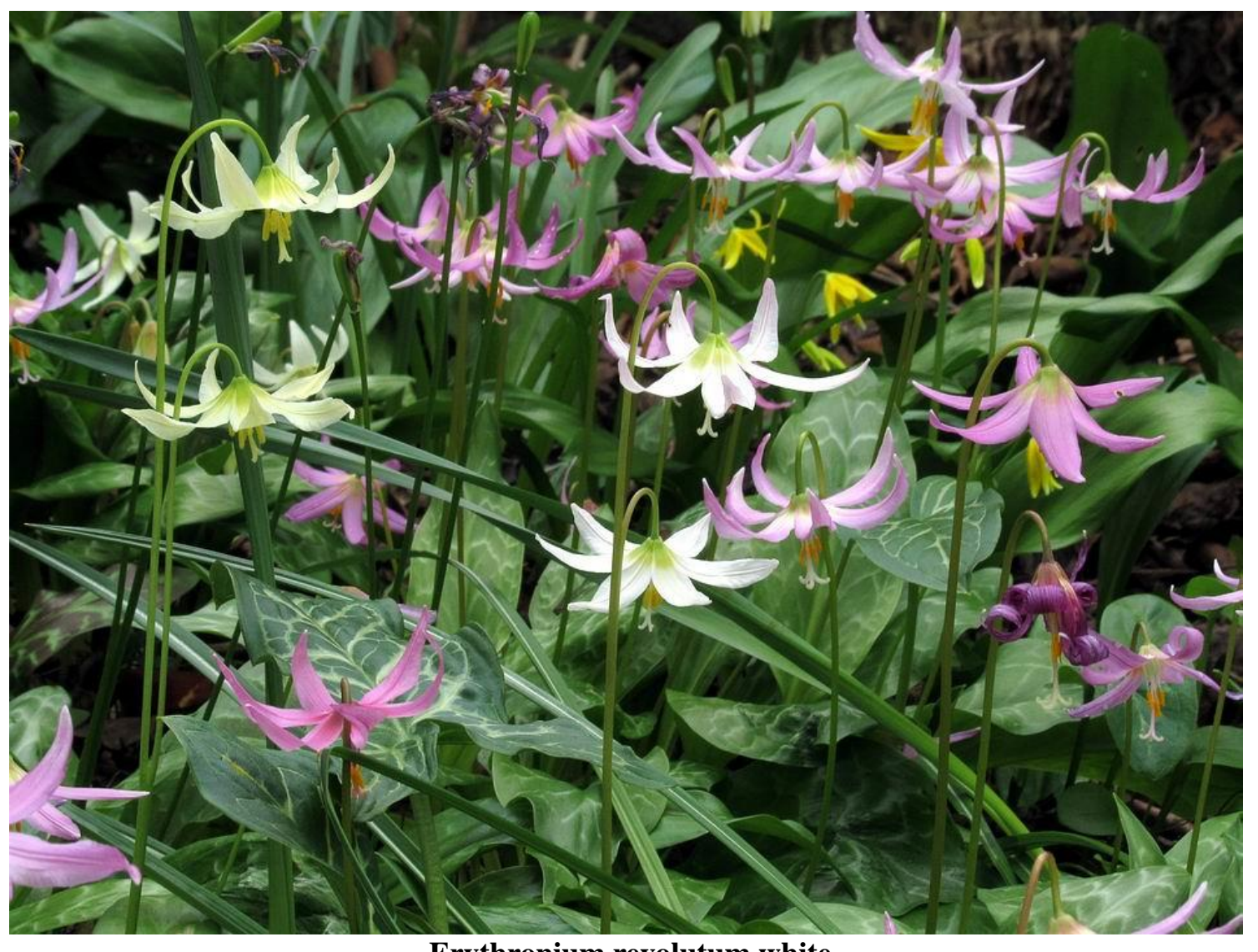
Erythronium revolutum white