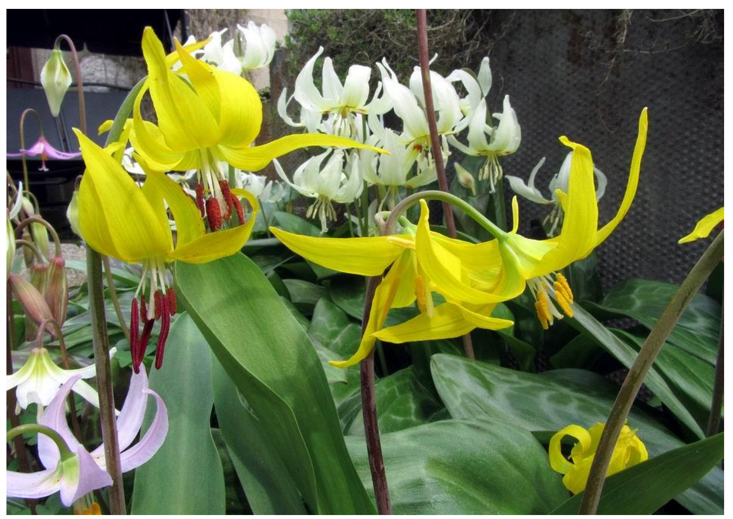
Erythronium grandiflorum showing two of the pollen colour variations.