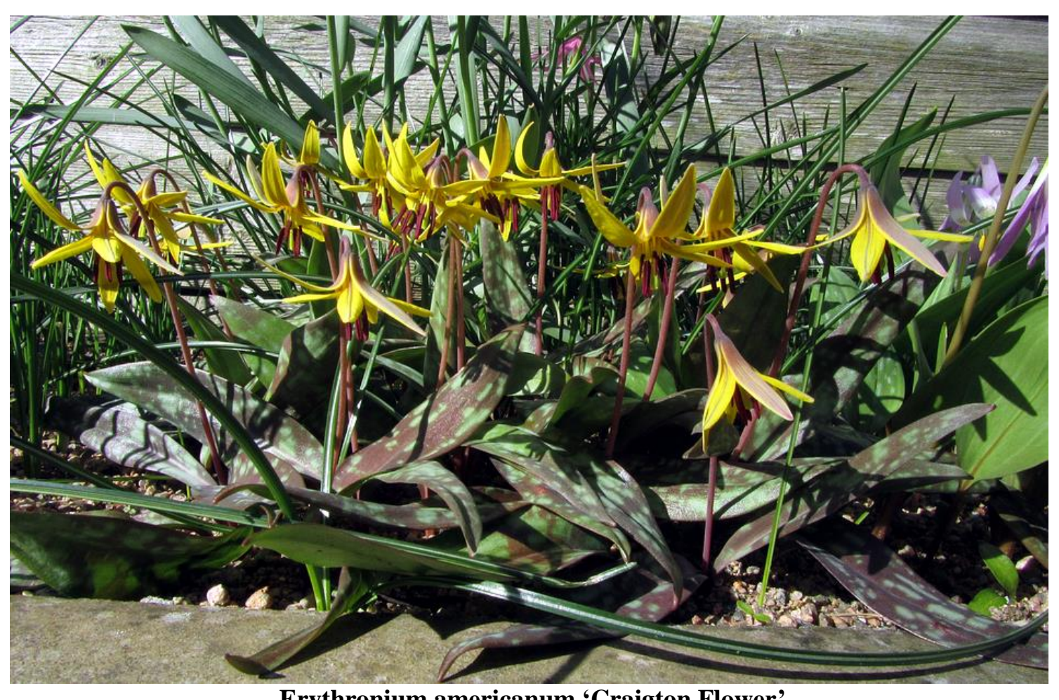
Erythronium americanum 'Craigton Flower' A free flowering seed raised form of Erythronium americanum.