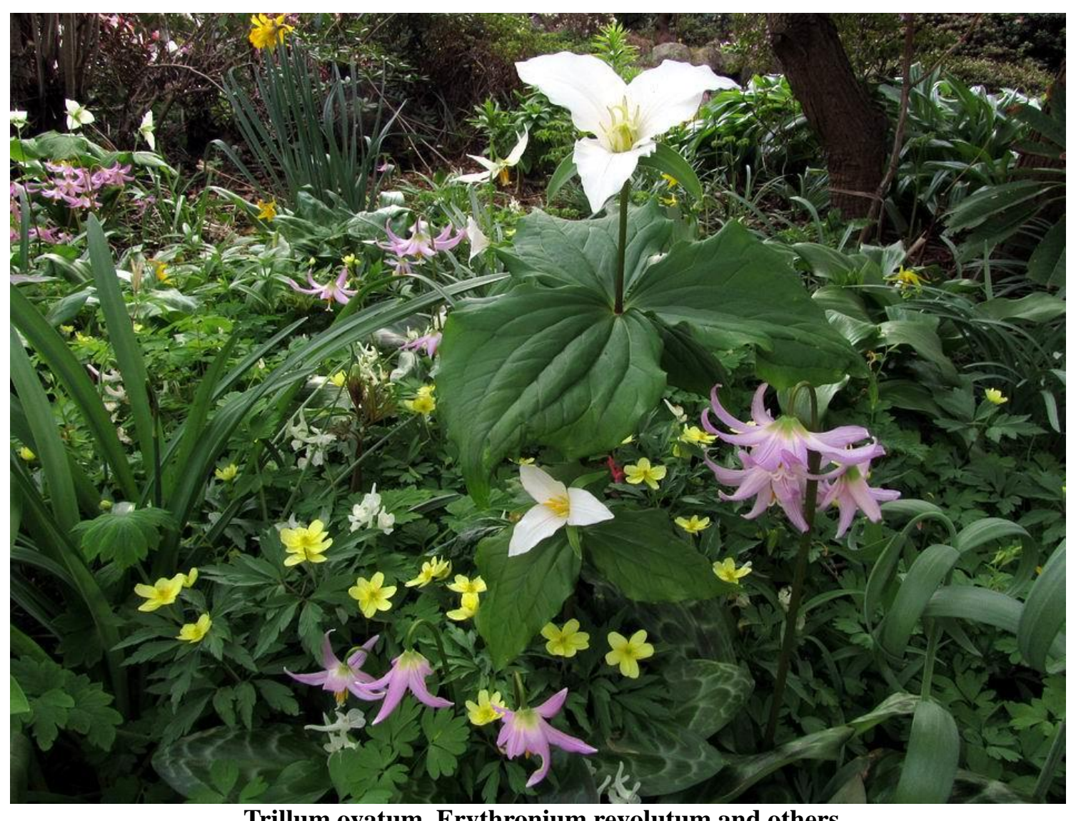
Trillum ovatum, Erythronium revolutum and others