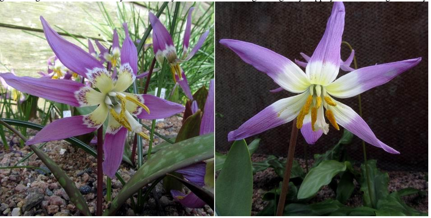
Erythronium sibiricum variations

I have been trying to grow this species for some 30 years with varying degrees of success. Initially we were given a single bulb which we grew in a pot – the trouble was that the flower kept opening before the stem elongated resulting in the flower opening underground and by the time the stem pushed it into the light it had already faded. I did overcome that by keeping the pot in a fridge then bringing the plant into the kitchen where it flowered reasonably well but I wanted it in the garden. Eventually we acquired some seed which, when first raised, behaved in a similar way but we did manage to get it to flower and set seed – we have repeated this process over several generations now with each generation becoming more tolerant of our growing conditions. As well as the obvious variations in how a plant looks each seedling has a variation in what growing conditions it can tolerate. By raising from seed the ones that cannot grow in our conditions do not survive - those that grow can adapt to our garden and each subsequent generation becomes further adapted to our garden. The result is that after many years and to my great delight we now have many forms of Erythronium sibiricum growing very happily and flowering normally.