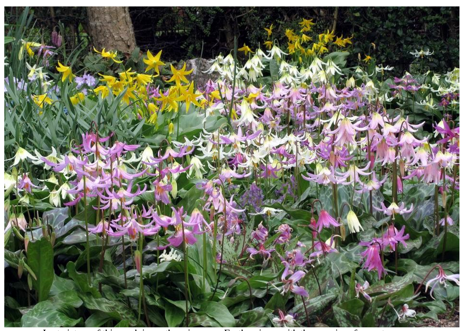
Last picture of this week is another view over Erythroniums with the promise of more to come – Do I need an excuse.....