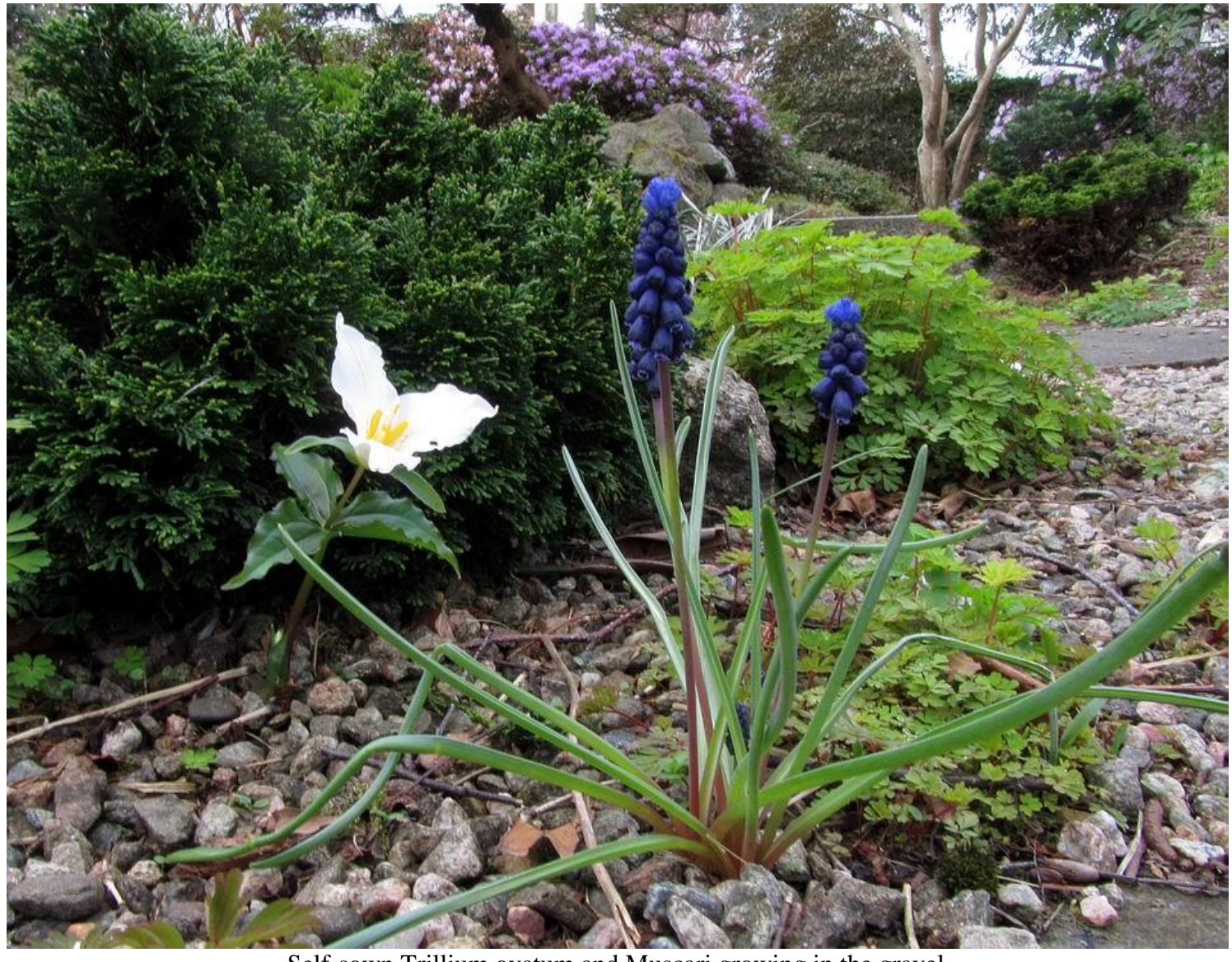
Self-sown Trillium ovatum and Muscari growing in the gravel.