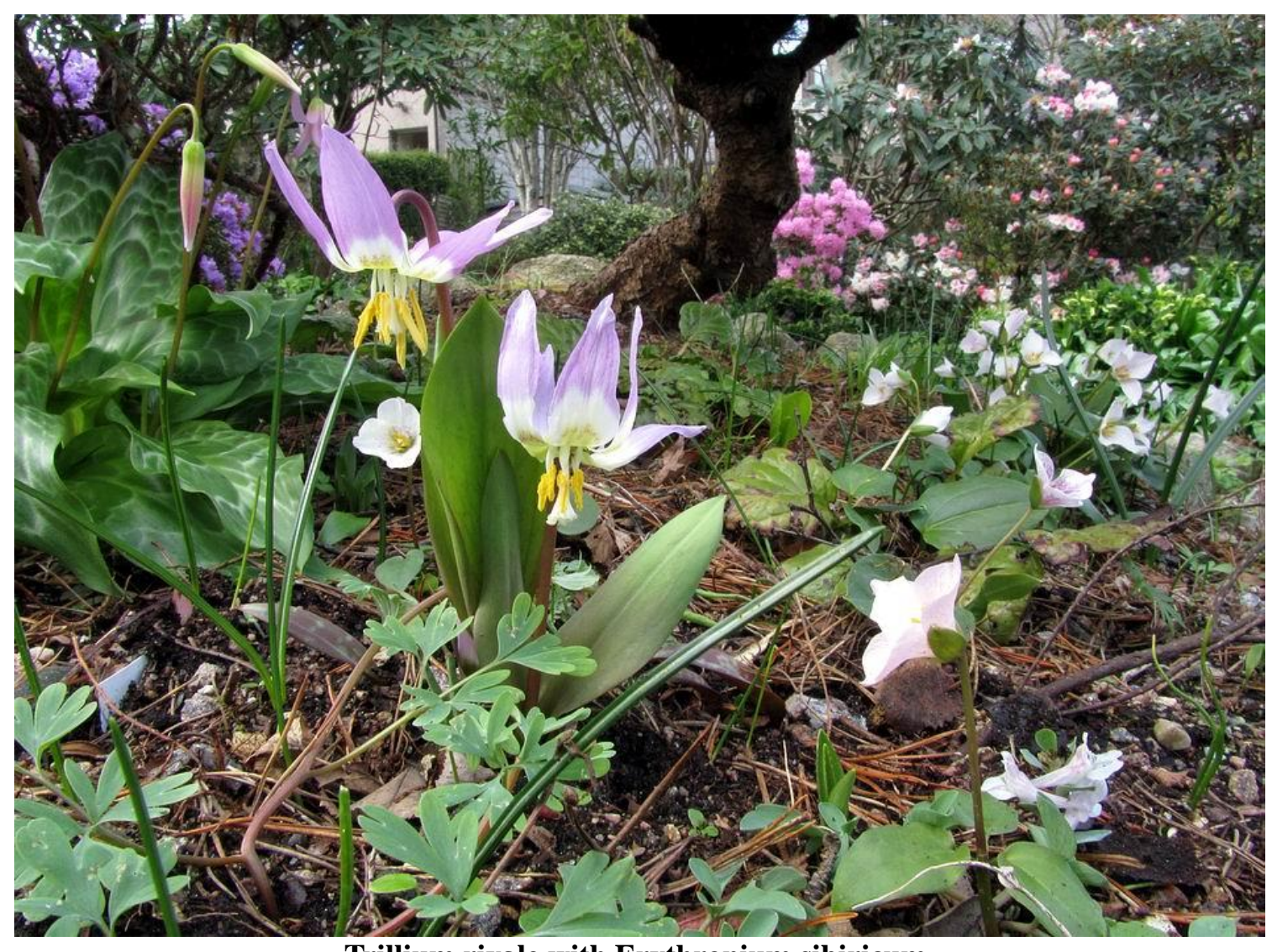
Trillium rivale with Erythronium sibiricum.

Trillium chloropetalum Trilliums also seed freely around our garden including this one which I think to be a form or perhaps hybrid of Trillium chloropetalum.