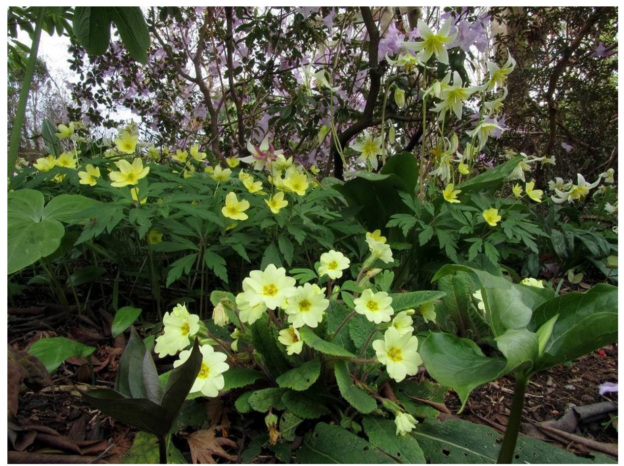
Primula vulgaris, Anemone x lipsiensis, Erythronium and Rhododendron