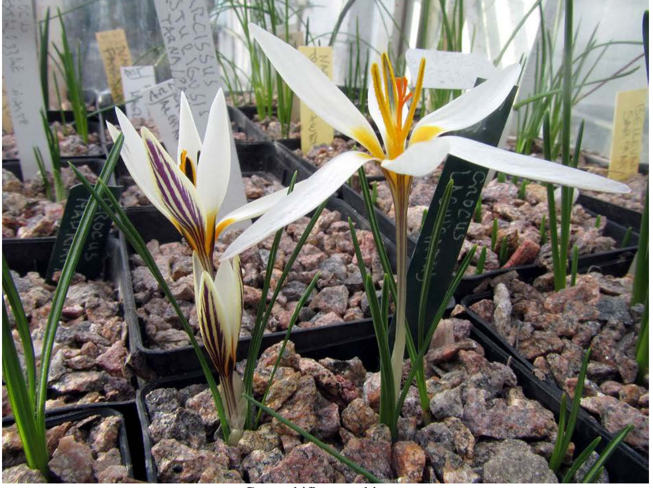
Crocus biflorus nubigena

A lovely dark form of Crocus angustifolius is showing its buds – I just hope we get enough warmth for the flowers to open.