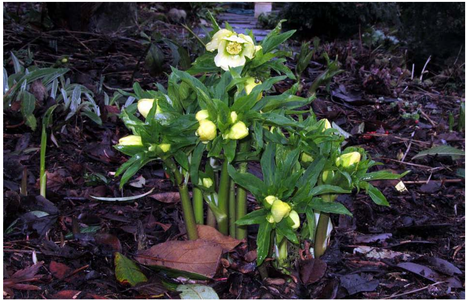
This yellow hellebore is four weeks later coming to this stage than it was last year – not a bad thing. Many of our plants are tempted out too early by our erratic winter with so many false springs only to get hit when the frosts return.