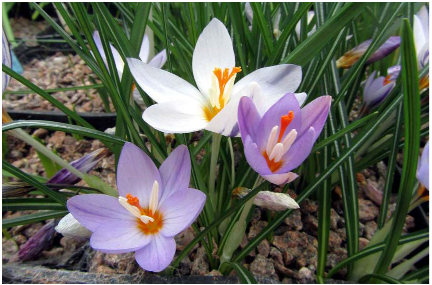
Crocus laevigatus continues to open flowers on the occasional days when the temperature rises enough. At last the sun has risen high enough in the sky to hit the bulb houses for a few hours around mid day - to help raise the temperature I close the doors. Seed variation in colour can be seen especially in the three flowers above but close inspection shows subtle variations through all the seedlings.