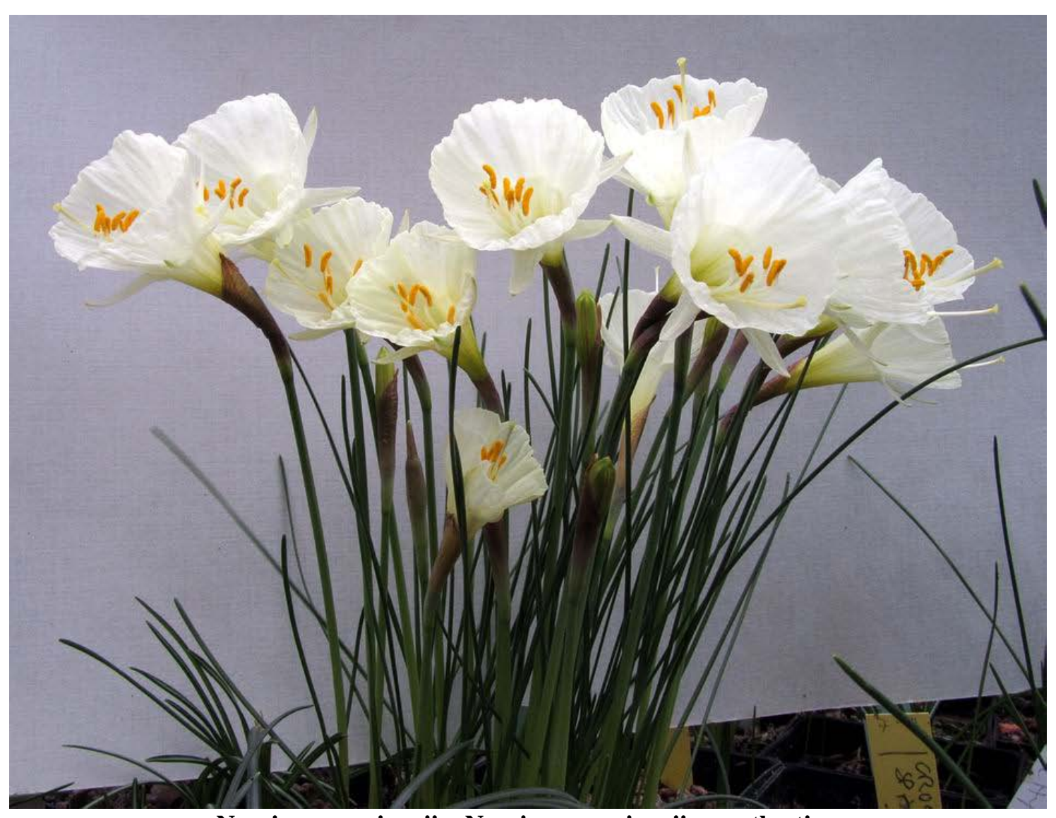
Narcissus romieuxii x Narcissus romieuxii mesatlanticus.

I grow the biggest majority of this group of Narcissus in 7cm pots but that does not mean I do not get lots of flowers, my record stands at 39 flowering stems in a 7cm pot and the one below has 22.