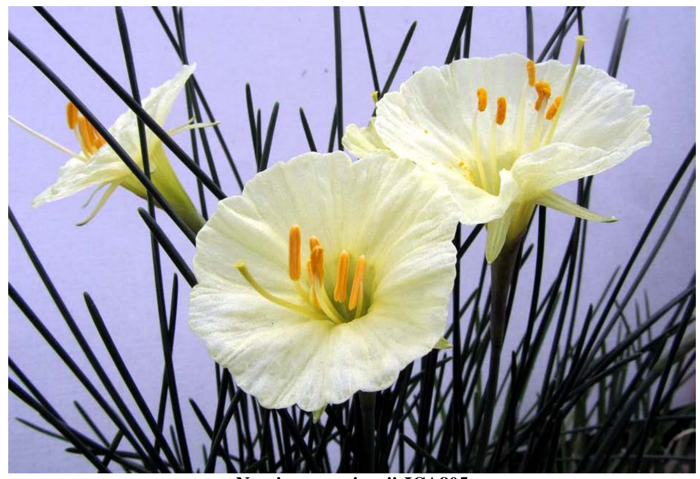
Narcissus romieuxii JCA805

The flowers on the many forms and hybrids of Narcissus romieuxii are now starting to open their flowers - the downside is that the stems have been growing slowly all through December and January and many are so weak and floppy that they cannot hold the flowers erect. How I admired the pictures shown by Tatsuo Yamanaka from Japan of his plants in the Narcissus pages of the forum the flower stems were short and compact and the plants was beautifully proportioned. Try as I have I can rarely reproduce that look in Aberdeen. I have heard of methods such as keeping the bulbs dry for much longer but there is a big danger then of the bulbs breaking down into many non-flowering bulbils as a result of lack of moisture at critical times. I now accept that we live some 20degrees too far North to flower these beauties as they are meant to be seen but if we moved we would be in trouble with the summer heat something that would not liked by most of the other plants we grow and love.