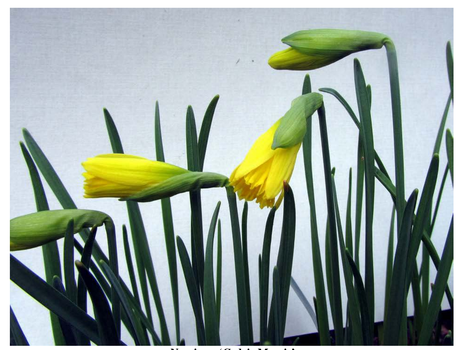
Narcissus 'Cedric Morris'

I was given this form of Colchicum kesselringii by a kind friend a number of years ago - I have another pot of with two seed raised clones that do not flower until a bit later. Seedling variation is not just confined to colour and shape but also when a plant will grow and the conditions it can tolerate. Growing from seed you are more likely to end up with forms that can tolerate your growing conditions and flower at an appropriate time.