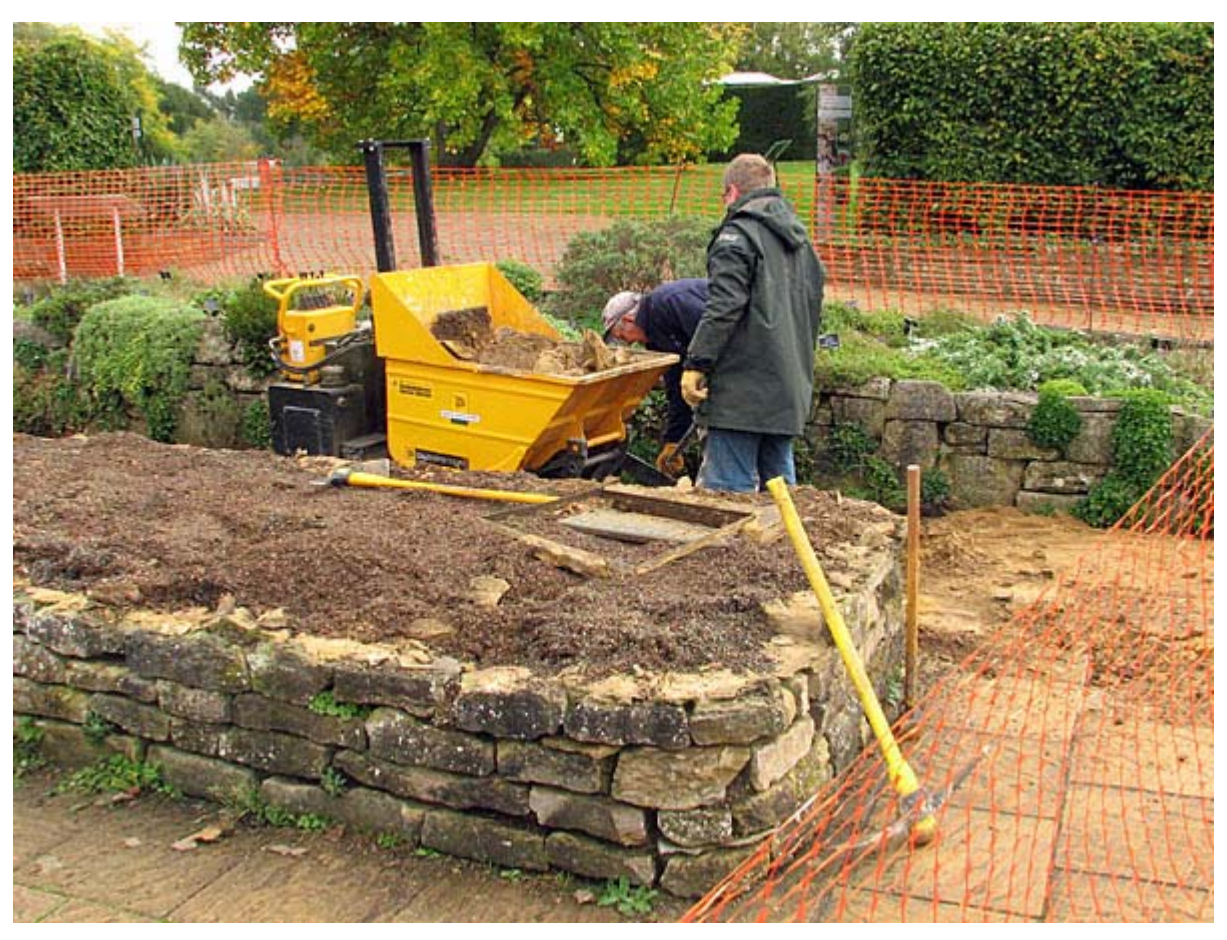
Next are 'before' and 'after' pictures for this part of the job. You can also see that 2 of 3 beds have by now had all their plants rescued: