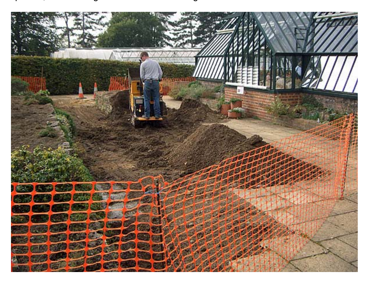
Here both beds are gone:

In this picture, one bed is gone and Chris is starting on the second: