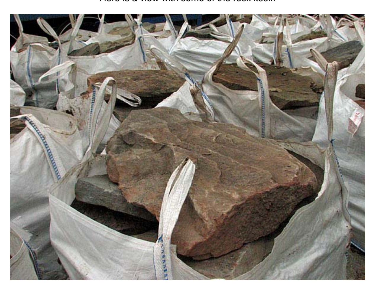
This is near the end of unloading: