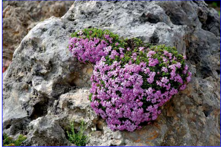
Daphne arbuscula on limestone boulder

Some western readers of the IRG might have a feeling that in these electronic pages the propaganda for Czech growers and their natural style of rock gardening is too intensive. This is just the opening period, in which one of the editors (the Czech one) has available good photographs and valuable information from this stony heart of Europe. In the near or distant future, when we will probably have the contributions of more authors, the percentage of news from Bohemia and Moravia will be lower.