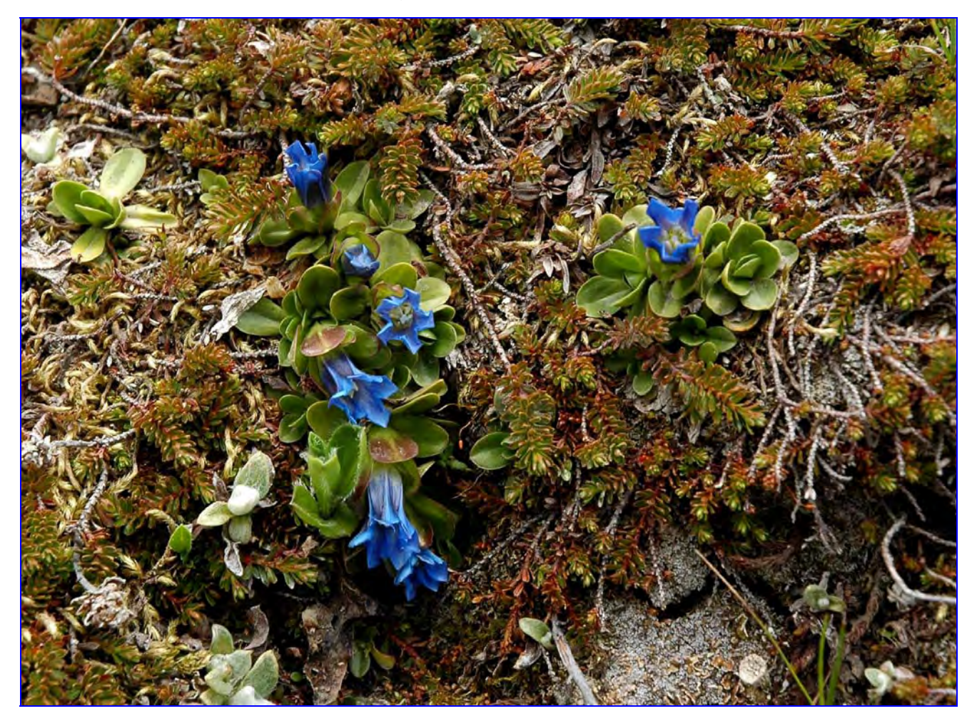
Foliage of Diplarche growing with a gentian similar to G. emergens

Diplarche belongs to the family Ericaceae (with some special features, which in the past were used to bring Diplarche nearer to Diapensiaceae) and is a genus of only these two members. The meaning of "Diplarche" is not fully understood (by me). Hooker wrote: "We have named this very remarkable genus Diplarche , alluding to the two series of stamens." So the first part of the name may be explained by those "two series", but for the Greek second part (arche = beginning / ancient etc.), I have no translation. [ED. Perhaps referring to a prototype of Diapensiaceae?]