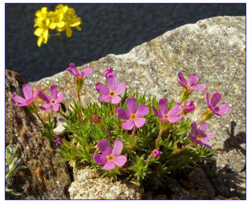
Below: D. montana <u>Sawtell Peak, Idaho</u>