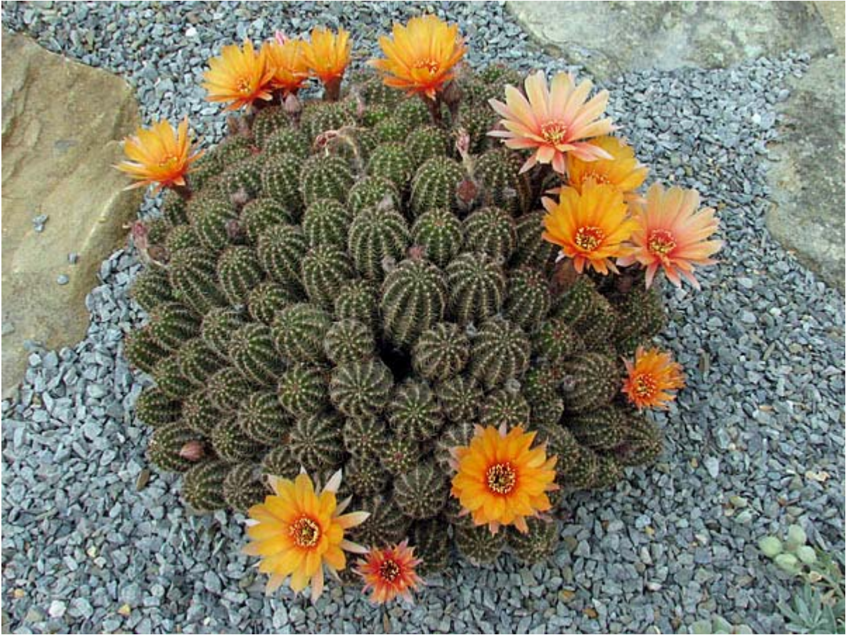
This is towards the end of the flowering season so there are few flowers out right now, but this is the kind of thing they can do at their peak: (this picture taken 3 years ago):