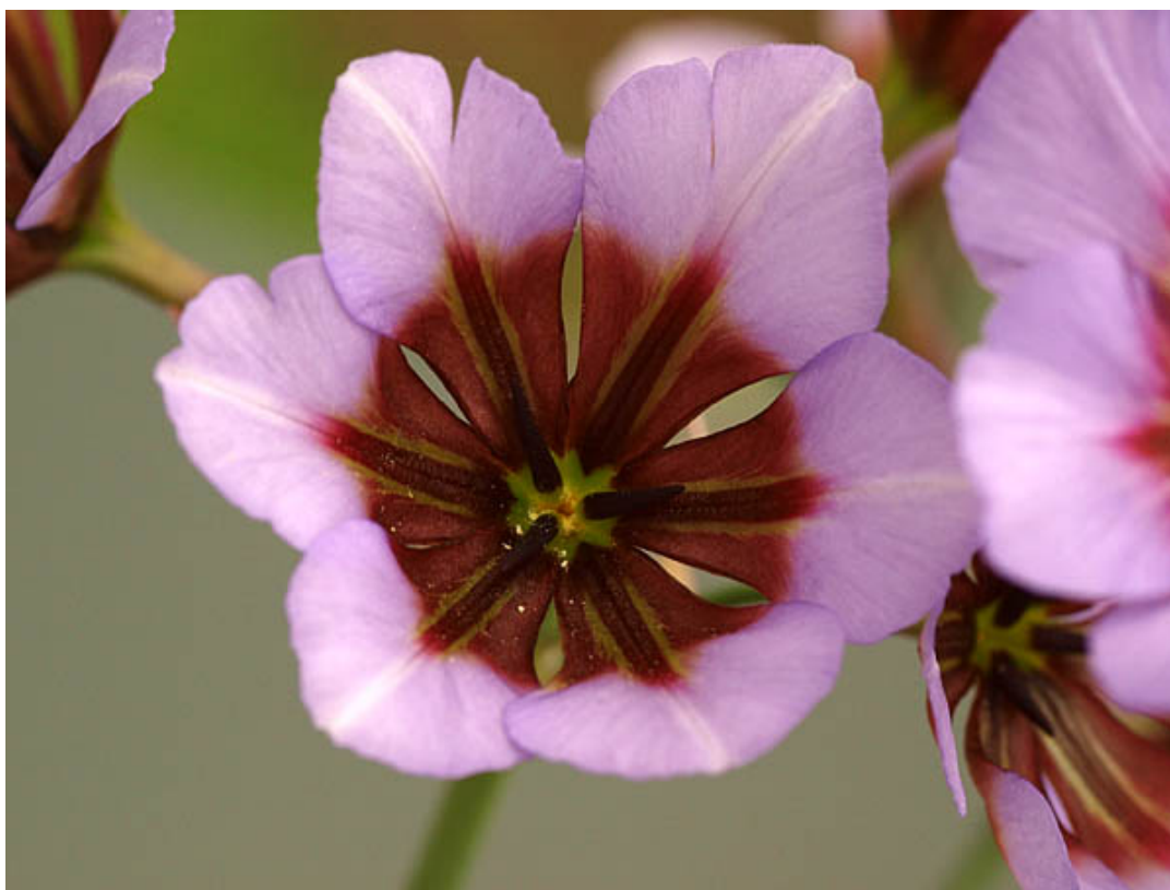
Above : Leucocoryne purpurea . Below : Leucocoryne coquimbensis

A genus I love is Leucocoryne , bulbous plants from South America and I grow these both at Wisley and at home. I use a straightforward mix of 50/50 John Innes and grit. They are winter growers, the leaves emerging in the autumn to grow through the winter with the flowers coming towards the end of their growing season, usually in April for me. I give them full strength high potash liquid feed from early spring until the leaves start to wither in early summer. I then keep them dry and warm through the summer dormancy. Here are some examples: