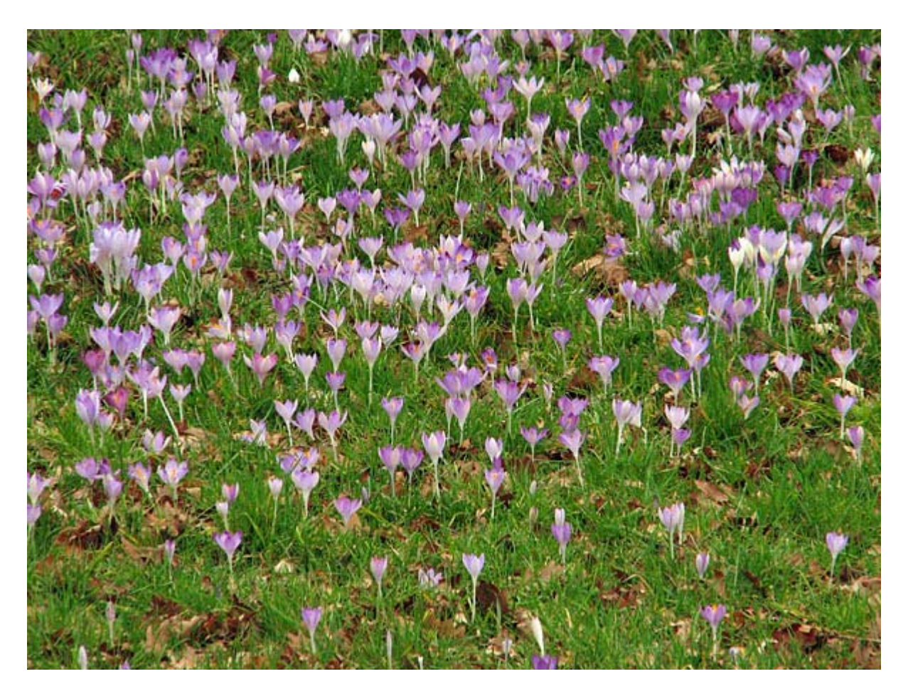
There are a variety of forms here. I particularly like the ones that have the petals tipped in a darker shade such as this: