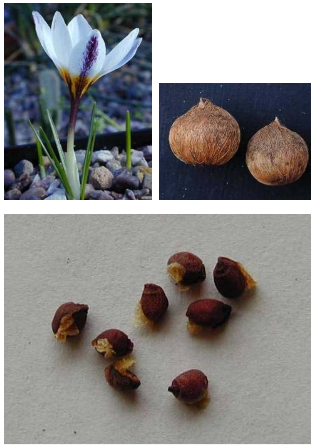
Crocus sieberi seed – actual size c1.5mm diameter