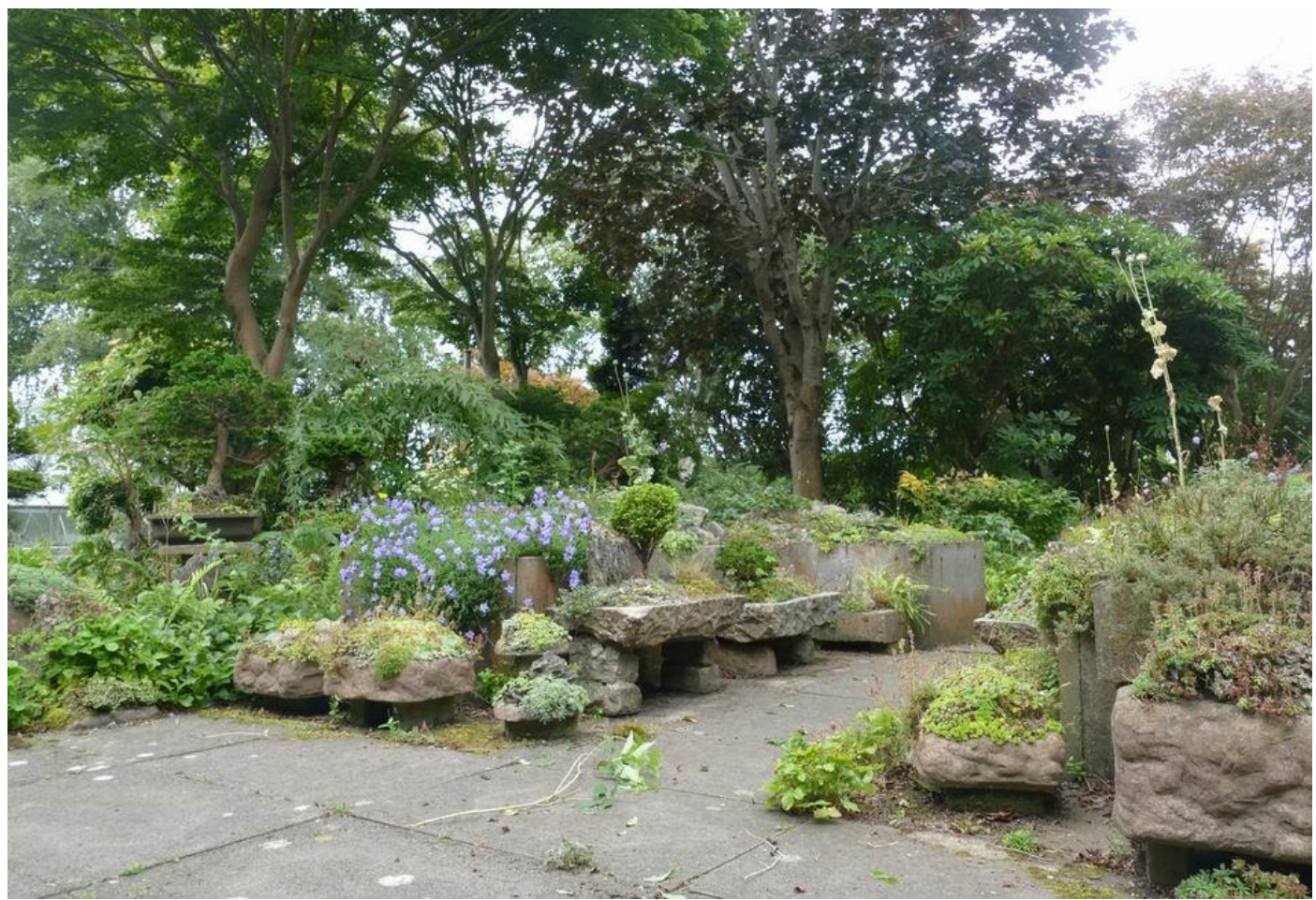
Troughs and slab beds.

Removing the dead twigs and some branches has allowed more light plenty into the centre of the bed which is stimulating new growth right down to the bases and the brave thing to do would be to cut them all down to almost ground level. Decisions, decisions! I am not sure I am ready for such an extreme change yet.