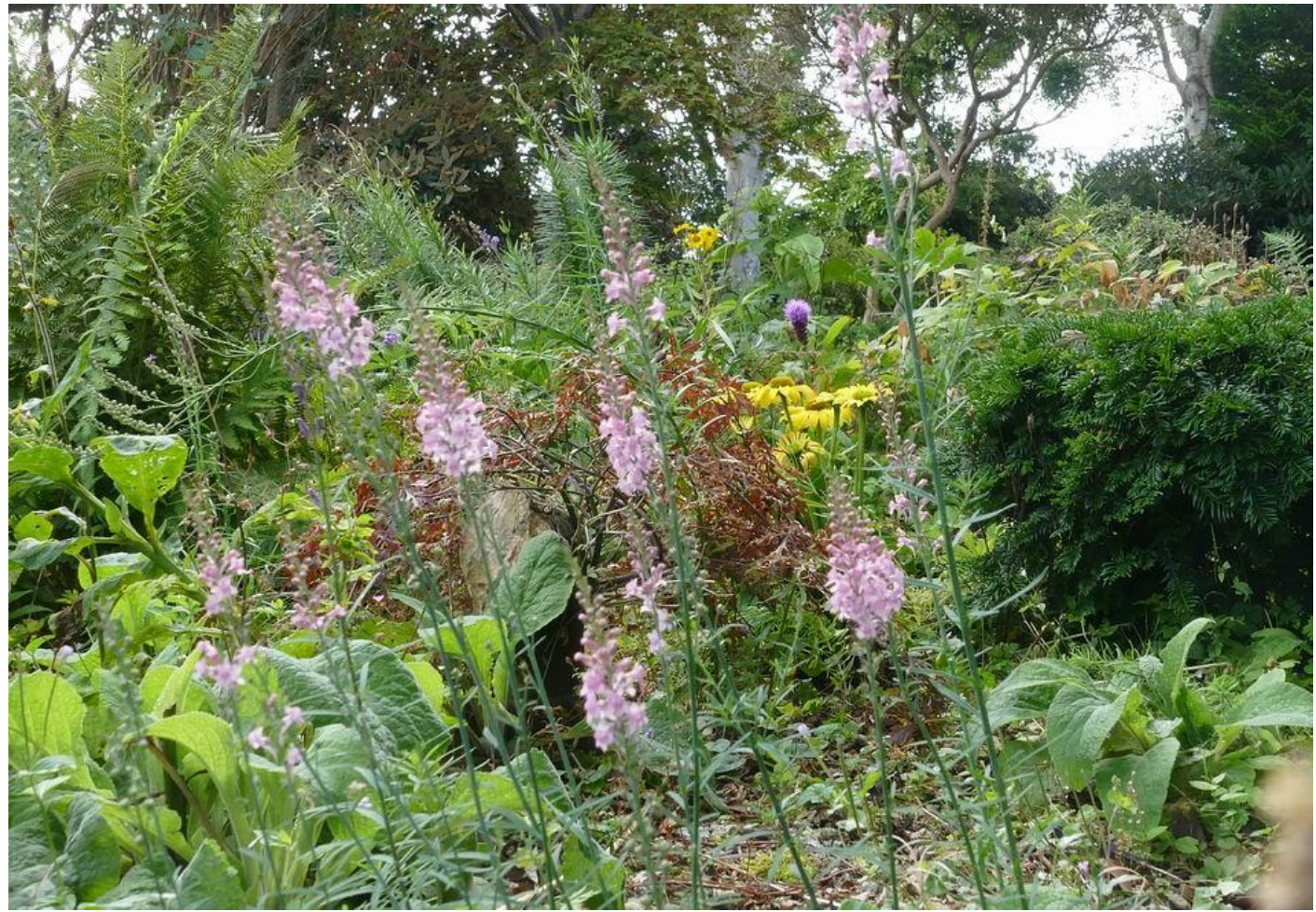
Can you spot the two Heleniums now at home among the wild planting of our garden where we hope they will thrive.