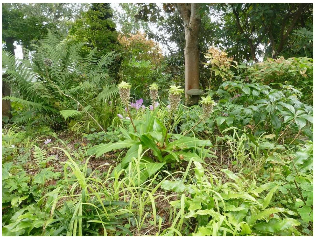
Eucomis bicolor grows happily with many plants including the spring and autumn flowering bulbs and it is from such combinations and associations of plants growing together that I get most pleasure.

Another plant that has benefited from the moister summer conditions is Eucomis bicolor which is displaying stronger growth than it has for a few years. This is a South African plant that has evolved with summer rain fall.