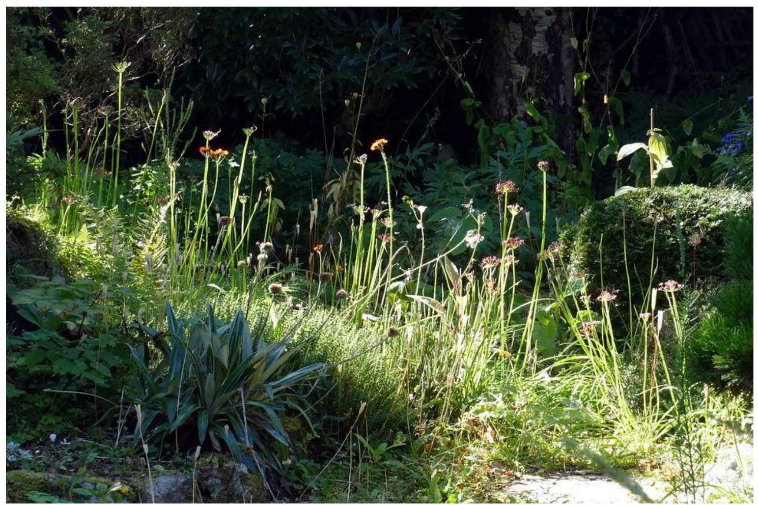
These Allium wallichii seeding around the paths along with Pilosella aurantiaca are at their most dramatic when they are illuminated by the low morning light.