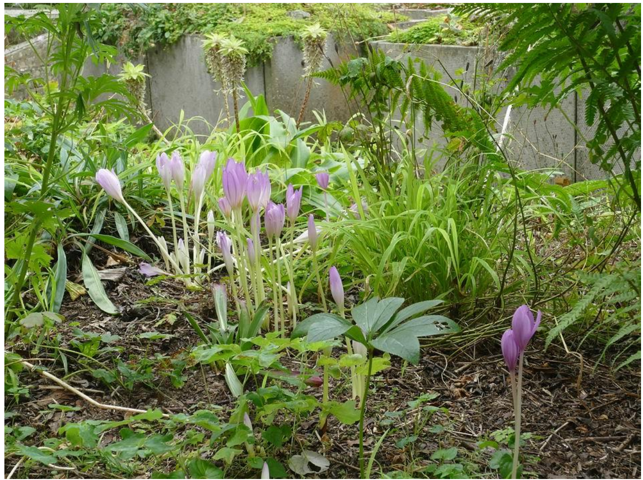
These Colchicum cultivars with Eucomis bicolor in the background and Cyclamen hiding in the grasses will soon be joined by the Crocus flowers to complete the autumn scene.

Autumn flowering Colchicum cultivars put on a display with a Veratrum fimbriatum in the background. Perfect specimen plants growing with the ground around them kept 'weed free' and clear, is but a collection of plants – plants growing in and among each other makes it into a garden.