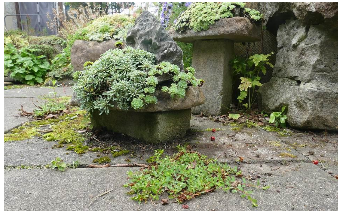
In addition to the plant shown above a self-sown seeding of Hypericum reptans grows here in the narrow gap between the paving slabs that cover this area.

The seeds on this Hypericum reptans have become even more precious to me this year after we lost a number of plants - a direct effect of the climate change we are all experiencing. I mentioned in a recent Bulb Log how we had lost all but a few plants from which I will collect and sow the seed carefully as soon as it is ripe.