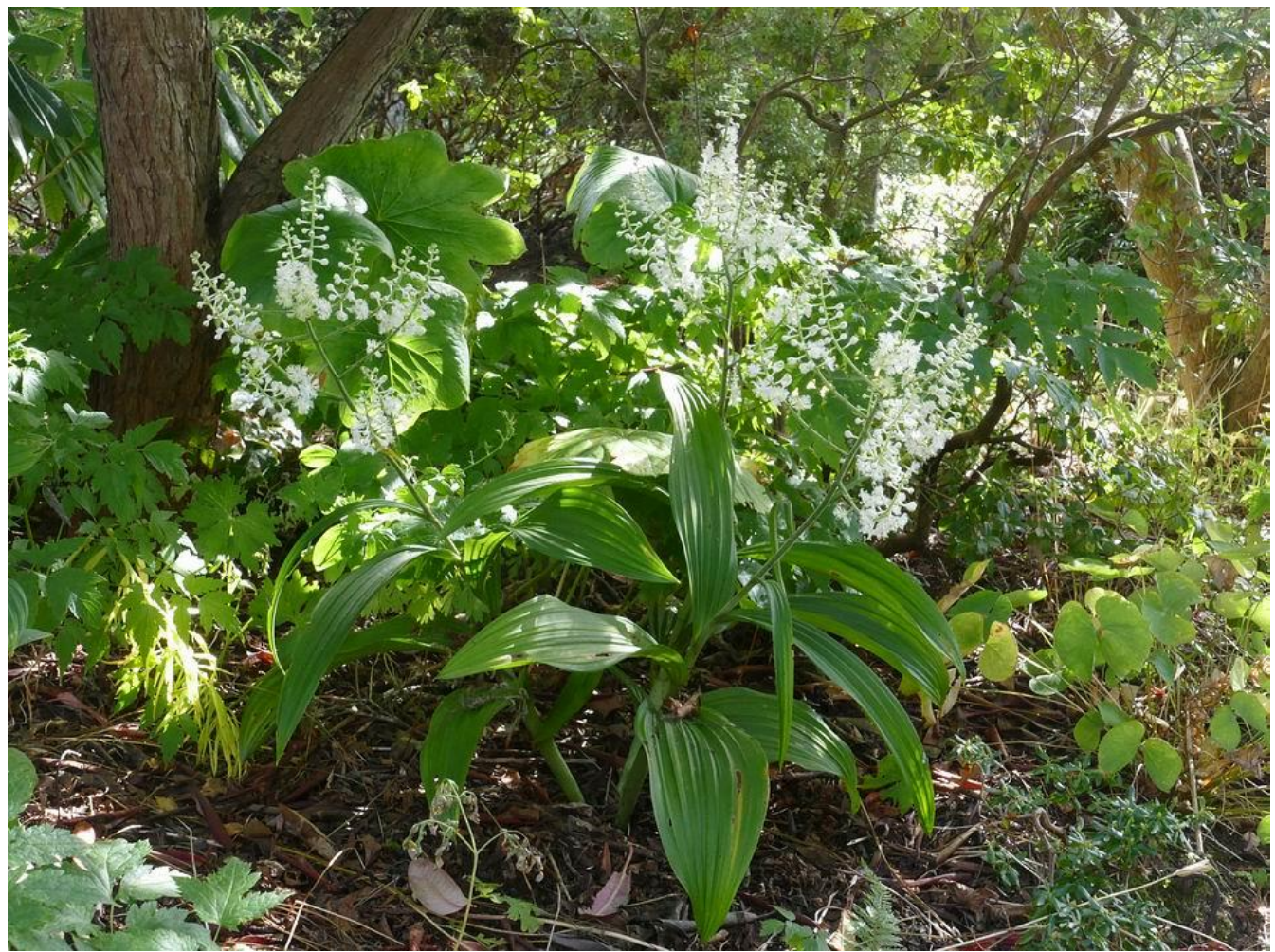
Veratrum fimbriatum gets bigger and more dramatic every year and brings flowering interest into the shady zone under Acers and Rhododendrons.