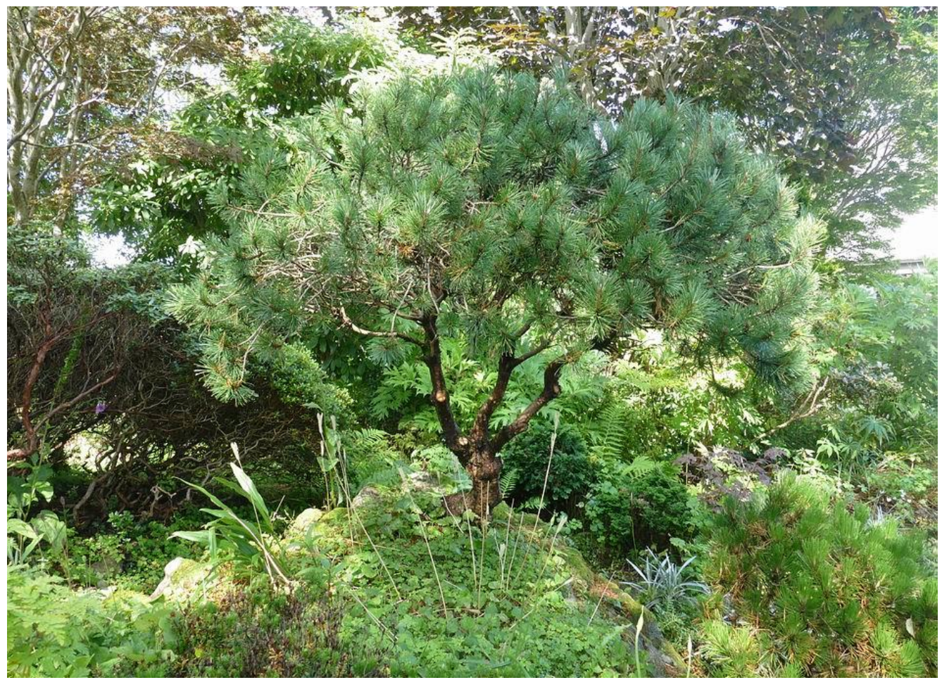
The canopy is now both raised and lighter and I will do some more pruning among the active green growth to try and encourage budding back which is not always successful with pine trees.

The tools come out and I start cutting back slowly; always standing back to check how it looks, remembering that what is cut off cannot be put back.