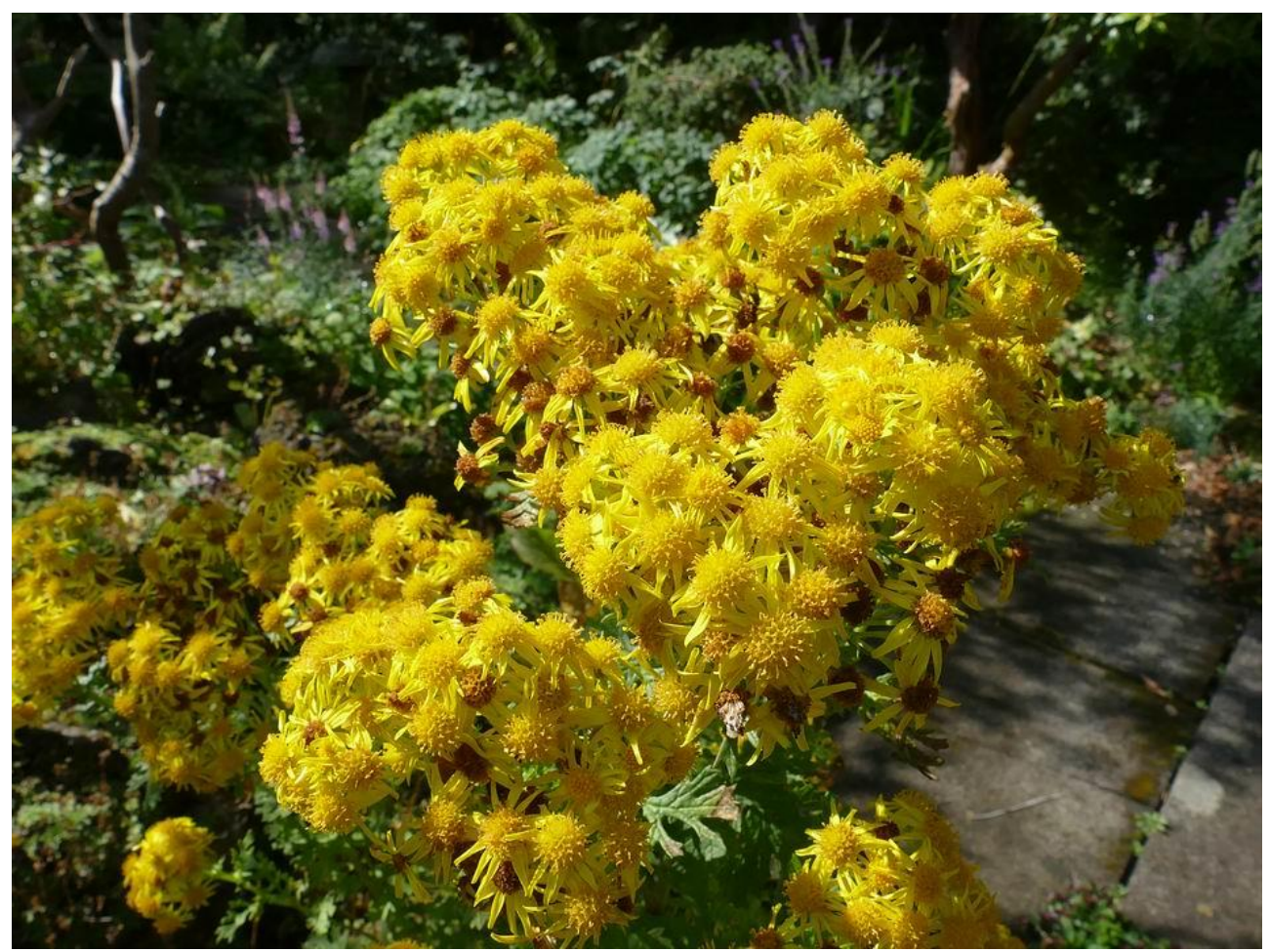
Last month when I wrote the Bulb Log I had Tanacetum on my mind and mistakenly used that name for this Ragwort however my slip was soon pointed out by a Forum Member and I quickly corrected myself and the Bulb Log with the correct name which is of course Senecio jacobaea .

Most of the plants in our garden arrived by seed. Some were blown in on the wind but most are introduced intentionally as we sow the seeds, however very occasionally, we visit a garden centre. A few weeks ago we did just that where we bought some of the late flowering golden daisy-like plants that will fit in with our plantings.