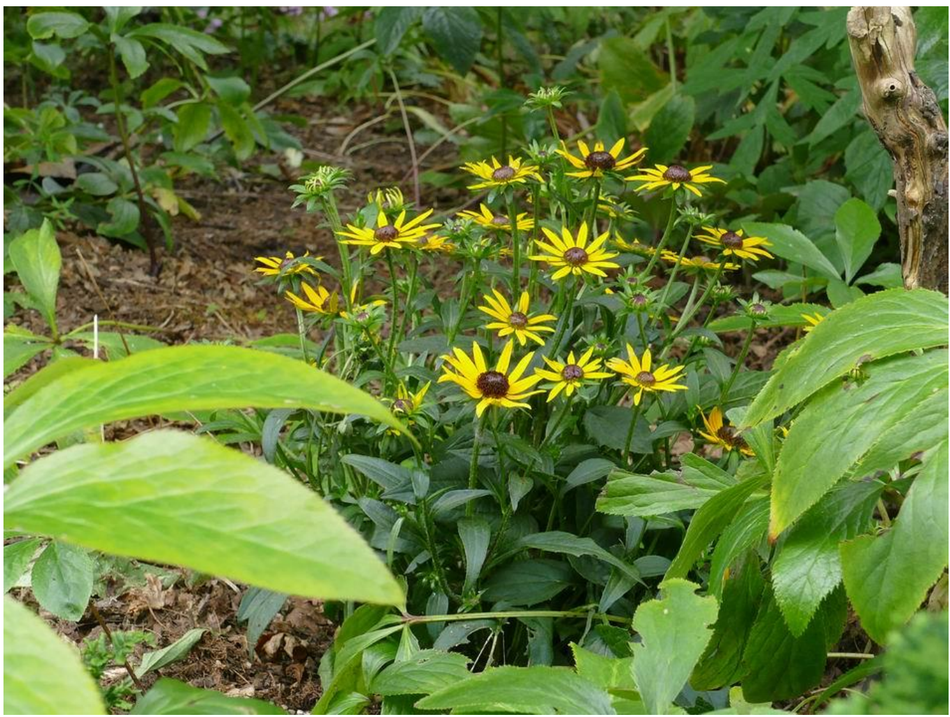
Rudbeckia 'Little Goldstar'

My hope is that will get seed from the two Helenium but I am not so sure if the cultivar Rudbeckia 'Little Goldstar' below will set seed.