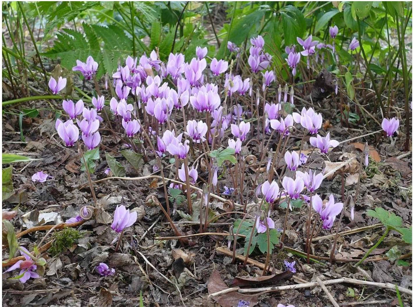
Now for the three of the most useful groups of autumn flowering bulbs that for the next few months will delight us in the garden starting with some Cyclamen hederifolium.