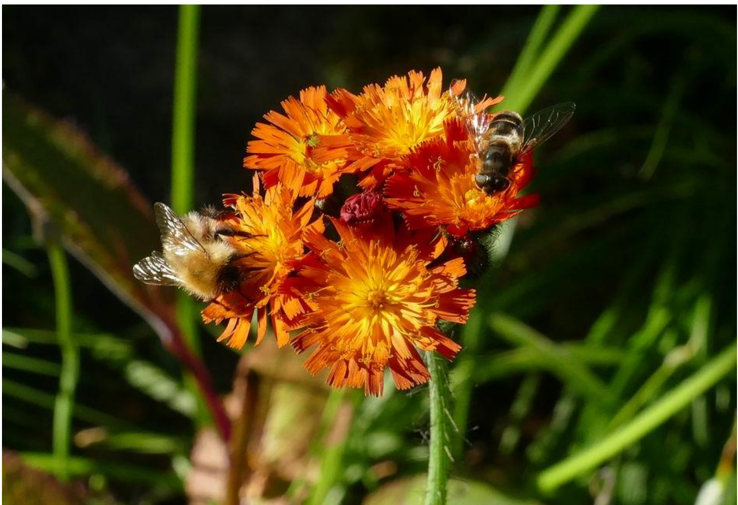
Pilosella aurantiaca (Orange Hawkweed)