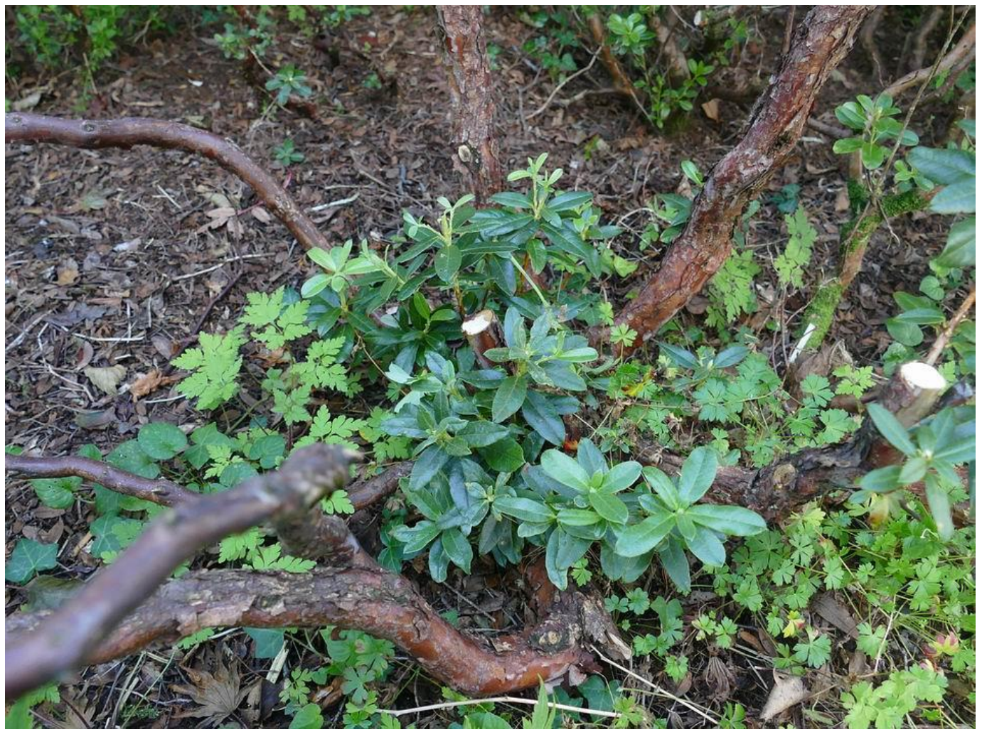
Unlike the pines many rhododendrons, especially these small leaved types, will bud back on old wood. Removing some branches allowed enough light back in to stimulate adventitious buds at the base of the plant where there is now a mass of new growth. I am encouraged to gradually cut more back rejuvenating this bed.

After forty years of growth the 'dwarf' rhododendrons are not so small - their growth is up to 1.2 metres high and even wider. The spread of growth extended out almost blocking off a narrow path so over the year I have cut some branches back and removed some of the old wood lower down, which had died due to lack of light.