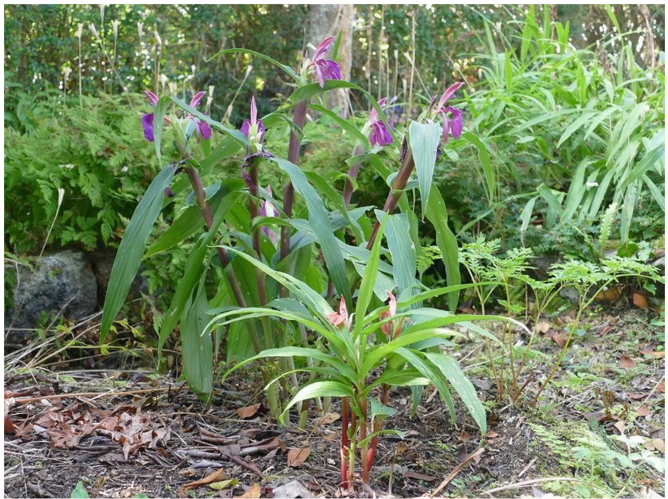
Here it is again dominating the scene behind the smaller Roscoea 'Red Gurkha'.

Here you can see the roscoea in front of the Rhododendron with a Codonopsis flower just visible peeking out from behind the Roscoea 'Harvington Imperial'. This Roscoea is one of the most reliable in our garden and it is also growing well in this year's abundant summer moisture.