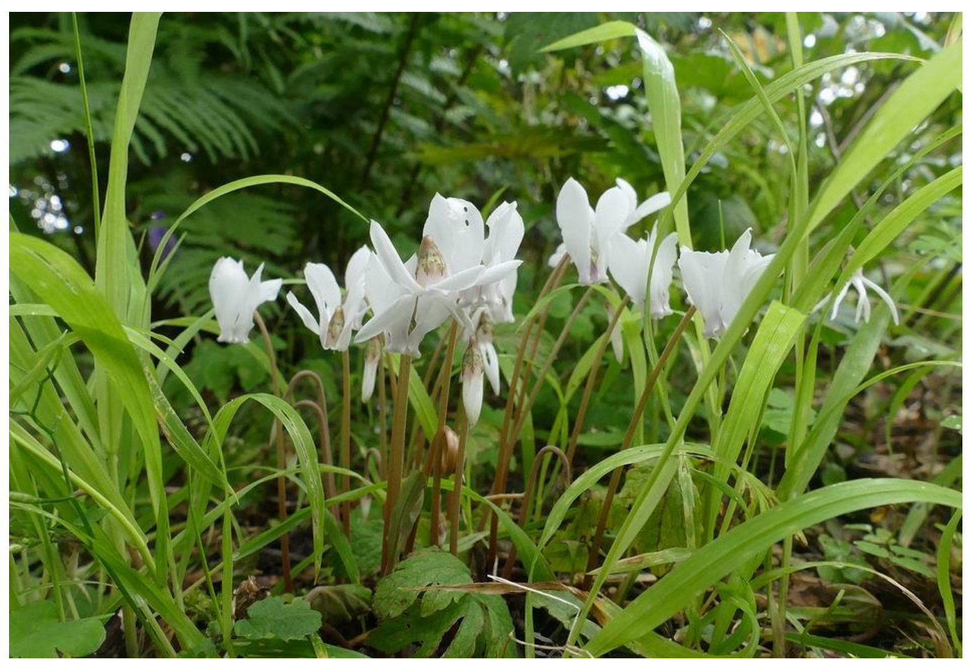
I like seeing them best not as isolated specimens but growing among other plants in the wildness of our garden.