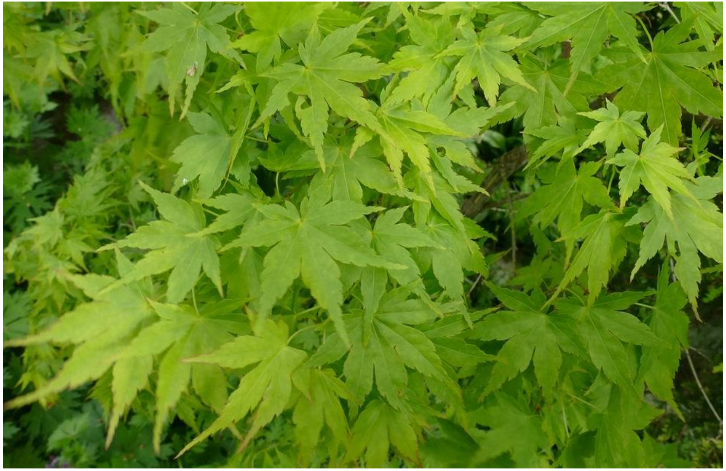
Acer japonicum leaves.