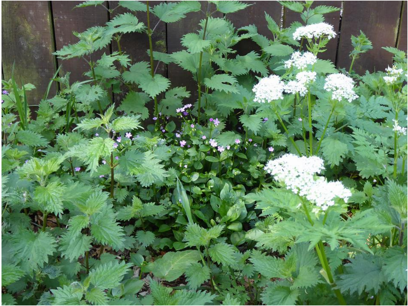
Nature – The small pink flowers are Claytonia sibirica introduced from Pacific North America around 1838 and now naturalised in damp shady places.