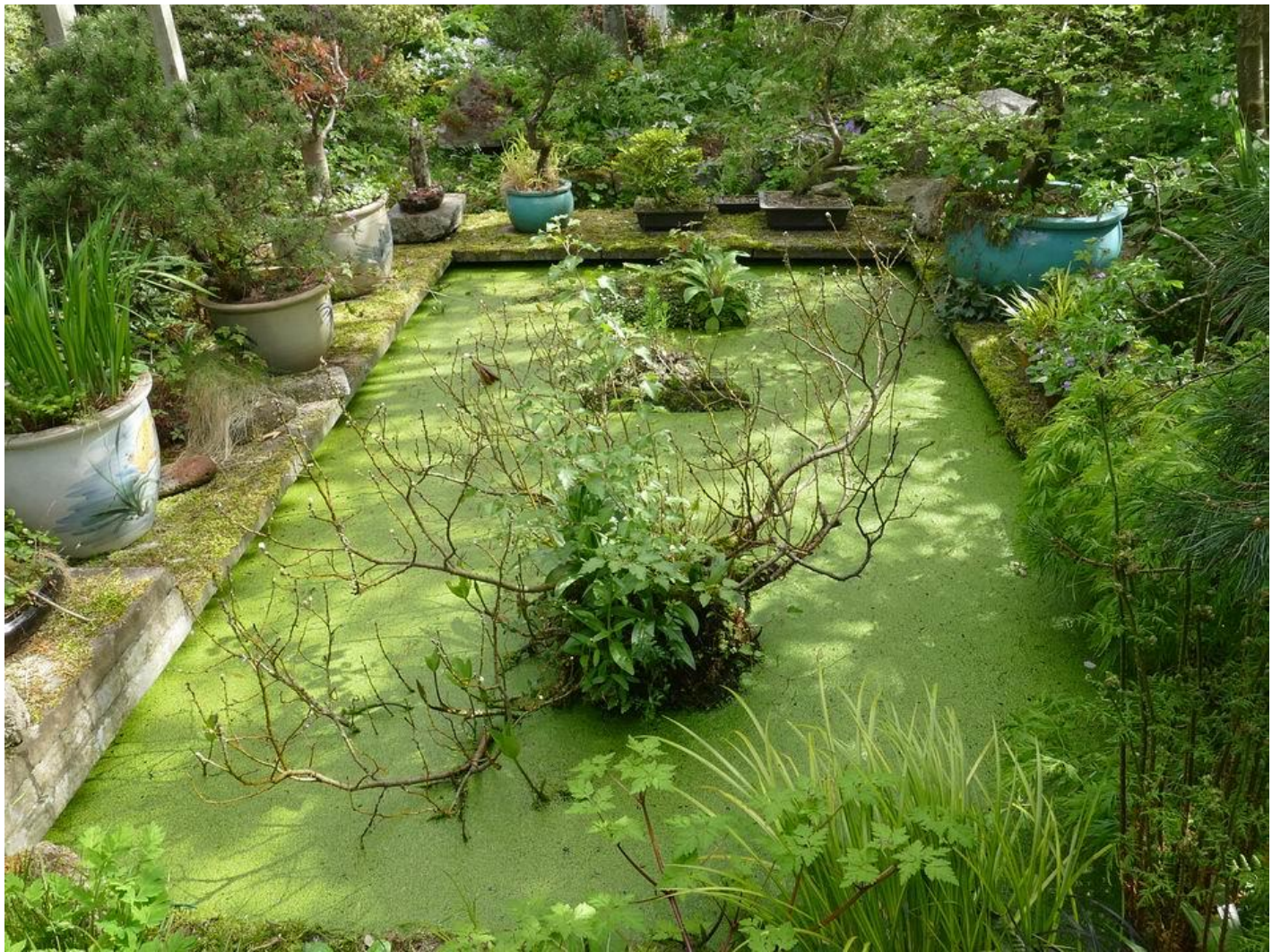
Even the pond turns green with the Duck Weed!