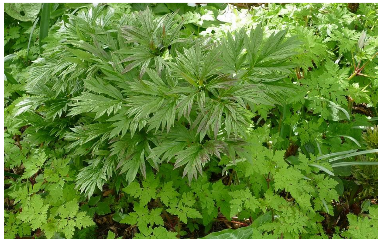
We use a wide range of plants in the garden mixing up the unusual with those often considered 'weedy' - all are happy and grow better because they are in mutually supporting communities.