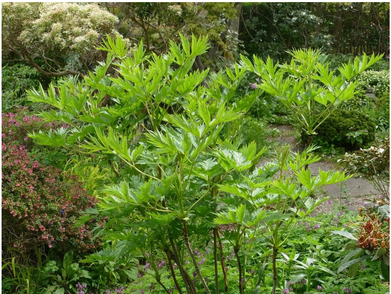
Tall plants such as tree peonies are attractive as they rise up through the lower green carpet.