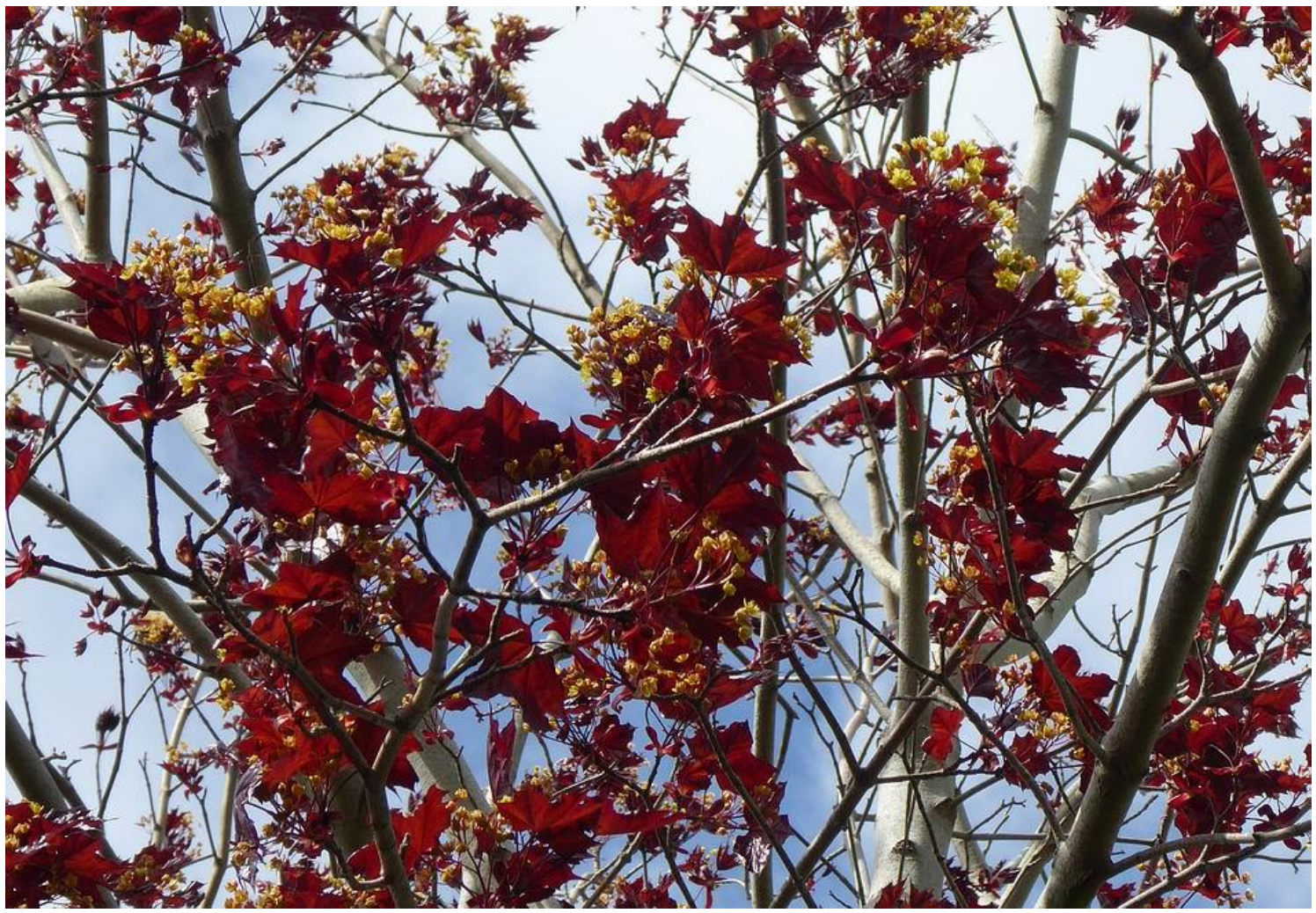
It is not only leaves that are above our heads many of the trees such as this Acer 'Crimson King' are covered in flowers which are buzzing with bees and other insects feeding on the pollen.

back to encourage branching, which I will continue to do this year, I hope to build a new head and give this fifty year old plant a new lease of life.