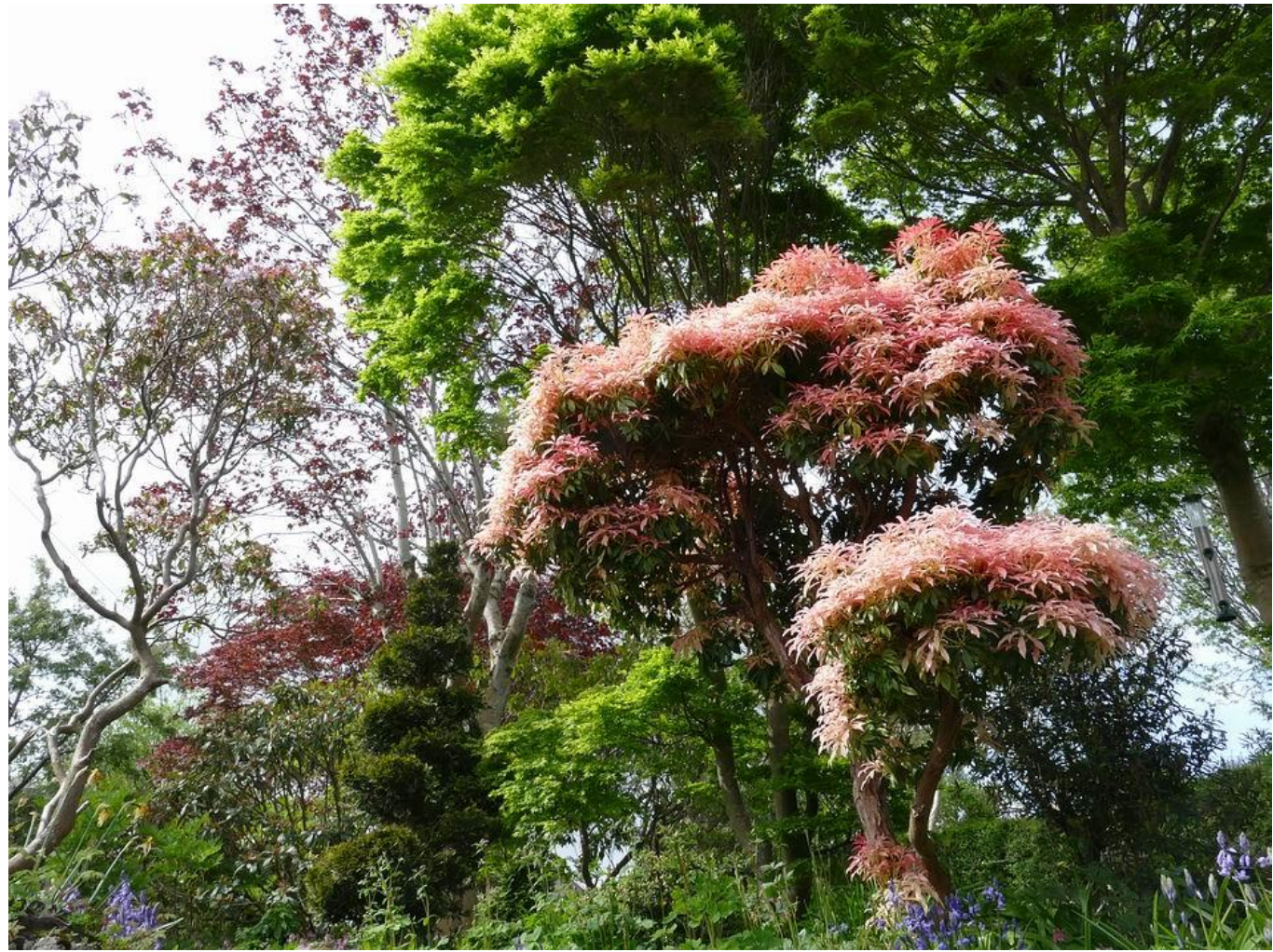
Not all foliage is green: some trees have red leaves while the new leaf growth of this Pieris emerges bright pink, turning cream before it eventually takes on a green colour.