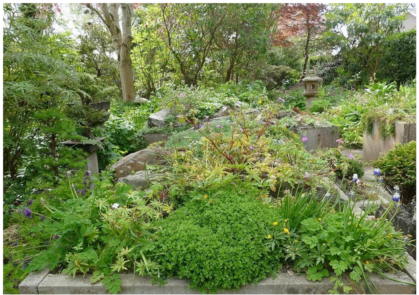
The garden is going green as the growth of new foliage is appearing across the many habitats such as on these smaller plants in the raised slab beds.

Selected low growing dwarf willows bring a range of foliage from tiny green leaves to relatively large silver ones.