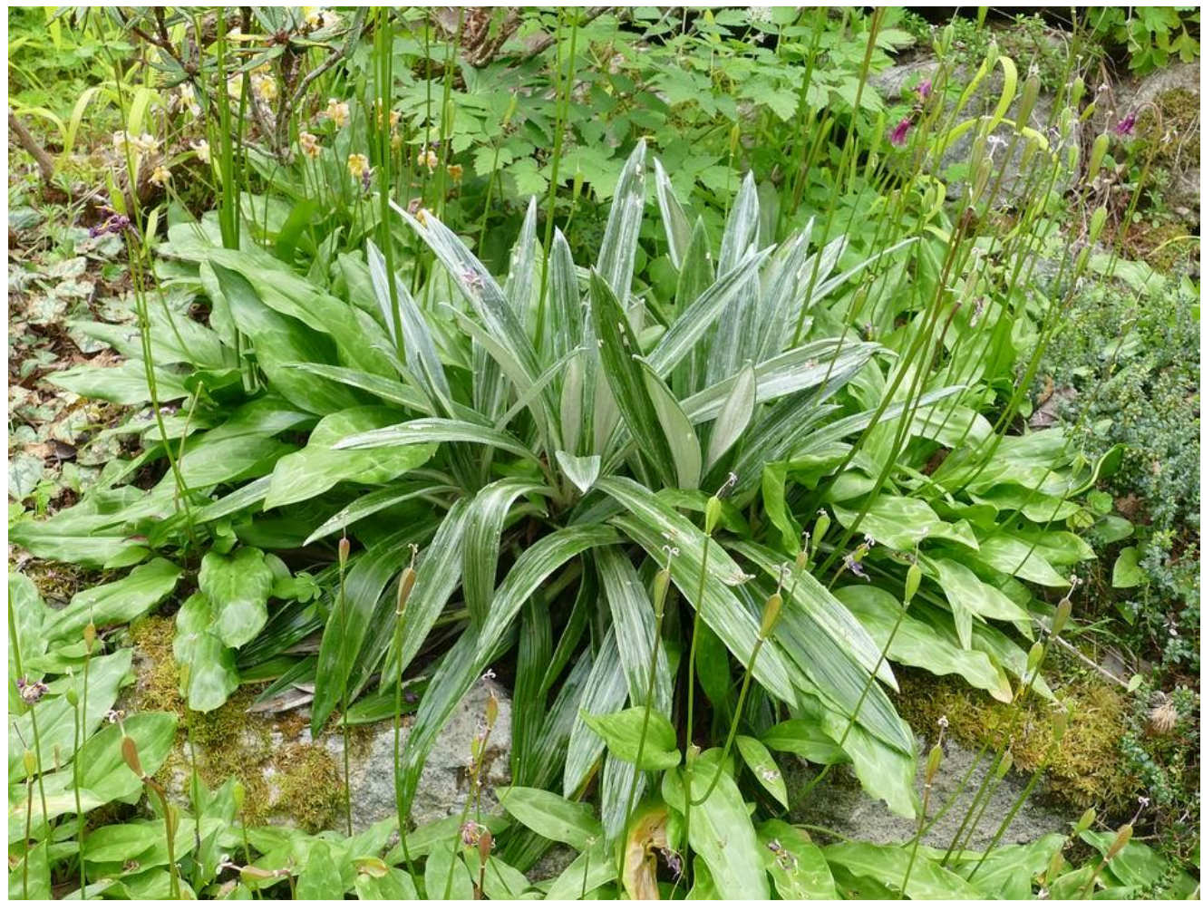
Evergreen plants such as Celmisia will give interest and structure all year round but they still put on a display when their fresh new foliage emerges in the summer.