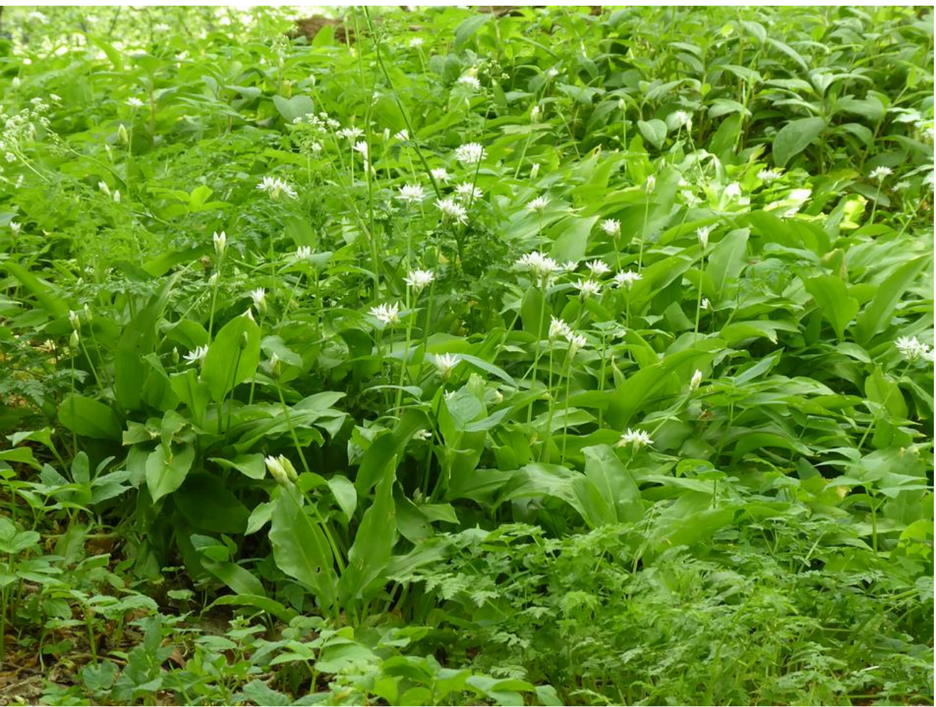
Allium ursinum: observing the way plants are growing in Nature.