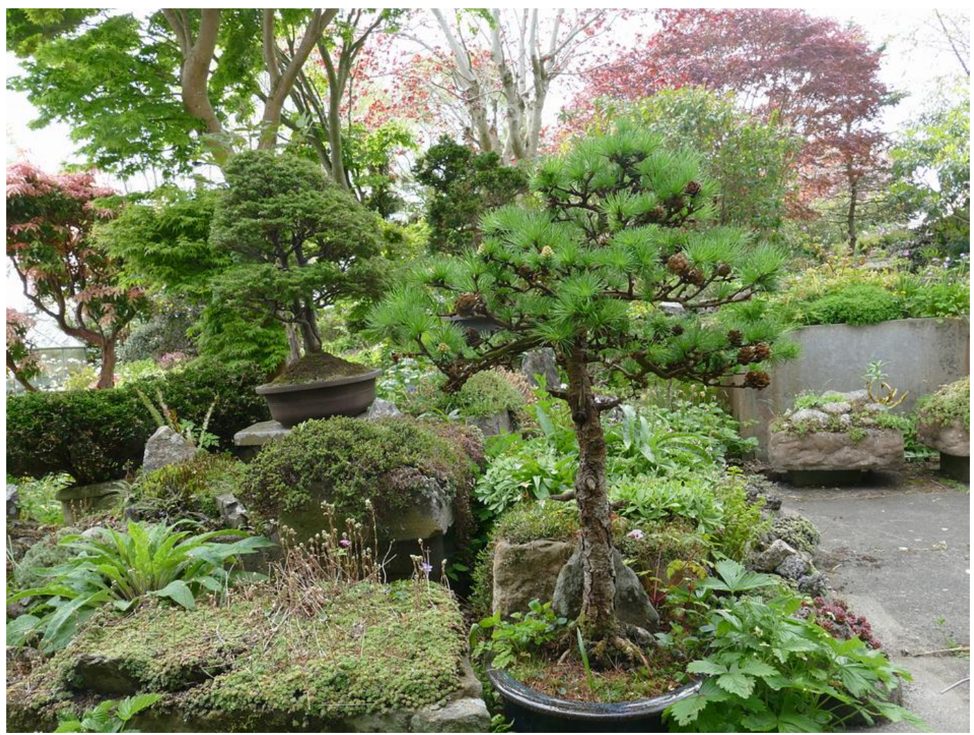
And not all trees are above our head as this bonsai larch has spent its thirty plus years growing in a pot.