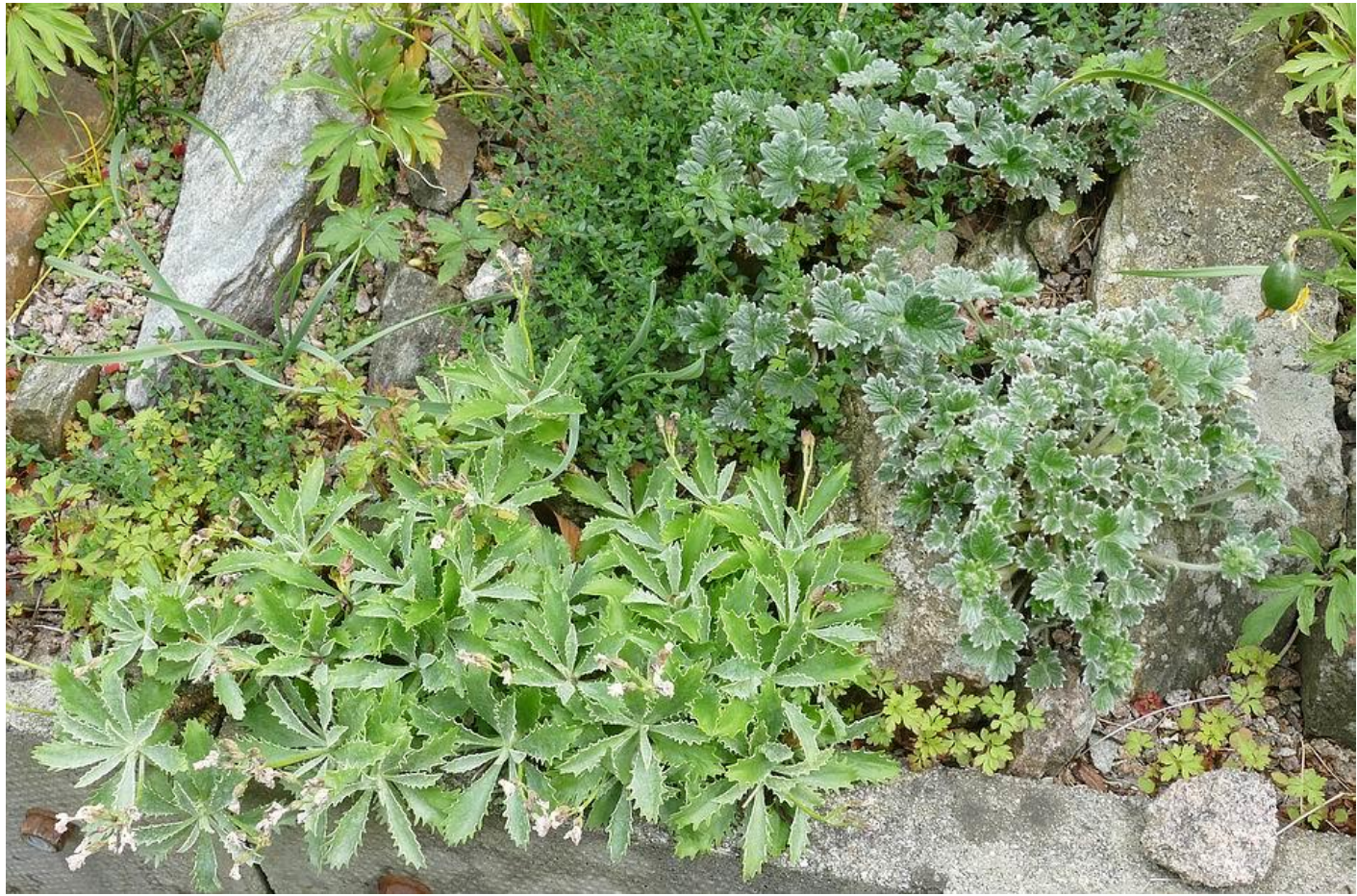
Primula marginata and Potentilla pulvinaris