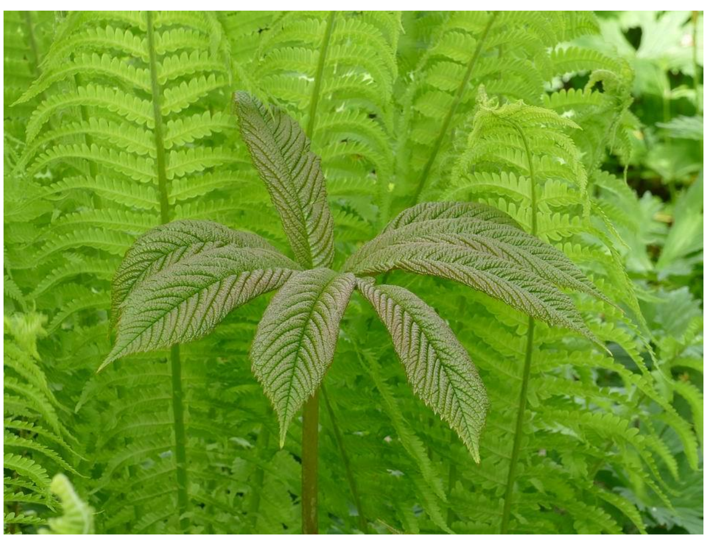
Growers should use a wide variation of foliage when planting their gardens where stunning effects can be created whether by design or accident as here where a Rogersia sp. grows among the ferns.