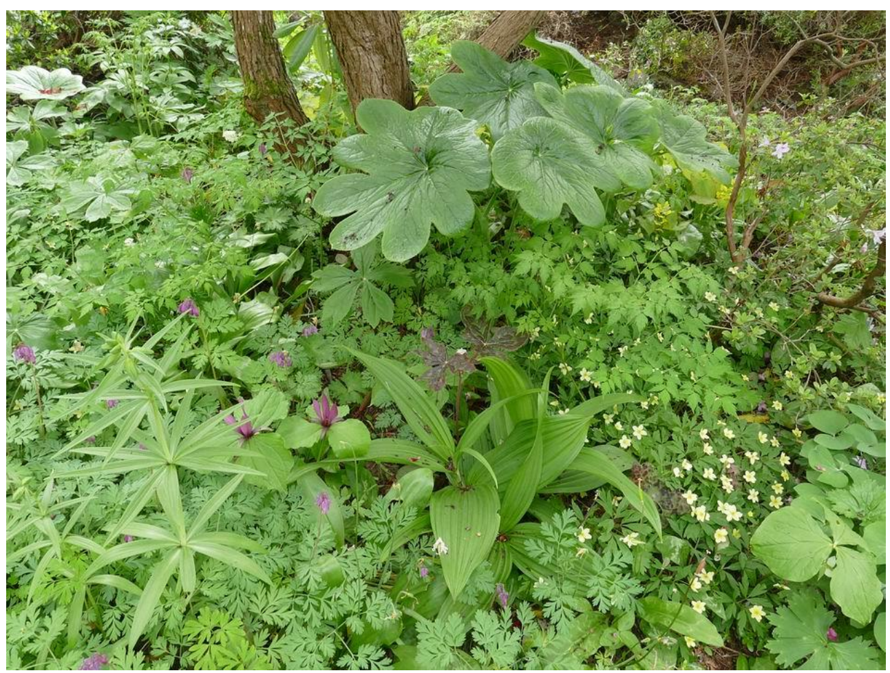
Garden – select plants with different types of foliage and plant them in groups to provide interest.