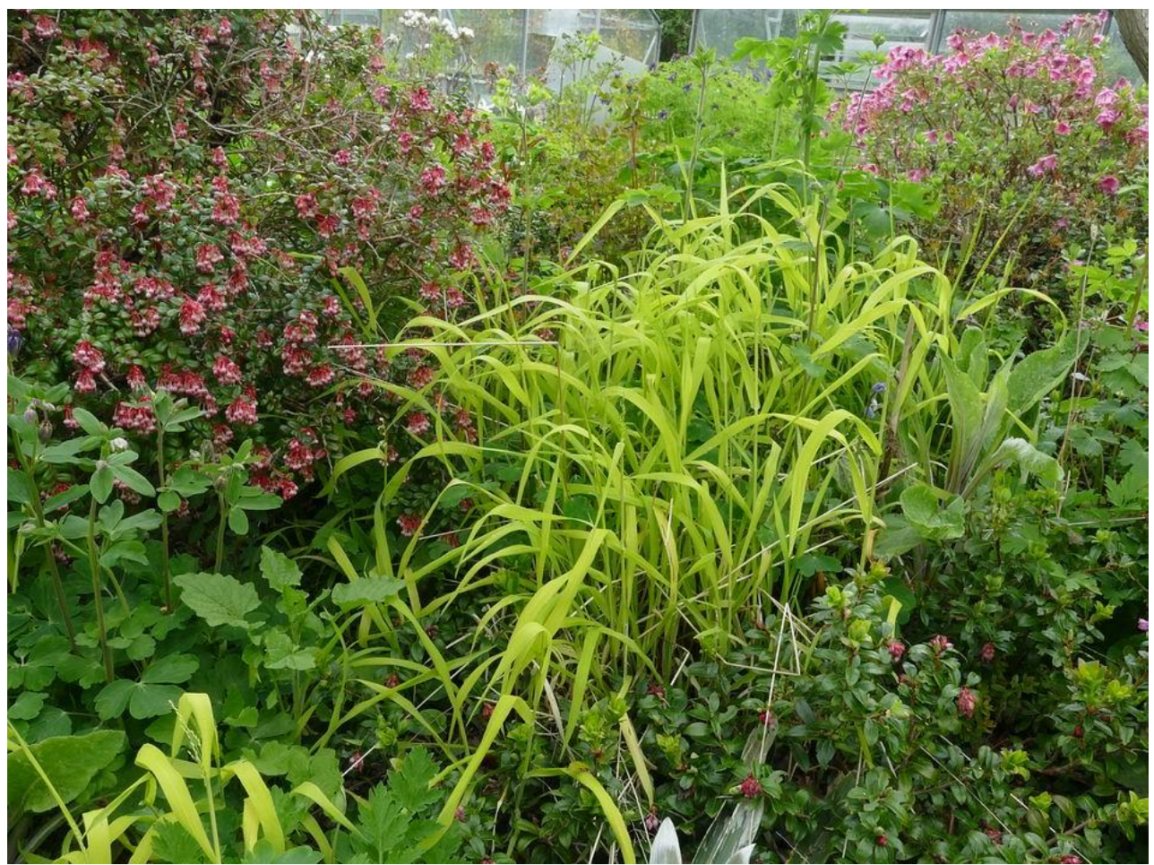
Milium effusum 'Aureum' – Bowles' Golden Grass is allowed to seed around growing in a natural way among the bulbs and shrubs – it is easy to remove any unwanted plants.