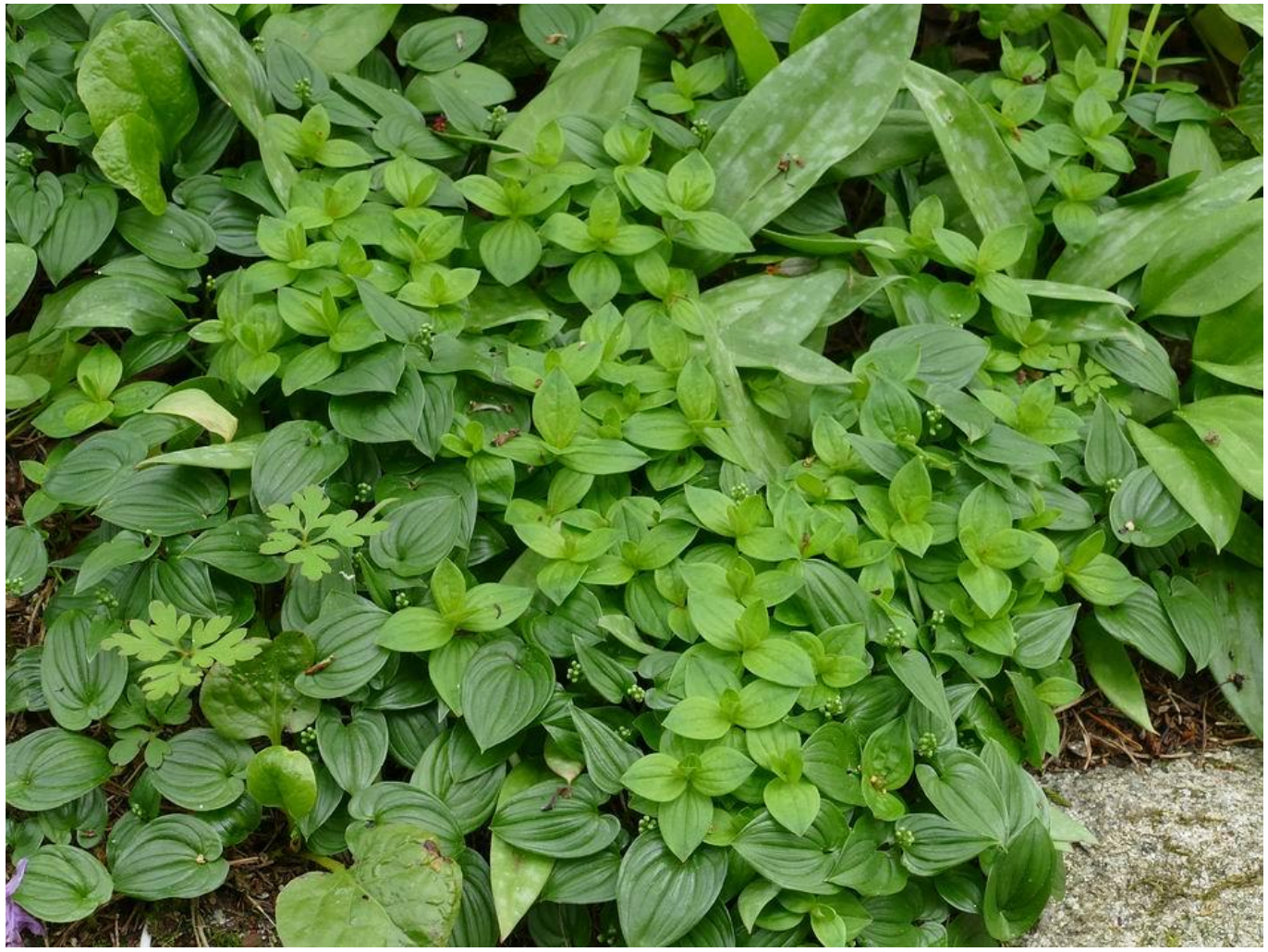
Maianthemum bifolium yakushimanum growing with Cornus suecica.