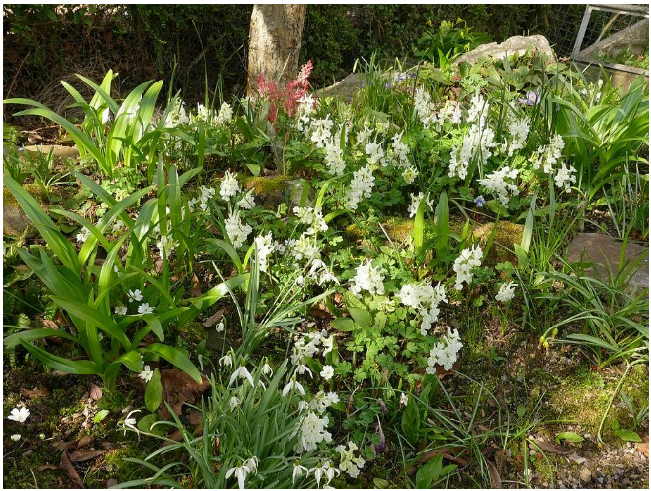
As the snowdrops fade, Corydalis grows in perfect harmony with the small white, sometimes pink washed, flowers of Hepatica nobilis var. pyrenaica flowering in advance of many other small bulbs that will soon appear.