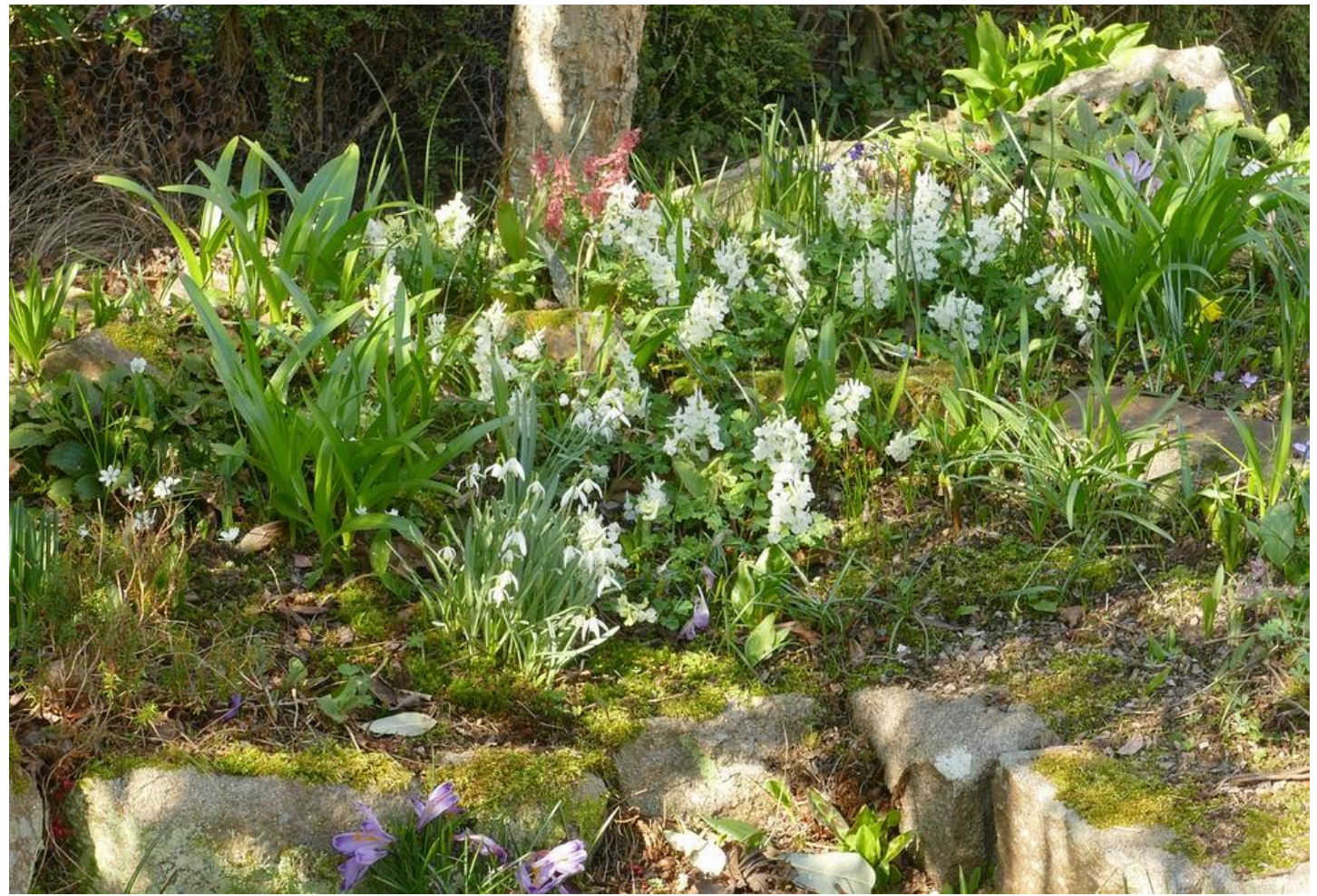
None of the Corydalis malkenis in the garden were planted as a tuber, in fact I can't remember when or how we first introduced it, they are all now self-seeded - sometimes I do help by gathering and scattering some seed to introduce it to other areas. It will start flowering from seed in two or three years and then it is self-perpetuating. Here it is growing in quite dry, very gritty soil in the shaded leg of the rock garden.