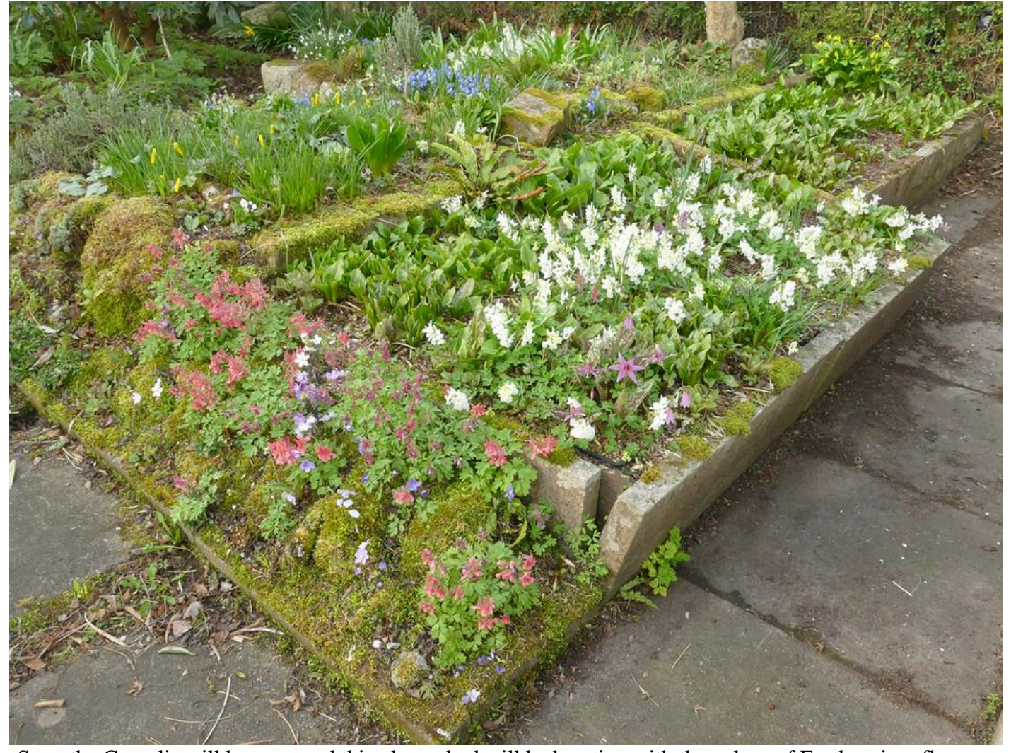
Soon the Coryalis will be gone and this plunge bed will be bursting with the colour of Erythronium flowers.

plants, that are also gentle with their neighbours, often bring a benefit that supports and encourages a wider plant community like we so often see in natural habitats.