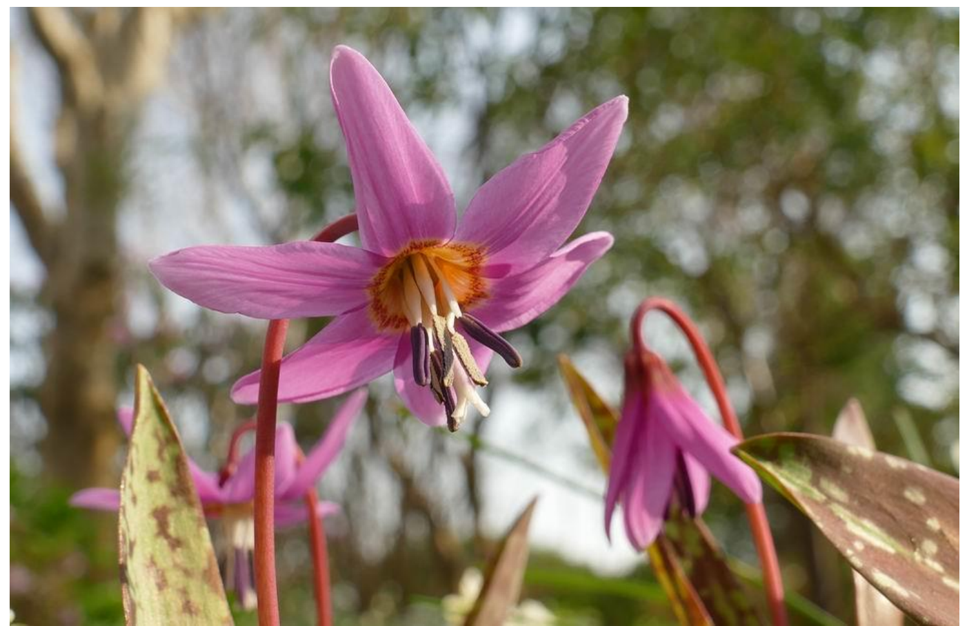
The typical and familiar forms of Erythronium dens-canis have dark violet anthers, sometimes showing brown when they dehisce and pollen is ripe.