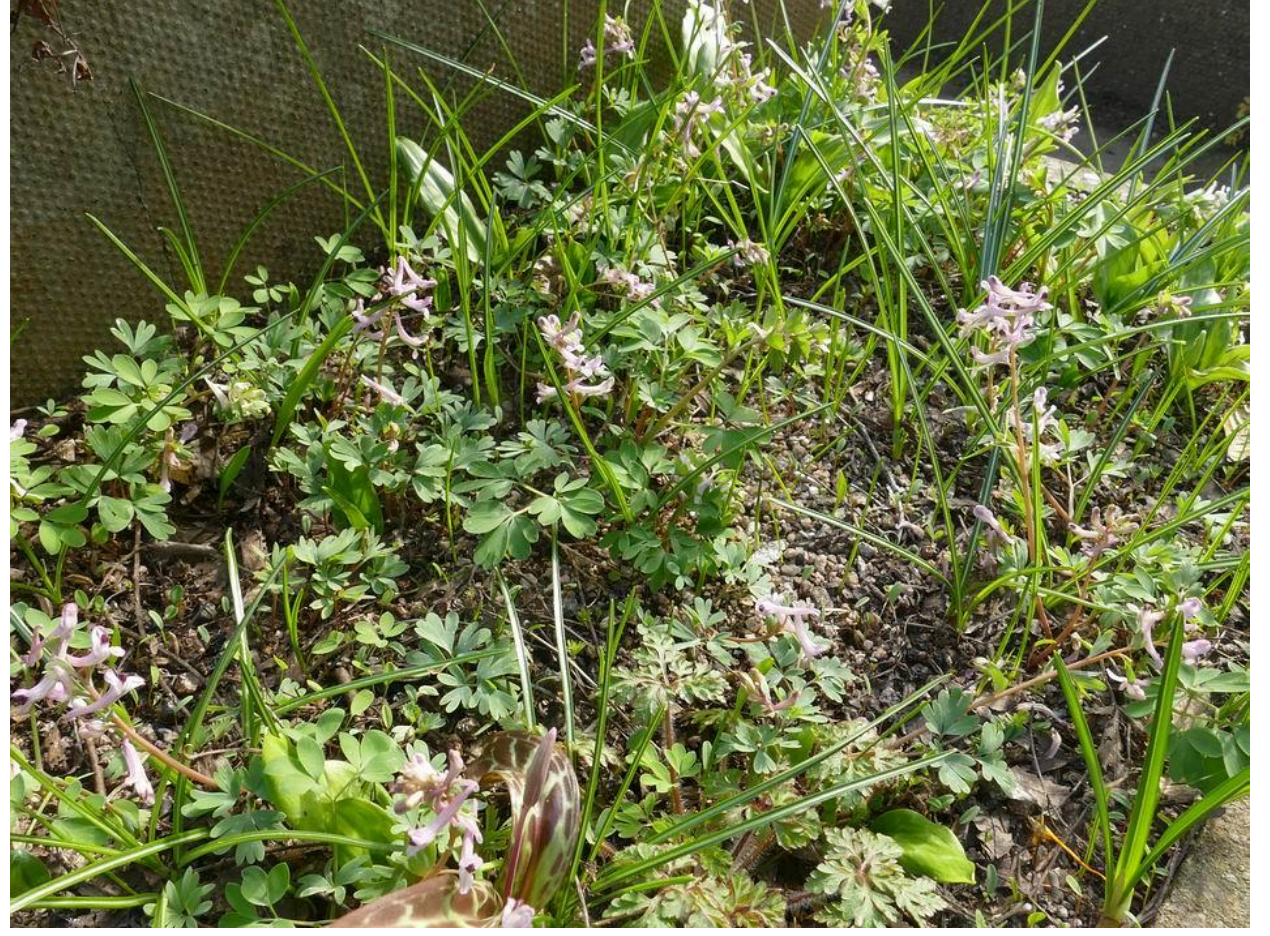
weeks, will survive in the ground until it germinates this time next year.

The long thin leaves of Crocus nudiflorus, an autumn flowering species, also volunteered to grow in this bed - bringing us flowers when all the erythronium are back underground and the bed would otherwise be bare of plants. The long thin seed pods have already formed on the earlier flowering Corydalis paczoskii and the seed, which will be shed within