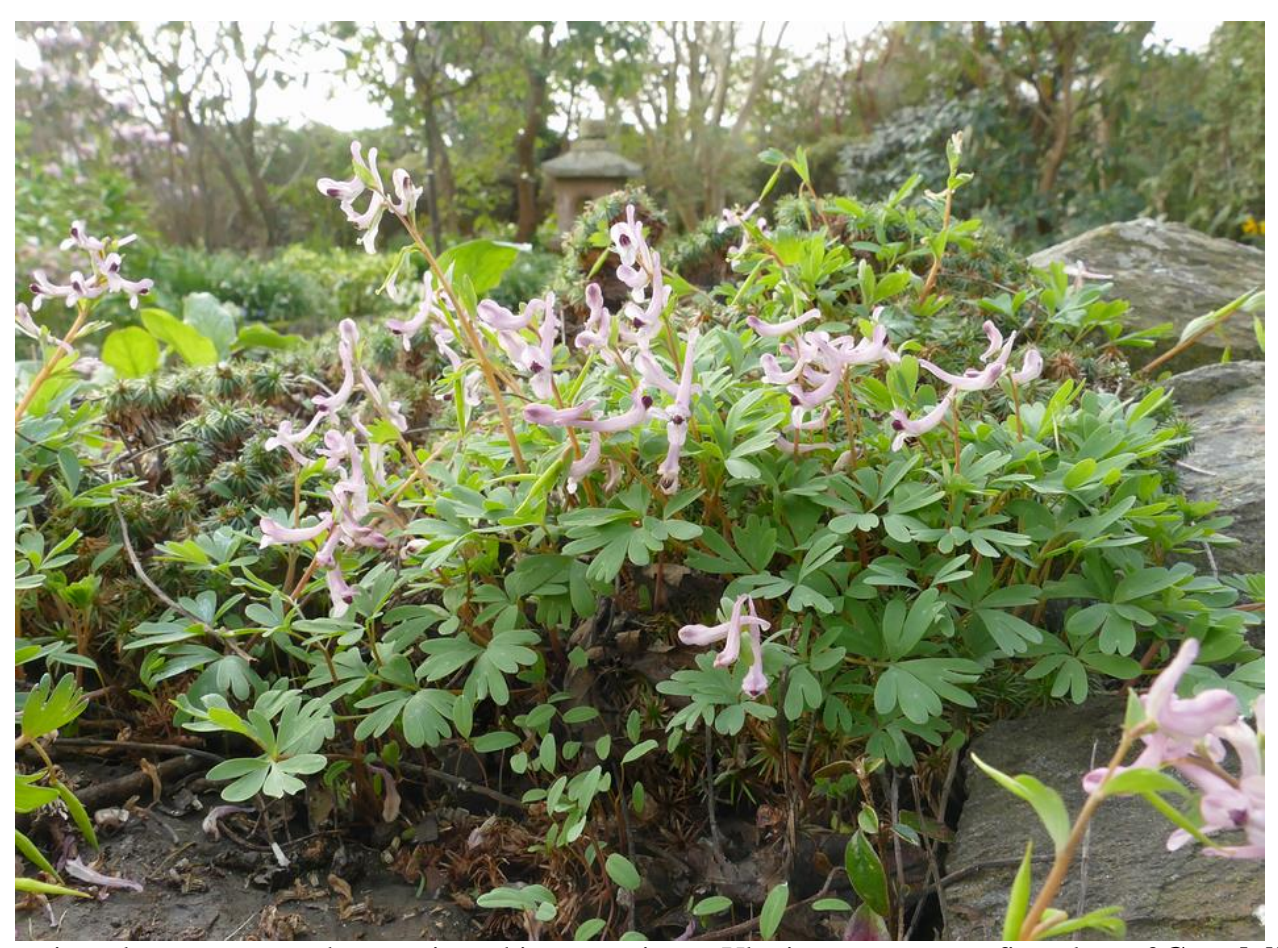
Now let me introduce you to another species - this one native to Ukraine - we got our first plant of Corydalis paczoskii in 2007 and since then, being self-compatible, we have encouraged it to seed freely around our garden.