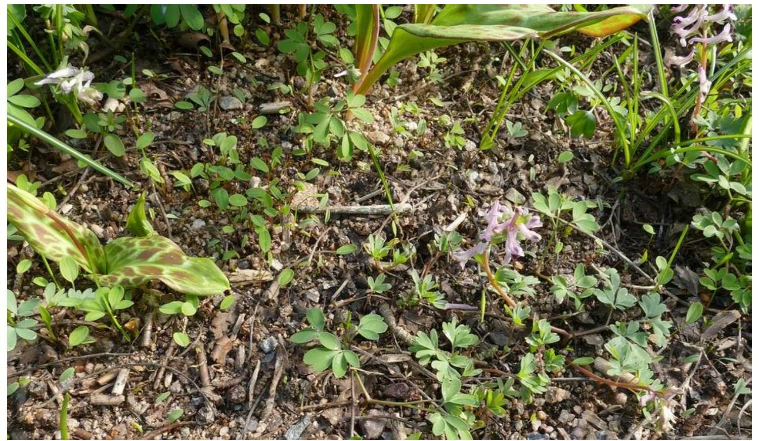
A group of first year seed leaves can be seen in the top left of this picture and this success is what leads some people to describe both Corydalis paczoskii and Corydalis malkensis as a weedy species. Should you wish, it is very easy to prevent excessive seeding by removing the stems as the seed pods ripen.