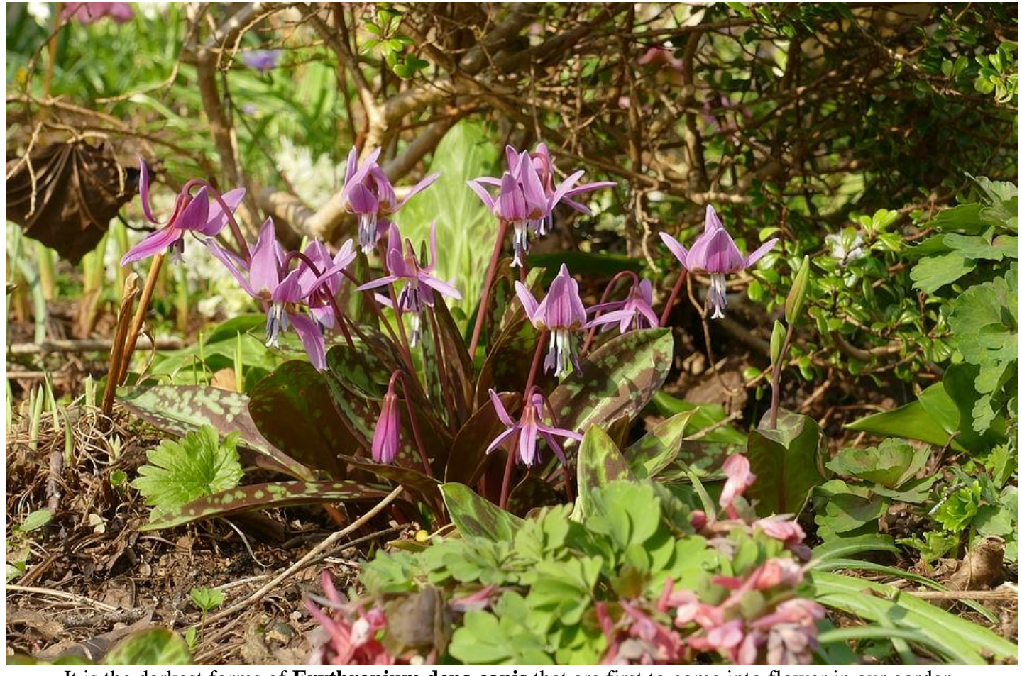
It is the darkest forms of Erythronium dens-canis that are first to come into flower in our garden.