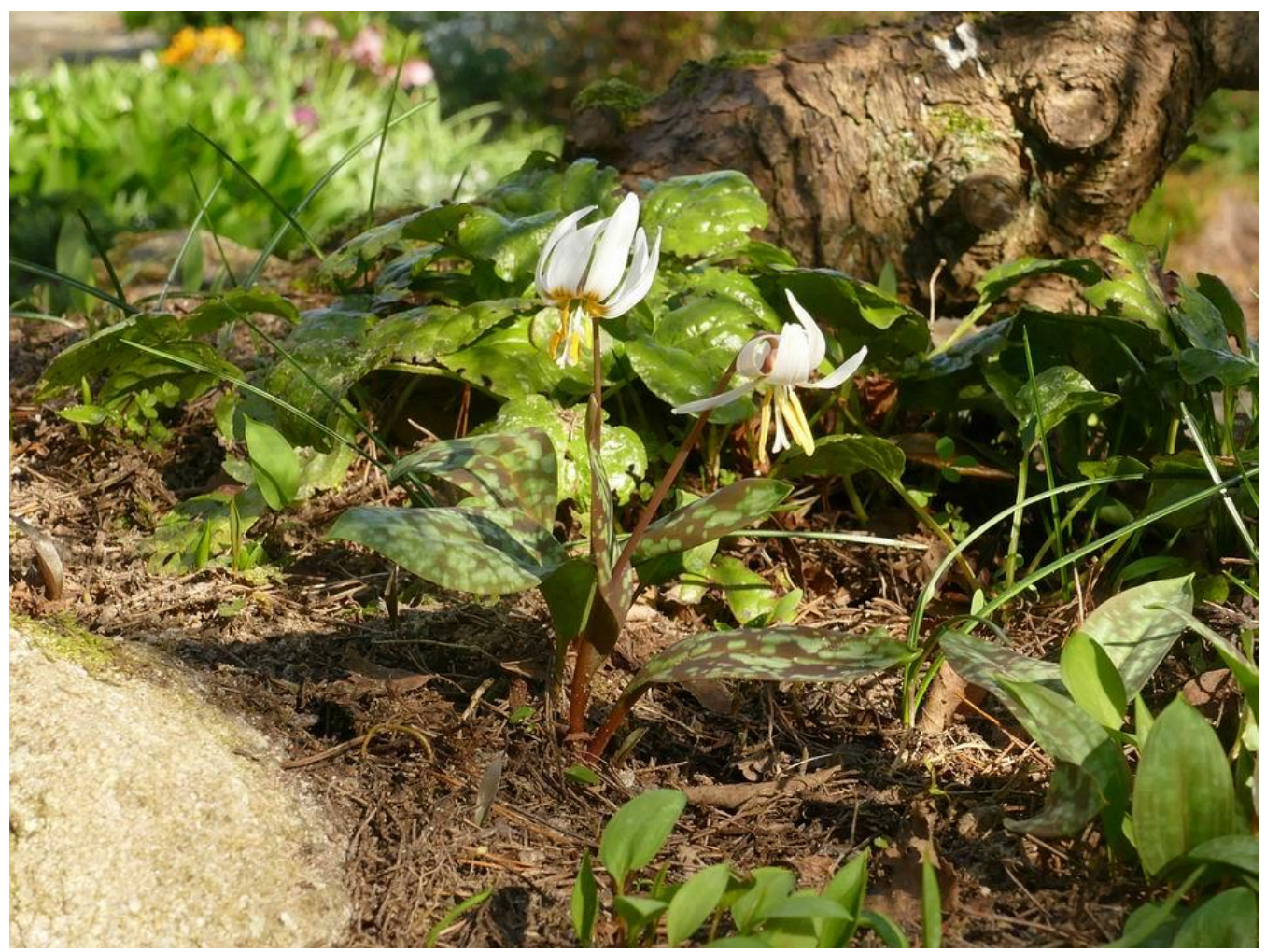
I feel we have successfully introduced a plant to the garden when they start to seed around. Seedling leaves of different ages can be seen in front of this Erythronium caucasicum deposited where the stem flopped over.