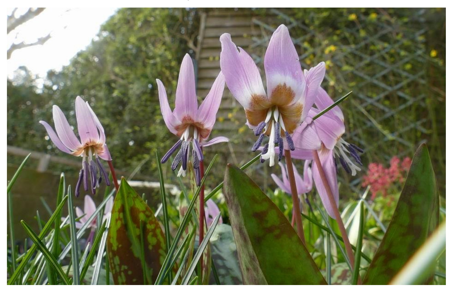
The earliest of the paler coloured forms of {\bf Erythronium\ dens\text{-}canis}