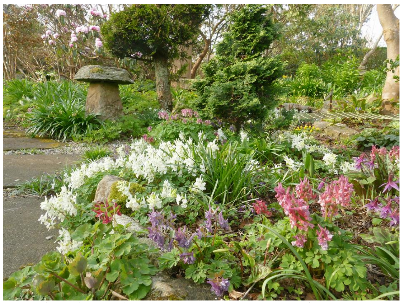
The creamy white Corydalis malkensis is being joined by the pinks and purples of Corydalis solida all of which merge to form wonderful carpets of colour during their short growing season - I will undoubtedly share more images of them in the coming weeks......