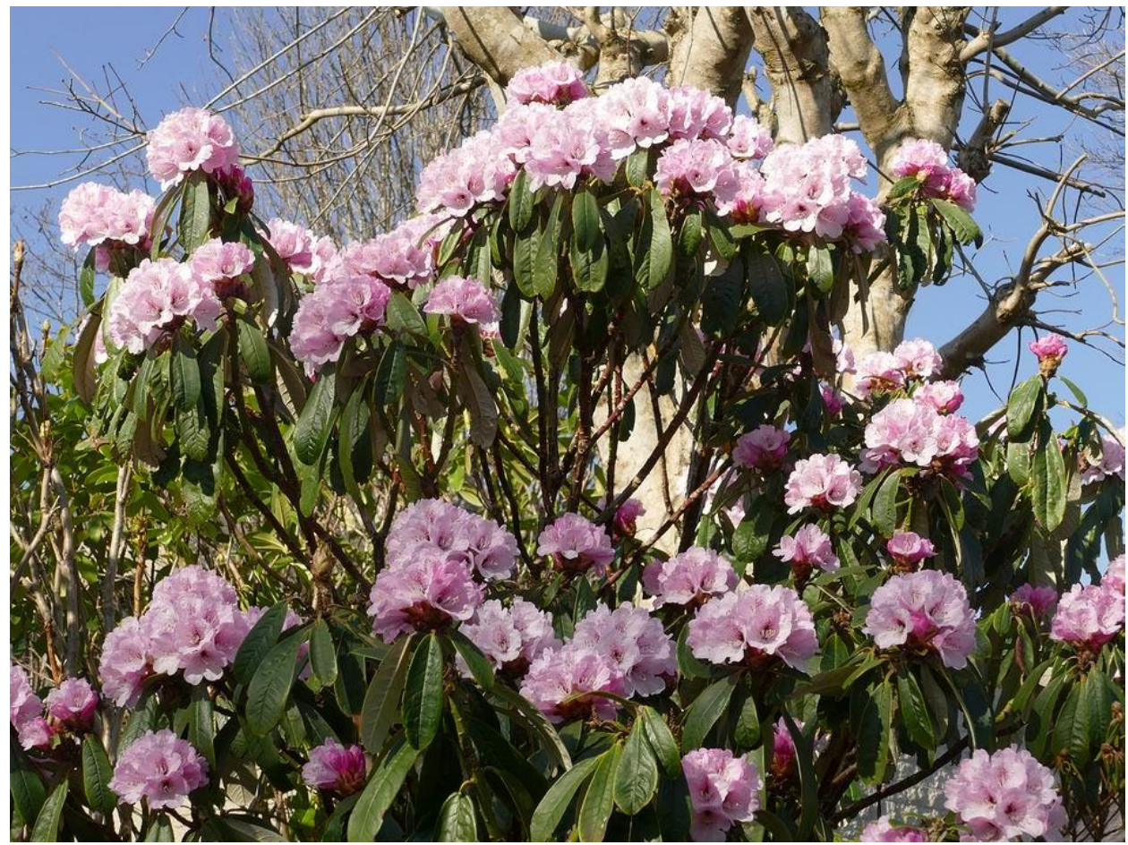
Just to show that not all the flowering action in the garden is happening at ground level here is the beautiful Rhododendron uvariifolium in full bloom.