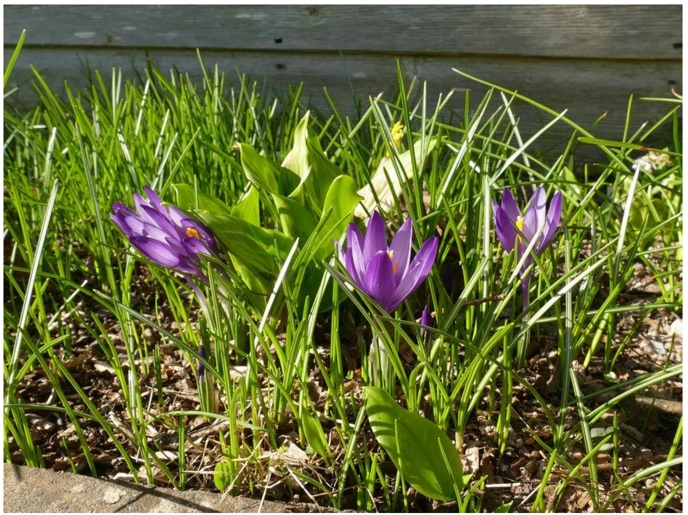
Moving on the first flowers of Crocus pelistericus are opening in a number of areas - above in a sand plunge bed where the flowers are appearing among a forest of Crocus nudiflorus leaves while below, they look at home in the moss covered sand bed with Cyclamen coum.