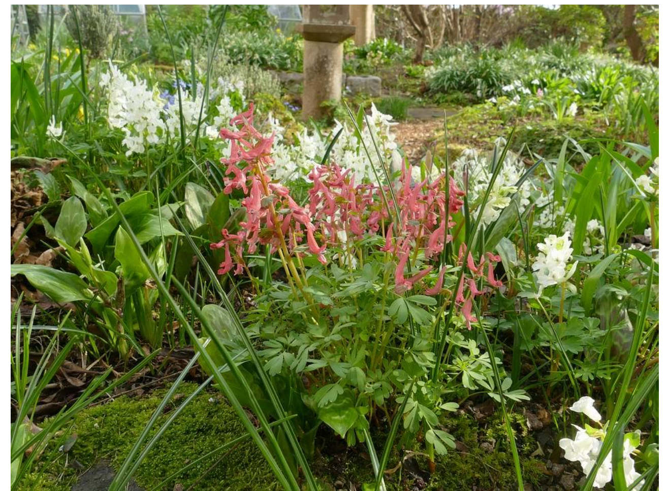
This pink forms is one of the earlier flowering of our many Corydalis solida forms which I am sure I will show in the coming weeks.