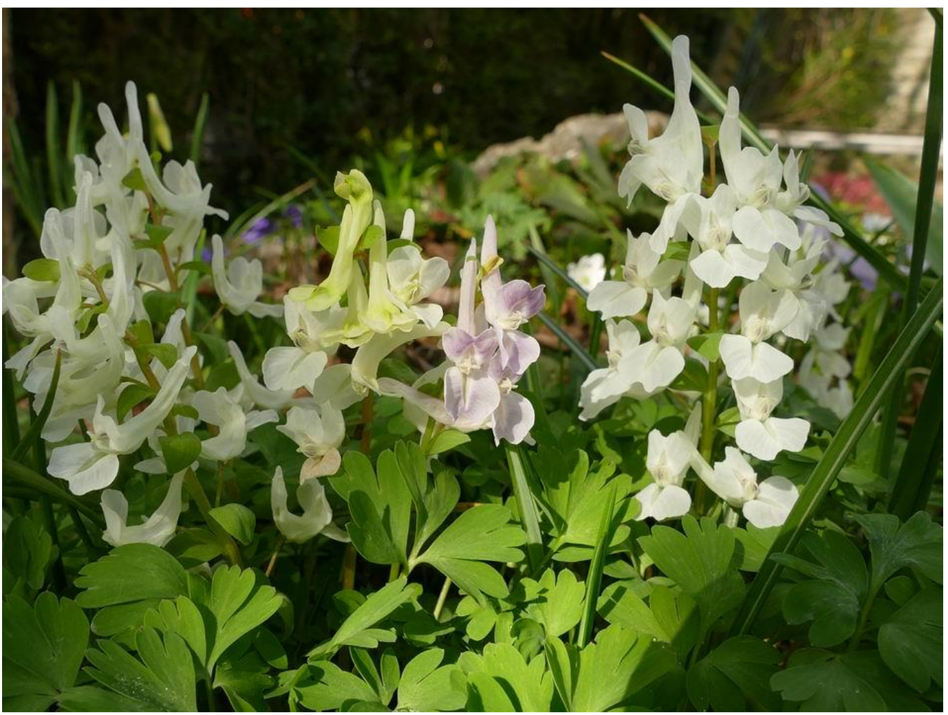
I occasionally find violet tinted flowers among the otherwise creamy white flowered population of Corydalis malkensis and I am not sure if these are just a genetic variation or if they may be hybrids.