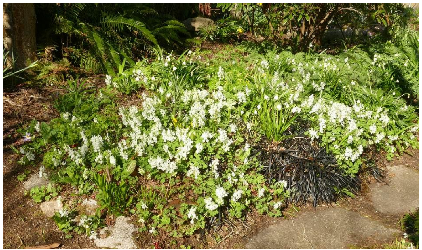
Here in a sunnier bed Corydalis malkenis is currently the star show having taken over from the Eranthis, Galanthus and Leucojum which have already flowered and before the Erythronium, Fritillaria and Trillium come into their season.