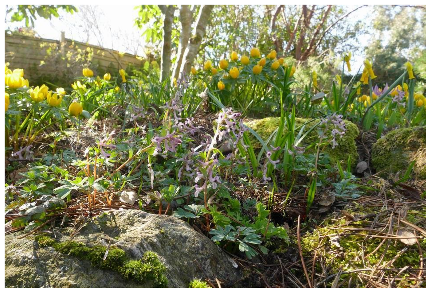
I introduced Corydalis paczoskii to the new bed where it grows, flowers then seeds and having such a short growing season it will be gone by the time the Trillium hibbersonii and T. (pseudo)rivale growing below appear.