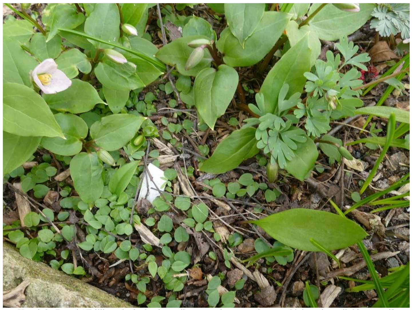
Here it is (Pseudo)Trillium rivale that is seeding around generously – would they also call this a weed?