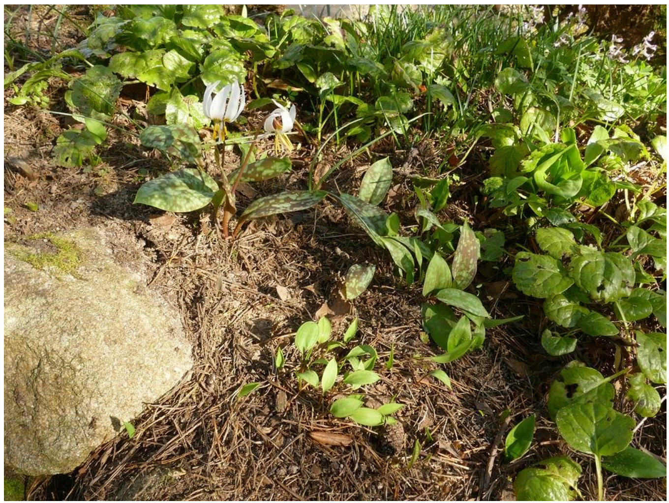
Erythronium caucasicum with two clusters of seedlings - the smaller plain green leaves on the left are a year younger than those on the right which are now mature enough to show the markings.