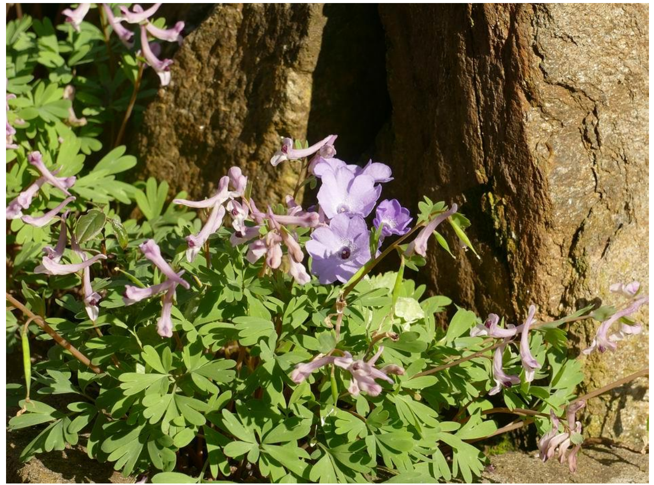
I will return to my main topic for this week's final two pictures first Corydalis paczoskii harmonising both colour wise and horticulturally with Primula marginata.