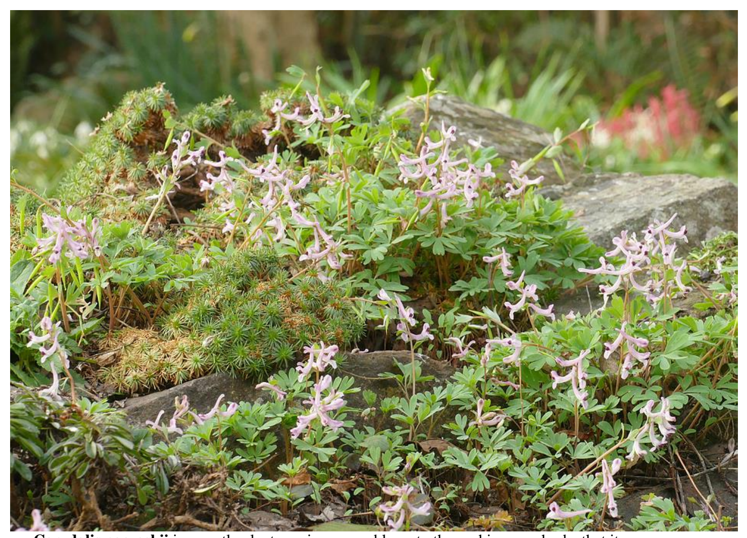
Corydalis paczoskii is a gentle plant causing no problems to the cushions or shrubs that it grows among.

With smaller pinky violet flowers Corydalis paczoskii is a more subtle plant than Corydalis malkensis, so being less showy it does not jump out the same but it is none the less a good addition. In the right place it is a very welcome plant at this time of year - here we have encouraged it to seed around one of the raised beds among small shrubs and other plants which are still very much in their winter state then by the time they start to grow and flower Corydalis paczoskii will have flowered, seeded and retreated undergound.