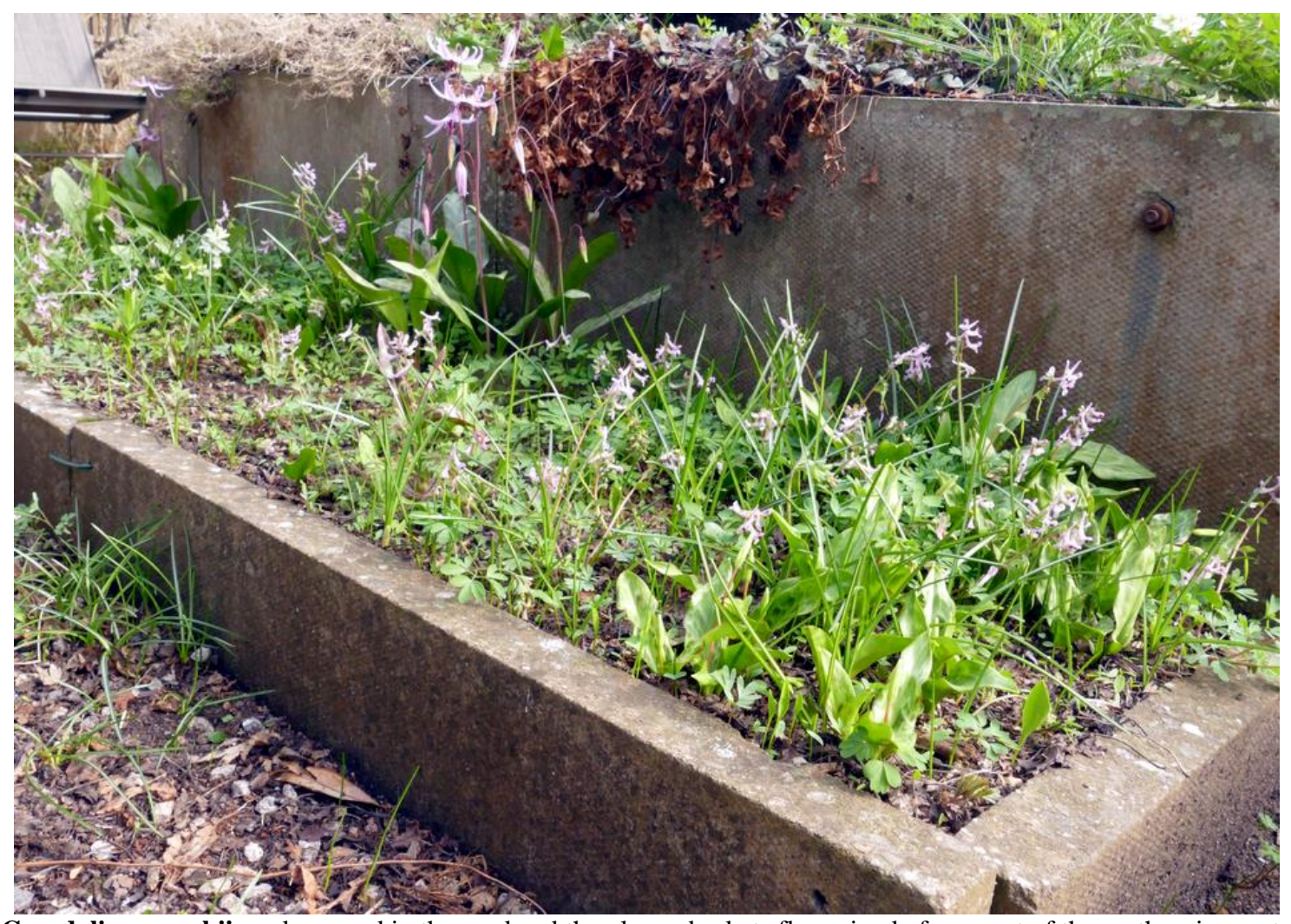
Corydalis paczoskii seeds around in the sand and the plunge baskets flowering before most of the erythronium get going.