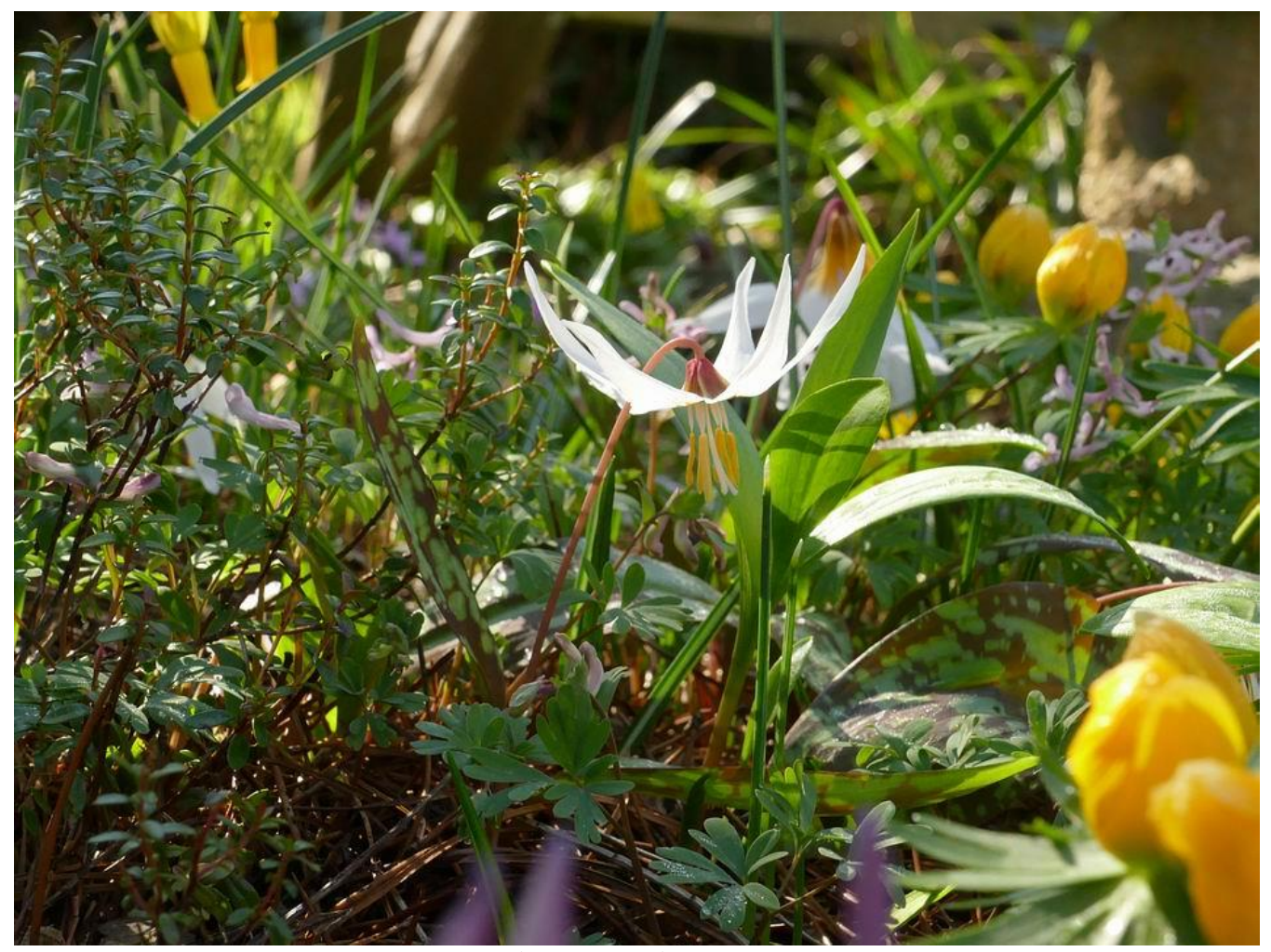
Another plant native to the Caucasus, Erythronium caucasicum , which with some effort and patience we are making good progress at establishing in our garden.