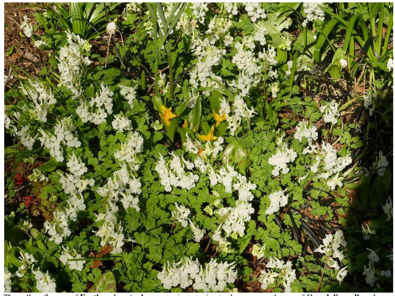
The yellow flowers of Erythronium tuolumnense just starting to show among the sea of Corydalis malkensis which will collapse when it sets seed, as the stems of the other subjects push their flowers up to attract attention.