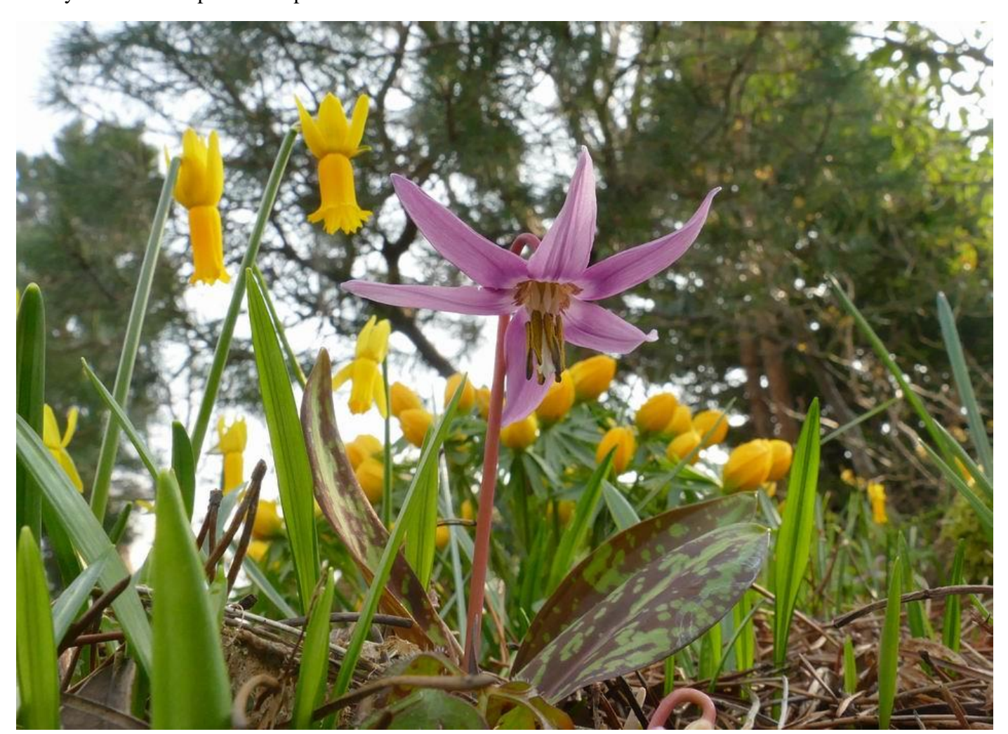
Some years ago a friend sent us seed collected from a population of Erythronium dens-canis in Eastern Ukraine - these have brown anthers, some with yellow pollen- the markings in the flowers also vary from all the other forms we grow. This is one of that first generation and I am working to establish them further from our garden seed.