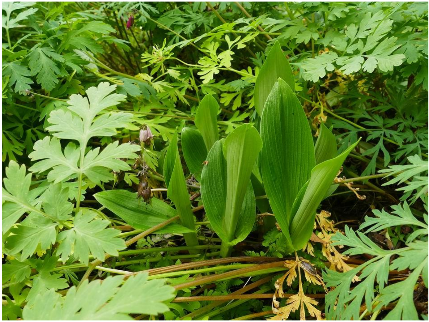
While the Dicentra and other plants are now retreating underground until next year other plants, such as these Roscoea, are just pushing up their new leaves to be followed later by their flowers.