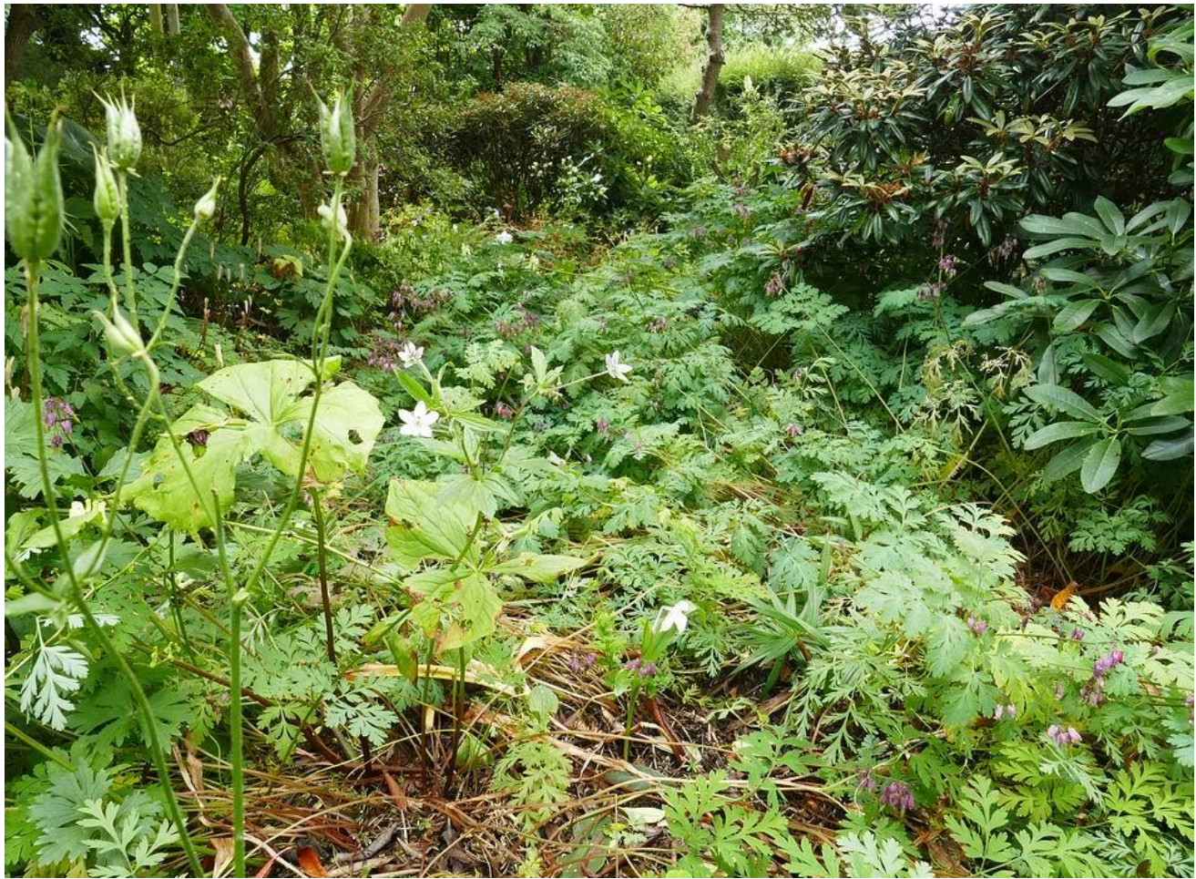
Some of the ground cover of Dicentra, which was collapsing in the hot dry weather, has been rehydrated by the few days when we had some welcome rain.