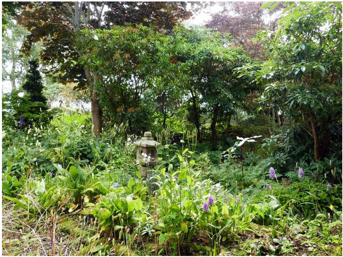
After sitting for a while I took my camera for a walk capturing images of the garden at what I think of as a transitional stage of growth. Mid-summer is when many of the early plants, that we are so fond of, are setting seed and collapsing but among the chaos there are some new growths and flowers to be found.