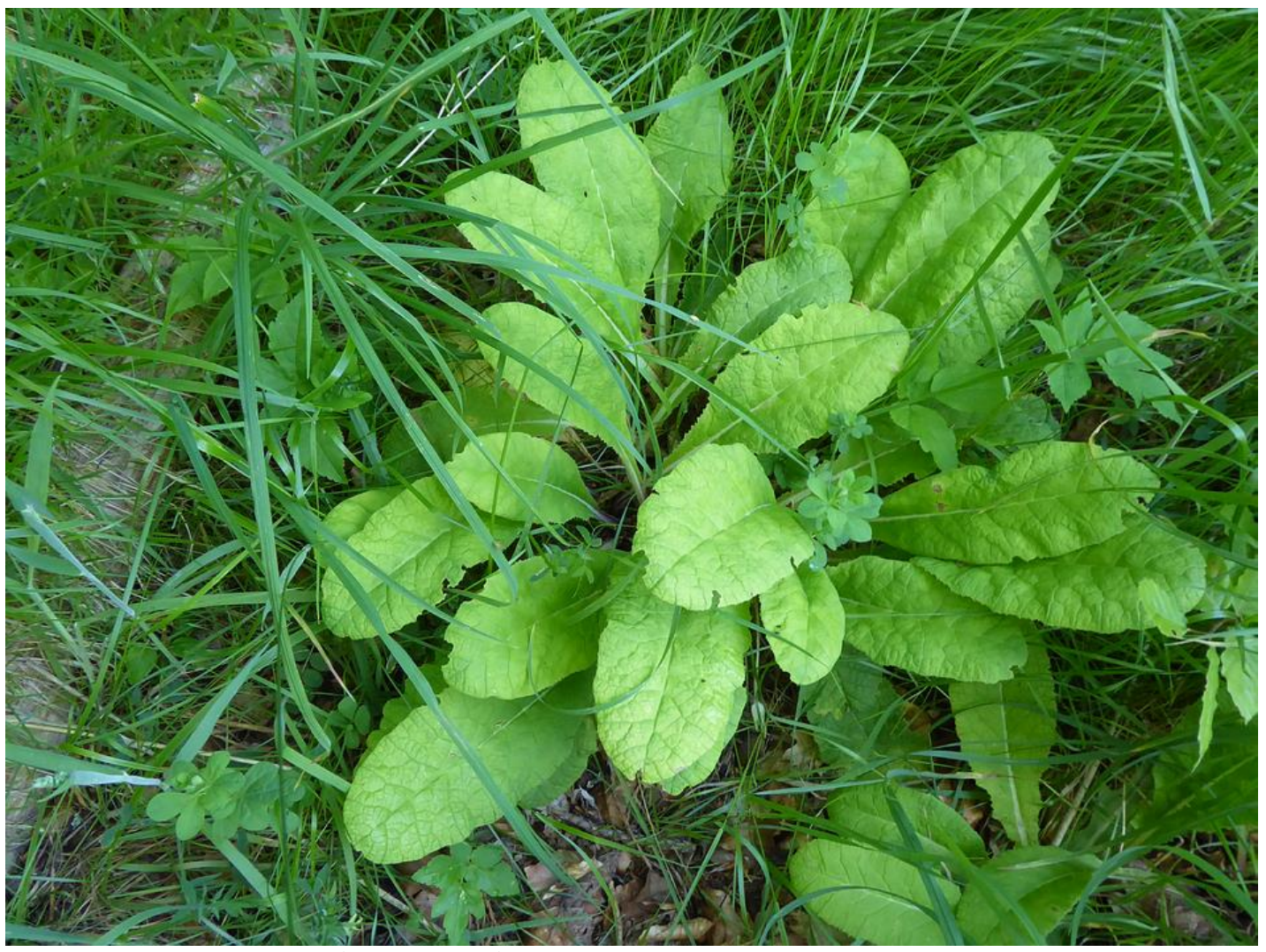
The leaves and growth of the Primula vulgaris growing among the grasses in the wood are at least twice as good as ours and while our ground was very dry when I checked at the base of the grass and Primula there was moisture.