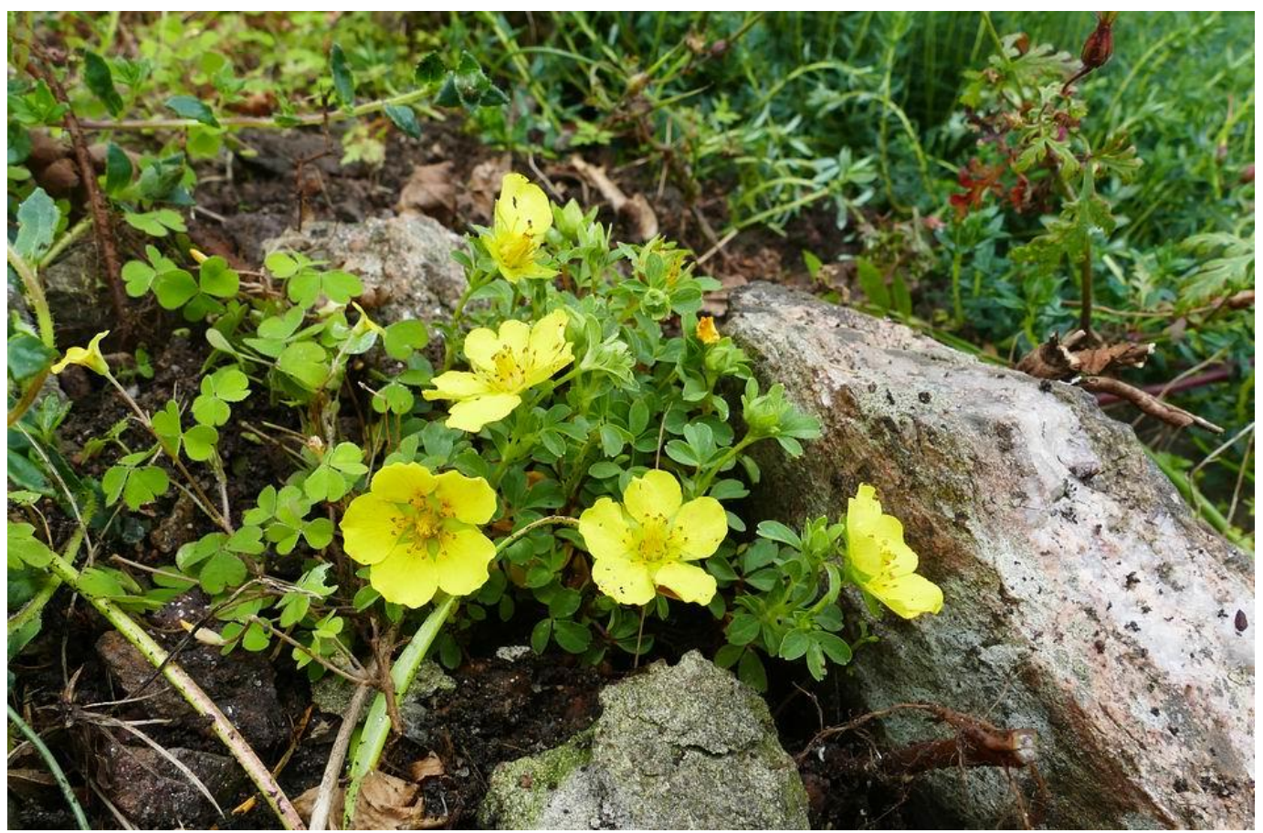
Potentilla eriocarpa is one of the plants we bought in May which brings some welcome colour to one of the raised slab beds.

This is the view we get from one of our swing seats where I often sit observing and thinking about how our plants and garden fit in with nature. Gardening is about habitat manipulation where we, the gardeners, can adjust the soils and drainage by building up raised beds etc. The plants we select also create habitats I am especially thinking of trees and shrubs that affect the habitat above and below the ground with their canopy casting shade while their roots change the soil structure as they push put and down.