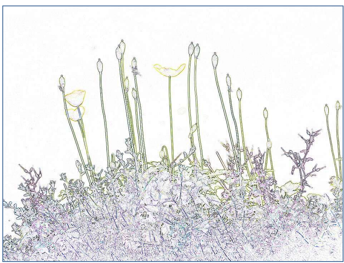
Creativity can then continue with a few clicks and a digital filter.