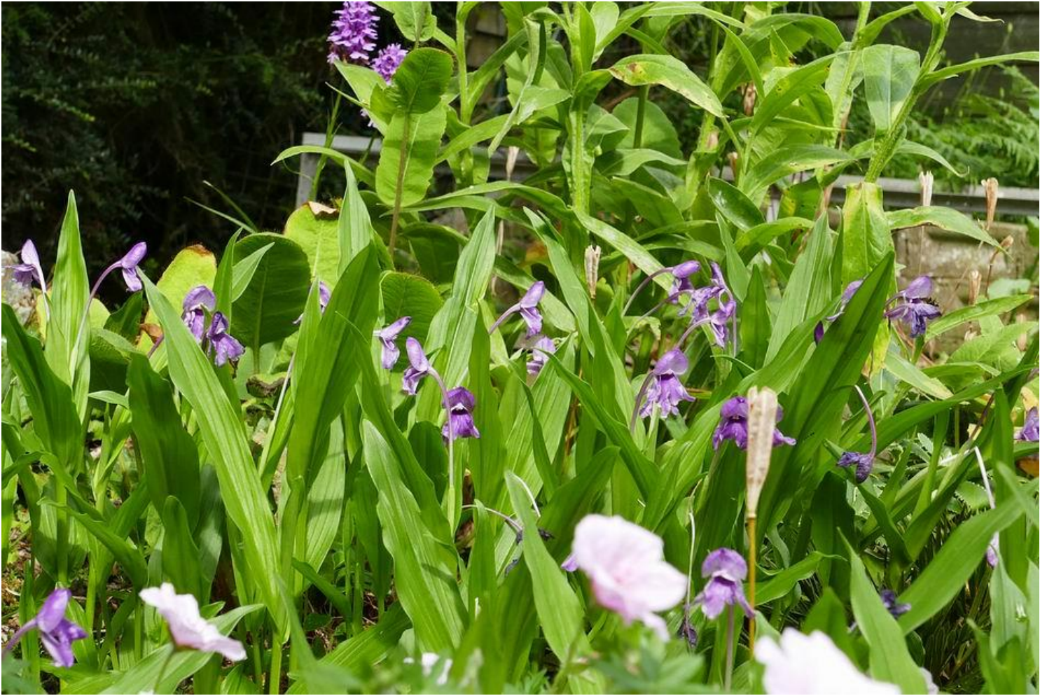
Roscoea alpina seeds out across the rock garden so we have several groups of plants flowering just now.