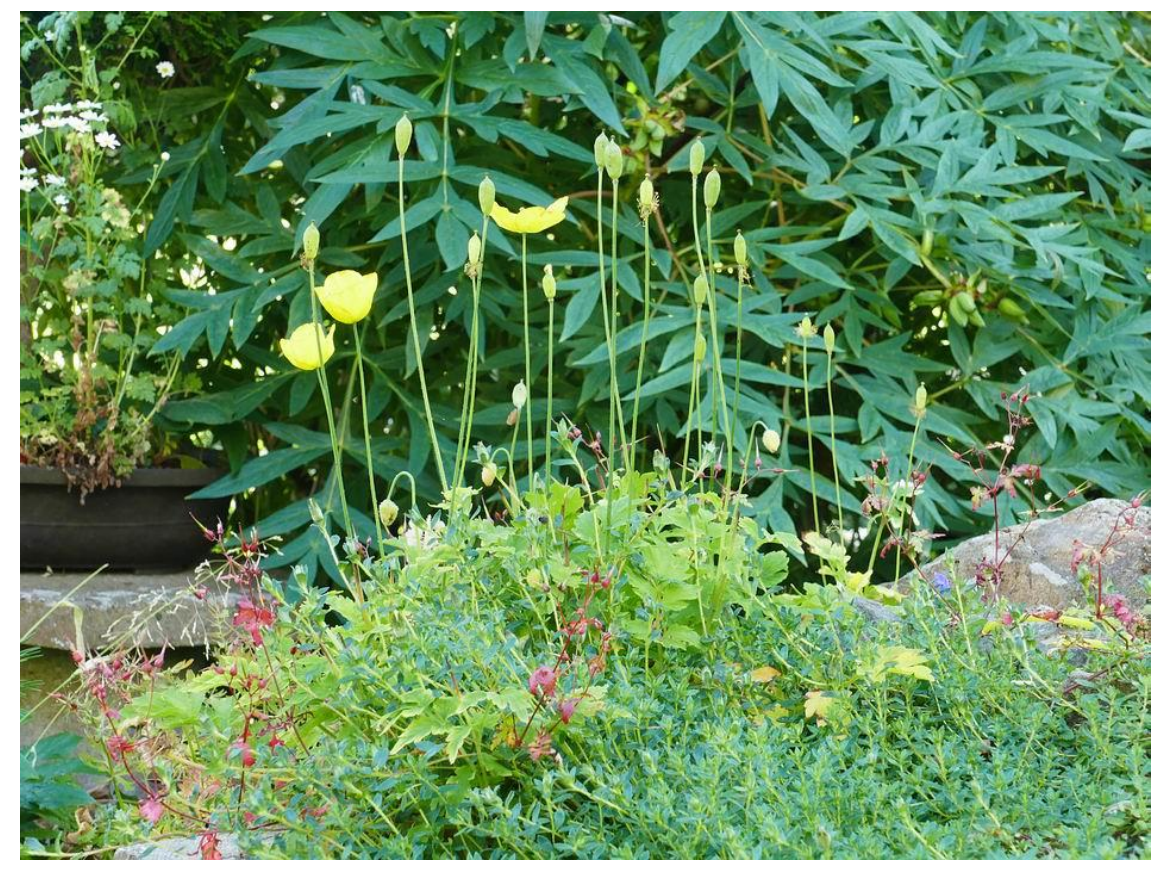
The next sequence of images shows the before and after pictures of the same view - first to the left the image as it is complete with distracting background.