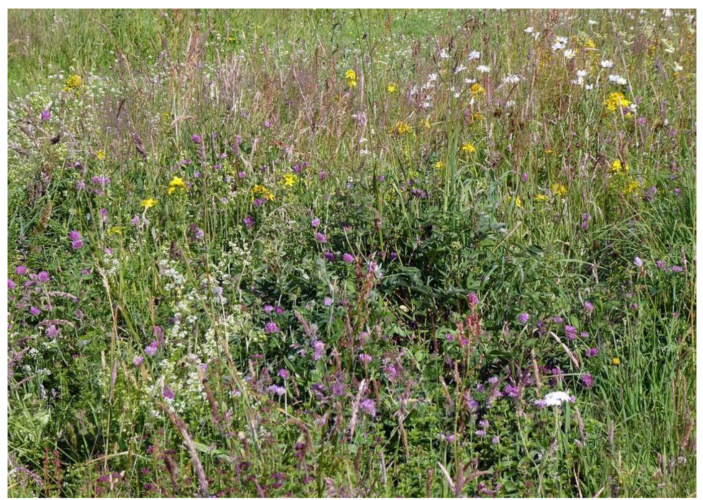
Greater biodiversity within these areas can easily be re-established if mixes of native wild flower seeds are introduced.

It is extremely important that we preserve wild grassland especially around our towns and cities. I have a special interest in conserving habitats such as this one, which is only a ten minute walk from our home. It is classified as Green Belt but once again it is under threat with a planning application for a development. This once cultivated land has for 50 plus years been left to nature and I am curious how a number of distinct habitats have formed. Some areas are dominated by large grasses while fine grasses predominate in the area closer to the camera, brambles grow in one area and raspberries in another no doubt these variations reflect the ground conditions below.