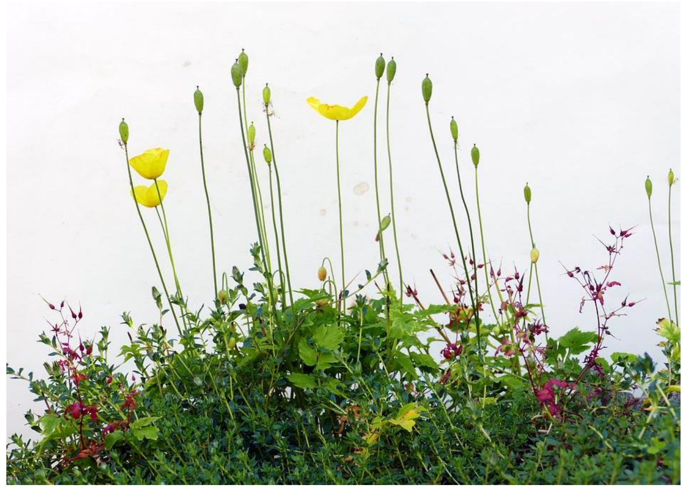
Next I apply the Dürer trick of isolating the plants by holding a sheet of white paper behind them to obscure the background..