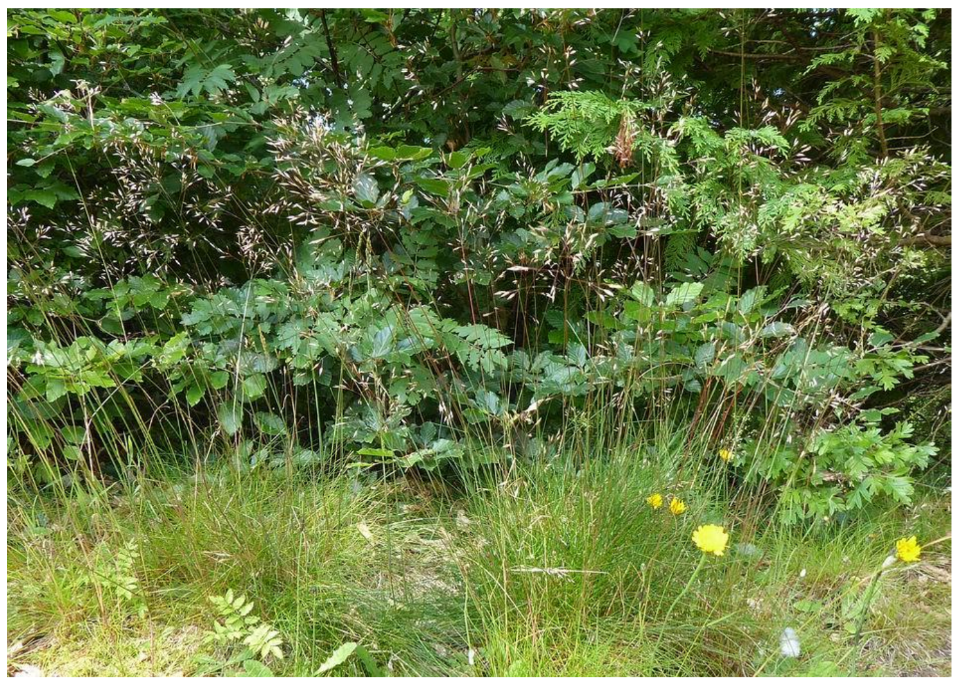
The gardener can take so much inspiration from nature especially the use of selected grasses. In recent years more grasses, especially some of the larger types, have featured in gardens, I especially think of the prairie style plantings, but I am interested in finding some small fine grasses that would be suitable for introducing to gardens.

A moss covered sloping roadside has become a seedbed for a large number of plants including Rhododendrons and tree species such as Rowan and Yew, all growing among the moss and fine grasses.