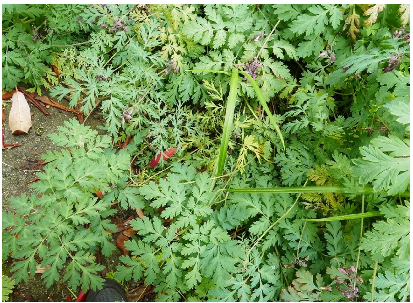
When the Dicentra is in full growth it looks superficially the same but closer observation shows there is a wide variation in the foliage of this hybrid swarm.