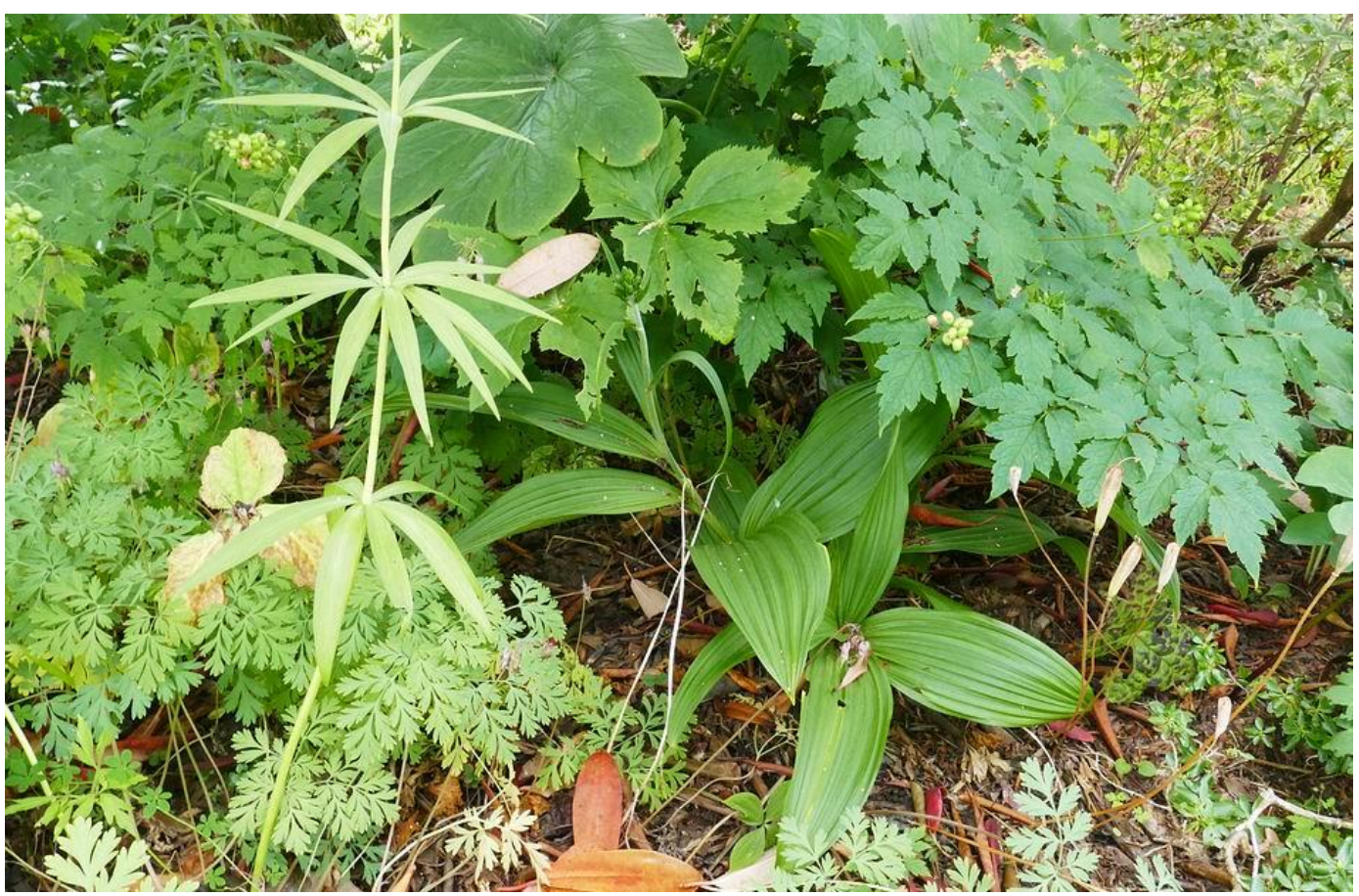
I spot the fan shaped leaves and flowers stems of another late summer/ autumn flowering plant Veratrum fimbriatum .