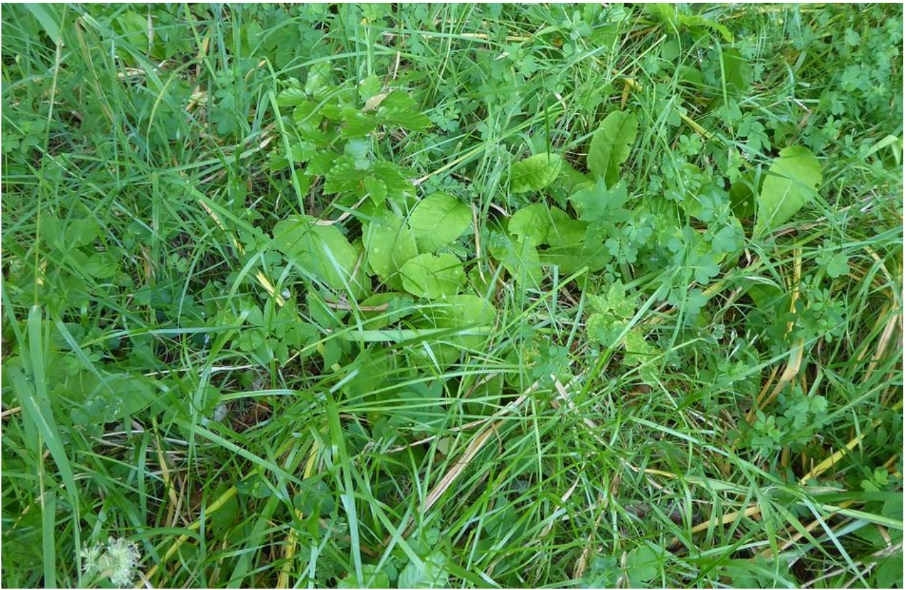
I am interested to observe how well the Primula vulgaris , naturalised among the grasses, are growing so much better than the ones in our garden which get the same weather conditions as it does, only a ten minutes' walk away.