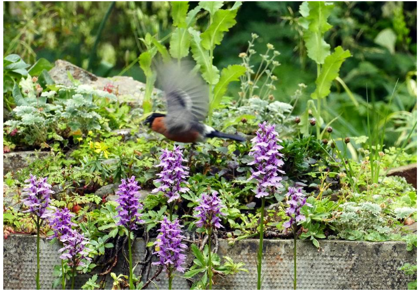
By pure luck I captured the bird in flight.

The overall habitat we have created in the garden is that of a small open woodland which in turn contains many macro and micro habitats. The many trees and shrubs provide cover and food to attract the birds which we further encourage by feeding them with sunflower hearts. We get large numbers of birds and while we get great pleasure watching them on the feeders I am most heartened by watching them foraging among the habitats we have created. I took these pictures from the swing seat of this Bullfinch feeding on the Geranium and Viola seeds on a raised bed.