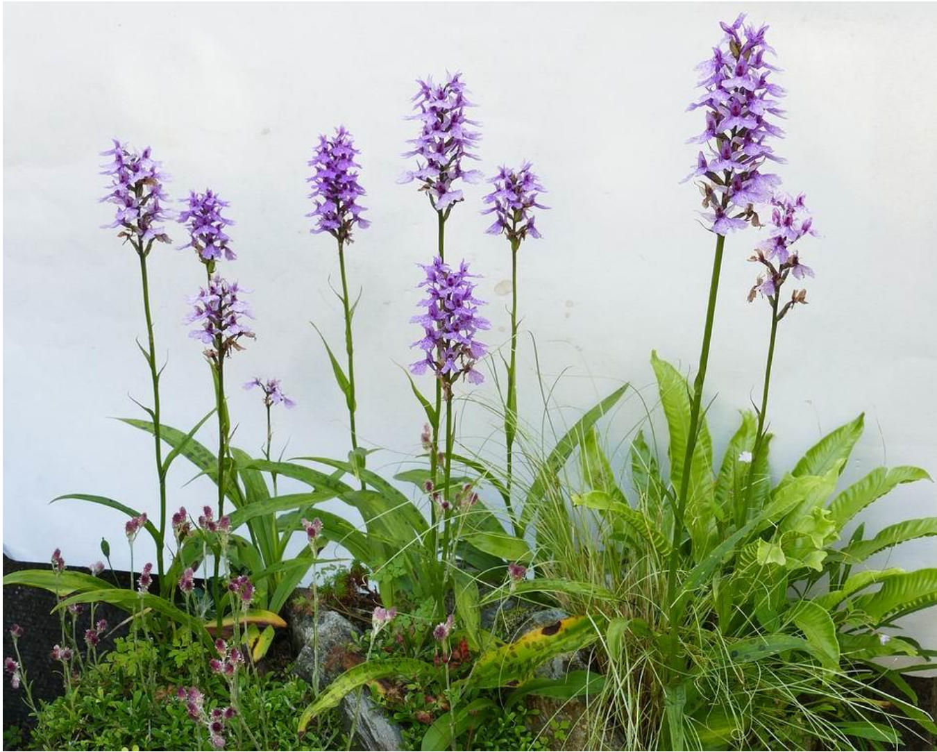
We can all learn from the past - in his painting Durer choose to isolate the grasses and wild flowers by leaving the background white making them stand out dramatically. We can also do this in the garden by using a white sheet of paper as I did here to isolate this trough planting. Just remember to get the correct exposure for the plants and keep the background white and not grey - you will need to overexpose by around one stop.