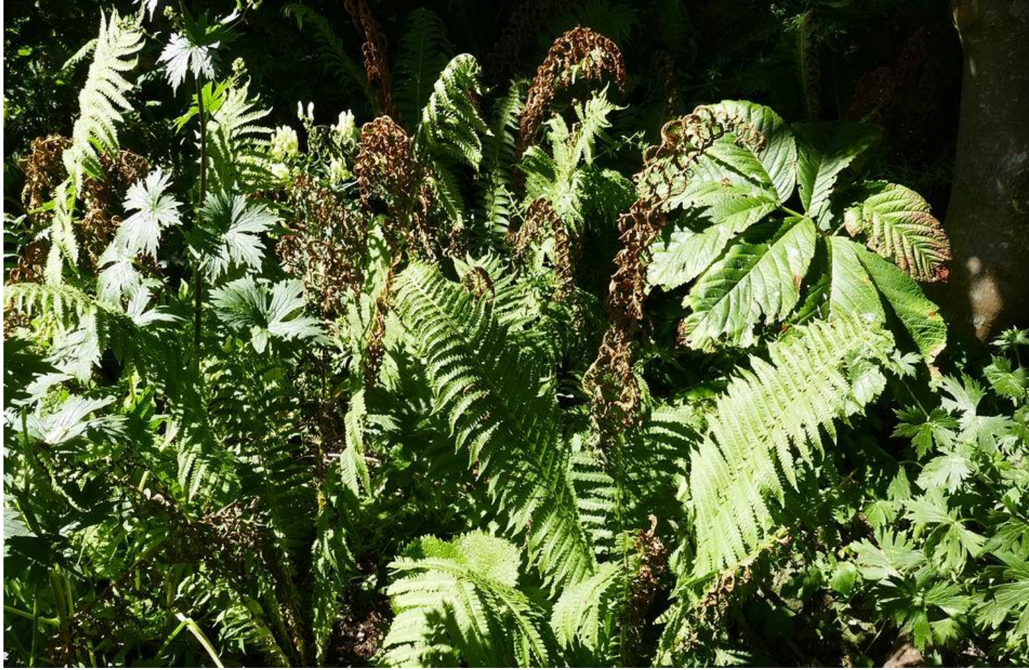
We are often guilty of looking for the dramatic colourful flowers in gardens and not taking in the more subtle but equally interesting decorative shapes and forms created by the stems and leaves. Here in the harsh bright light there is beauty in the fern fronds even the ones scorched by the heat when they were in direct sunlight.