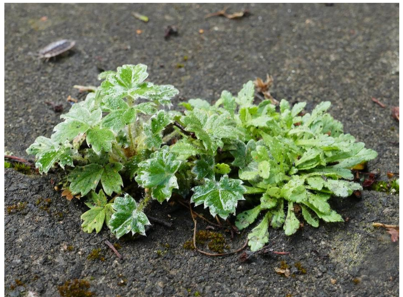
We do some selective weeding in the crevices between the paving slabs allowing some of the plants that seed in, such as Potentilla pulvinaris and Erinus alpinus , to grow.