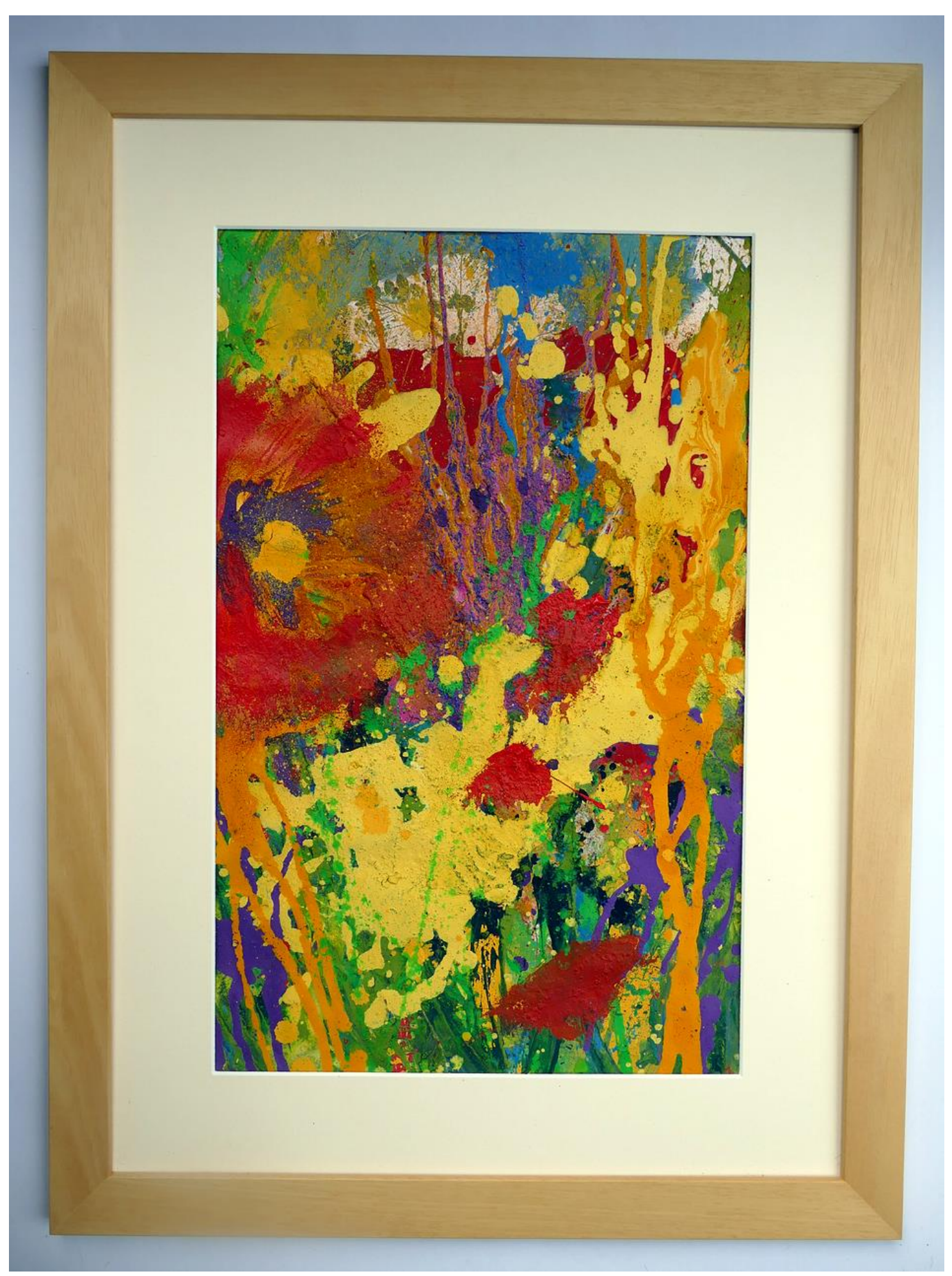
Gardening itself is an artistic process but I share these images to try and encourage more of you the get creative and lay down your impressions of plants and gardens utilising drawing, painting or whatever medium you want.....