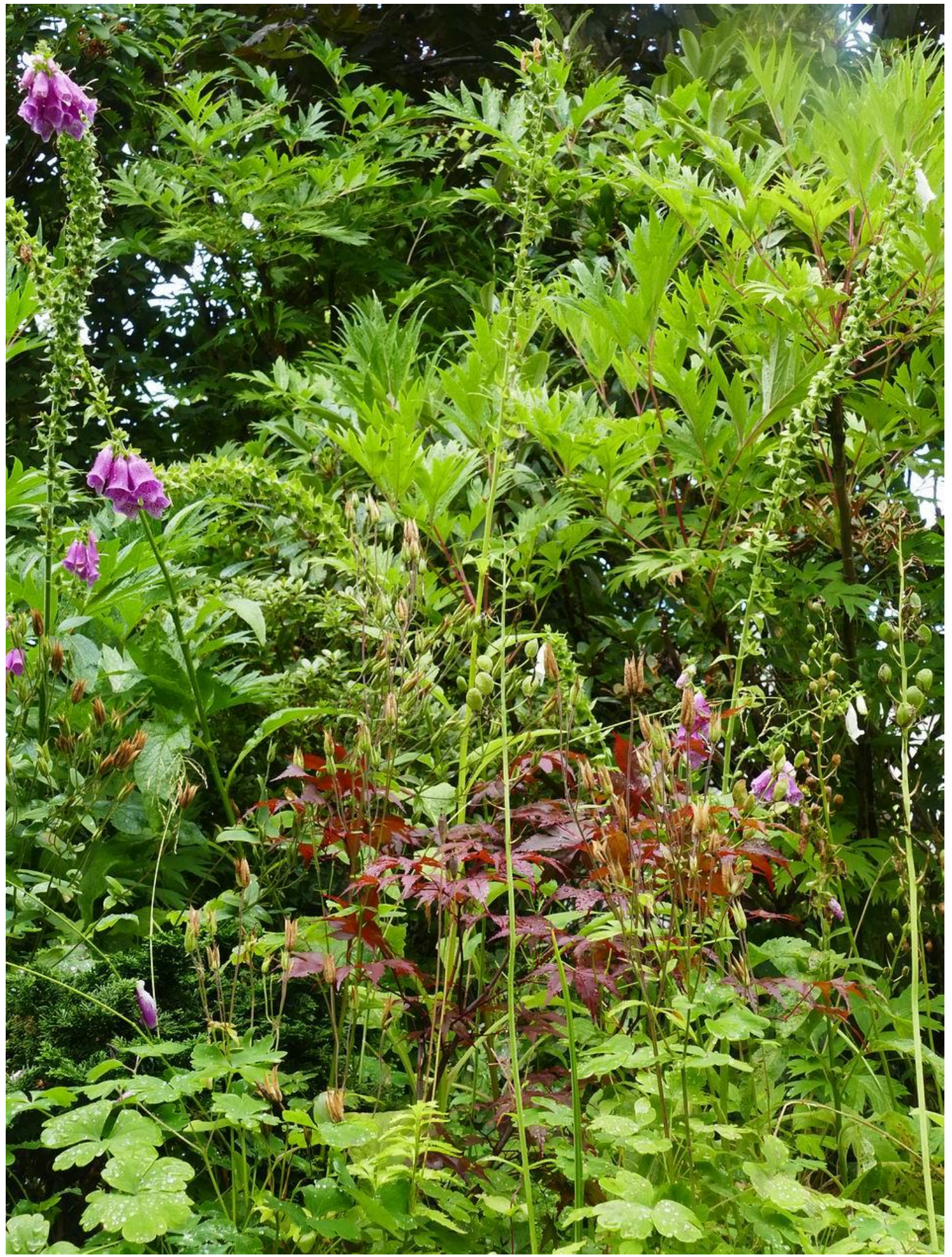
I am fascinated by how we see and look at scenes like this chaos of colours, shapes and forms that such a mass of plant growth creates which in turn inspires my art.