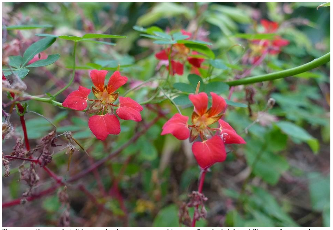
Two more flowers that did not make the cover are on this page, first the bright red Tropaeolum speciosum.