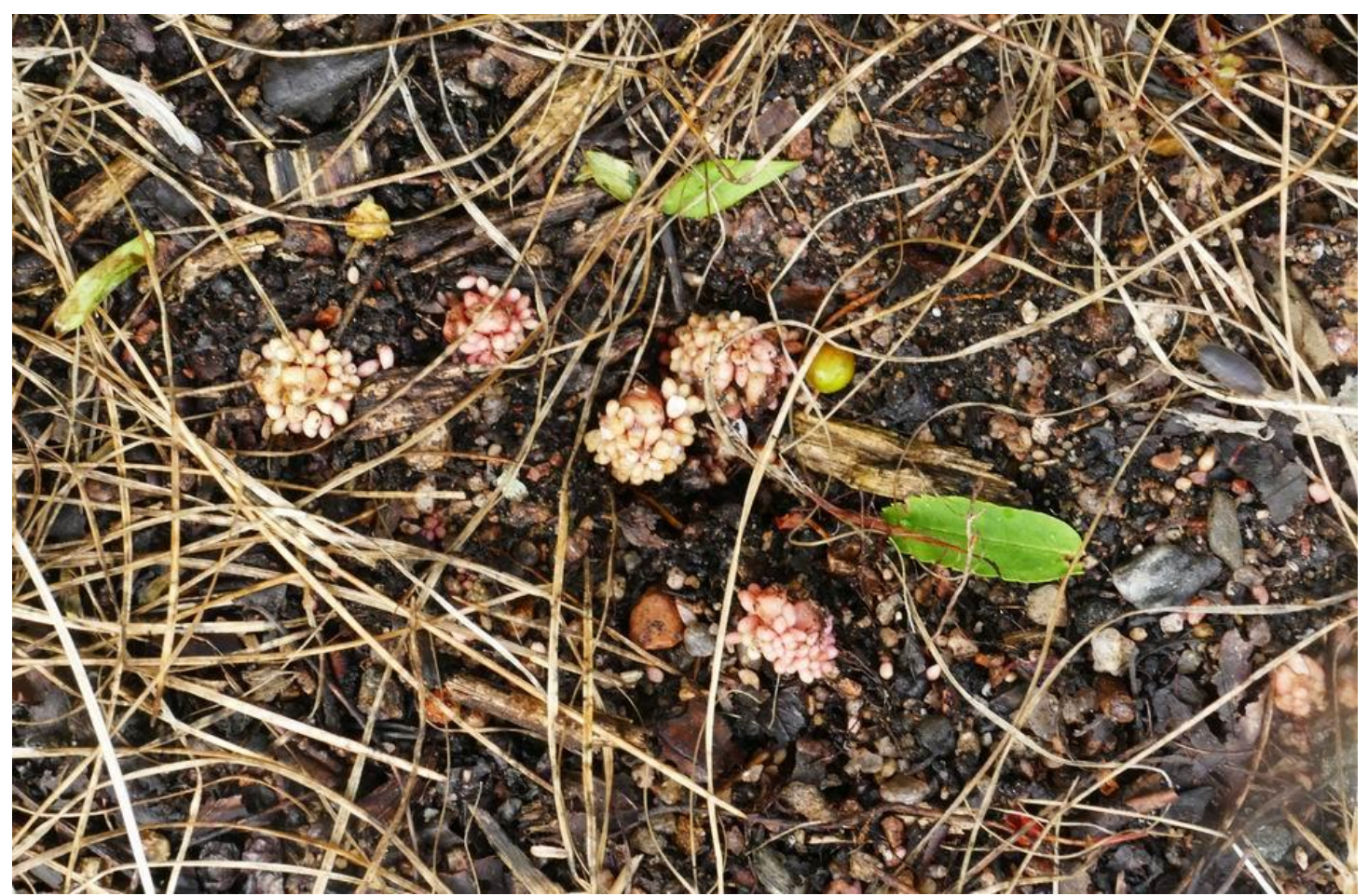
While taking these pictures I spotted that the foraging birds had disturbed some of the Dicentra cuccularia bulbs which grow and flower best when they are lying just below the surface. Plant them too deep and they will not flower for a few years as they gradually grow their way towards the surface.