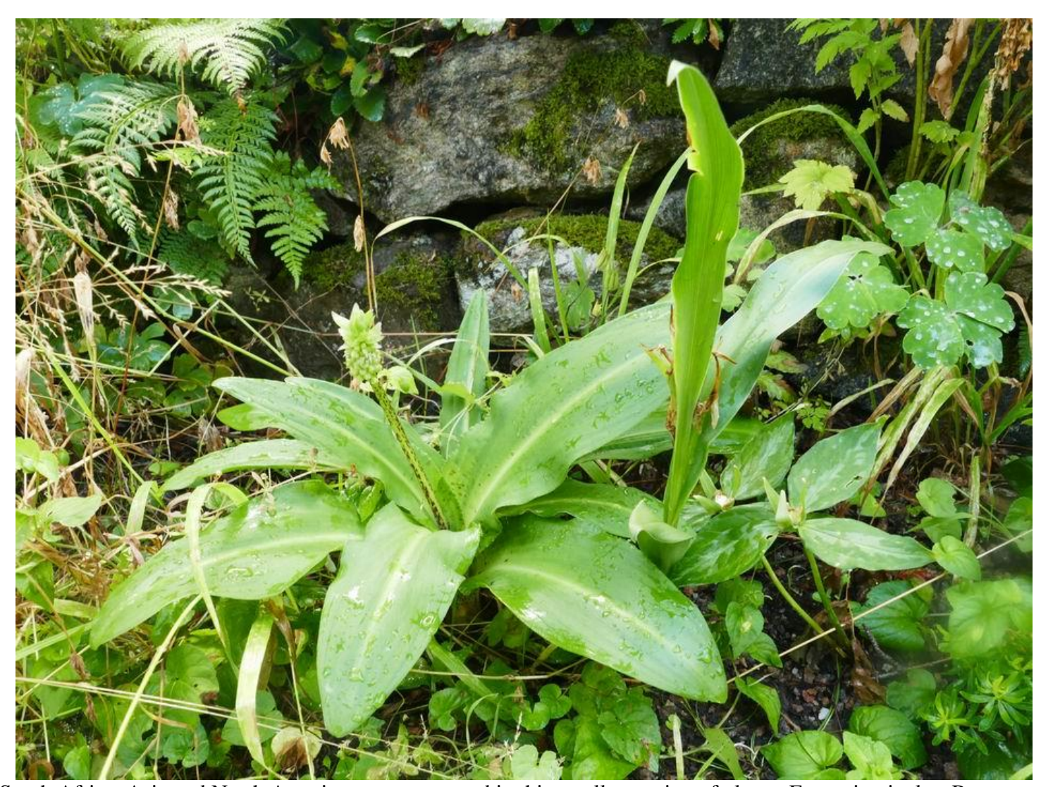
South Africa, Asia and North America are represented in this small grouping of plants: Eucomis tricolor, Roscoea humeana and Trillium luteum.