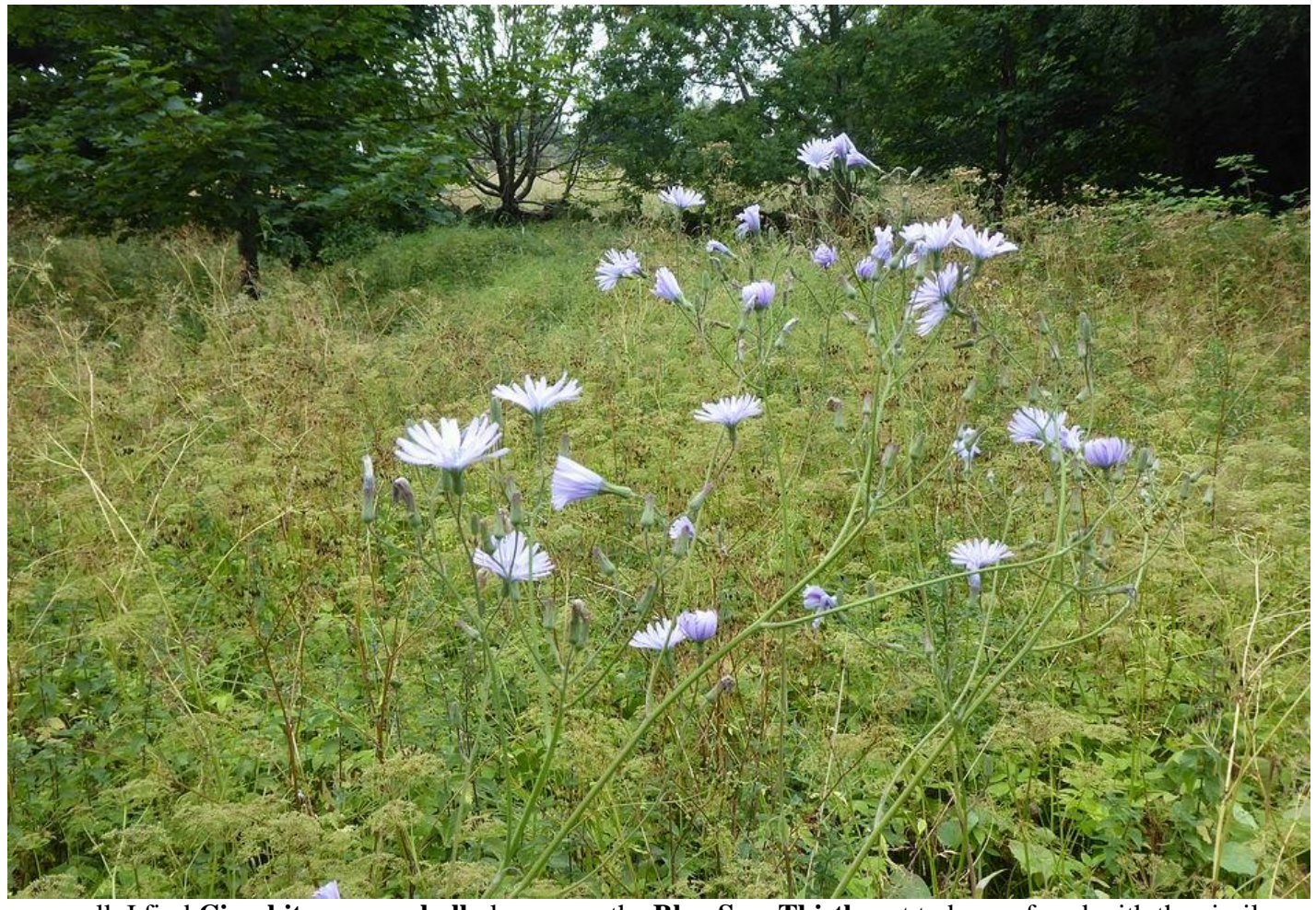
On my walk I find Cicerbita macrophylla known as the Blue Sow Thistle not to be confused with the similar looking Cichorium intybus (Chicory) which holds its bluer flowers closer to the stem.