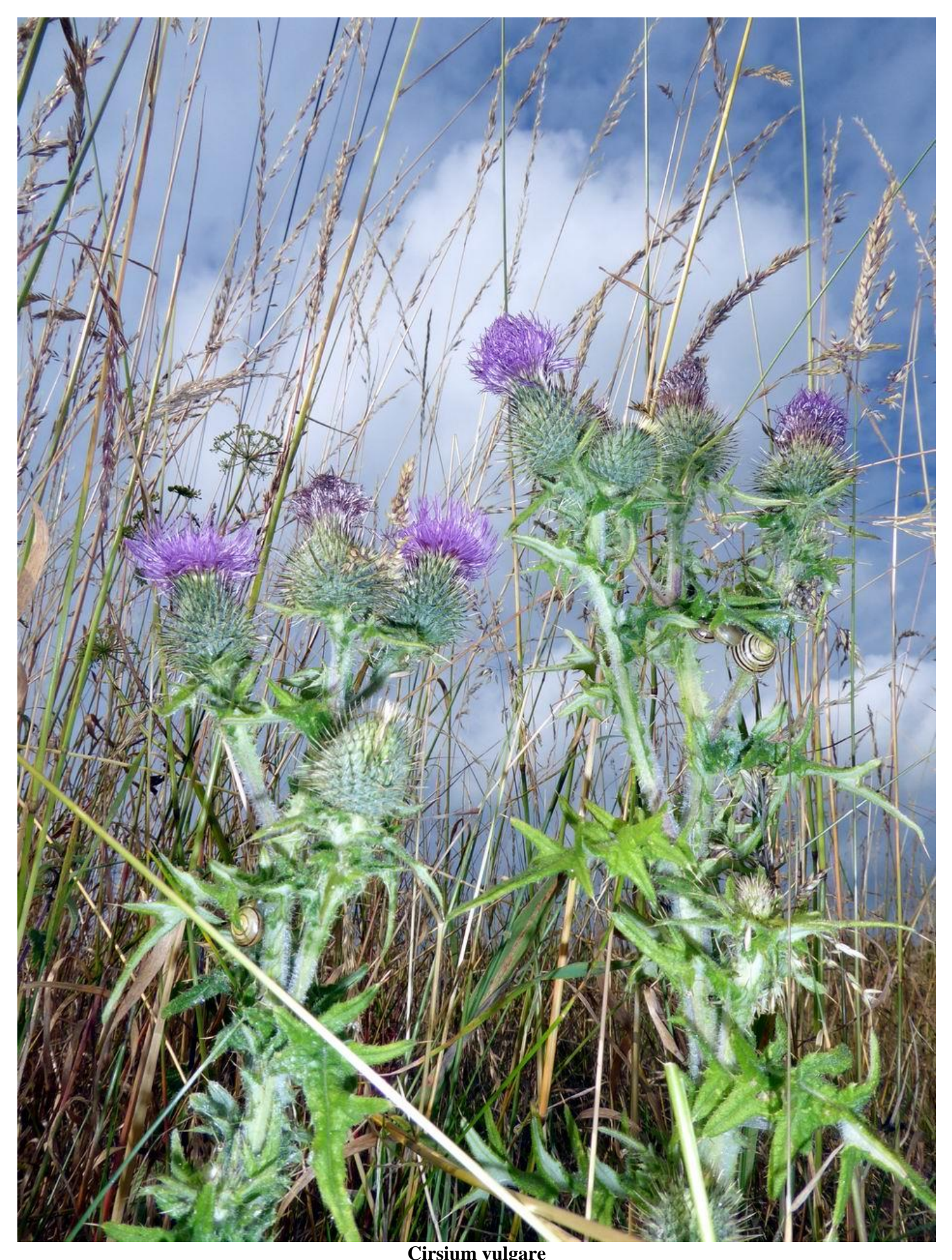
Cirsium vulgare I wanted to capture this emblem of Scotland in a more dramatic way than in the two previous pictures – here is my effort captured using my compact camera showing the thistle with banded snails, grasses and looming clouds.