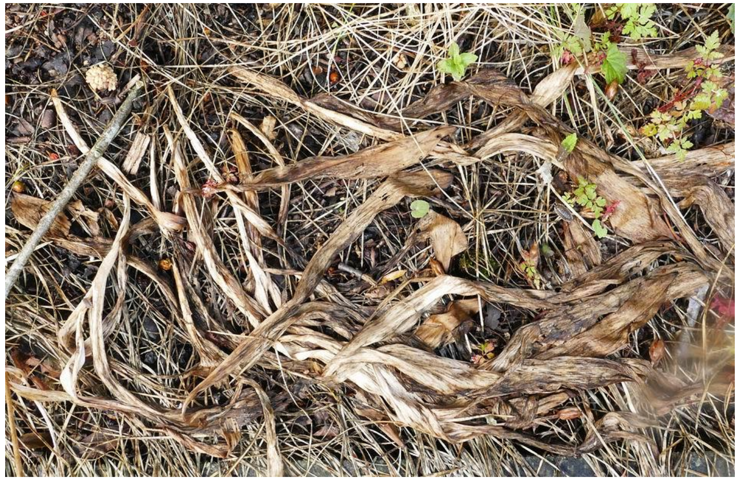
I can even find enough interest in these dried crocus and colchicum leaves lying on one of the sand plunges to take a series of digital images for future reference.