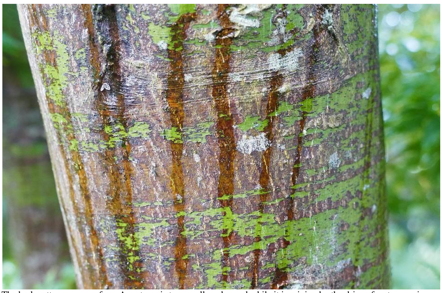
The bark pattern on one of our Acer trees is temporally enhanced while it is raining by the drips of water running down creating darker lines.