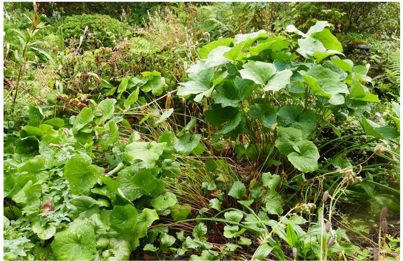
The heavy rain we had last night brings the plants some relief from the dry conditions and they respond to the moisture by sitting up again. No amount of me watering can have the same benefit as a few hours' worth of rain.