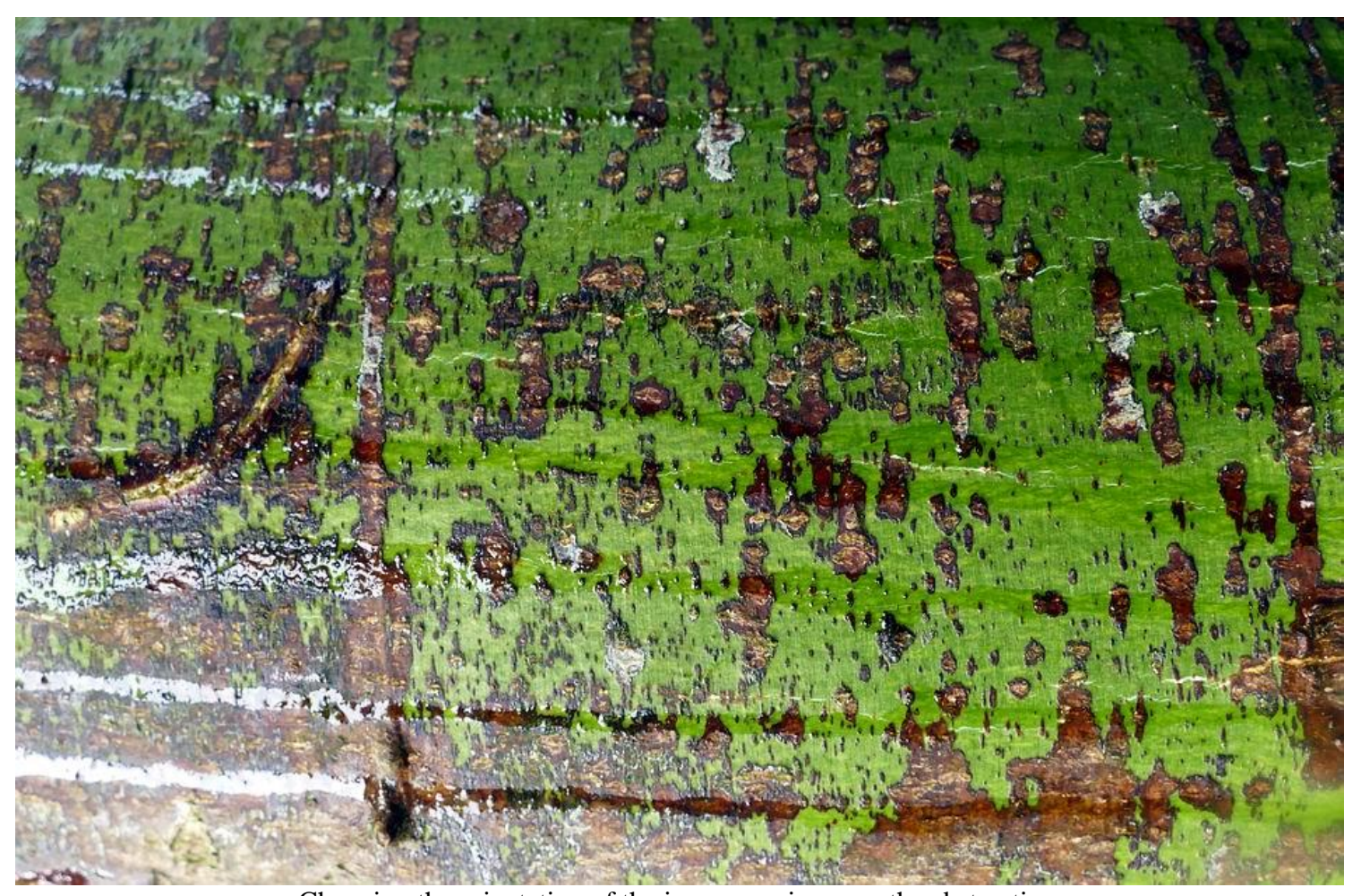
Changing the orientation of the image can increase the abstraction.