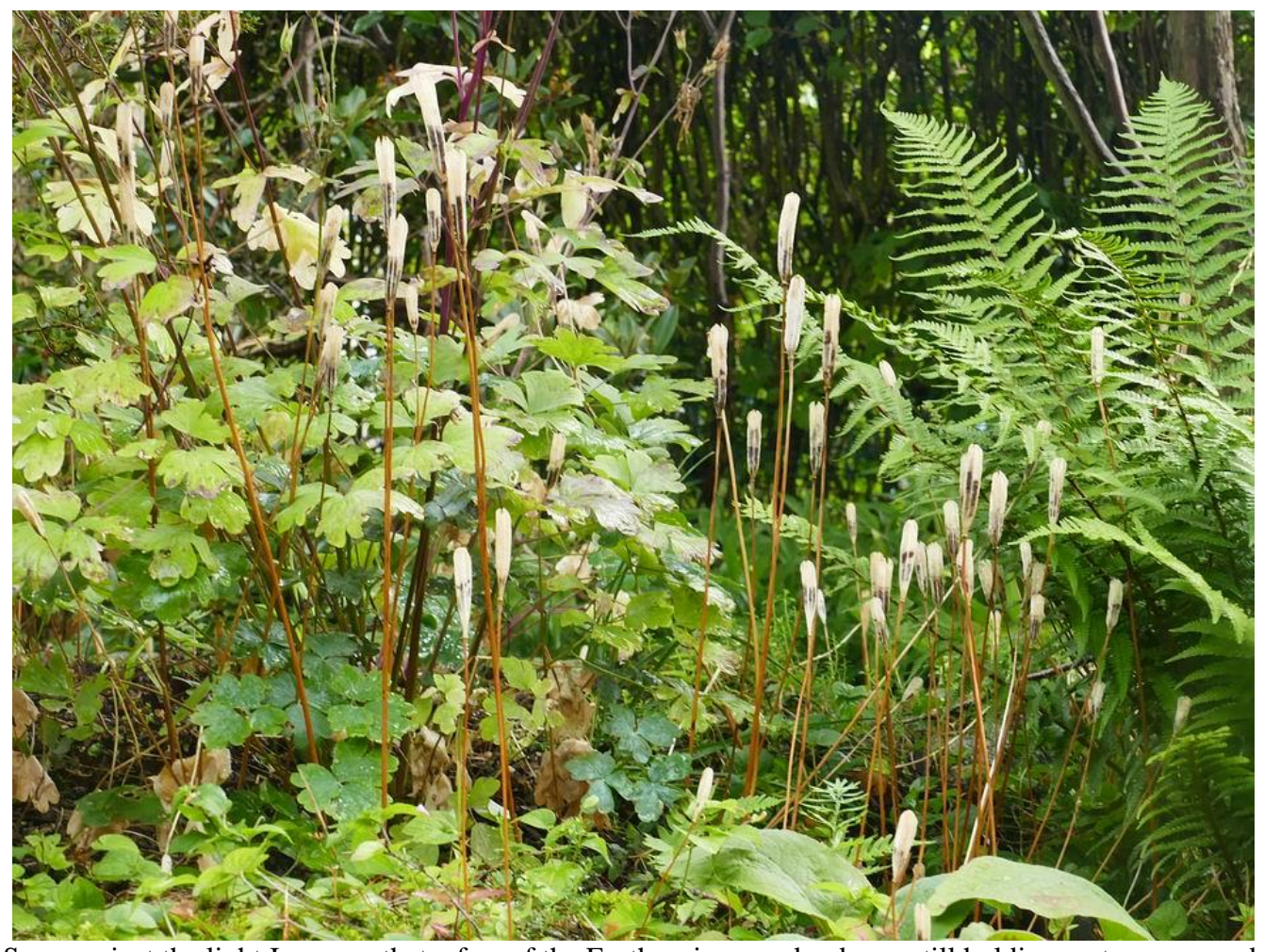
Seen against the light I can see that a few of the Erythronium seedpods are still holding on to some seed.