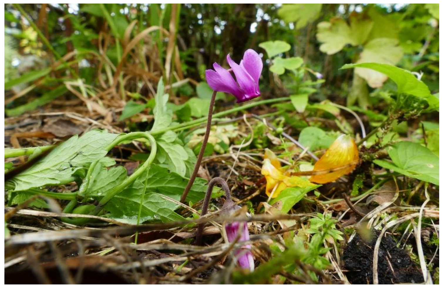
Hedge cutting and shredding continue to occupy me in the garden but I took time to pick a selection of flowers, most of which are small, to use for this week's cover picture. Images like this remind me that while there may not appear to be many plants in flower in the garden just now, when you start to look carefully, there is quite a range of colour to be found. It is not quite all the flowers I saw because some, like the first of this seasons Cyclamen purpurascens flowers, are simply too few and precious to pick as I have seed production in mind.