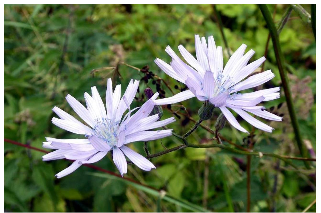
Cicerbita macrophylla has thistle like down attached to the seeds which fly away to be dispersed by the wind.