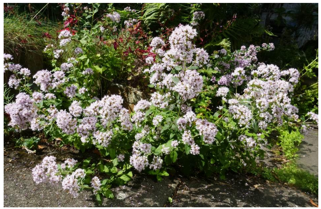
The appearance of Cyclamen purpurascens acts to remind me that autumn is not so far away and its flowers often overlap with plants like Origanum majorana that seeds around flowering in what passes as high summer in Aberdeen. Its clusters of small flowers attract a steady stream of several species of bees.