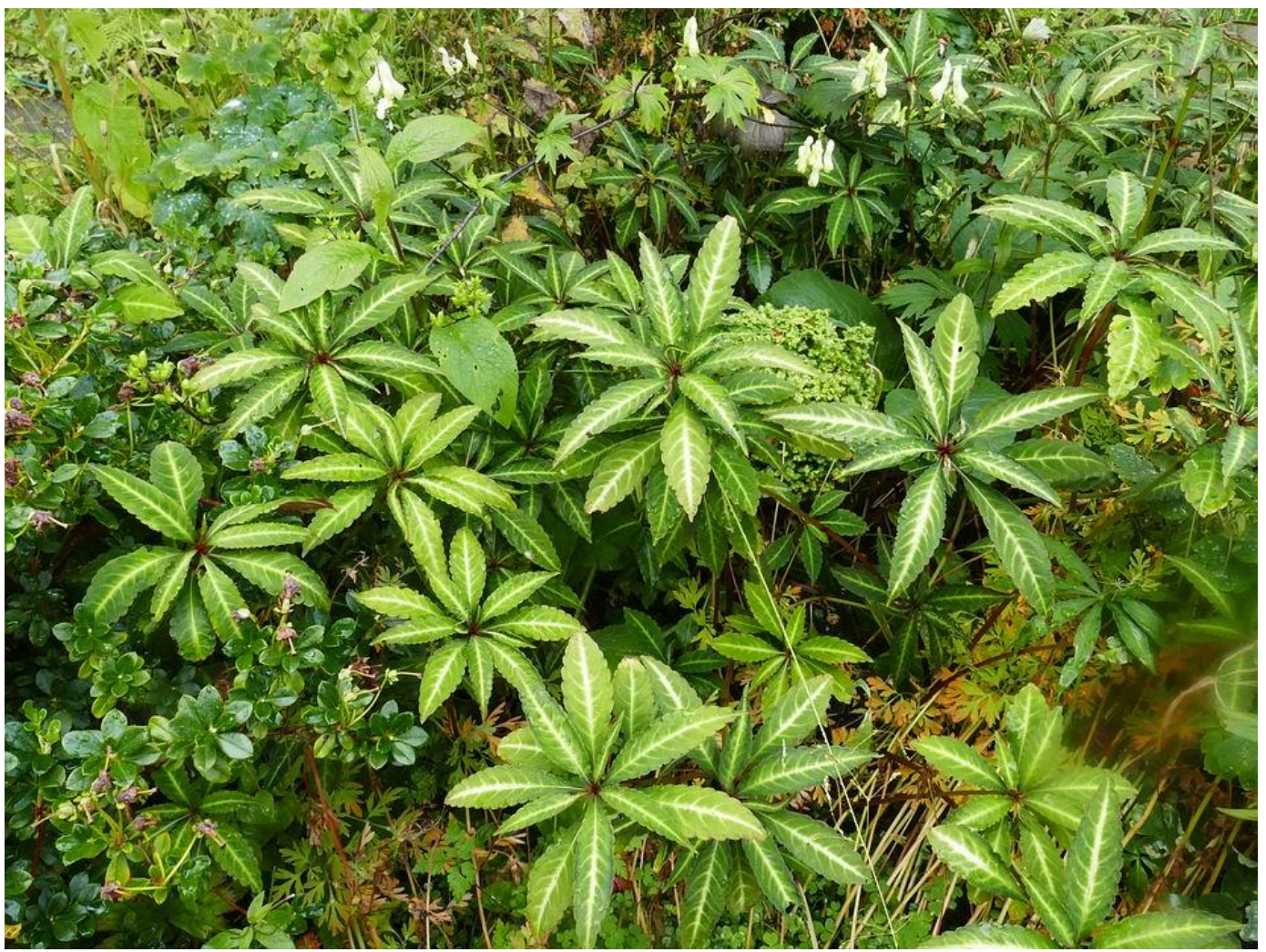
The artist in me is always looking at patterns, shapes and colours such as the striking leaves of Impatiens omeiana that before the rain were stilling limp but are now held up proudly having been revived by the rain