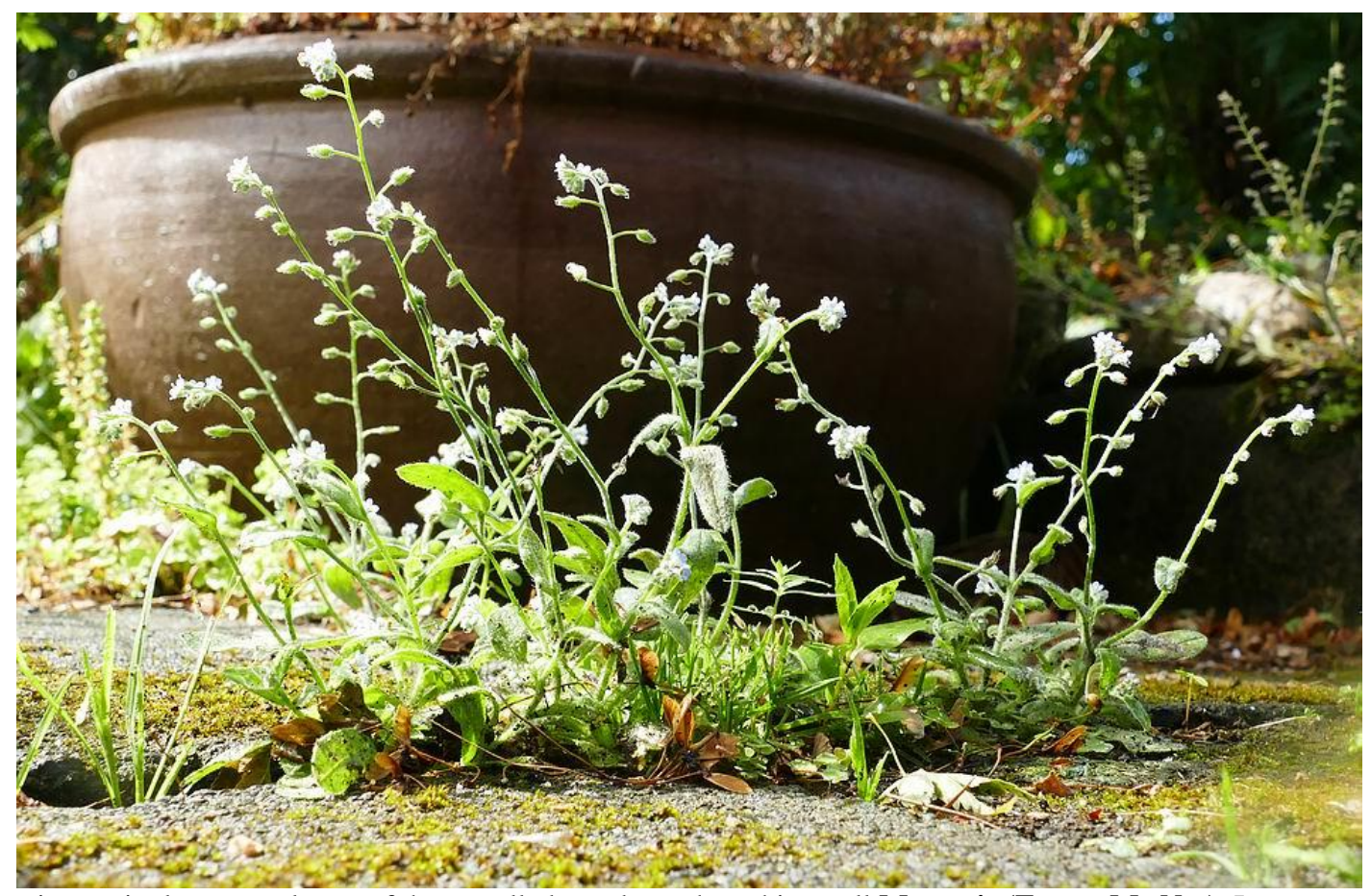
I get increasingly more tolerant of the so called weeds, such as this small Myosotis ( Forget Me Not ). In many cases if we look carefully they are equally as interesting and decorative as many of the more demanding plants that we strive to acquire and grow.