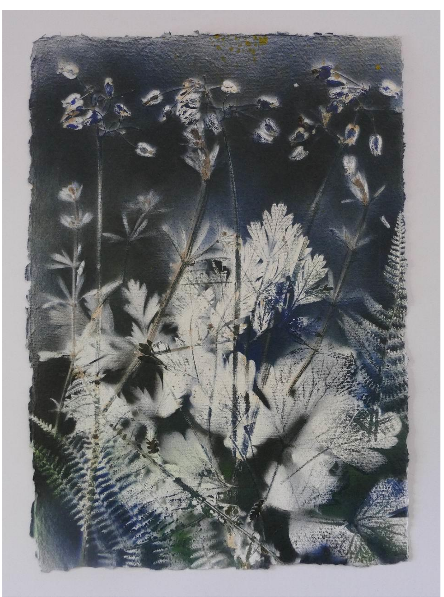
In this mixed media drawing on hand made paper I try make your eyes dart around focusing in on different areas or details. In just the same way as they do when you are in front of the actual scene or in the previous photograph you can never focus in on the whole work at the same time.