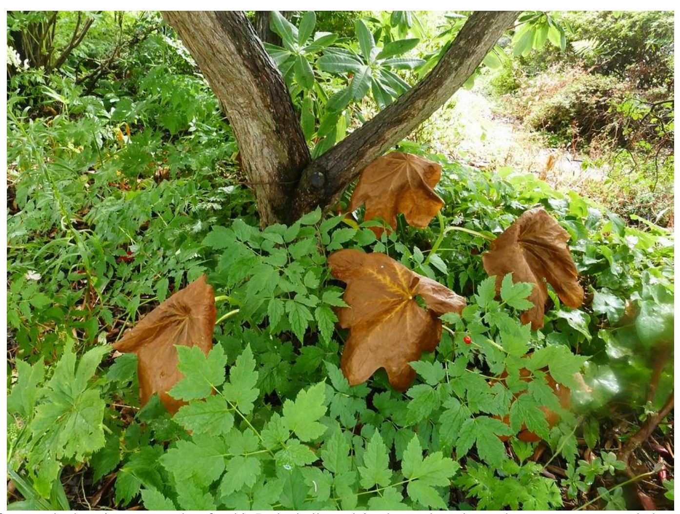
Unfortunately the rain came too late for this Podophyllum pleianthum whose leaves have gone prematurely brown however the previously floppy stems have become turgid again holding the brown leaves up above the Actea.