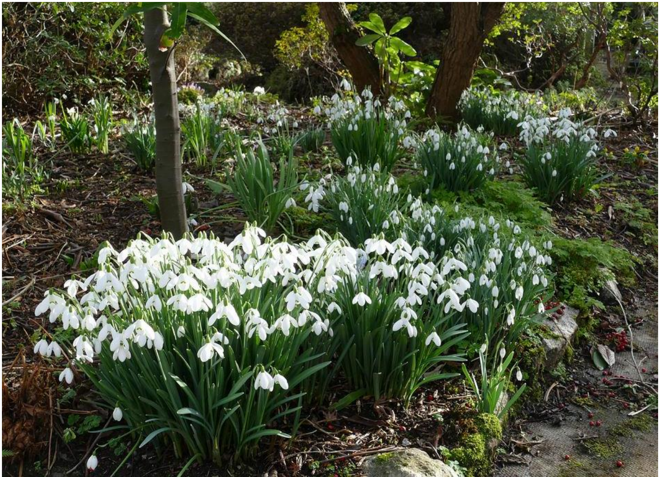
The final series of this week's images show a mix snowdrops opening their flowers in the sunshine.