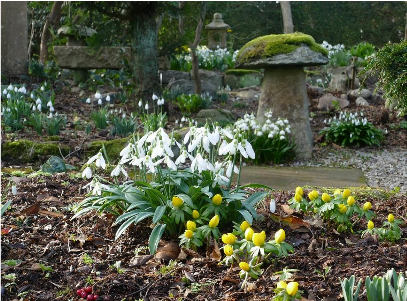
Eranthis, Galanthus and Leucojum combine in a flowering spectacular as the garden wakes up.