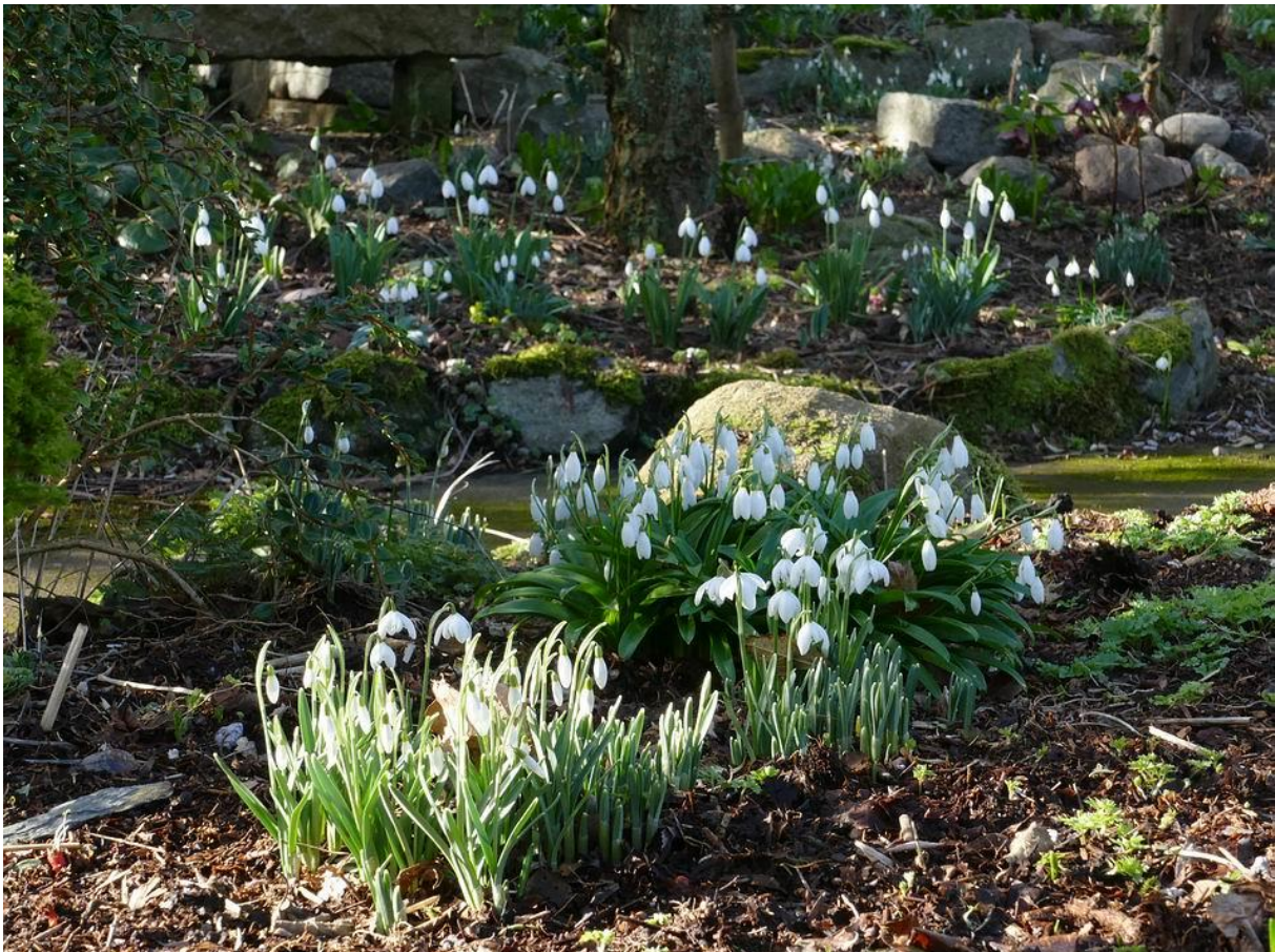
Snowdrops are spreading across the garden.

Narcissus 'Cedric Morris' is selection of Narcissus asturiensis which often flowers in December but despite being around for many years it remains a relatively uncommon plant. In the past I have built up good numbers of it but I have also found that it is one of these plants that can dwindle very quickly as it has recently done so I am working on building it back up again in a pot.