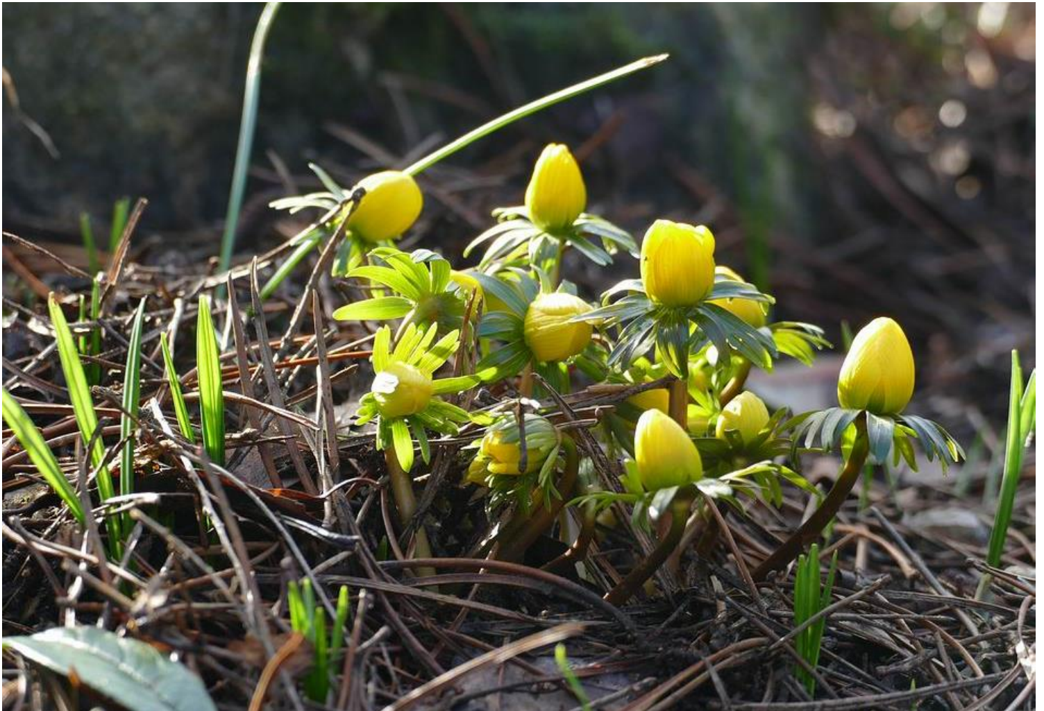
Eranthis 'Guinea Gold' does not set seed so needs increased by division - I will lift and divide it every three to five years.