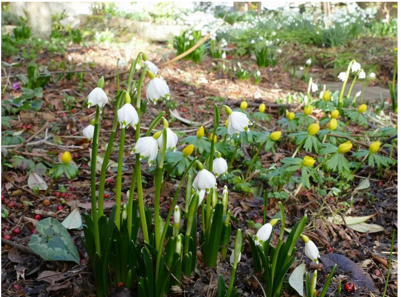
Leucojum vernum var. carpathicum