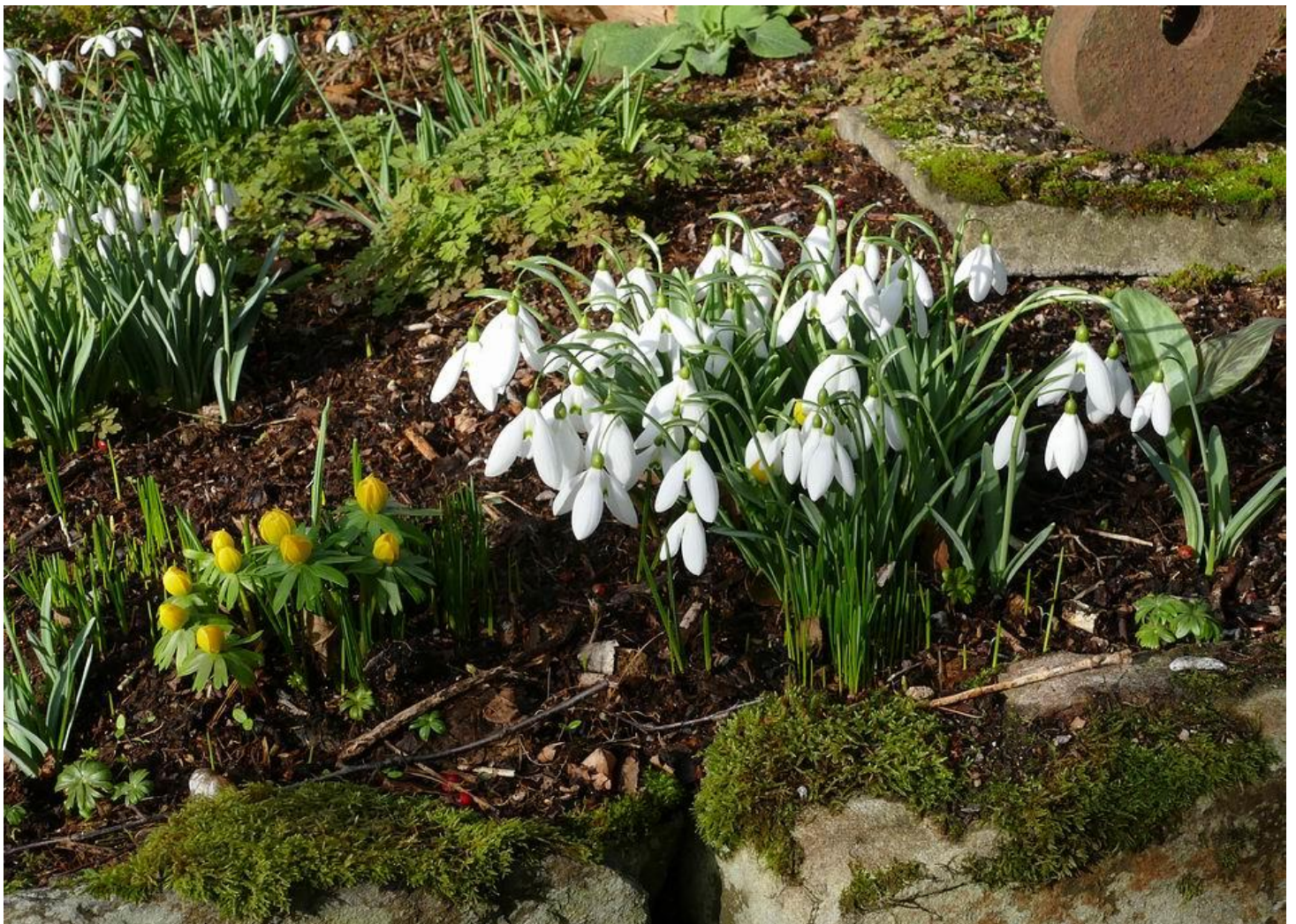
Eranthis hyemalis and Galanthus 'Mighty Atom' enjoying their moment in the sunshine.