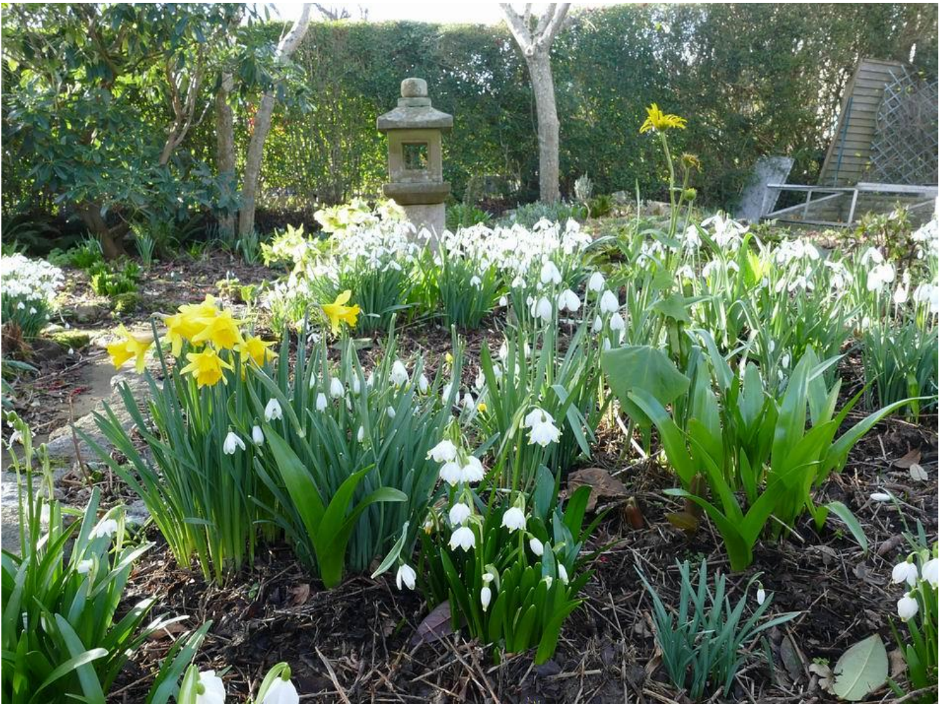
Narcissus flowers add yellow into the predominately white wave that is currently flowing over the garden.