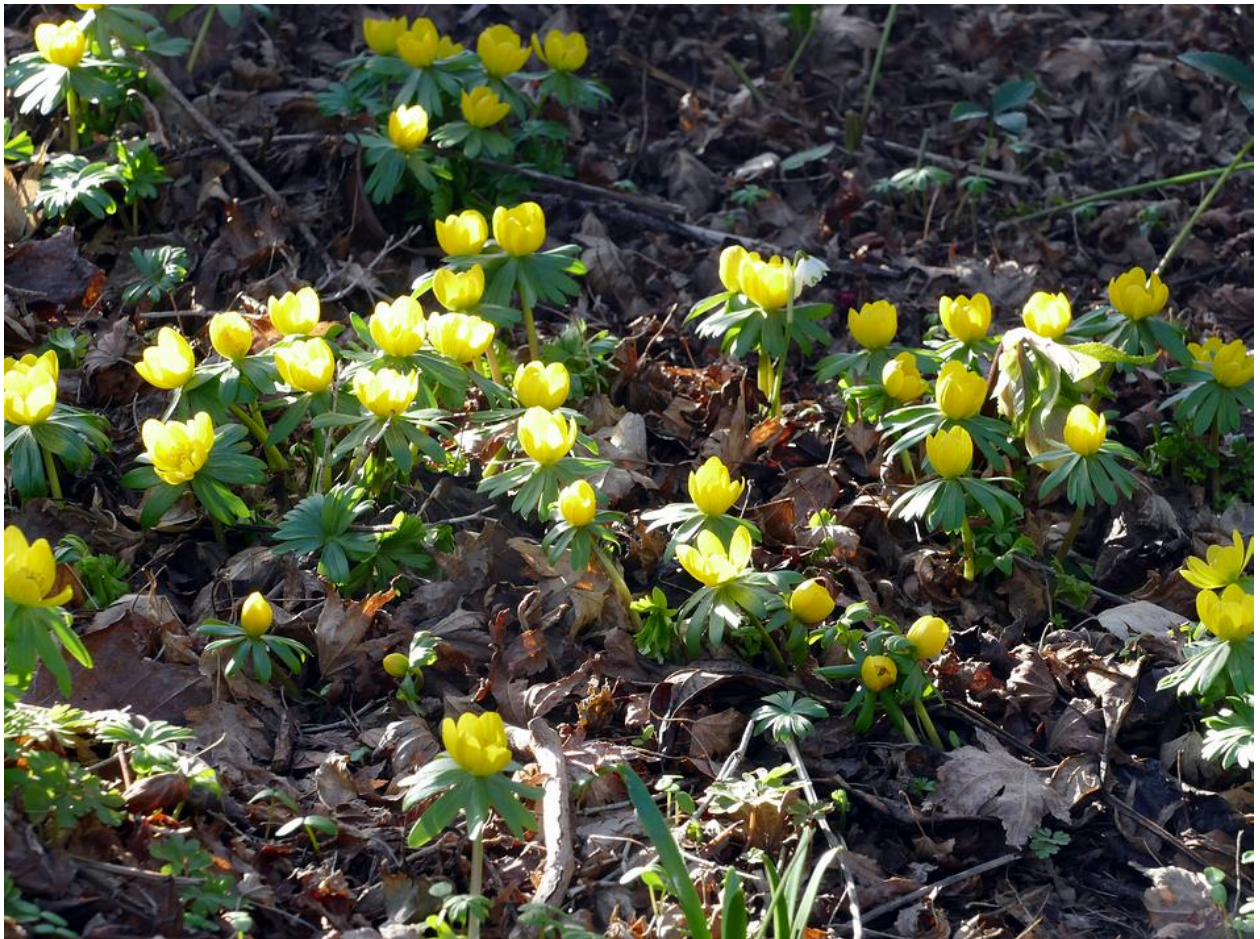
This week it got warm enough in the sunshine (6C) for the Eranthis hyemalis flowers to open.