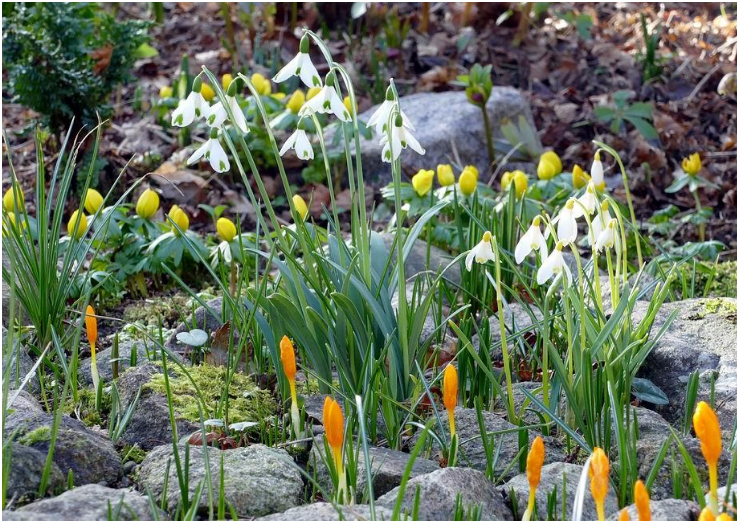
Crocus thirkianus, Galanthus cultivars and Eranthis hyemalis