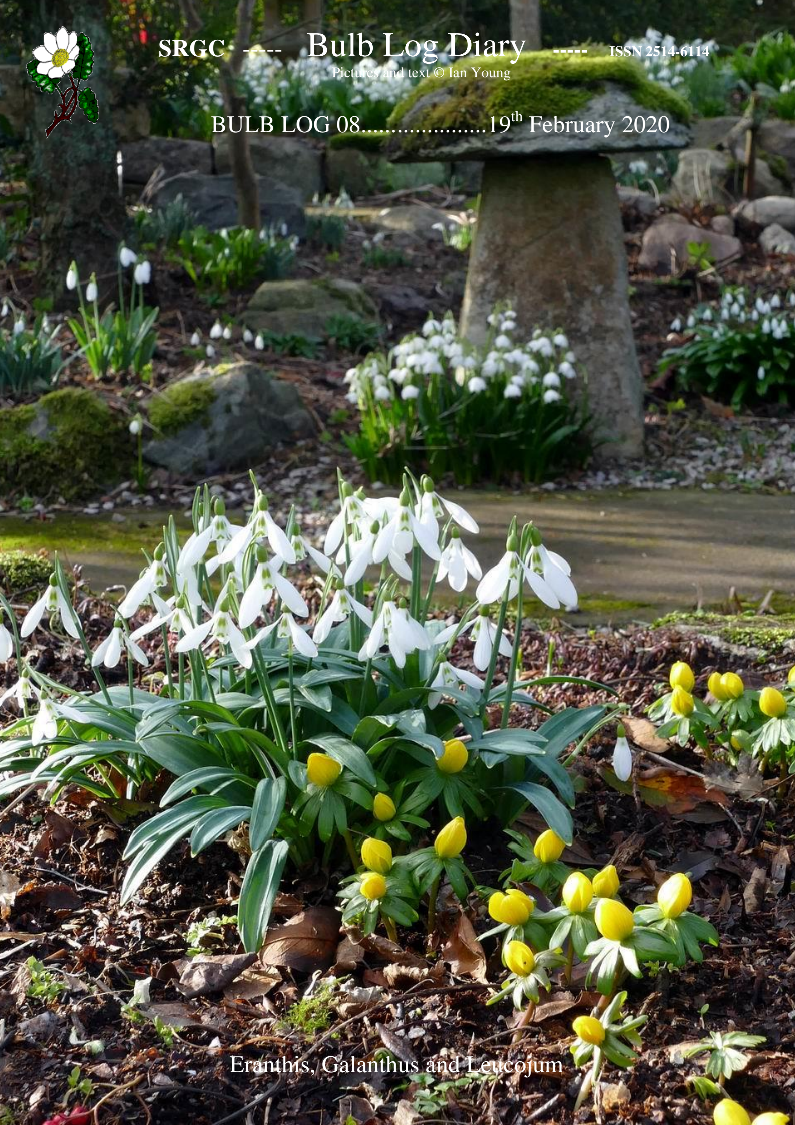
Eranthis, Galanthus and Leucojum