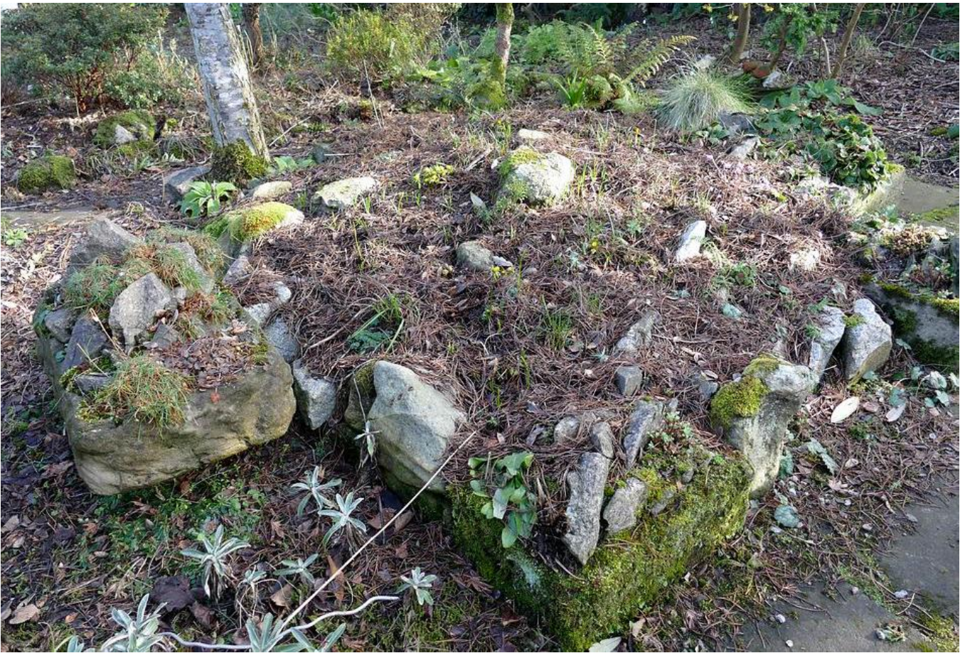
The blackbirds have been foraging in the new bed beside the pond, scattering the mulch of pine needles that I had carefully applied, exposing some emerging shoots and covering other plants.