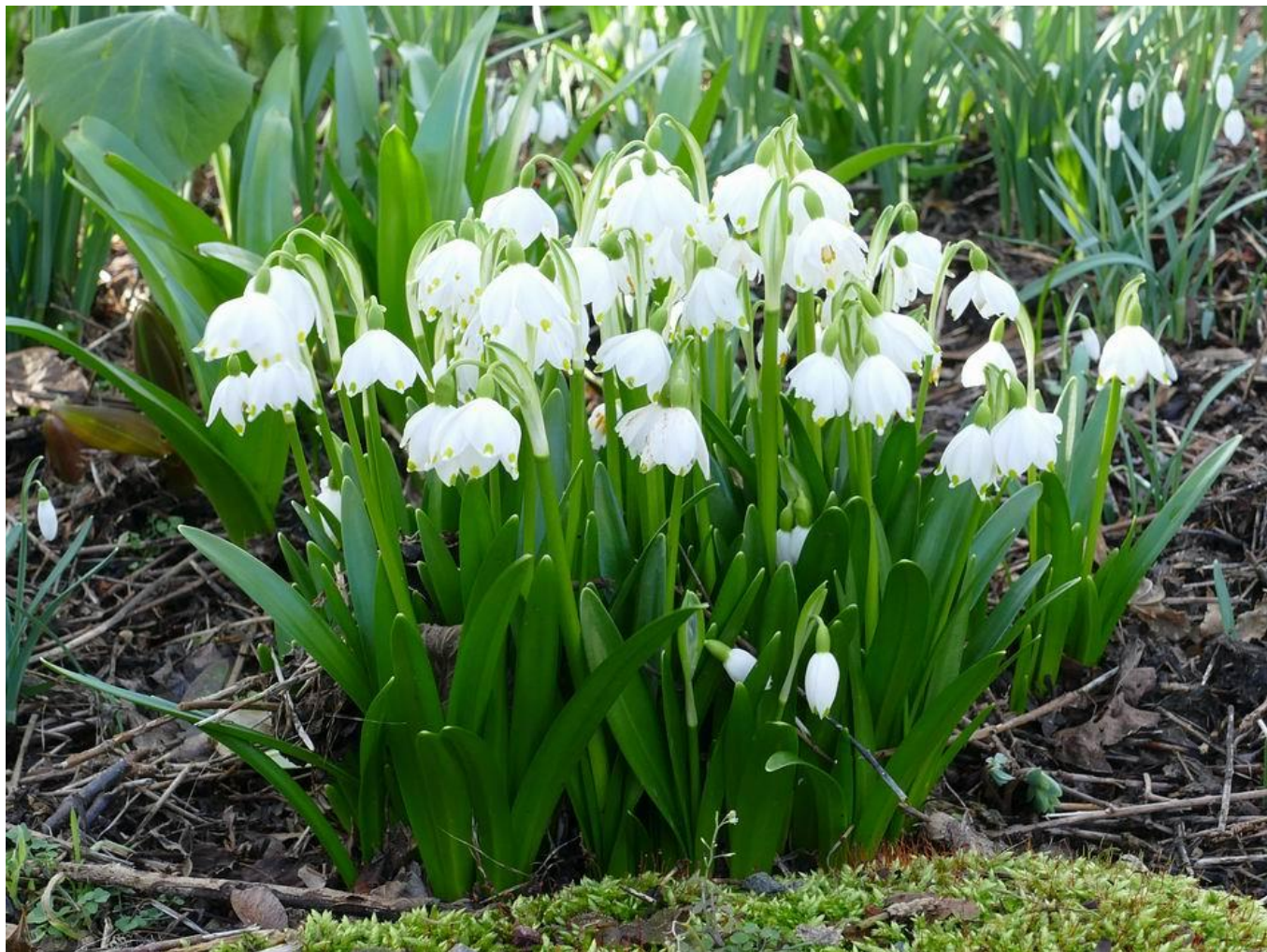
Leucojum vernum 'Podpolozje'