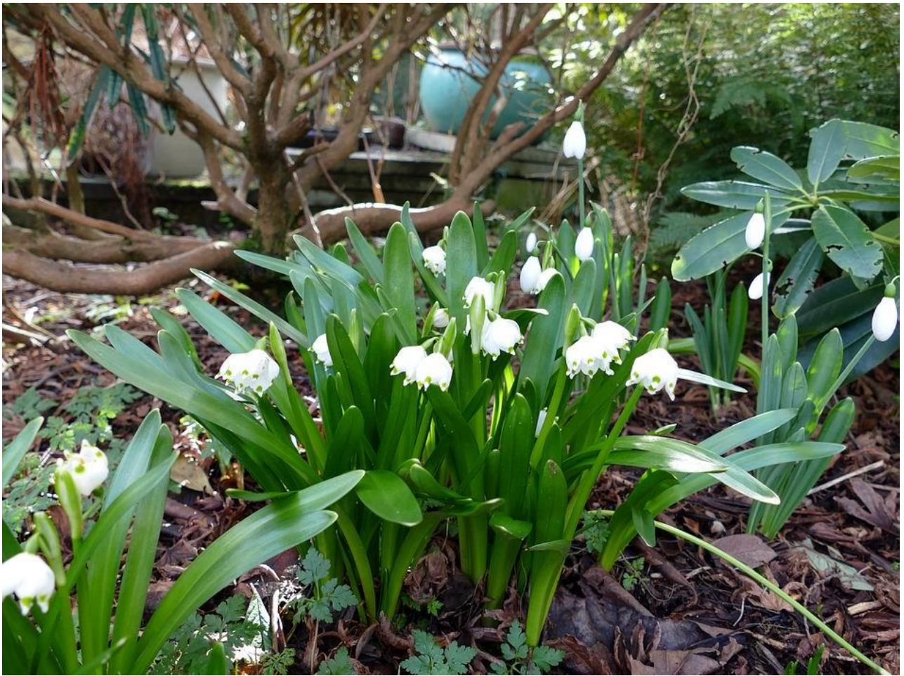
Leucojum vernum var. vagneri