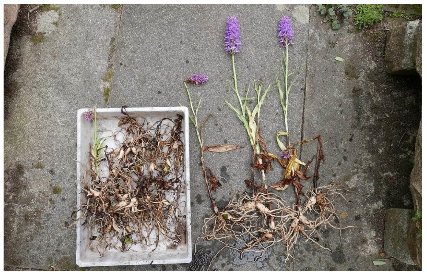
This is the total of the Dactylorhiza tuber removed from this one trough some of which I have planted back into the trough while I have planted the others elsewhere.