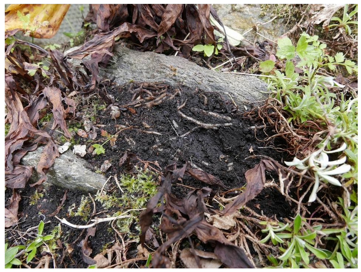
As soon as I started to remove the leaves to get the rocks out of the trough I saw a mass of healthy Dactylorhiza roots almost at the surface