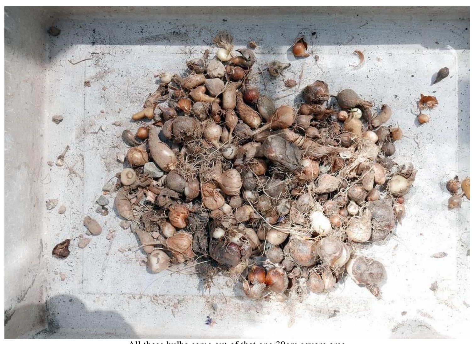
All these bulbs came out of that one 30cm square area.