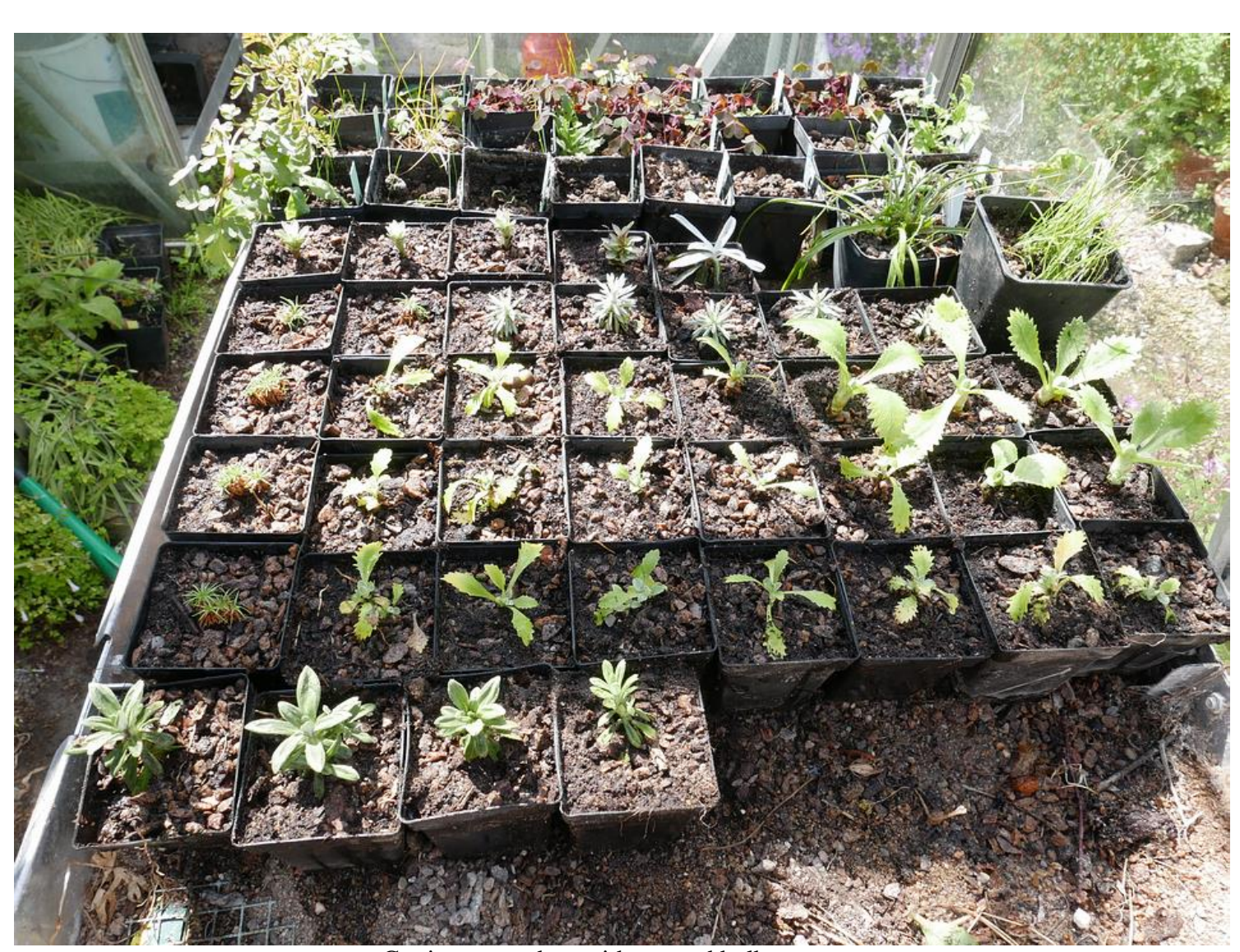
Cuttings potted up with re-used bulb compost.

Regular readers will remember in Bulb Log 2019 I showed the mist propagation unit full of cuttings these rooted Celmisia cuttings are ready for potting on now and as they will only be grown in pots for a short time I am recycling the compost from the bulb repotting and using that to pot up the cuttings.