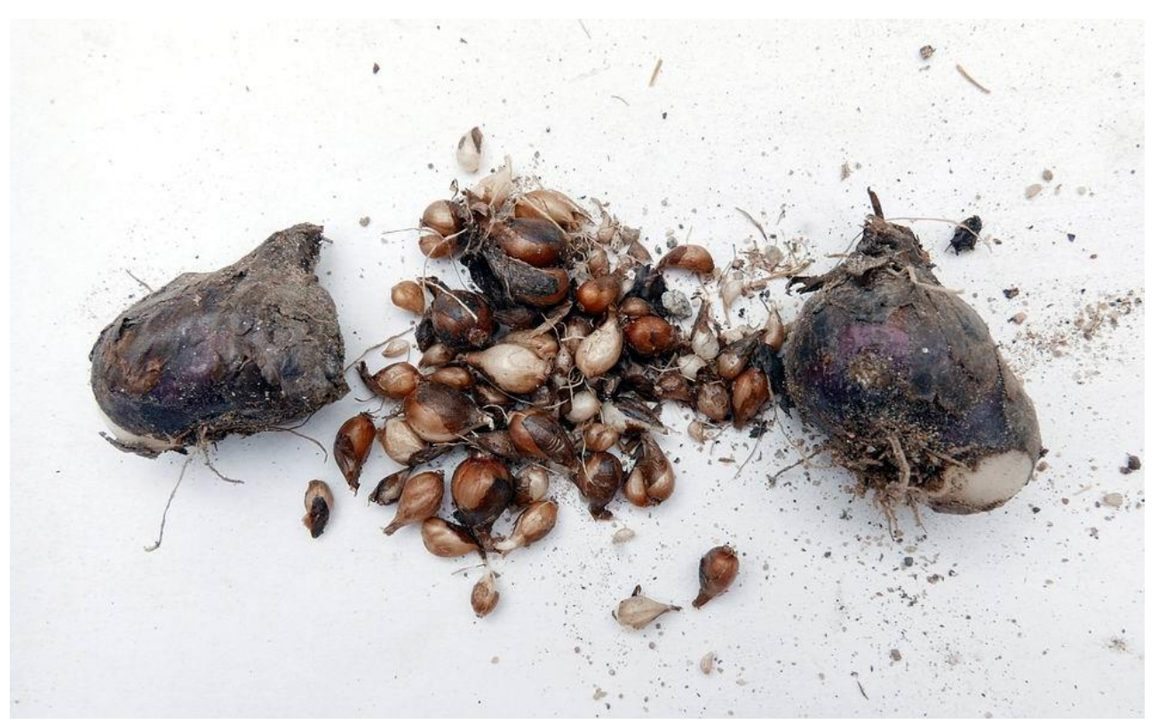
The two large bulbs above came from a good depth in the sand bed while the mass of tiny ones are the result of that bulb being planted too near the surface where it dries out more causing the bulb to break down into many smaller ones.