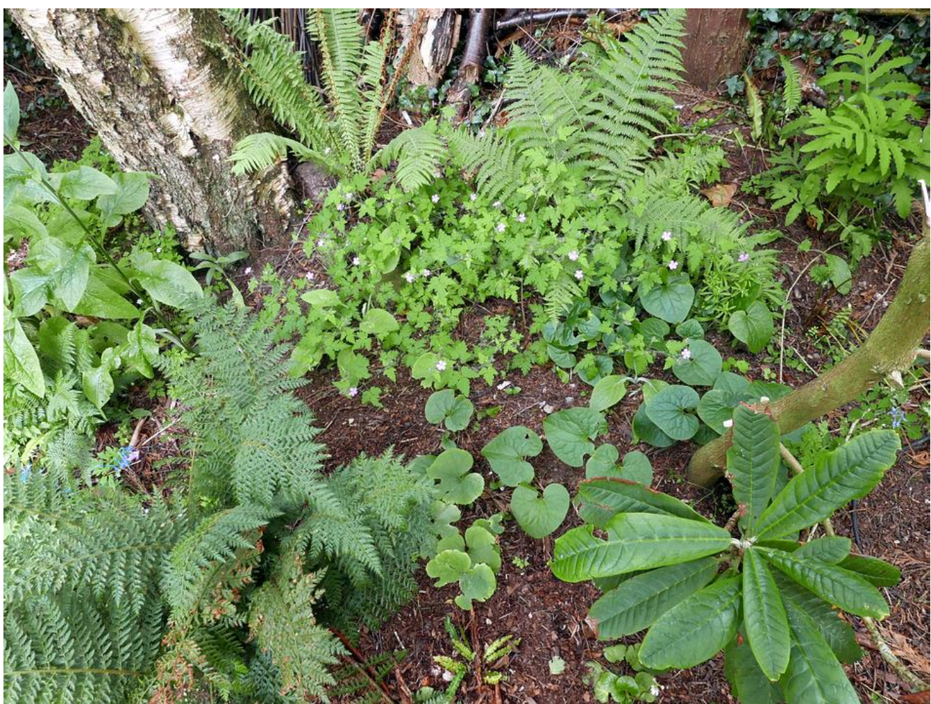
This could be considered one of the most problematic planting areas in the garden – it is at the back of the area I opened up recently by removing a dense growth of shrubs. At the base of a large Betula, also shaded by other trees and shrubs, I am building up a tapestry of foliage plants that should tolerate this habitat. I have also planted Galanthus and some other bulbs that will flower early before the deciduous canopy develops.

Ferns come in all sizes from the large to the small and depending on your selection they can grow in a wide range of habitats from full sun to full shade.