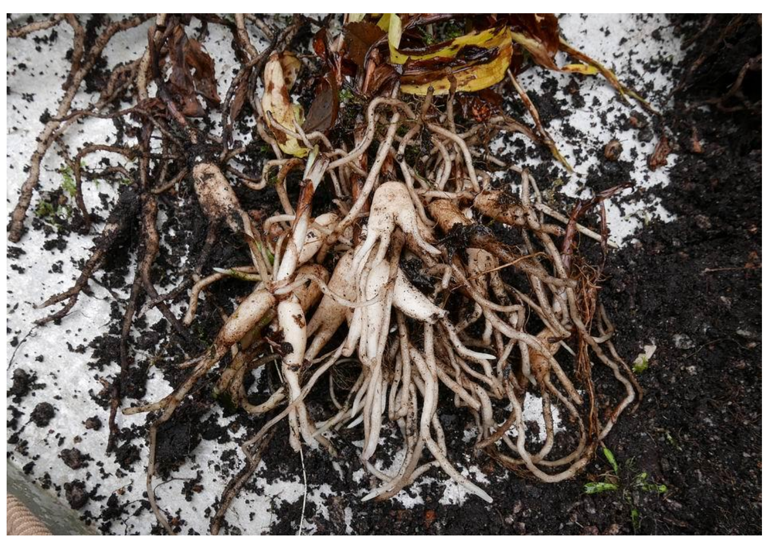
This is the same clump shown in the previous picture washed off so you can clearly see the lighter coloured new tubers, these will support next year's growth, growing beside this seasons the slightly darker ones.

I did speculate that the stress to the plants caused by competition and the congestion of tubers could be a contributory factor for whatever has caused this particular die back. I suspect the weather may be another factor as the majority of those affected were the ones that were first into growth this year.