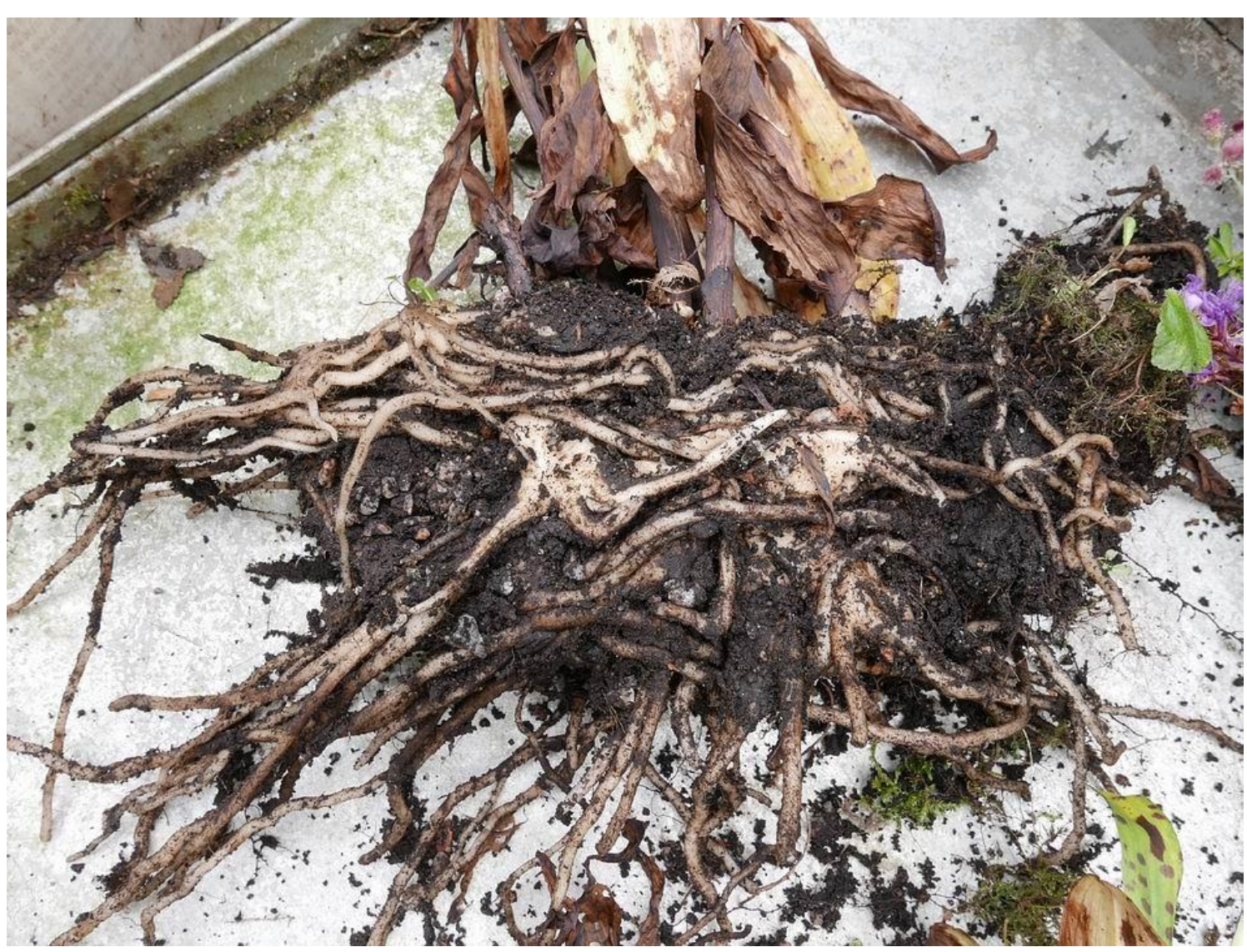
Once I got them out I can see that the tubers and roots were, as I suspected, very congested and pressed against the rocks.