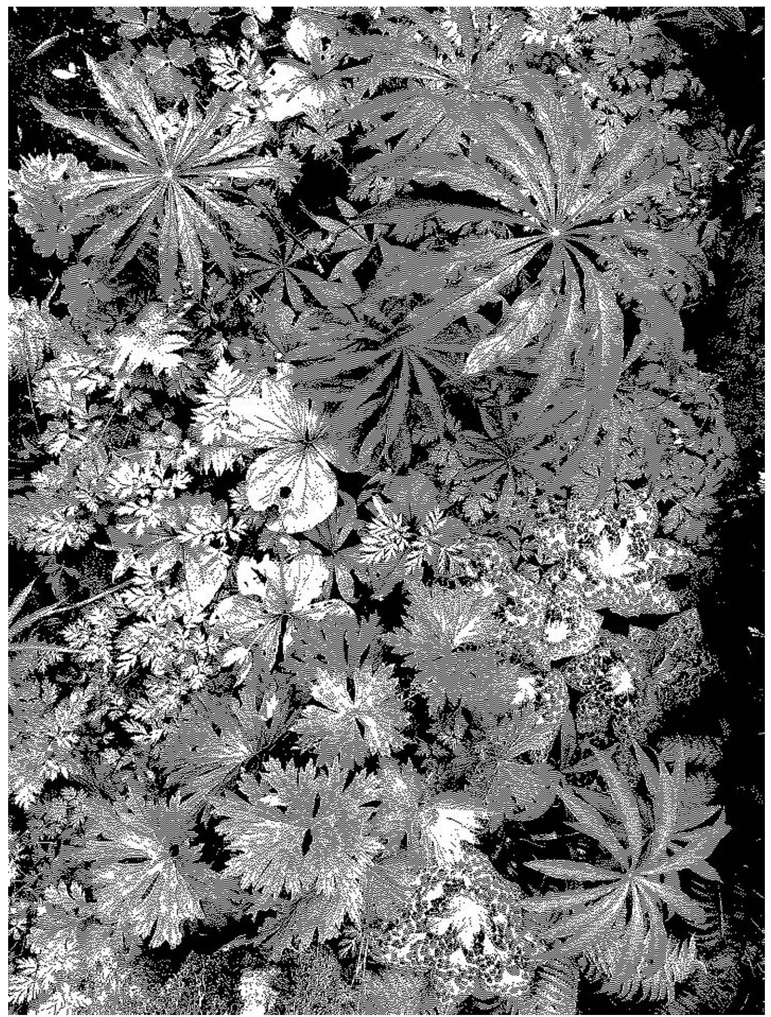
In simple black and white the image takes on a more abstract look allowing us to see the shapes. There is good news that Kelly Jones, Washington State, USA, has volunteered to take on the indexing for 2019, showing what a great international comunitity we have. I will leave you this week with a link to the latest <u>Bulb Log Video Diary Supplement</u> this one featuring the front garden drive way plantings.......