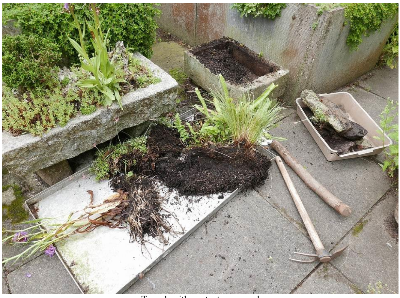
Trough with contents removed