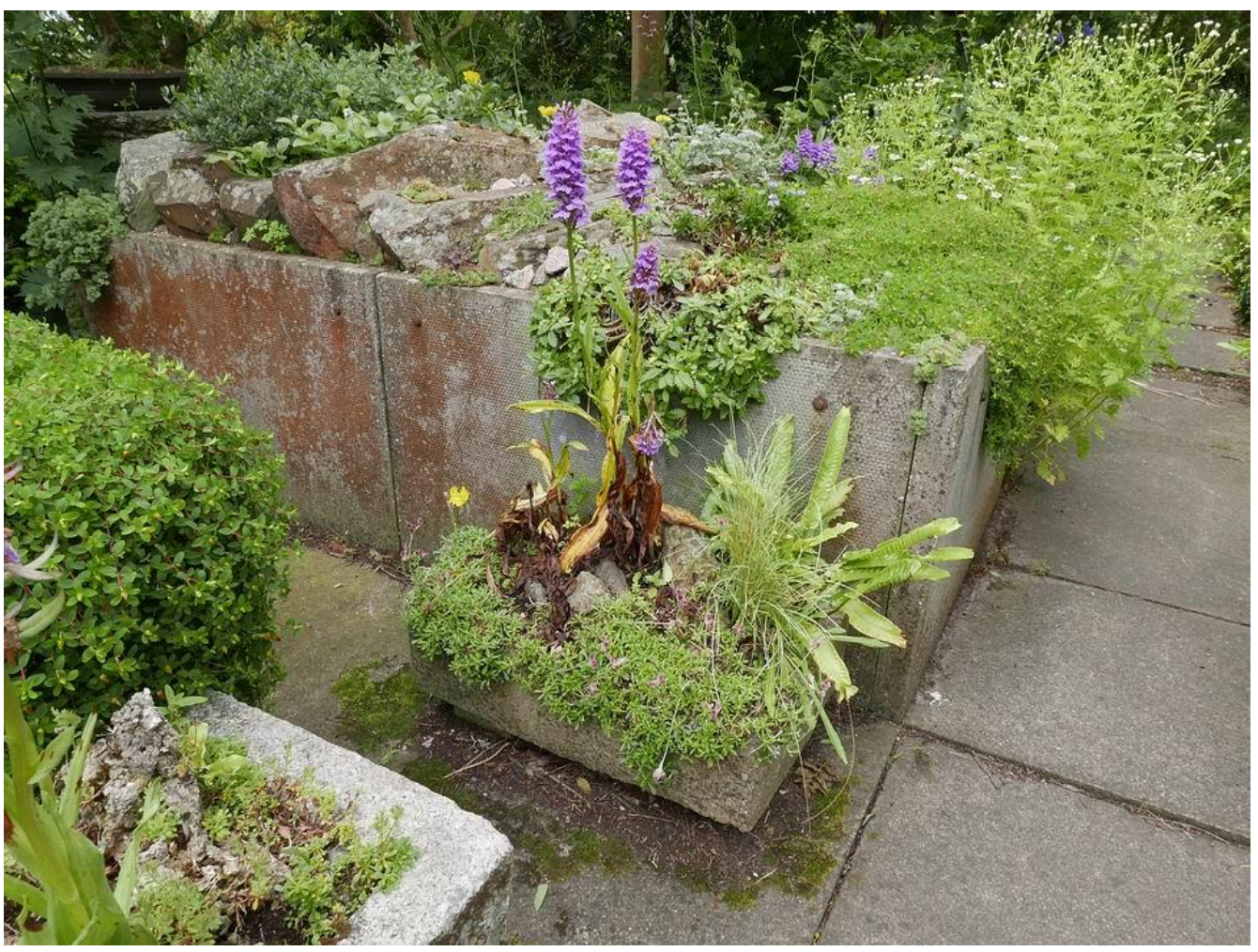
I am returning to the subject of the damage to the Dactylorhiza namely the browning and dying back of the stems and leaves of some of the plants, such as in this trough, which I have decided to investigate further.