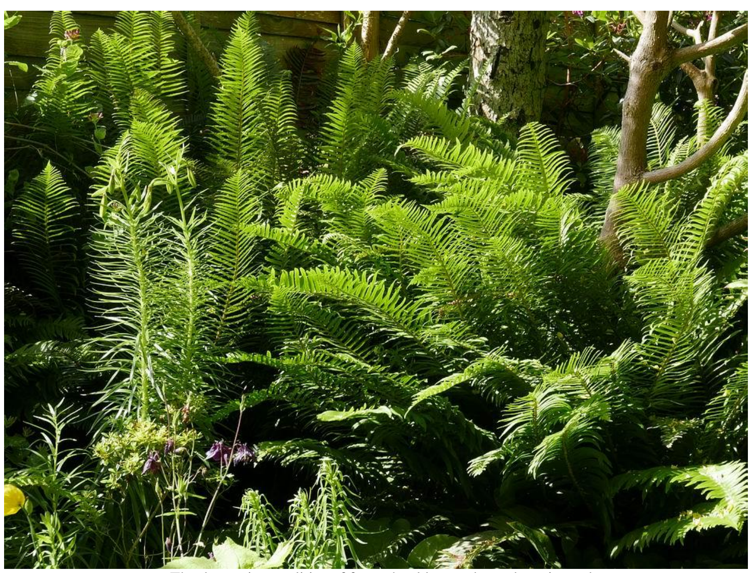
The decorative qualities of ferns should never be underestimated.

The following series of pictures celebrates foliage.