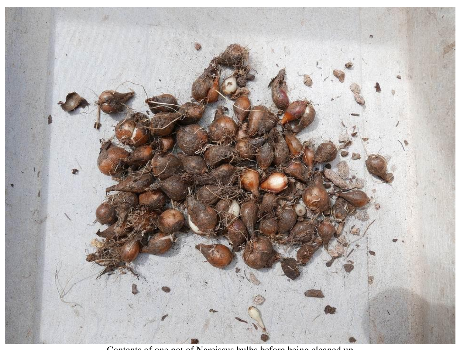
Contents of one pot of Narcissus bulbs before being cleaned up.