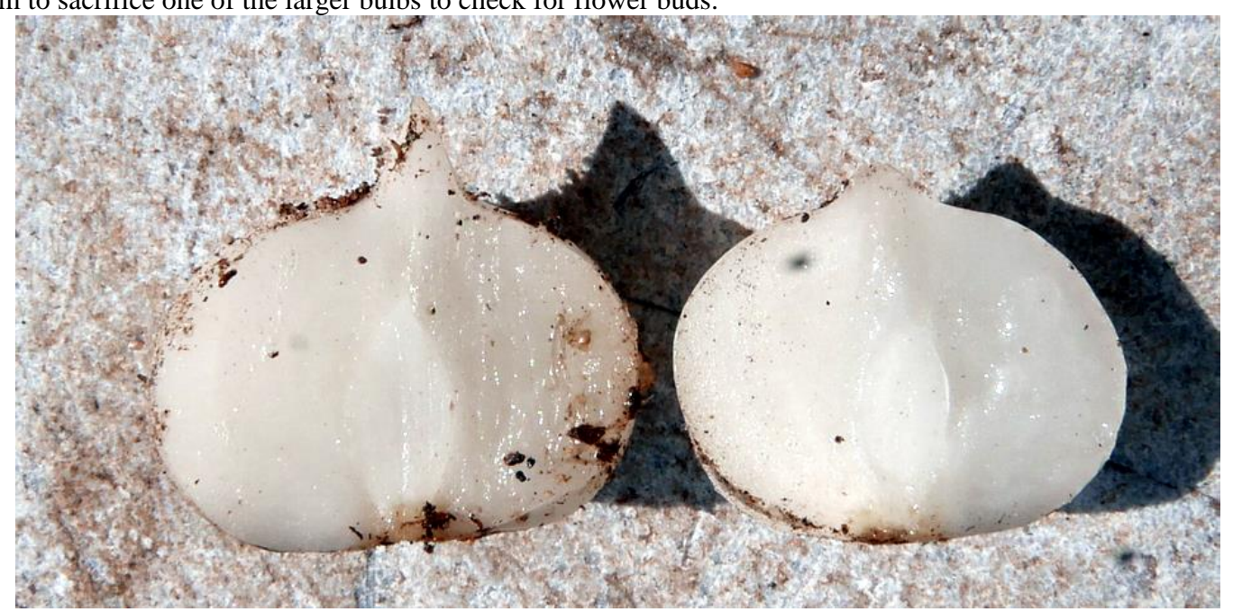
I can see the cenral bud within the scales but despite this being one of the largest of the bulbs there is no evidence of a flower. This is not conclusive as it is possible that this bulb would not have flowered so I have marked the pot