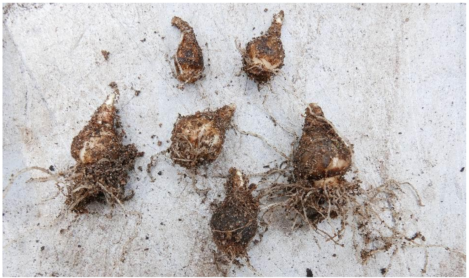
You would think at this time all the narcissus bulbs would be dormant but if there is the slightest amount of water present certain types, mostly forms of Narcissus bulbocodium , will have new roots emerging. I will keep the compost of these just moist, to preserve the roots.