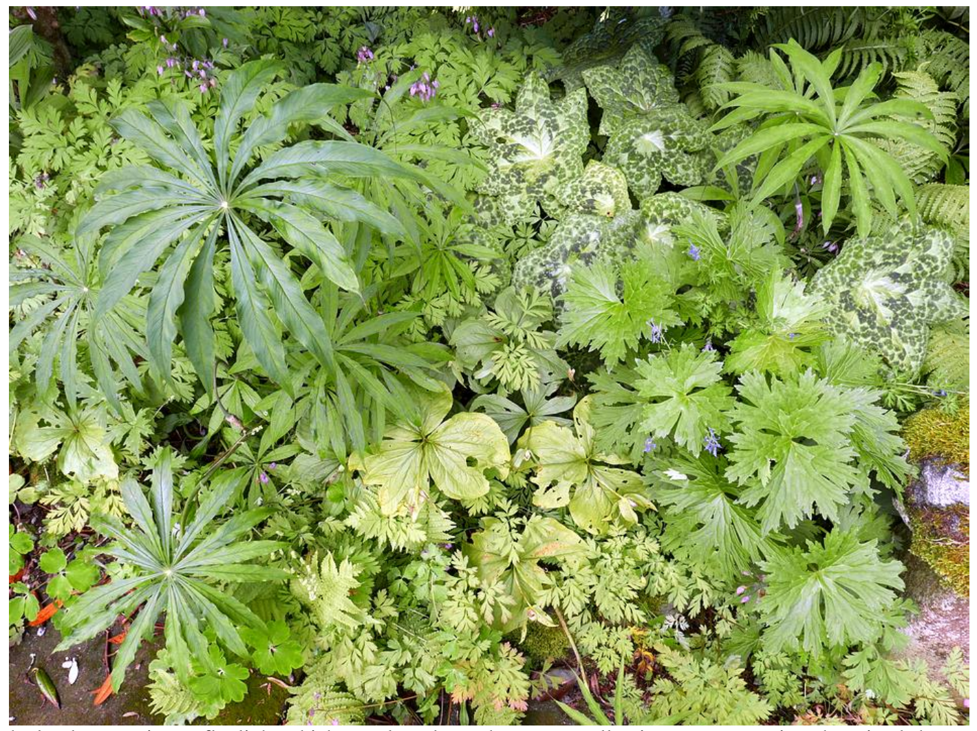
High cloud cover gives a flat light which greatly reduces the contrast allowing us to appreciate the mixed shape, form and texture of the greenery which includes Aconitum, Aquilegia, Arisaema, Dicentra, Podophyllum, Trillium and ferns.