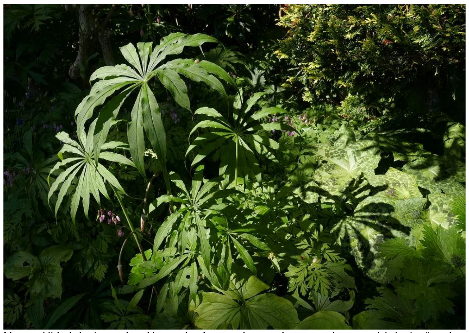
More established plantings such as this one, also shown on the cover, have a complex sequential planting from the carpets of early flowering bulbs through various waves of colour to the foliage that now plays the starring role.