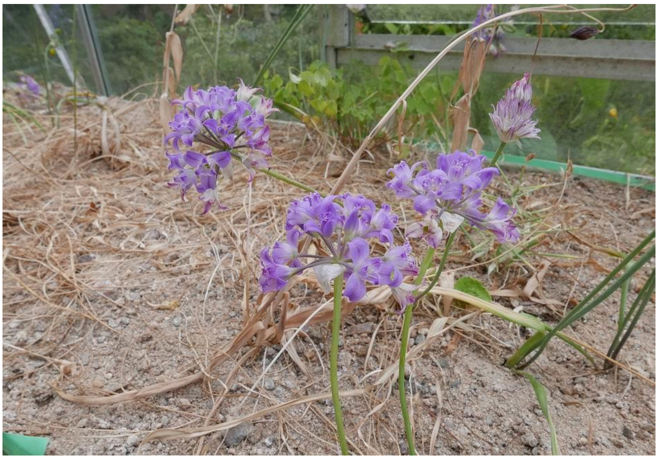
Allium crispum and Allium gomphrenoides

Allium crispum has relatively large petals making them stand out as one of the showiest of these small onions but the complexity of the inflorescences makes them all worthy of the attention of my camera.