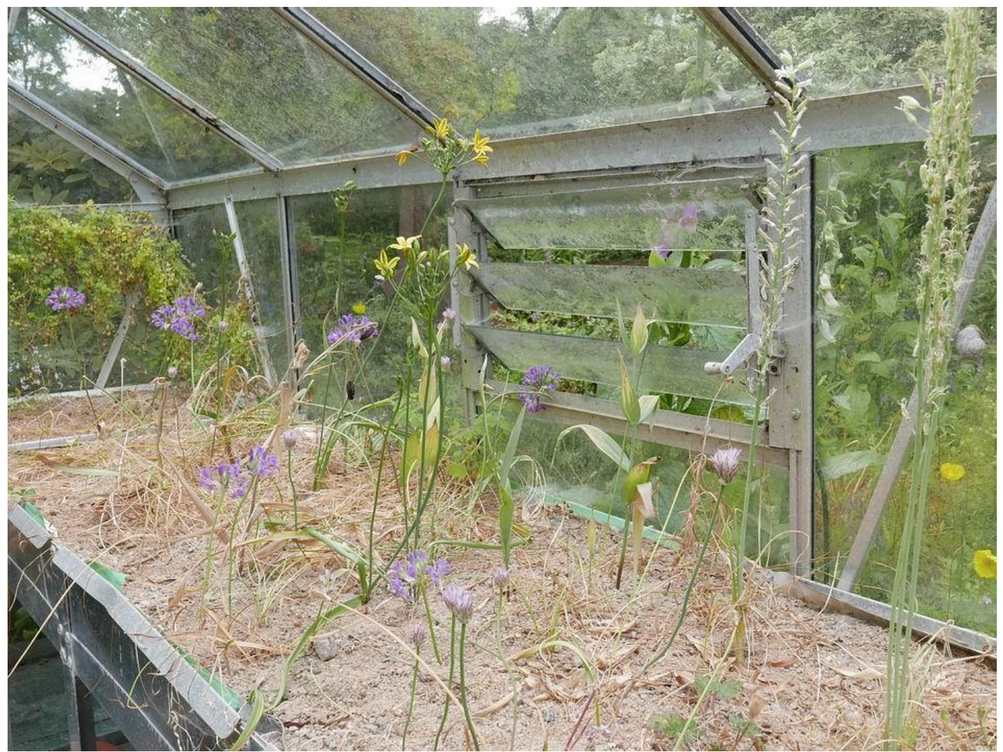
Allium crispum, Allium gomphrenoides, Triteleia ixioides and Ornithogalum sp.

I have been trying to find bulbs for the sand beds that will produce flowers into June and July while tolerating or even thriving in the Mediterranean type regime of winter wet leading on to a dry summer. I seem to be finding a few that are proving suitable bringing the colour of their flowers to that period.