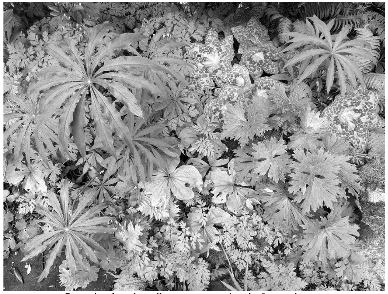
Removing the colour allows us to appreciate the form and tones.