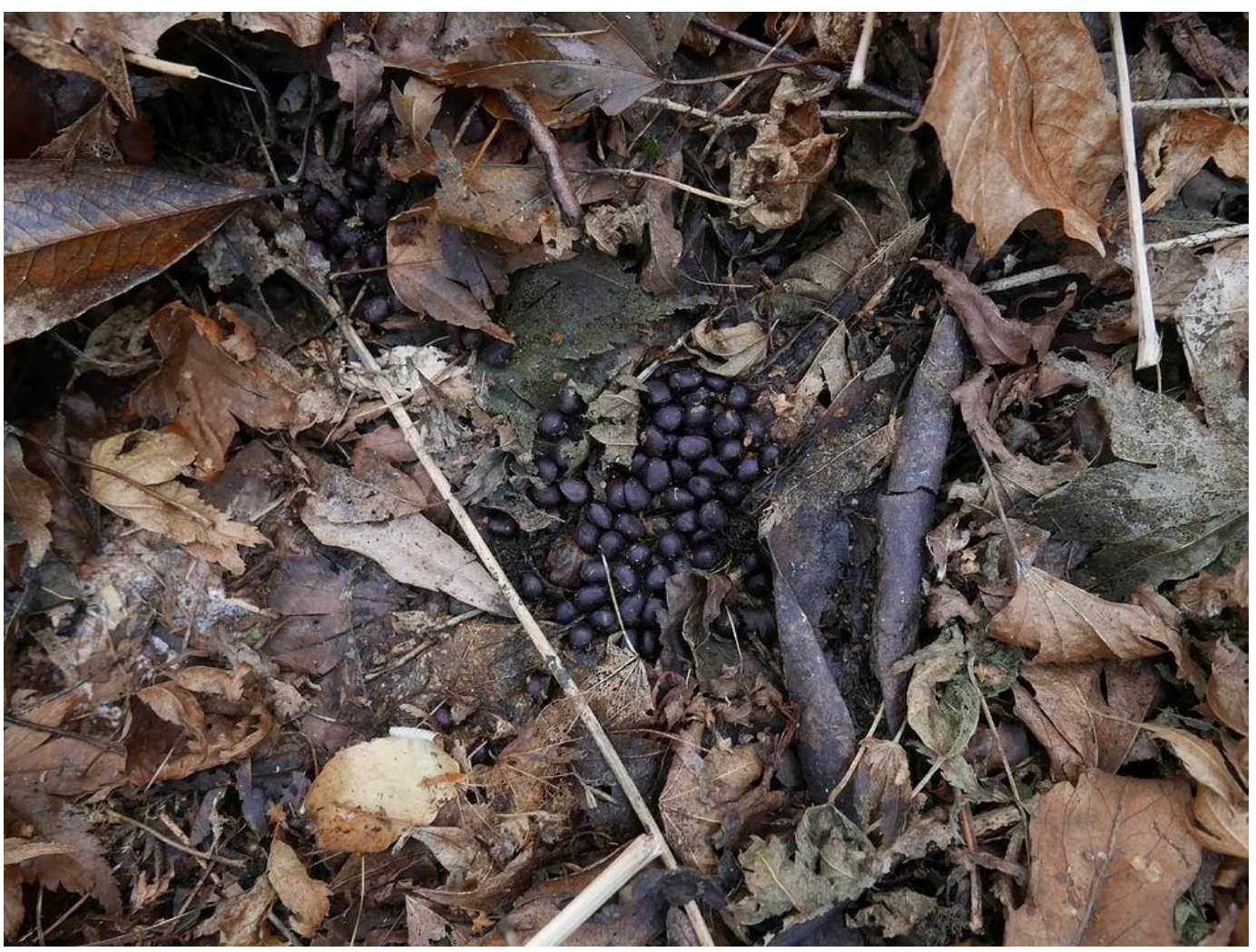
I uncovered these Podophyllum hexandrum seeds lying in groups where the fruit that contained them fell and disintegrated show no outward signs of germinating while the nearby Eranthis hyemalis seeds are in active growth. The mechanisms which govern when seeds germinate and plants grow always fascinated me.