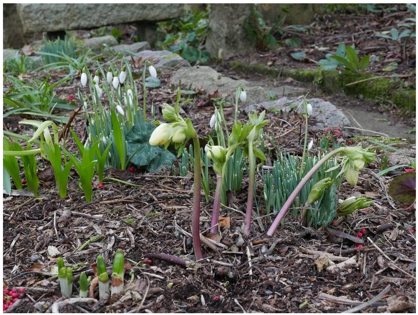
Some of our hellebores are showing the colour of their bubs and flowers which is around the same stage of growth as this time last year but then we got hit with a prolonged period of severe cold which for the first time I can remember caused frost damage to the hellebores in our garden.

The same conditions of 'Sudden Stratospheric Warming' that lead to last year's cold weather conditions are again present and depending on how this affects the Polar Vortex and the Jet Stream we may get a similarly long cold end to winter again this year.