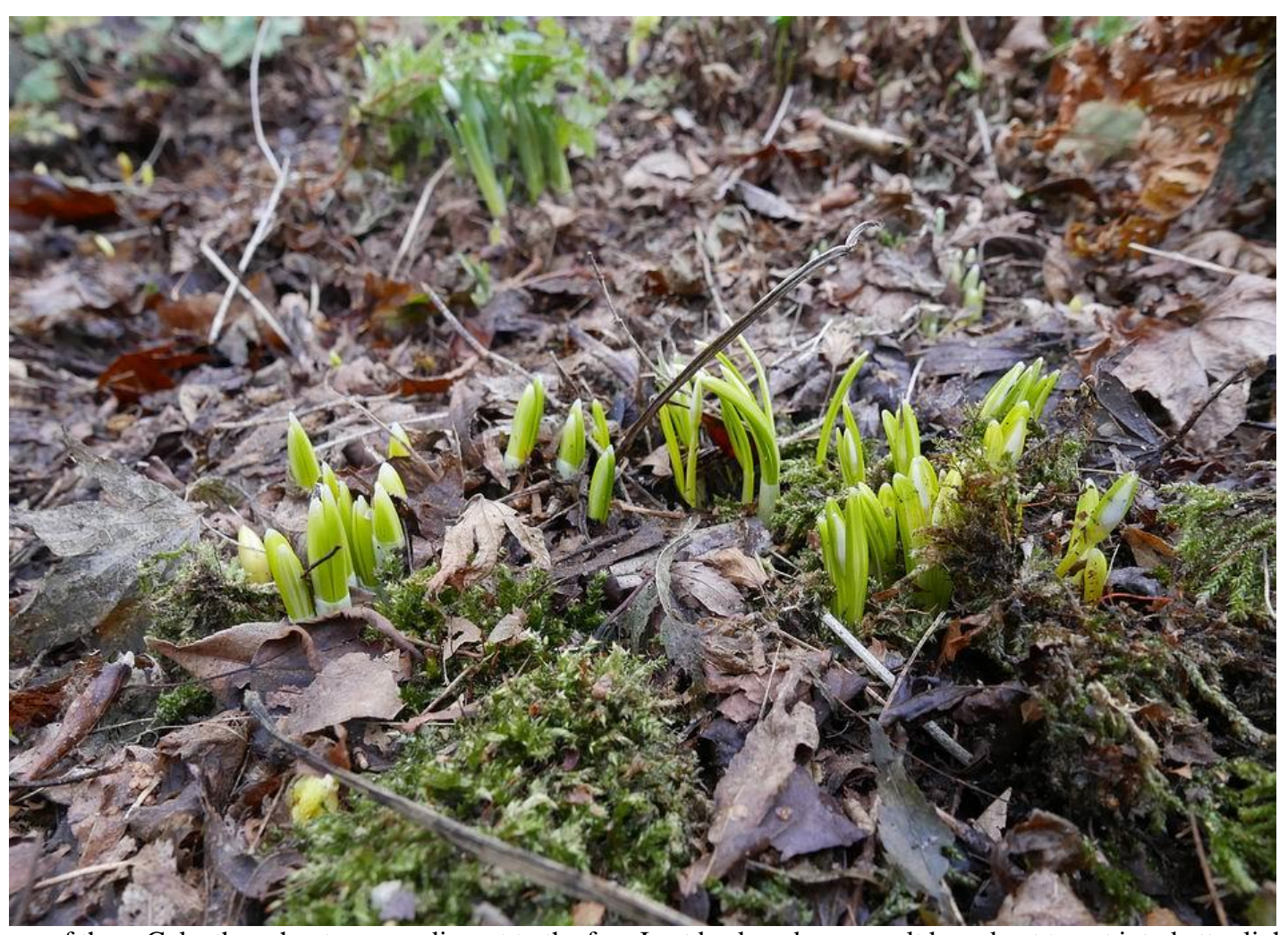
Some of these Galanthus shoots were adjacent to the fern I cut back and as a result have bent to get into better light, now they will grow straight.