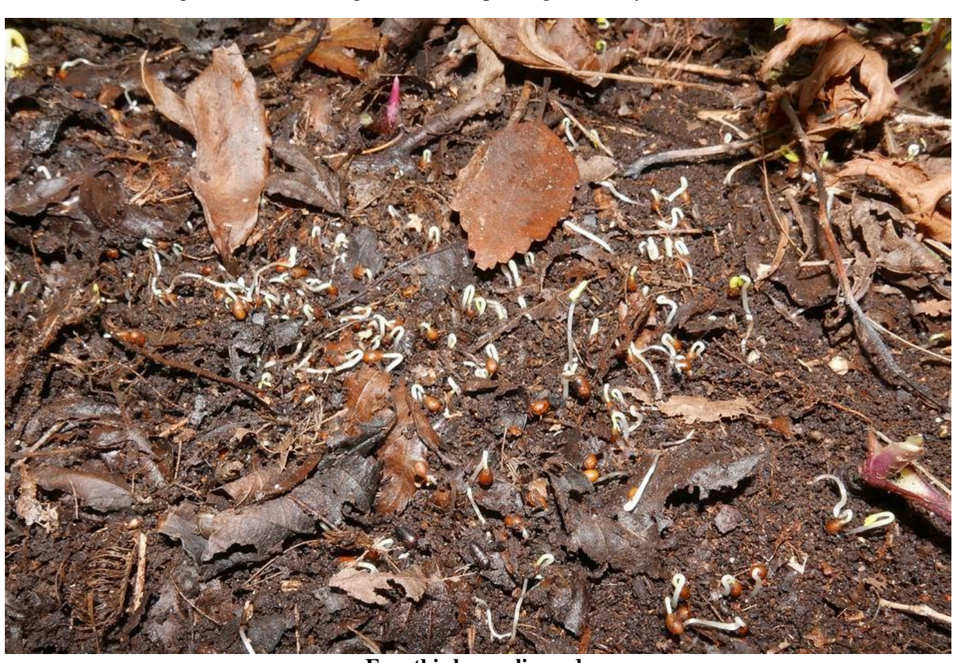
Eranthis hyemalis seeds