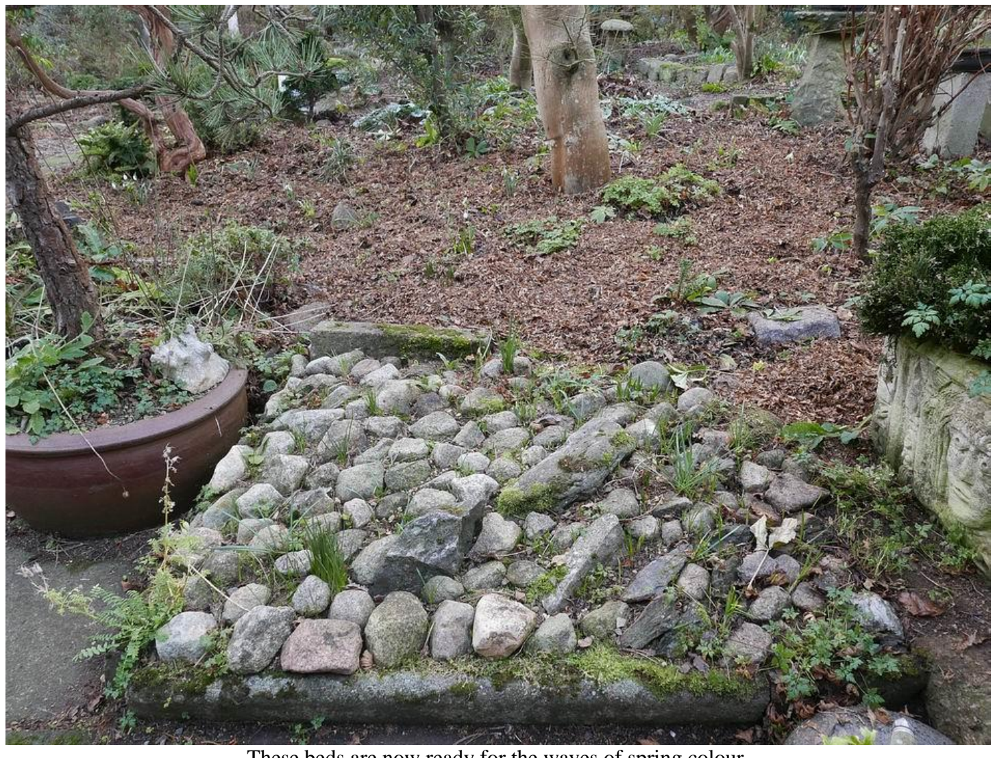
These beds are now ready for the waves of spring colour.