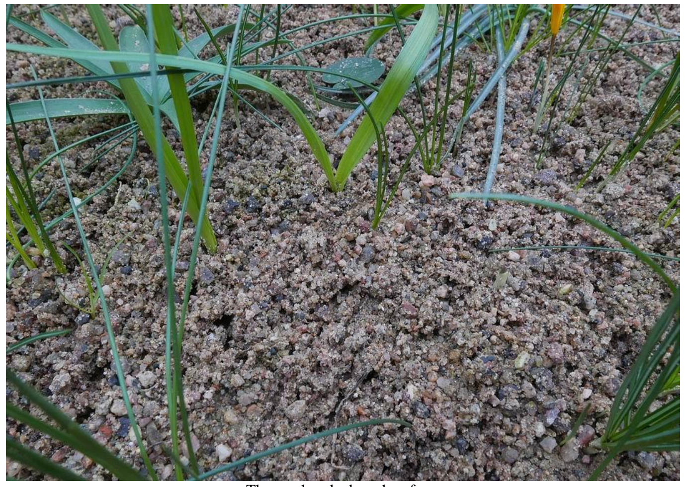
The newly raked sand surface.