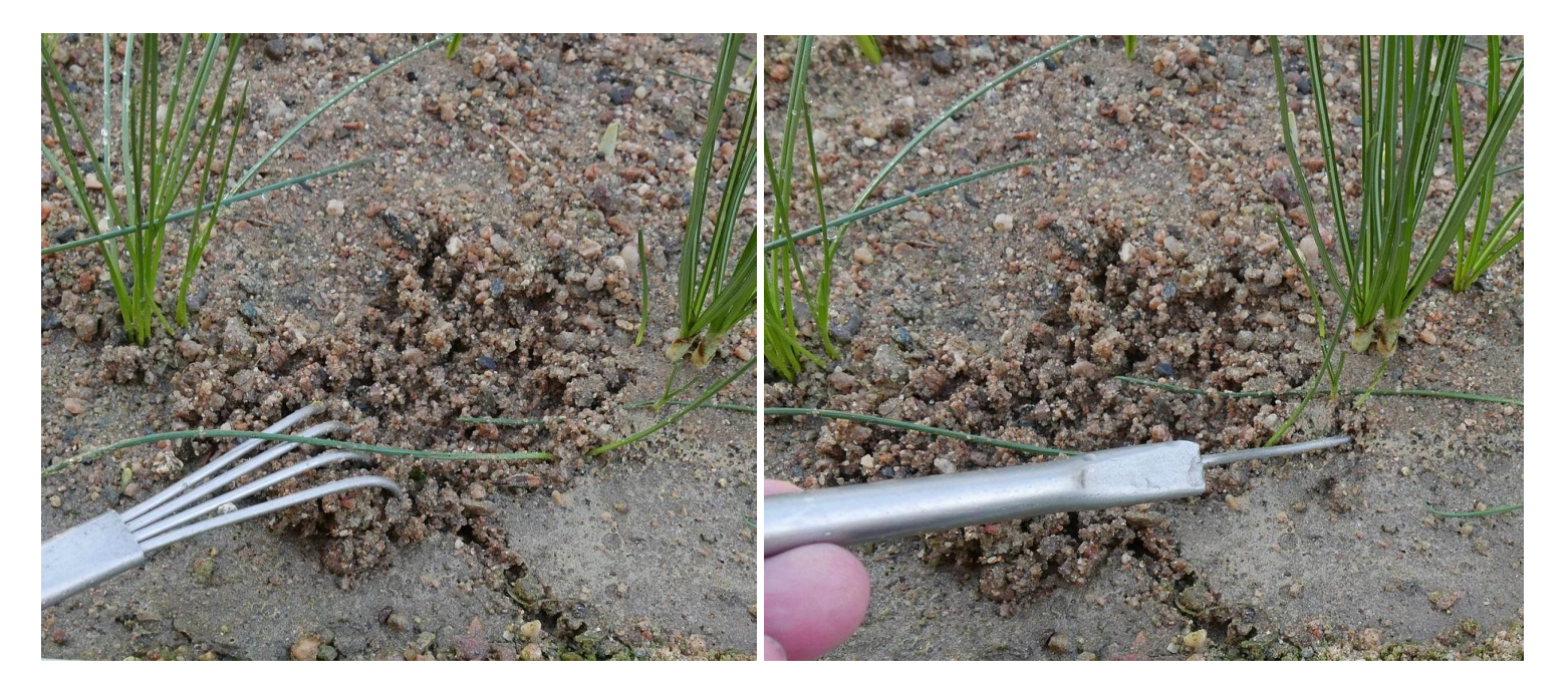
I go around scratching the surface using a small rake or fork in the larger open areas but where there is more growth and shoots I use the other end which has a single spike. I enjoy this process as it makes me look very carefully at every centimetre of the surface so that I do not damage any emerging shoots.