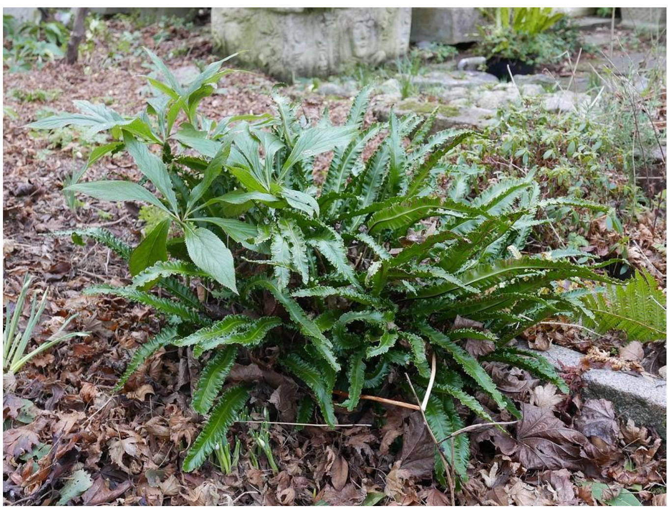
The decision of when, or even if, to cut off last year's still healthy attractive green leaves on such plants as hellebores and ferns is one I make depending on the growth of the subject and the surrounding plants. I like to enjoy the decoration of these winter green plants for as long as possible and they provide habitat for the garden wild life as I regularly watch the small birds foraging among their foliage but I have to balance that with the fact that they are competition to their new emerging growth plus that of other surrounding plants for space and light.