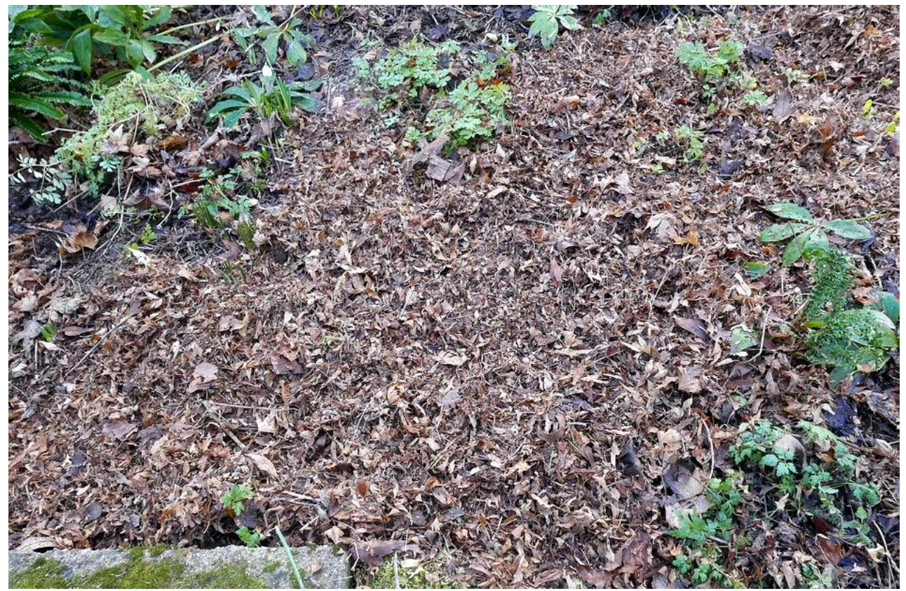
Shredded leaf mulch spread out.