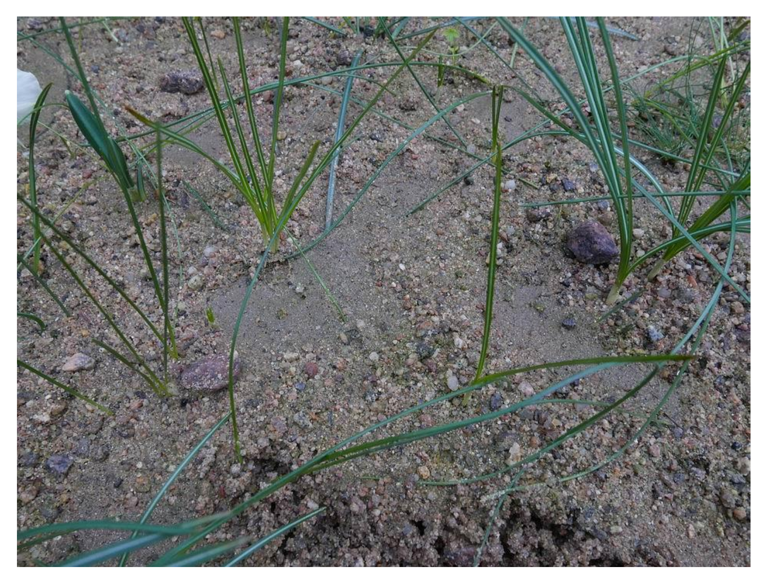
Where the water pools leaves patches of fine material which as well as preventing water and air getting down into the sand also encourages the growth of mosses.