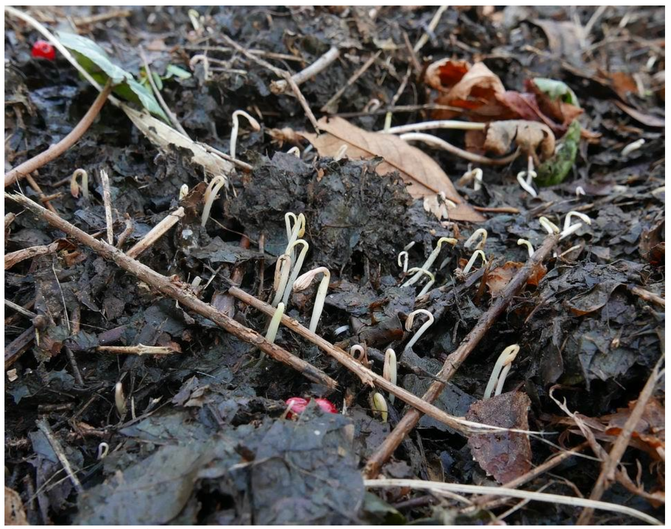
These Anemone ranunculoides shoots are among the many I have uncovered and recovered as I go through the process of preparing the beds for the spring growth.