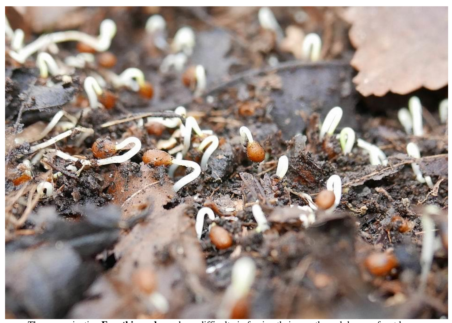
These germinating Eranthis seeds can have difficulty in forcing their way through layers of wet leaves.

You may well wonder why I bother but when the whole leaves get wet they can form a tough laminated carpet that strong pointed shoots are capable of penetrating but many bent shoots and newly germinating seed cannot.