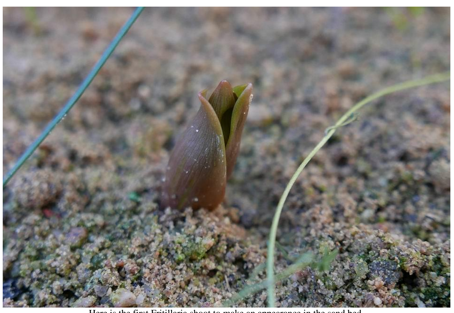
Here is the first Fritillaria shoot to make an appearance in the sand bed.