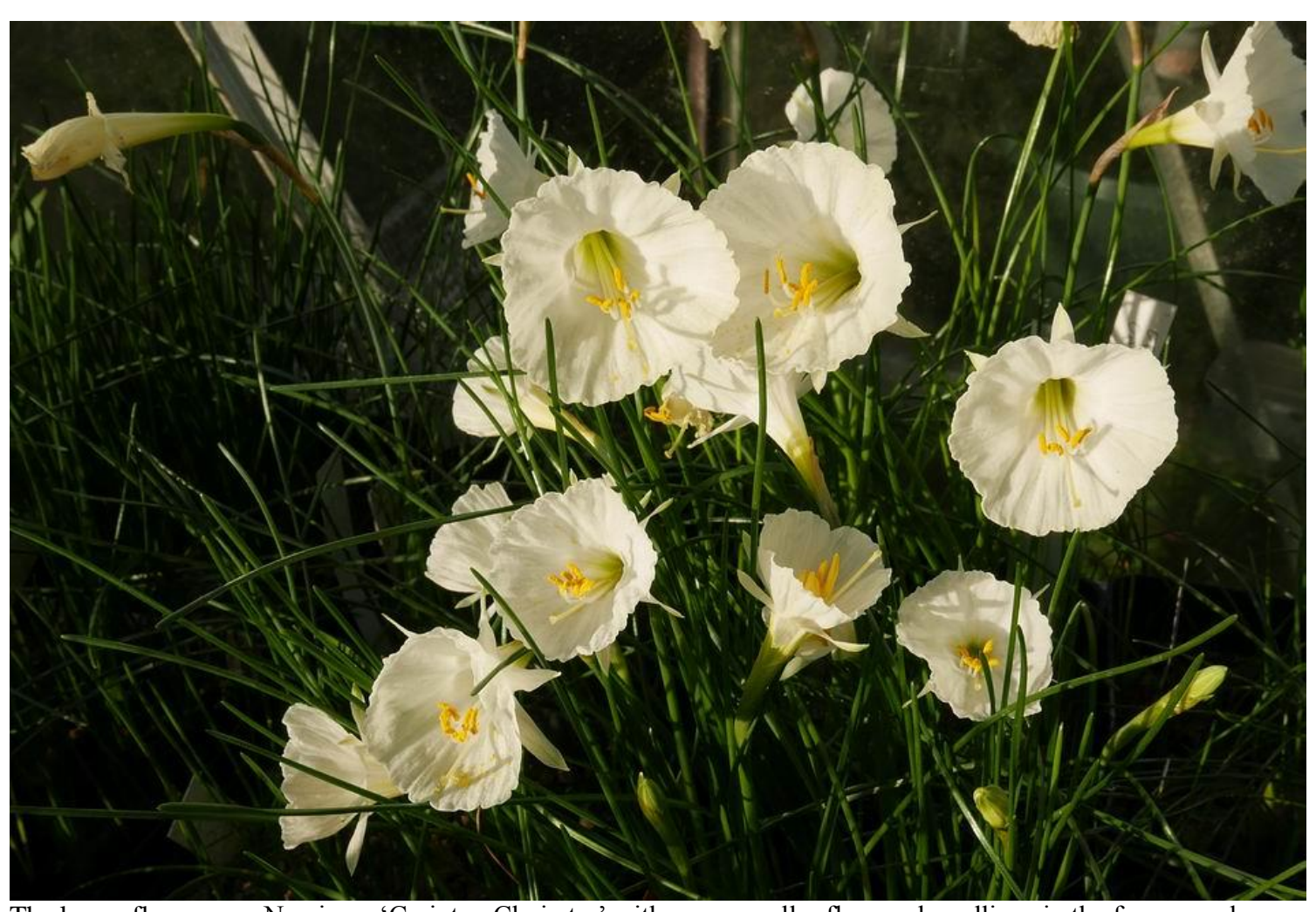
The larger flowers are Narcissus 'Craigton Choirster' with some smaller flowered seedlings in the foreground.