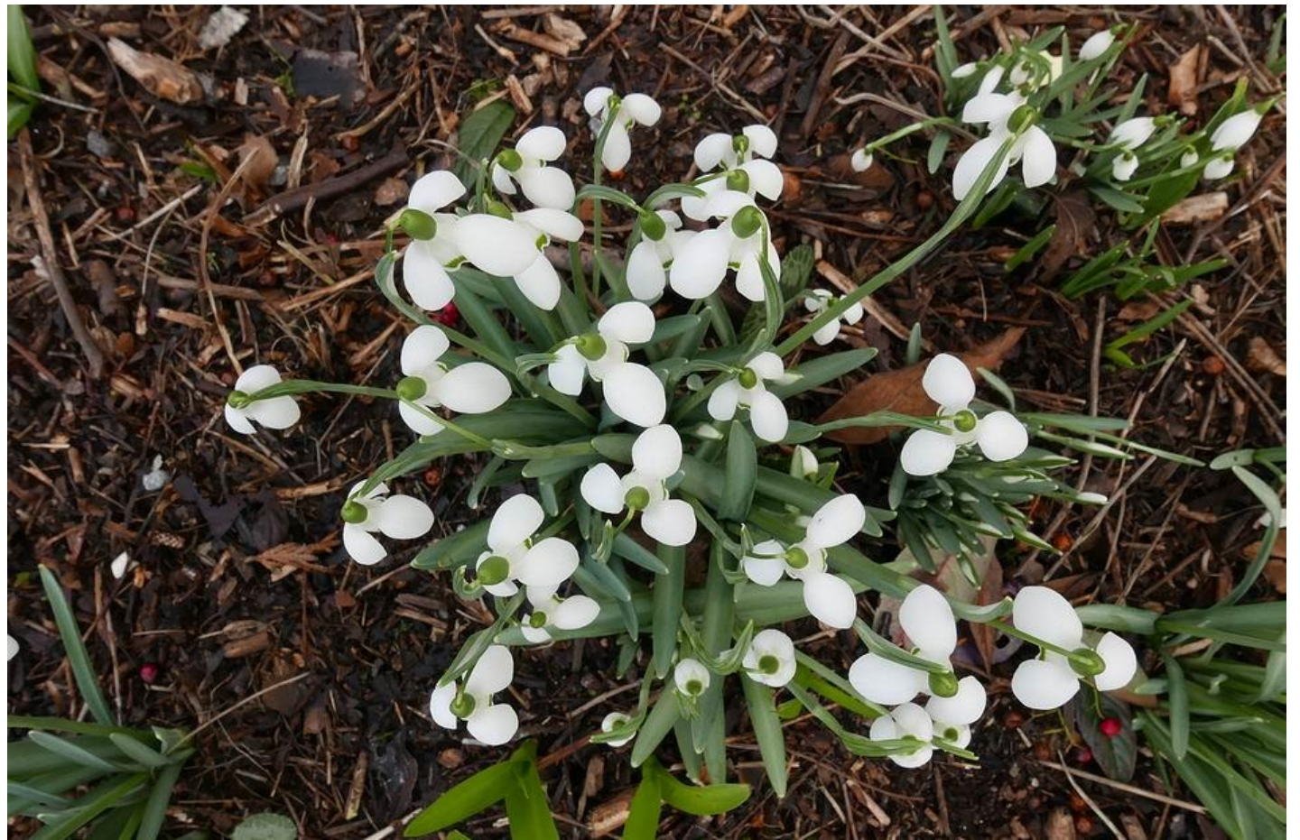
Art which includes photography should push you to look in different ways and to observe in detail what is in front of you. The picture above is looking down on snowdrops which along with the sideways glance is the only way many people see them – of course those infected by the white fever get much more intimate with the flowers, doing the snowdrop pinch to check out the interior markings but how many get down looking upwards into the flowers?