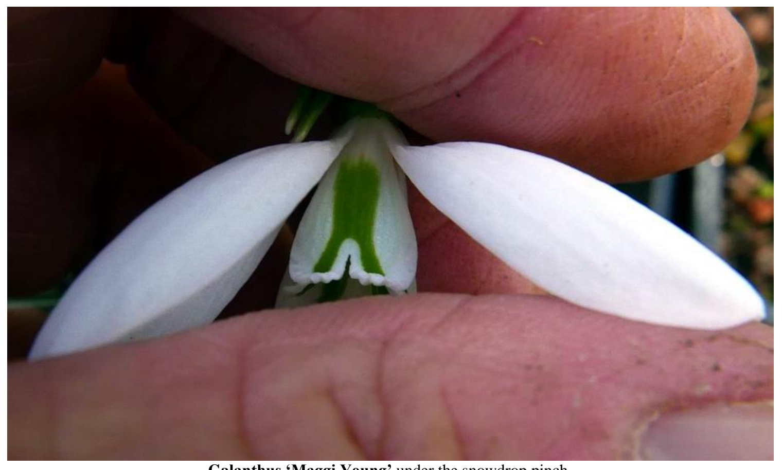
Galanthus 'Maggi Young' under the snowdrop pinch.