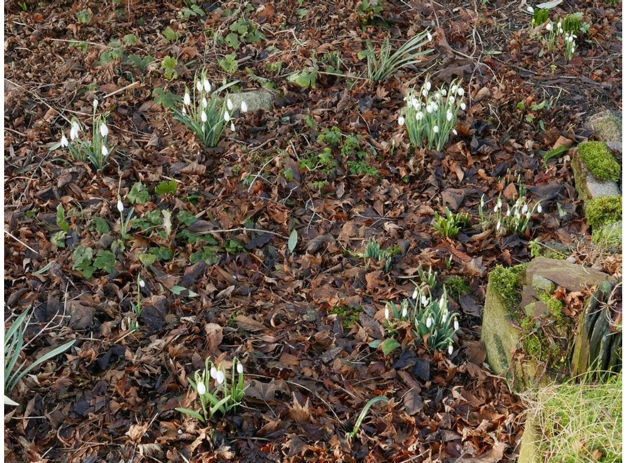
Every day more shoots are pushing through the ground as if a slow rolling wave is breaking across the garden - over the next month a white carpet will form which will also include Leucojums.