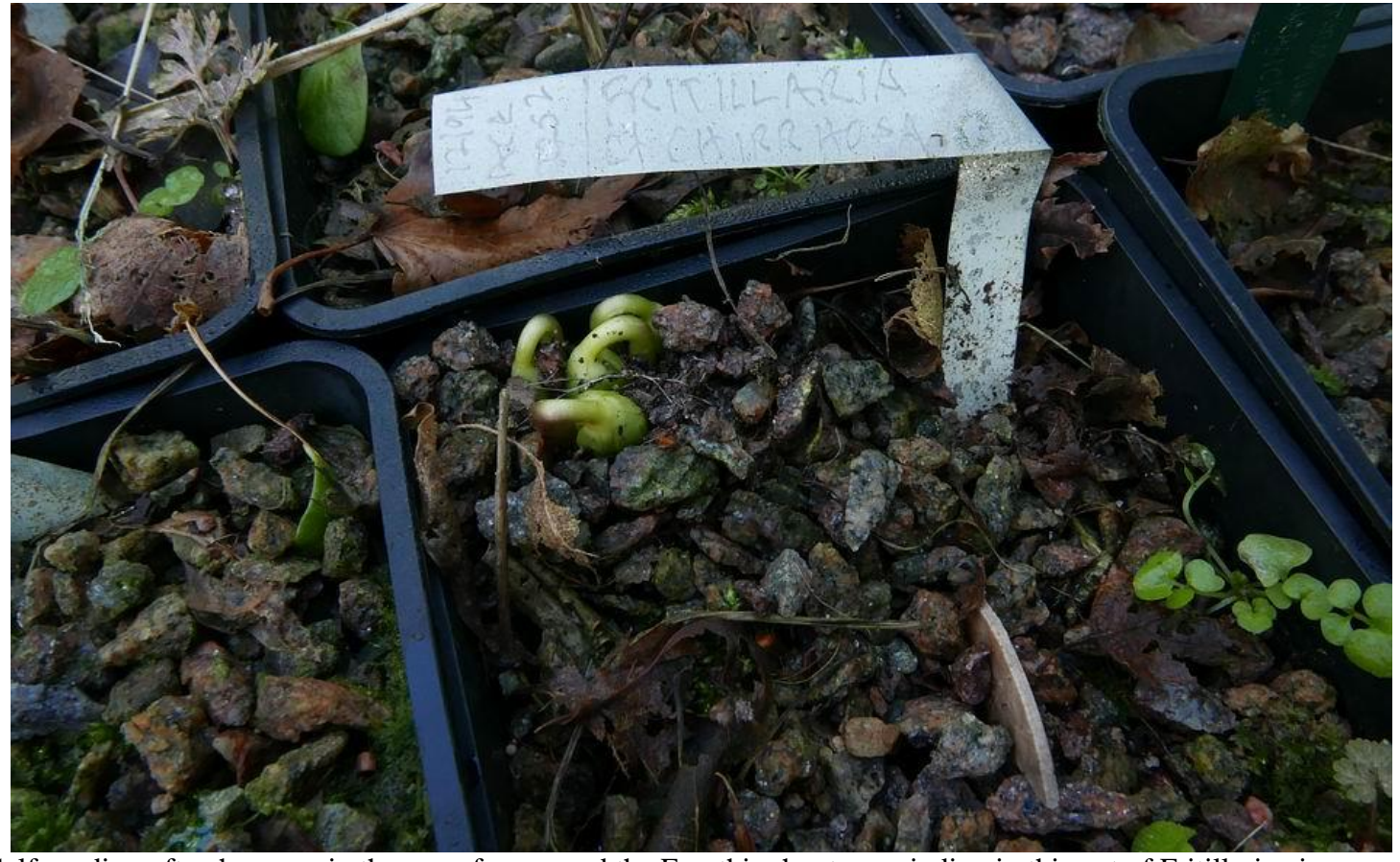
Self-seeding often happens in the open frames and the Eranthis shoots unwinding in this pot of Fritillaria gives away how long it has been since I last repotted.