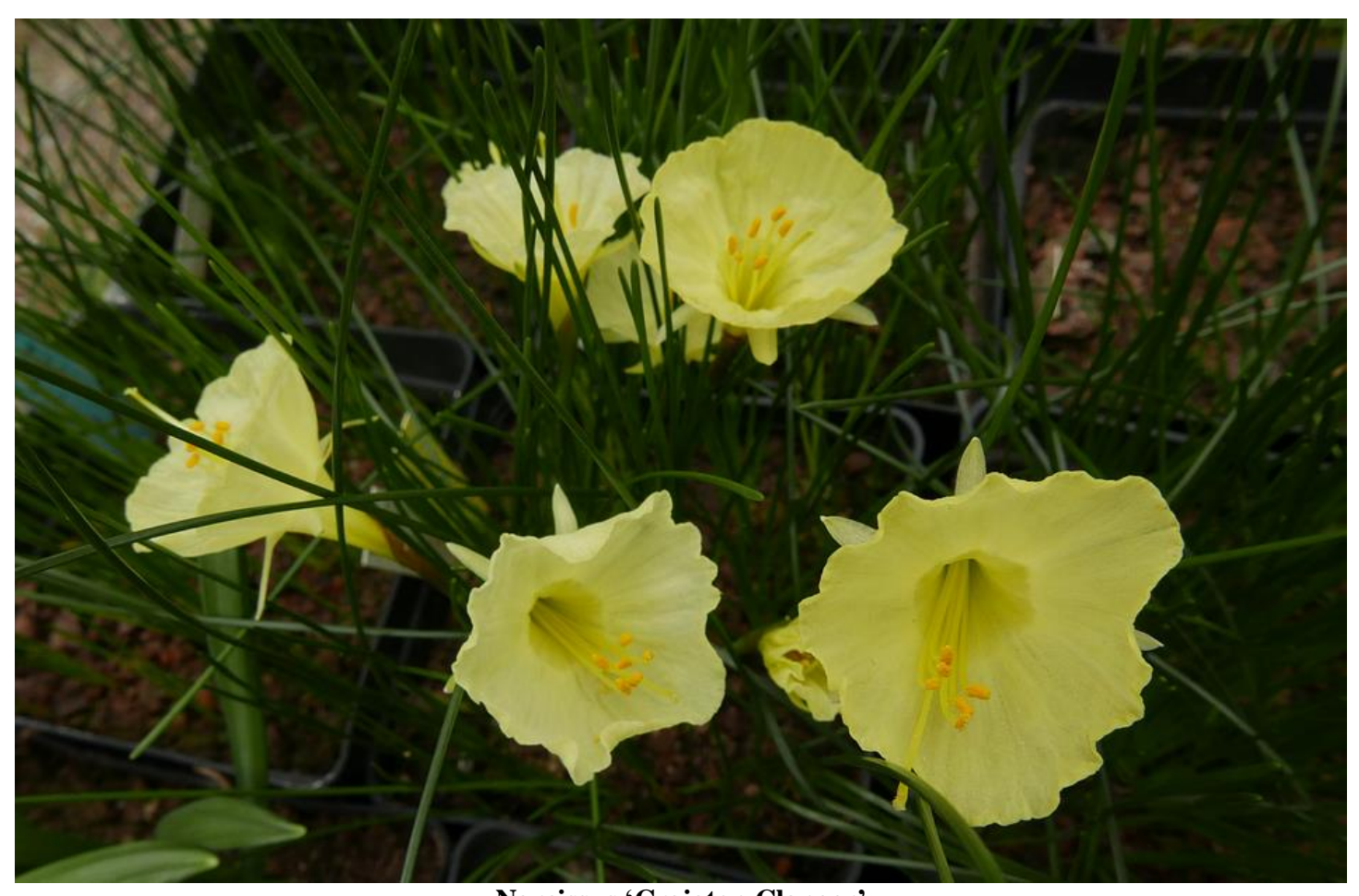
Narcissus 'Craigton Clanger' Two of the hybrids I have named are just stating to open their flowers.