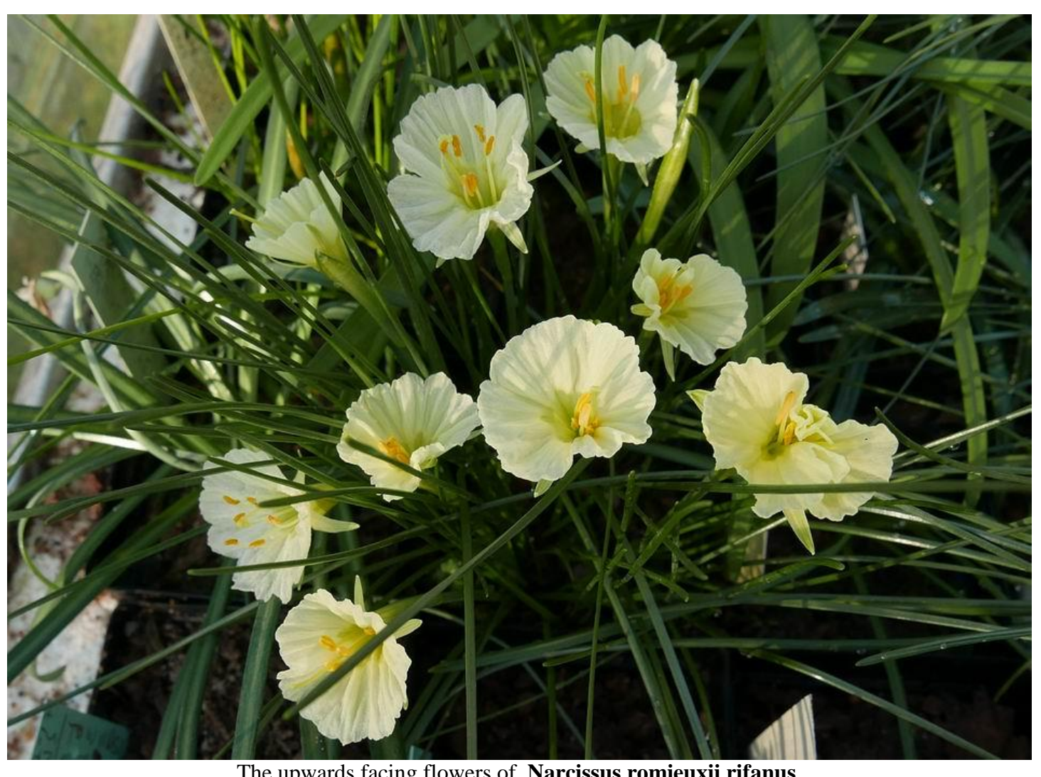
The upwards facing flowers of Narcissus romieuxii rifanus.