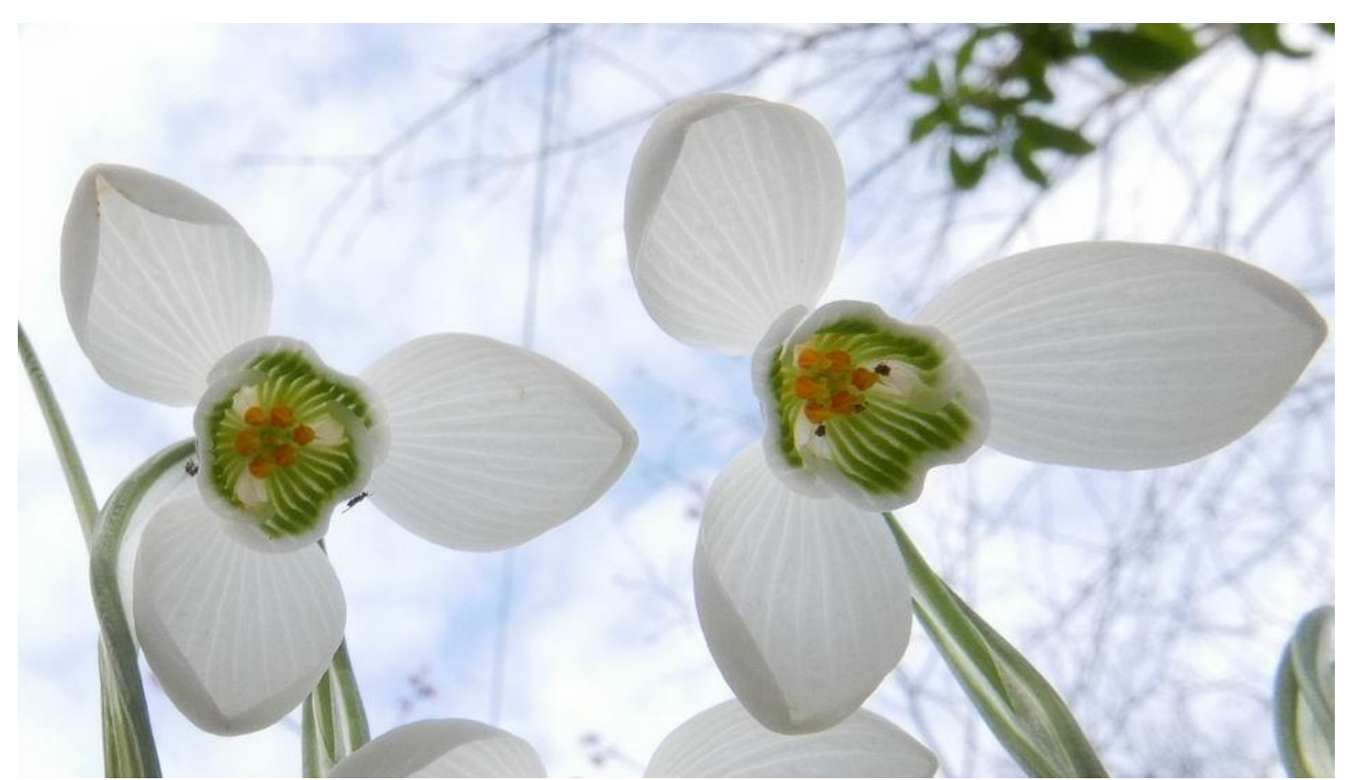
I think this is the best way to view the flowers looking upwards towards the sky when the flat white outer petals take on a new attraction as you can see the lighter veins. The green striped interior with the cluster of golden pollen forms an irresistible attraction and if you look carefully you will see some small black insects have been drawn towards some food inside the flower and shelter from the harsh winter weather - could they also serve to pollinate the flower?