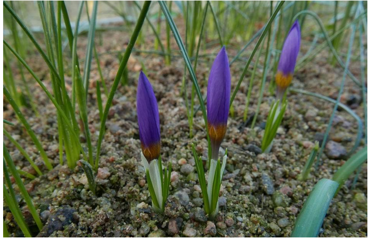
The first of the spring crocus are also appearing - it is difficult to be sure of the species until the flowers open but it is possibly a form of Crocus biflorus .