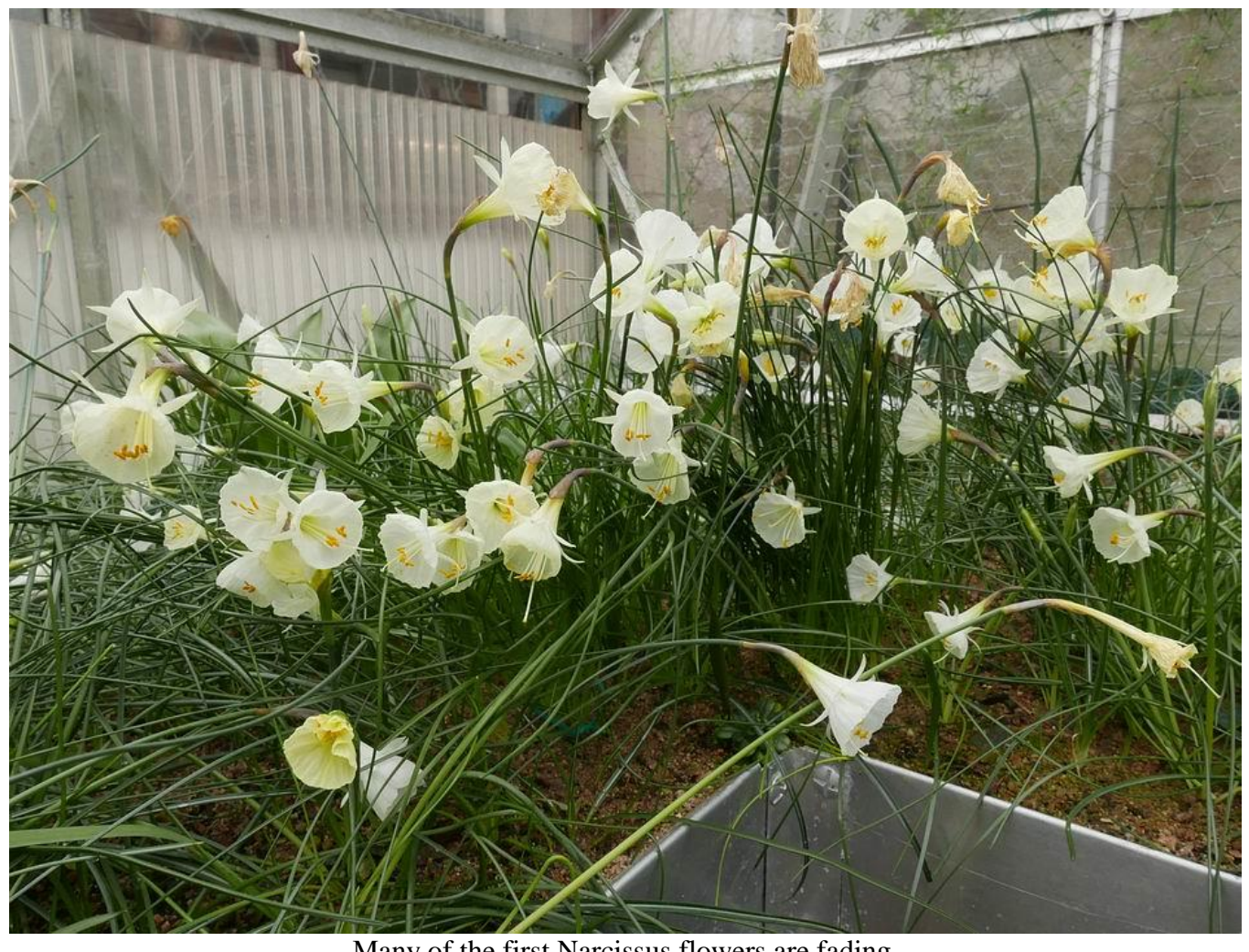
Many of the first Narcissus flowers are fading.