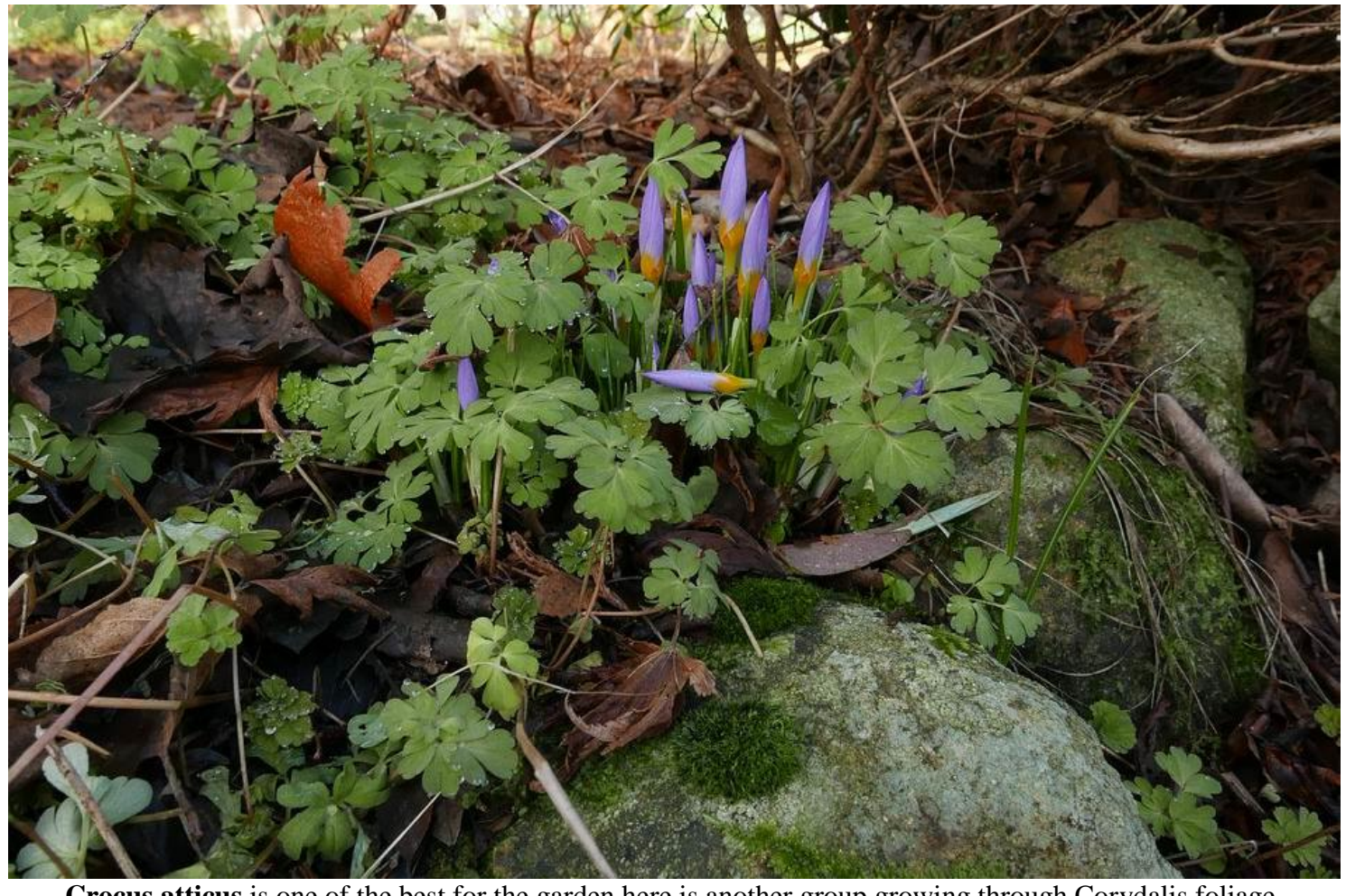
Crocus atticus is one of the best for the garden here is another group growing through Corydalis foliage.