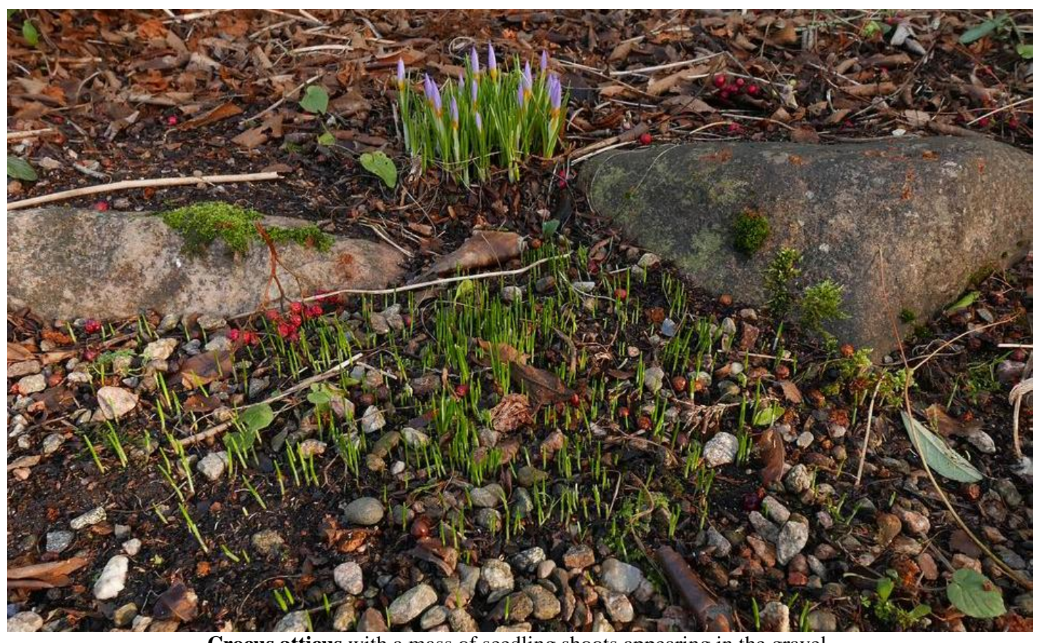
Crocus atticus with a mass of seedling shoots appearing in the gravel.