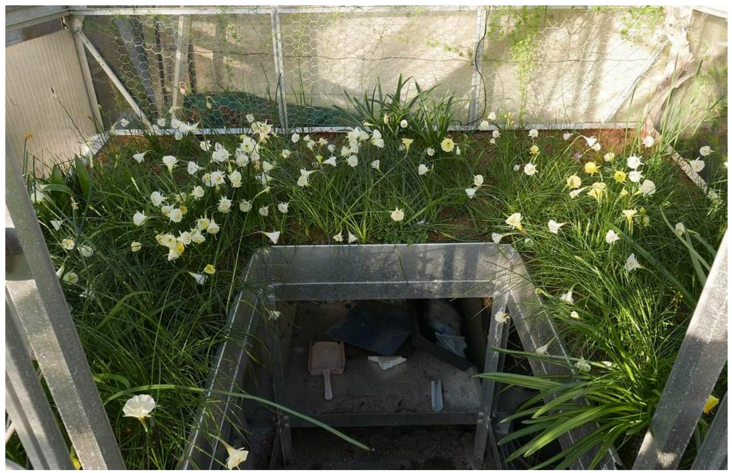
Our weather continues to vary and when the sun does shine the temperature in the bulb houses can almost reach double figures so I have been checking the moisture levels in the sand and pots. On a bright day the surface of the sand dries out so I will make a scrape to assess if I need to water - if it is dry for much more than a centimetre I will water.