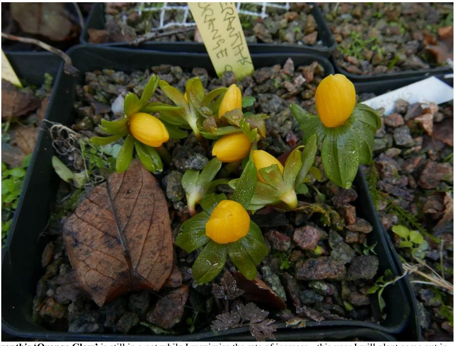
Eranthis 'Orange Glow' is still in a pot while I maximise the rate of increase - this year I will plant some out in the garden along with others with to mix up the colours.