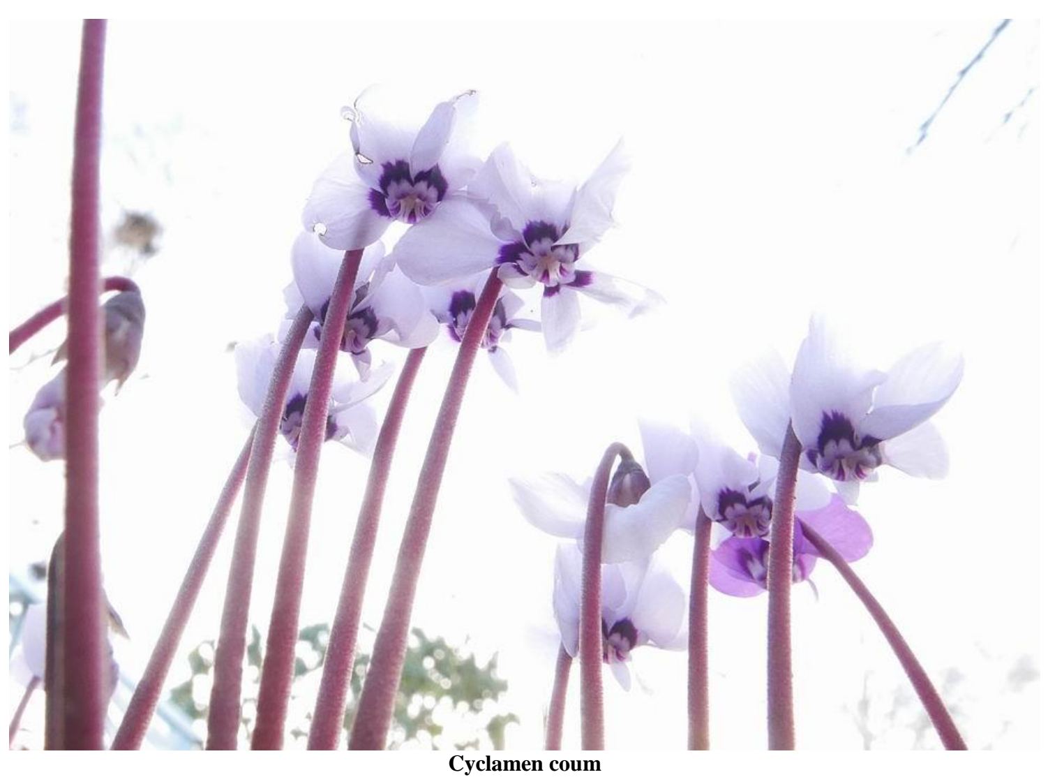
It is not so easy to get a view looking up into the face of the flowers but it is well worth taking the extra effort.