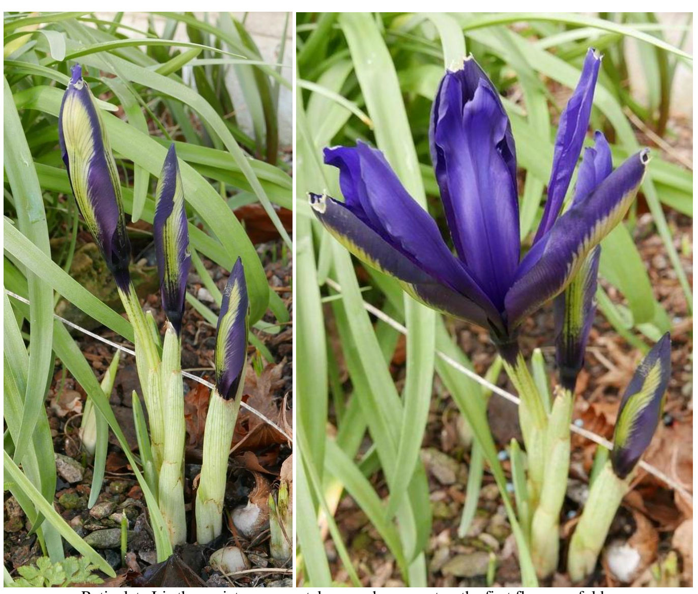
Reticulate Iris these pictures were taken one hour apart as the first flower unfolds.