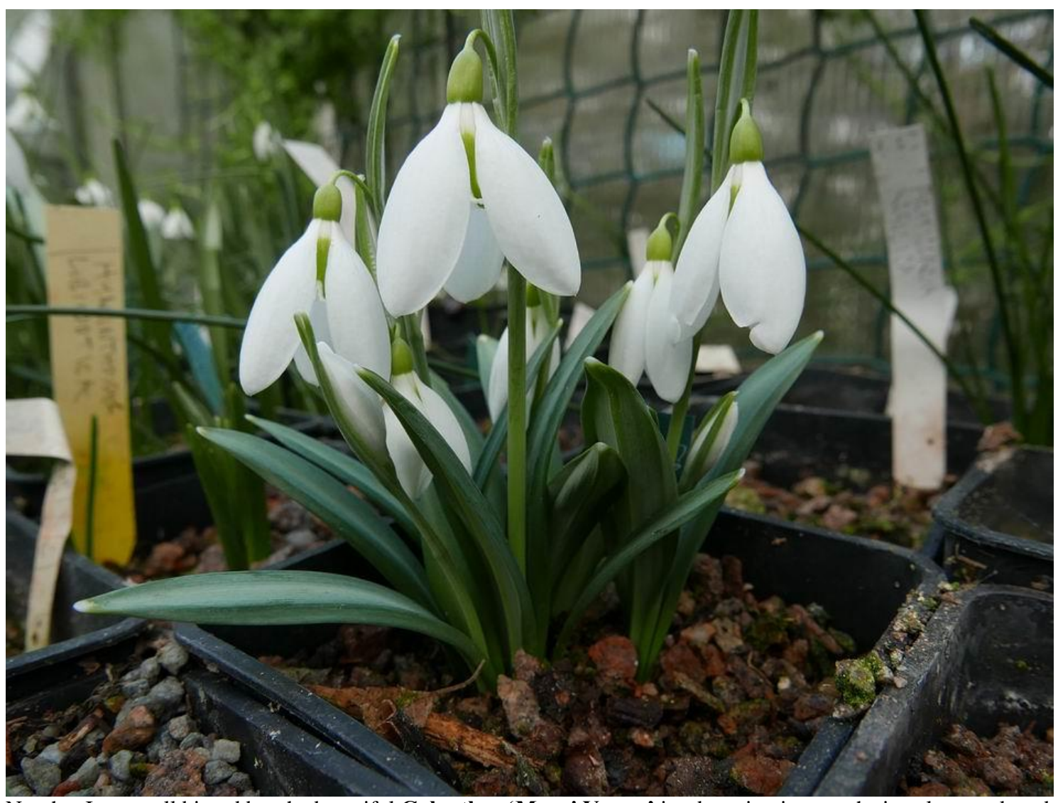
Not that I am at all biased but the beautiful Galanthus 'Maggi Young' is advancing in growth since last week and below I have applied that snowdrop pinch to show the upside down 'Y' inner markings.