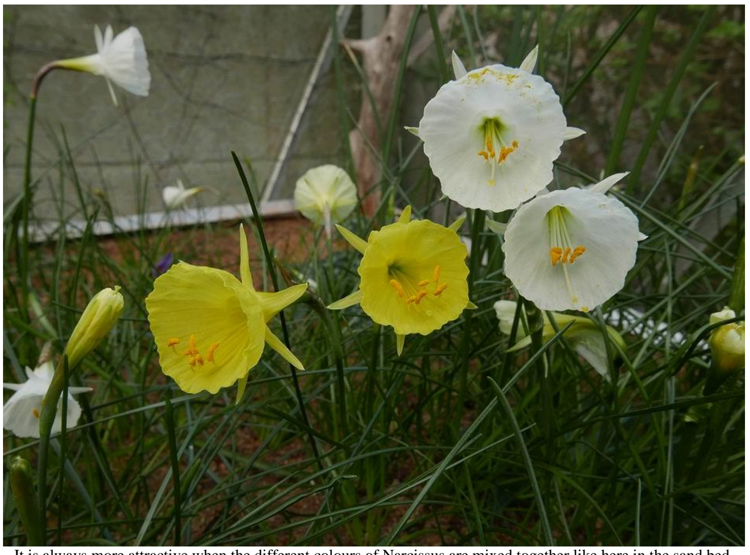
It is always more attractive when the different colours of Narcissus are mixed together like here in the sand bed.