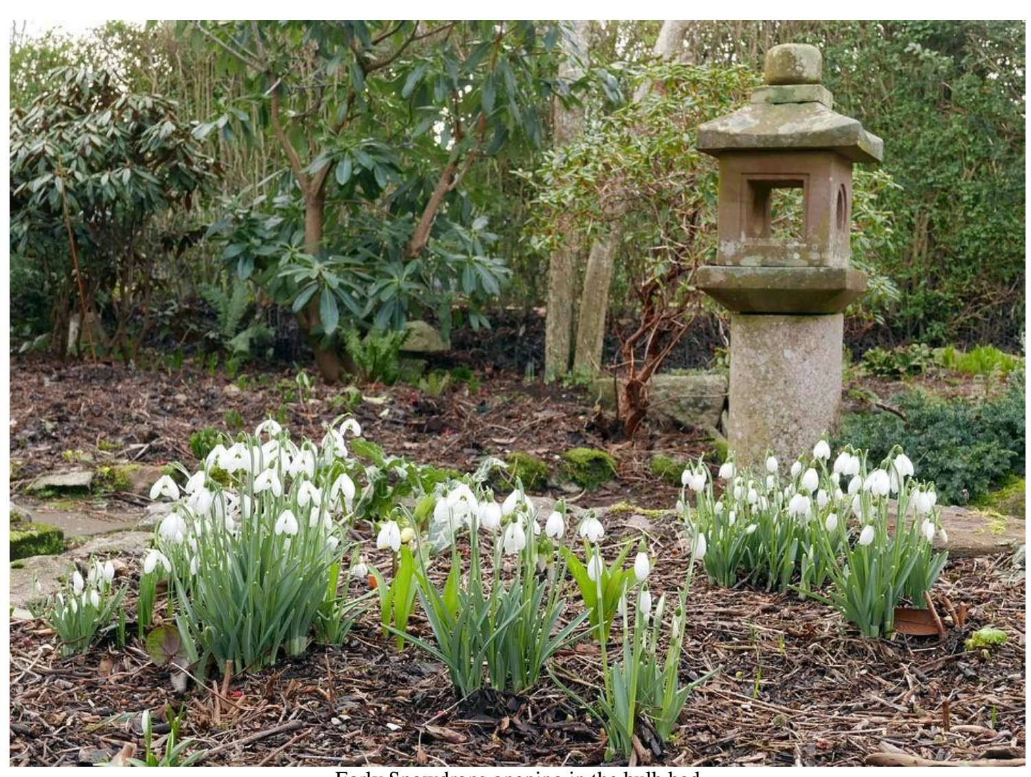
Early Snowdrops opening in the bulb bed.