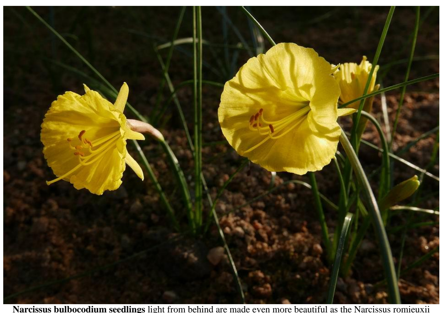
Narcissus bulbocodium seedlings light from behind are made even more beautiful as the Narcissus romieuxii seedlings below.