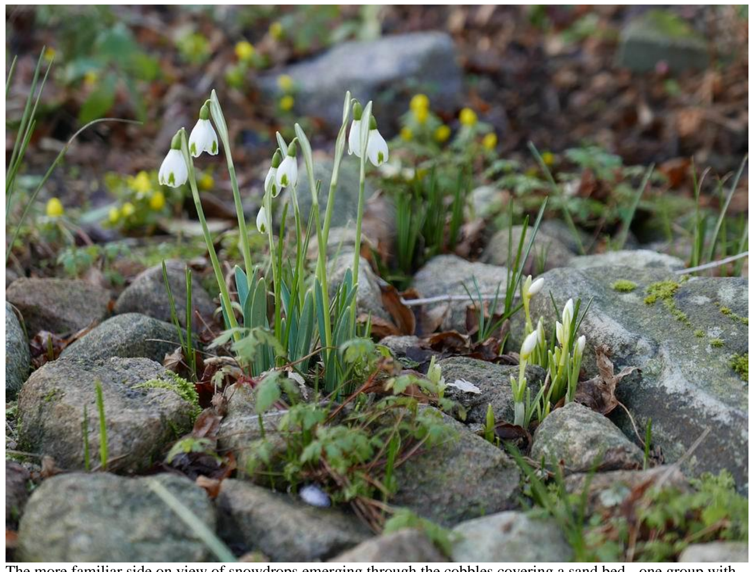
The more familiar side on view of snowdrops emerging through the cobbles covering a sand bed - one group with green marked outers the other just emerging is one of the yellow forms.