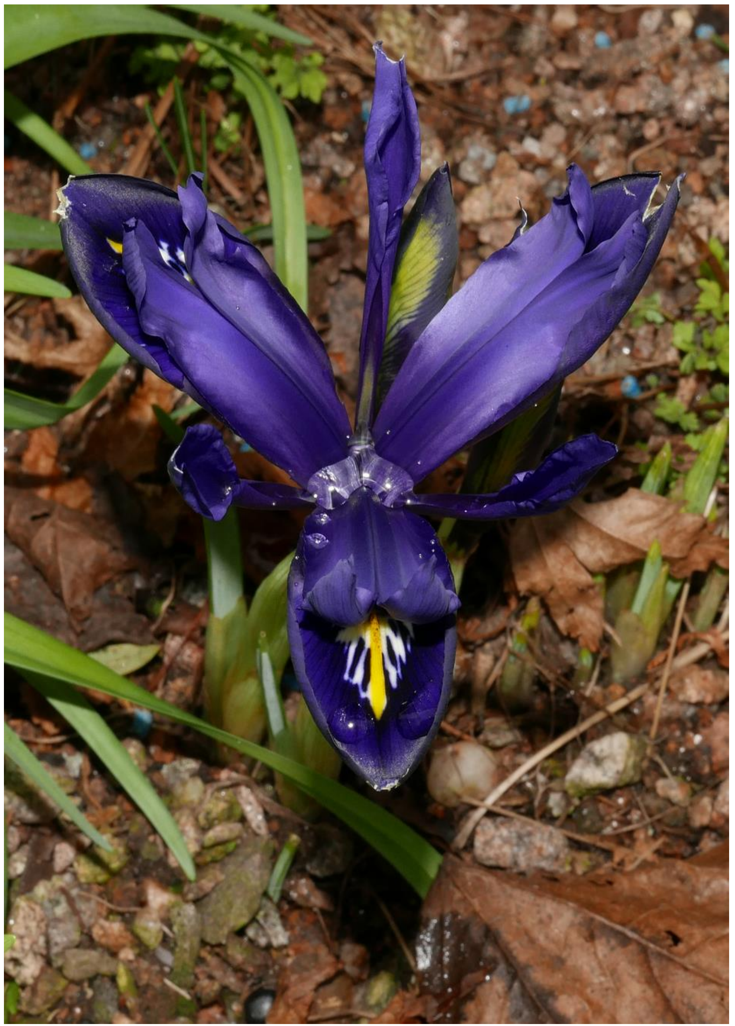
The next day the first flower is now open – note the damged tips which were chewed on by a slug when they first poked through the ground.