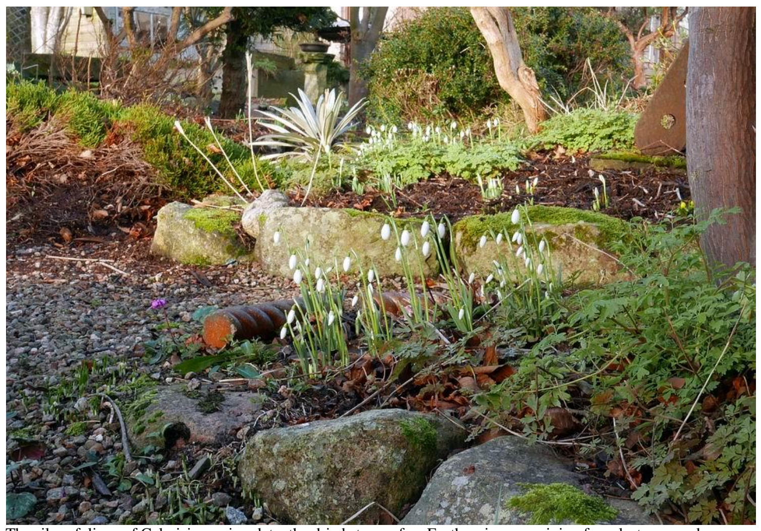
The silver foliage of Celmisia semicordata, the dried stems of an Erythronium remaining from last year and snowdrops catch the light in a typical winter garden scene.