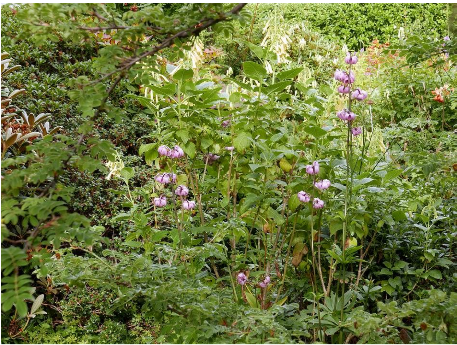
Pink flowered Lilium martagon and yellow Phygelius hybrid.

The wildness of the front garden continues to bring us pleasure - now it is the turn of the taller plants to flower through the ground covering carpet of spring flowering plants and bulbs many of which have retreated underground until next year.