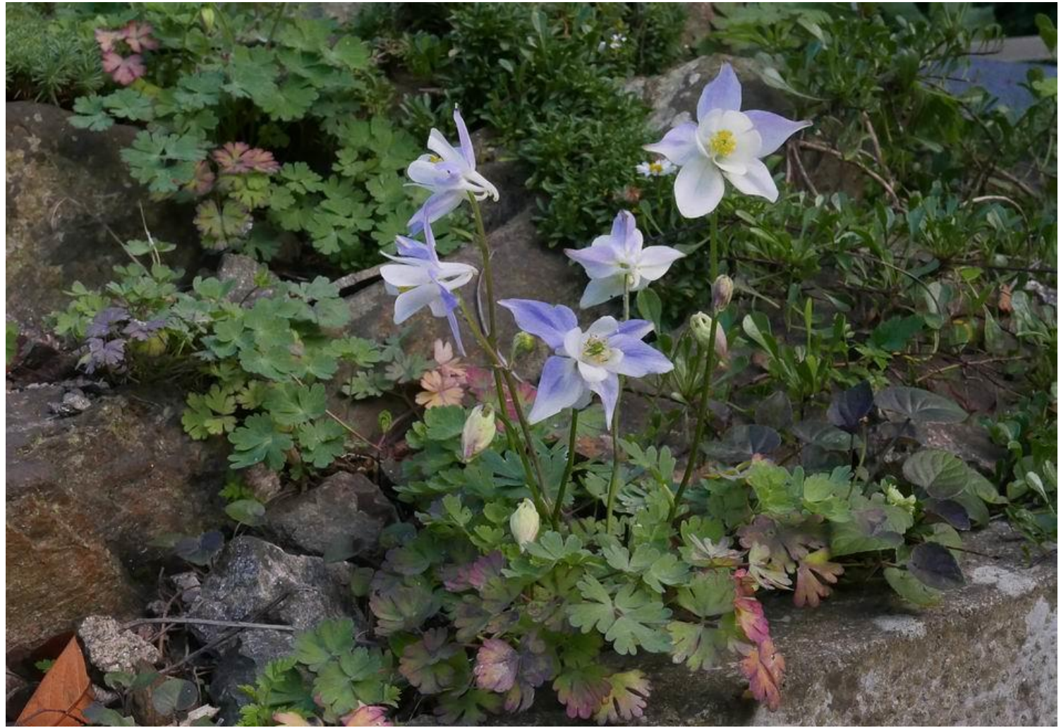
Seedlings from Aquilegia saximontana may well be hybrids but remain nice and dwarf in the slab beds.