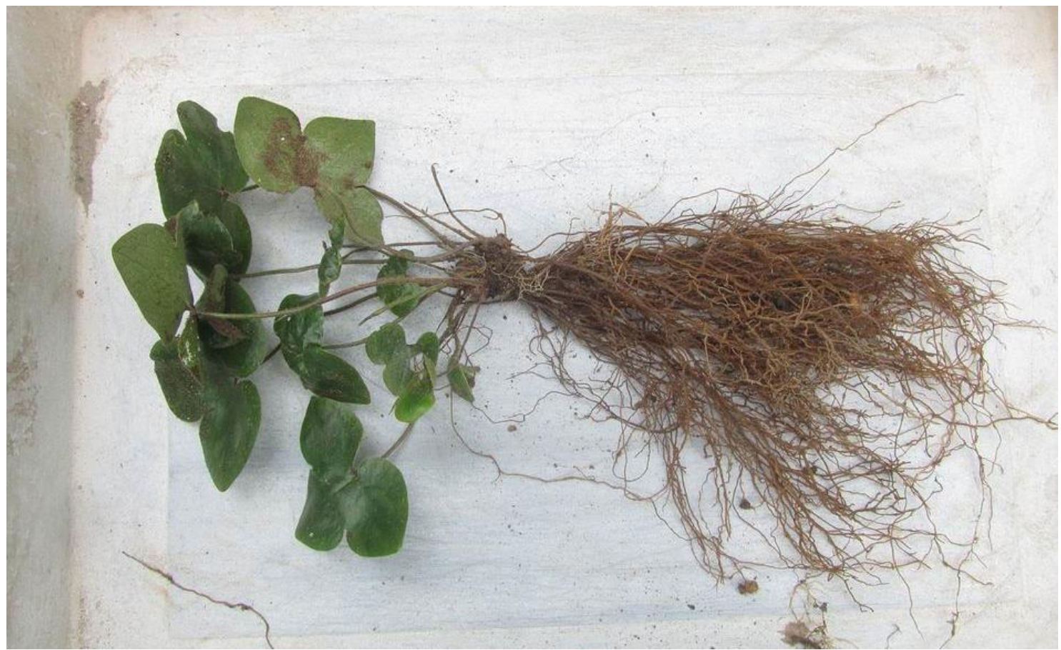
The basket of Trillium was sown so long ago that other plants such as this Hepatica had seeded in so they were also planted in the bed.