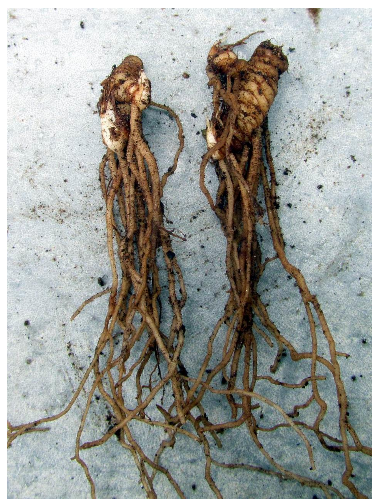
While most of the Trilliums had just one main shoot on the front of the rhizome a few like these had secondary shoots growing on older parts. It is very important not to damage the new roots which are those coming from the base of next year's bud - if you do the plant will not be able to grow properly – the old roots remain for a number of years but it is primarily the new roots that support next season's growth.