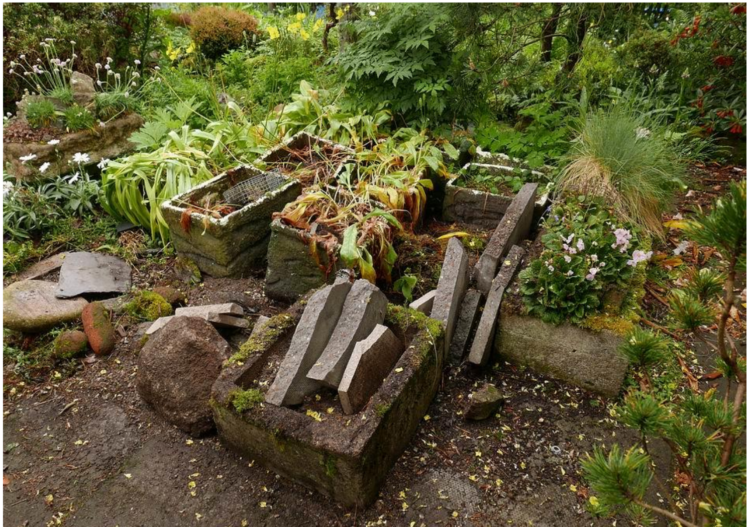
The process I am following here also relates to all my other art works; that is I like the challenge of working with mixed media, using what materials are available or that I find.