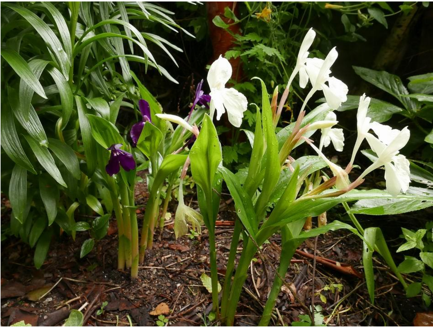
Roscoea humeana and cautleyoides cultivars.