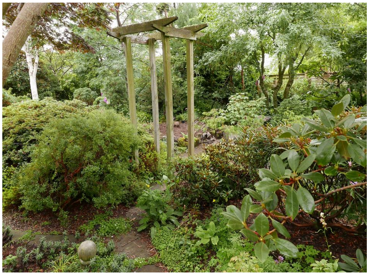
Approaching from the other side the new bed is seen though the gate form.

Here I am looking across the raised wall towards the new bed and the pond beyond – at the moment the growth interupts the view combining these areas but from certain angles and at different times of the year they will merge into a single vista.