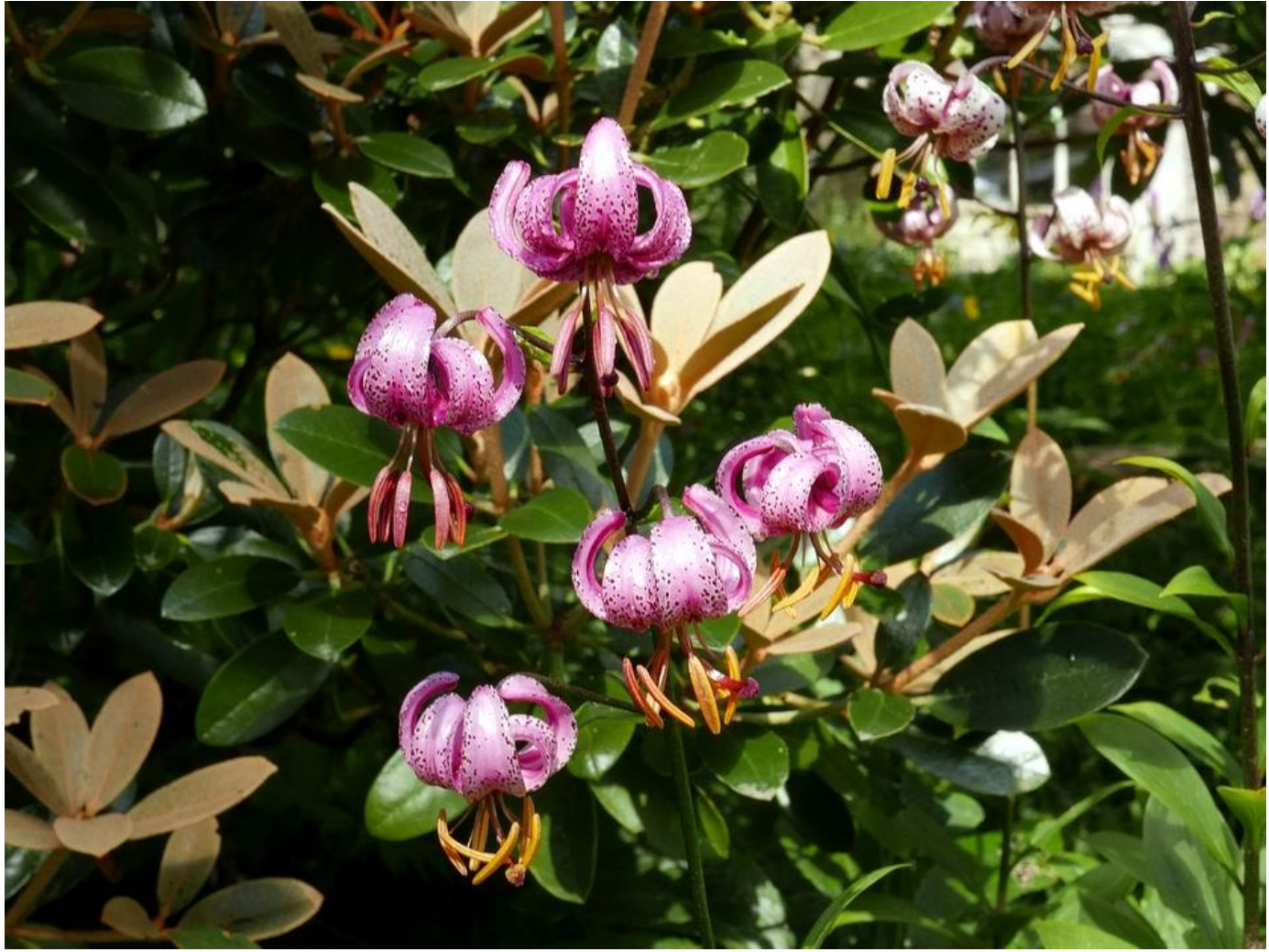
Lilium martagon with the beautiful new leaves of Rhododendron yakushimanum x tsariense.