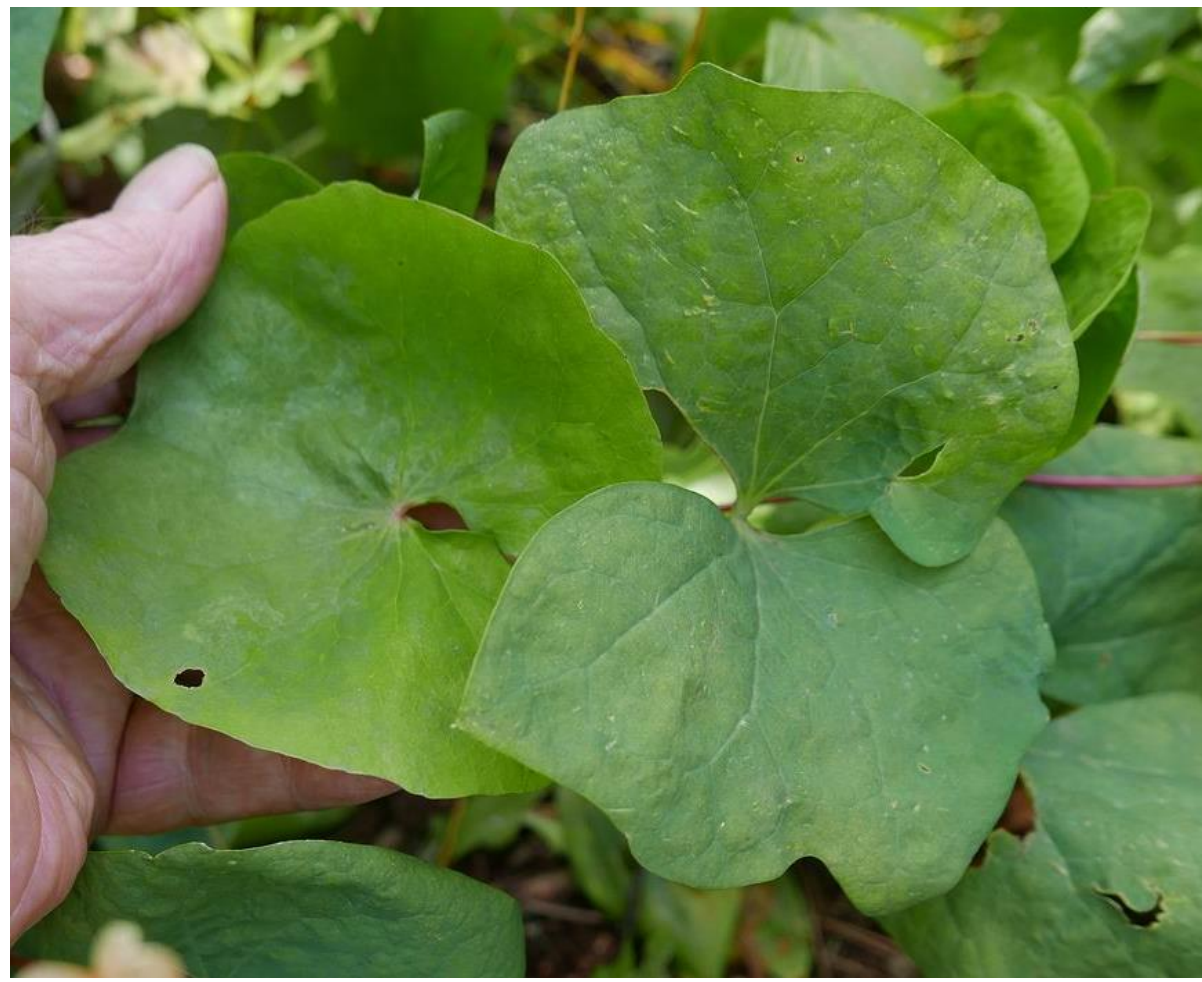
week are destined to go into the new bed.

Cuttings I took a few years ago of Rhododendron cephalanthum var. crebreflorum and Rhododendron dendrocharis are well rooted, growing and ready to be planted out in the new bed – both cuttings were taken from the plants growing in the raised wall at the other side of the path so they will help link together these two separate beds.