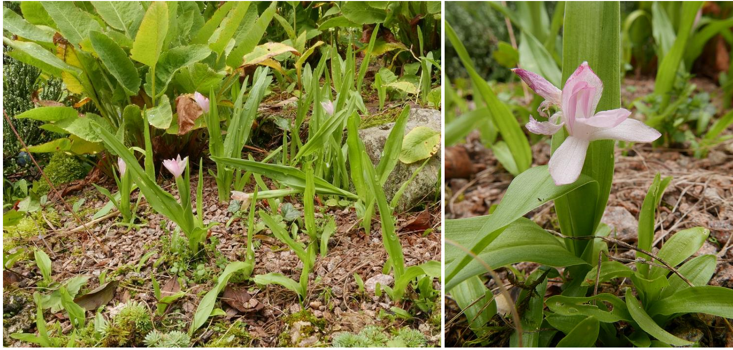
Roscoea scillifolia Roscoea scillifolia is not the showiest of the genus but once established it seeds around freely producing its pink flowers every July.