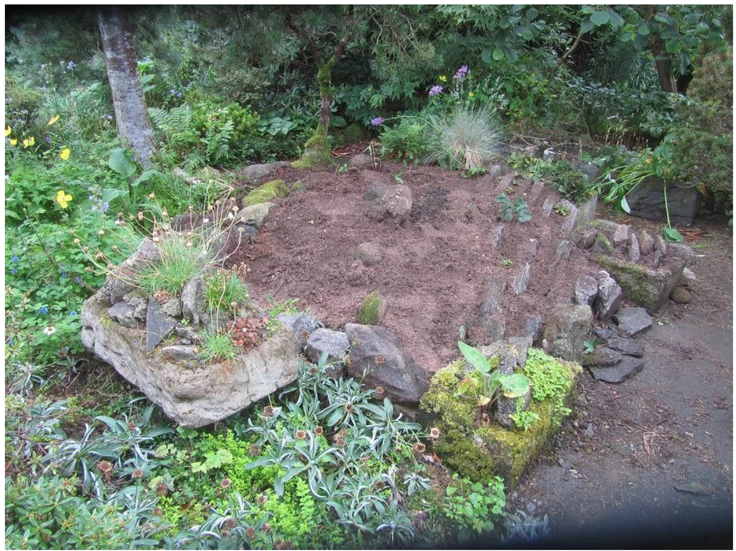
As you can walk all around this bed it is important to continually check that the layout works from all angles.

Unlike the other troughs, which sat on the ground have been incorporated to become some of the edges of the new bed, I intend to leave this trough raised up as it is.