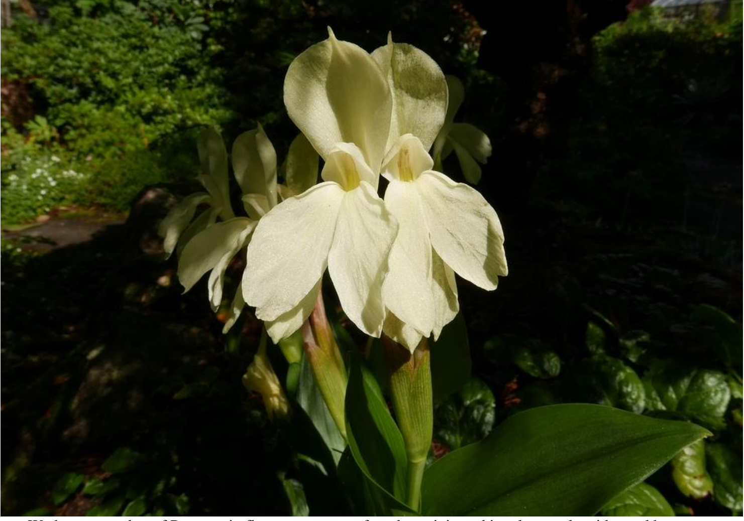
We have a number of Roscoea in flower many are of garden origin and involve cautleyoides and humeana.