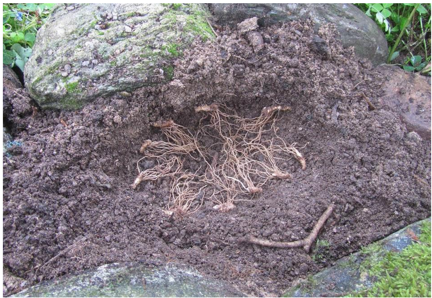
To try and make the planting as naturalistic as possible I varied by planting some Trilliums individually and other in groups. When I plant a group I dig a hole and space the Trillium rhizomes around the edge at roughly the same depth and orientation as I found them when I emptied the basket.