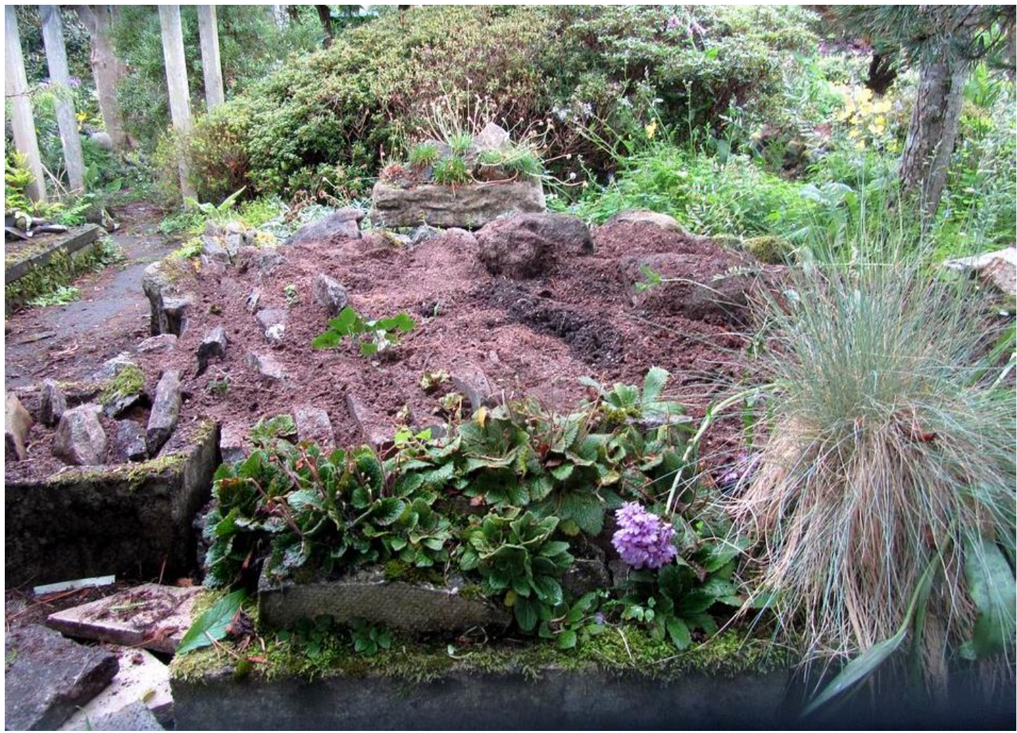
Looking across the Ramonda trough.