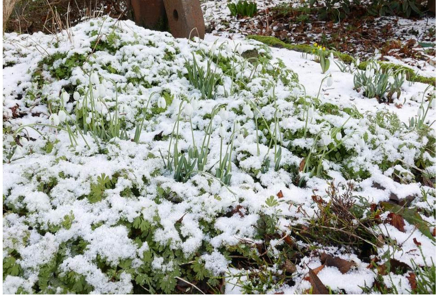
Galanthus and Corydalis flexuosa make perfect companions with the snowdrops flowering well ahead of the Corydalis.