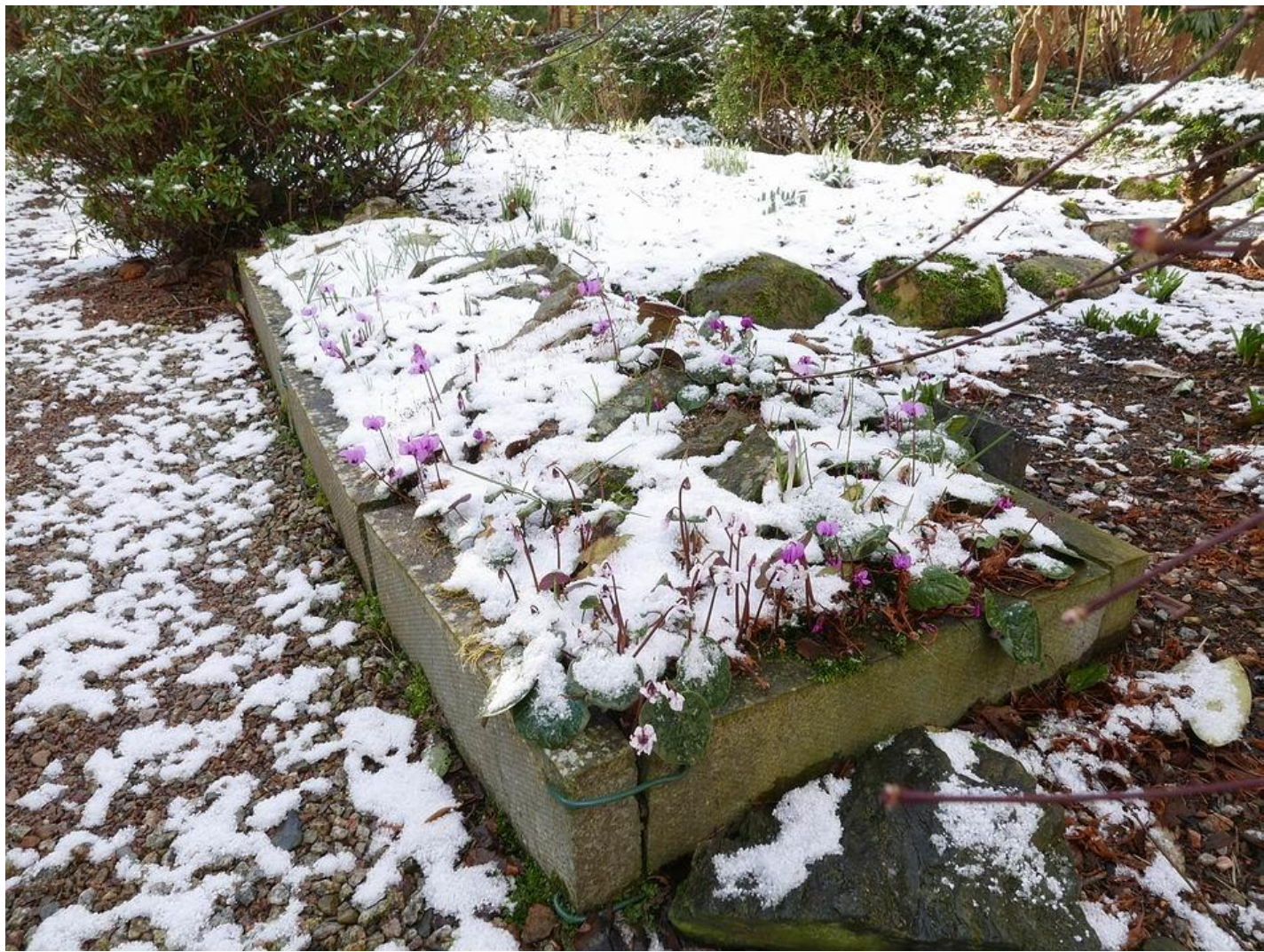
A self-seeding colony of Cyclamen coum is establishing nicely in the sand bed.