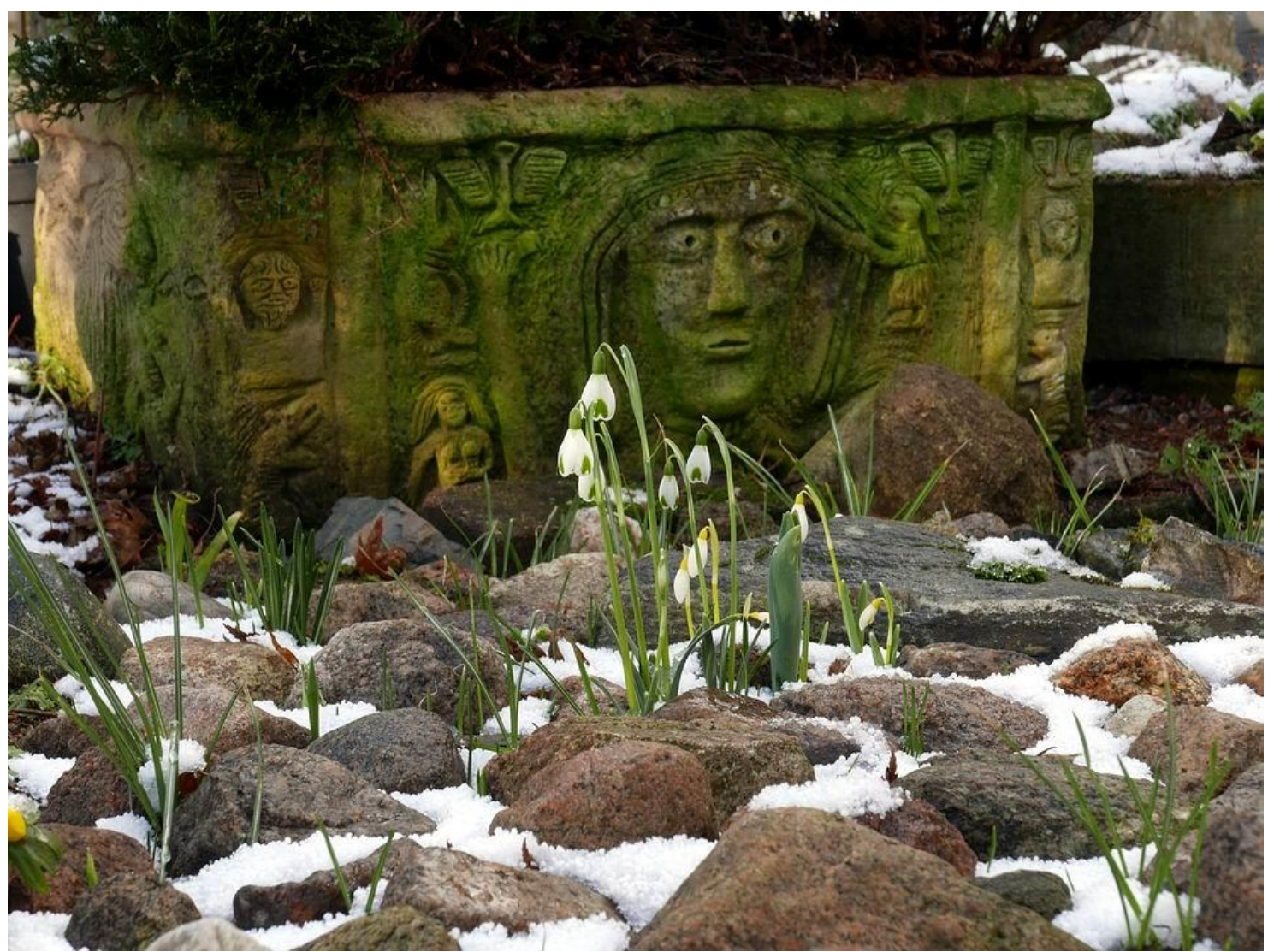
Cobble bed - with Galanthus 'Trym'

This small area at the edge of the slabs was the second sand bed I made, converted from a bird feeding area, however the mice found it far too convenient a food source, eating most of the Crocus corms.