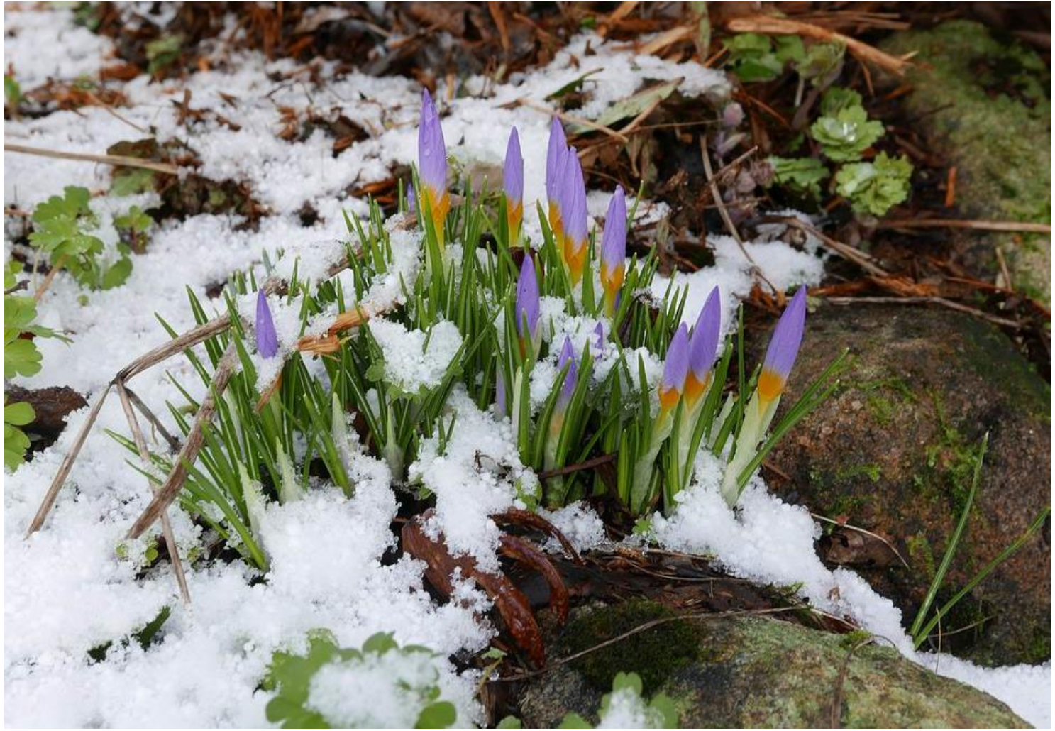
Another very reliable early flowering bulb in our garden is Crocus sieberi atticus - it forms clumps that need divided every three to five years to maintain a reliable flowering.