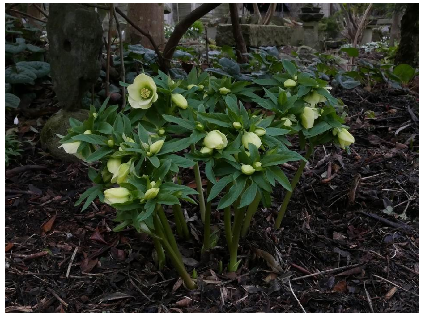
Helleborus – originally from <u>Macplants</u>.