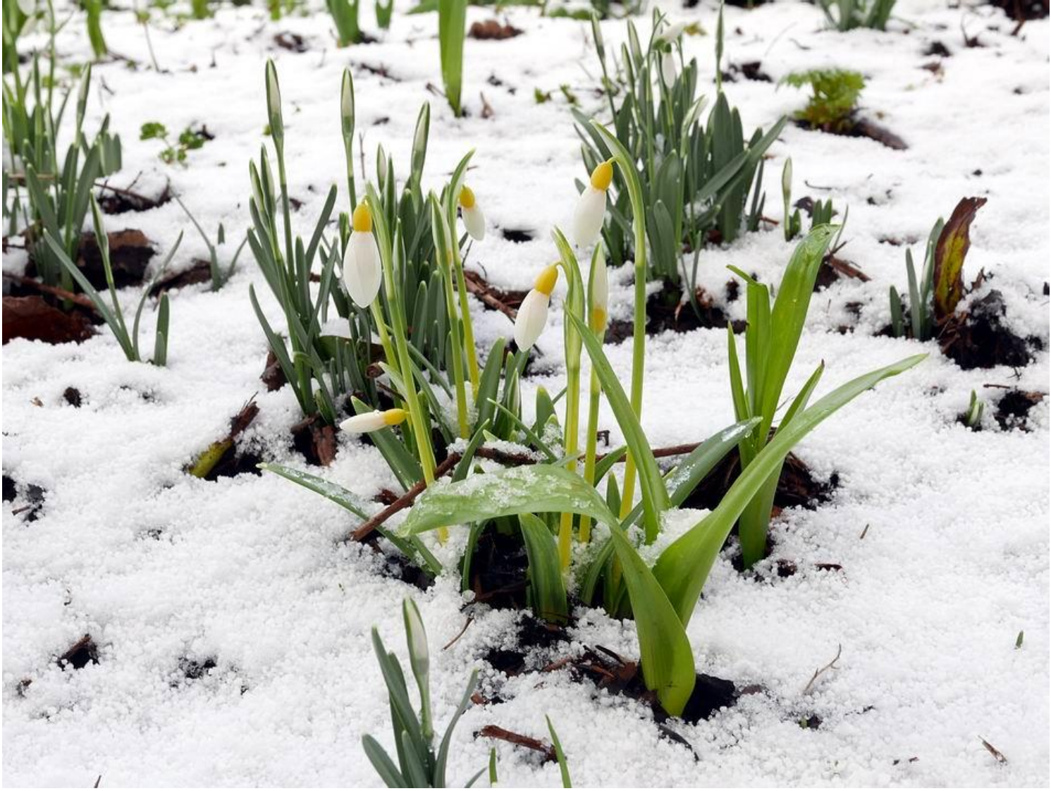
Many forms of Galanthus are now coming into flower, including 'Wendy's Gold'.