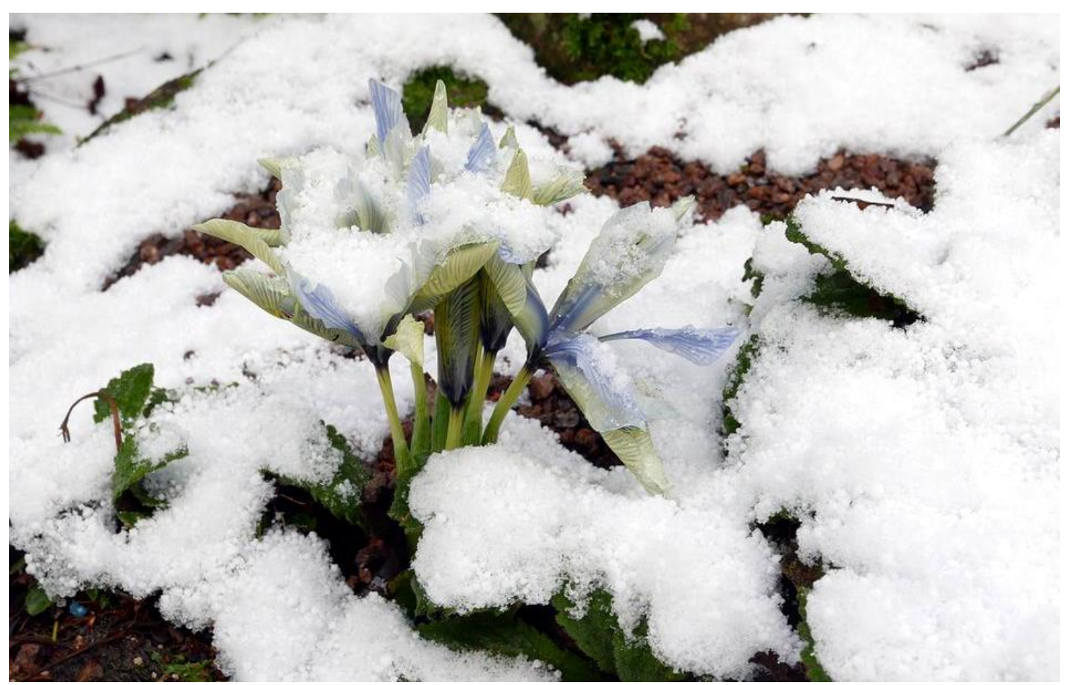
Iris 'Katharine Hodgkin'