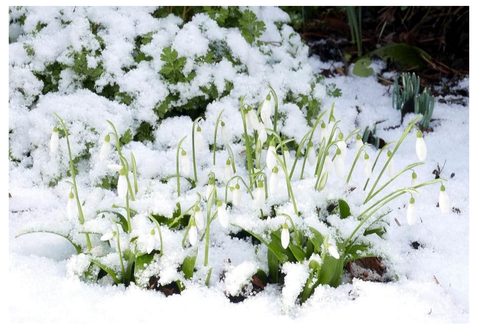
Galanthus woronowii almost disappears in this temporarily wintry scene.