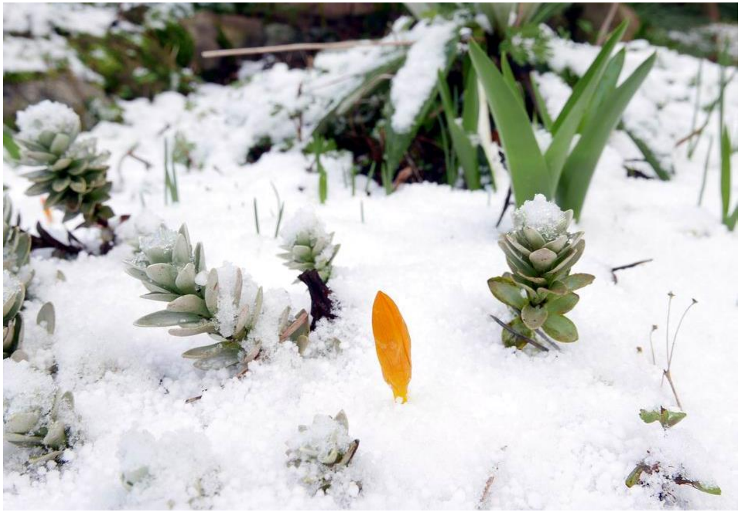
The beautiful strong yellow of Crocus herbertii stands out against the snow.