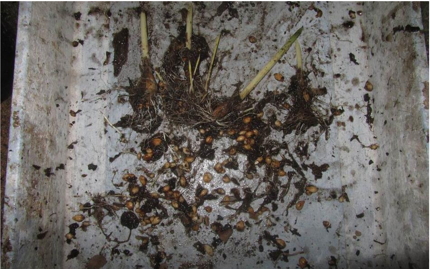
As I split the bulbs apart I also removed all of the bulbils that came away easily. I will plant these away from the parent bulb to give them a better chance of maturing to flowering sized bulbs.