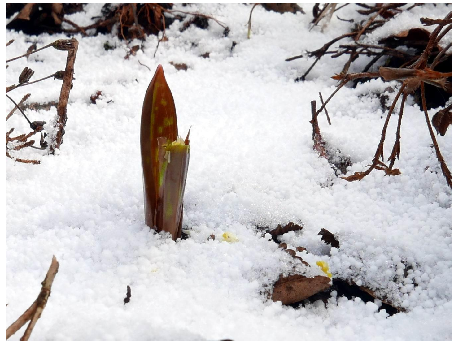
Erythronium caucasicum is always the first of this genus to appear in growth and every year it gets chewed by pesky slugs and or snails.