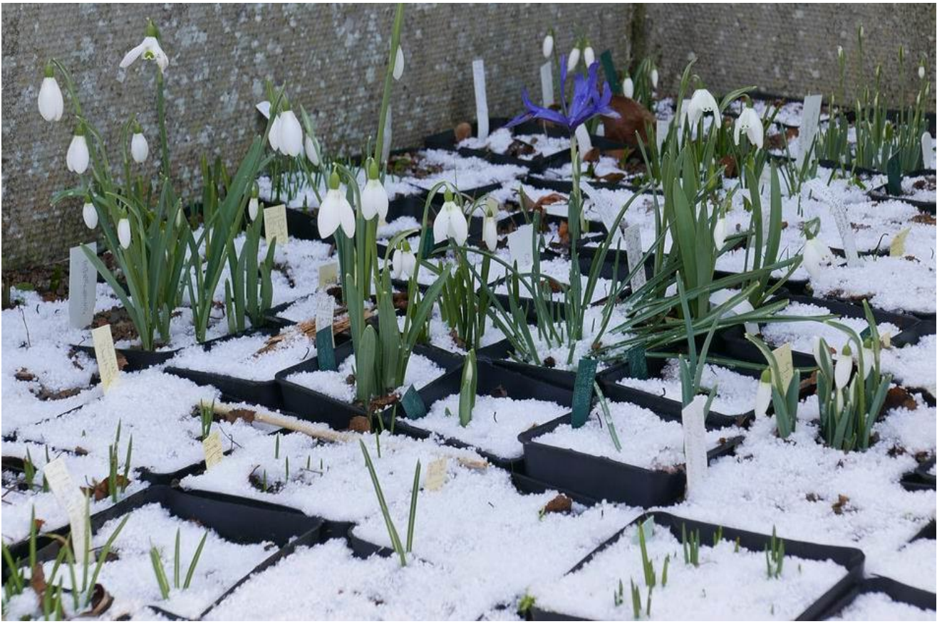
Snowdrops and Iris in a frame.