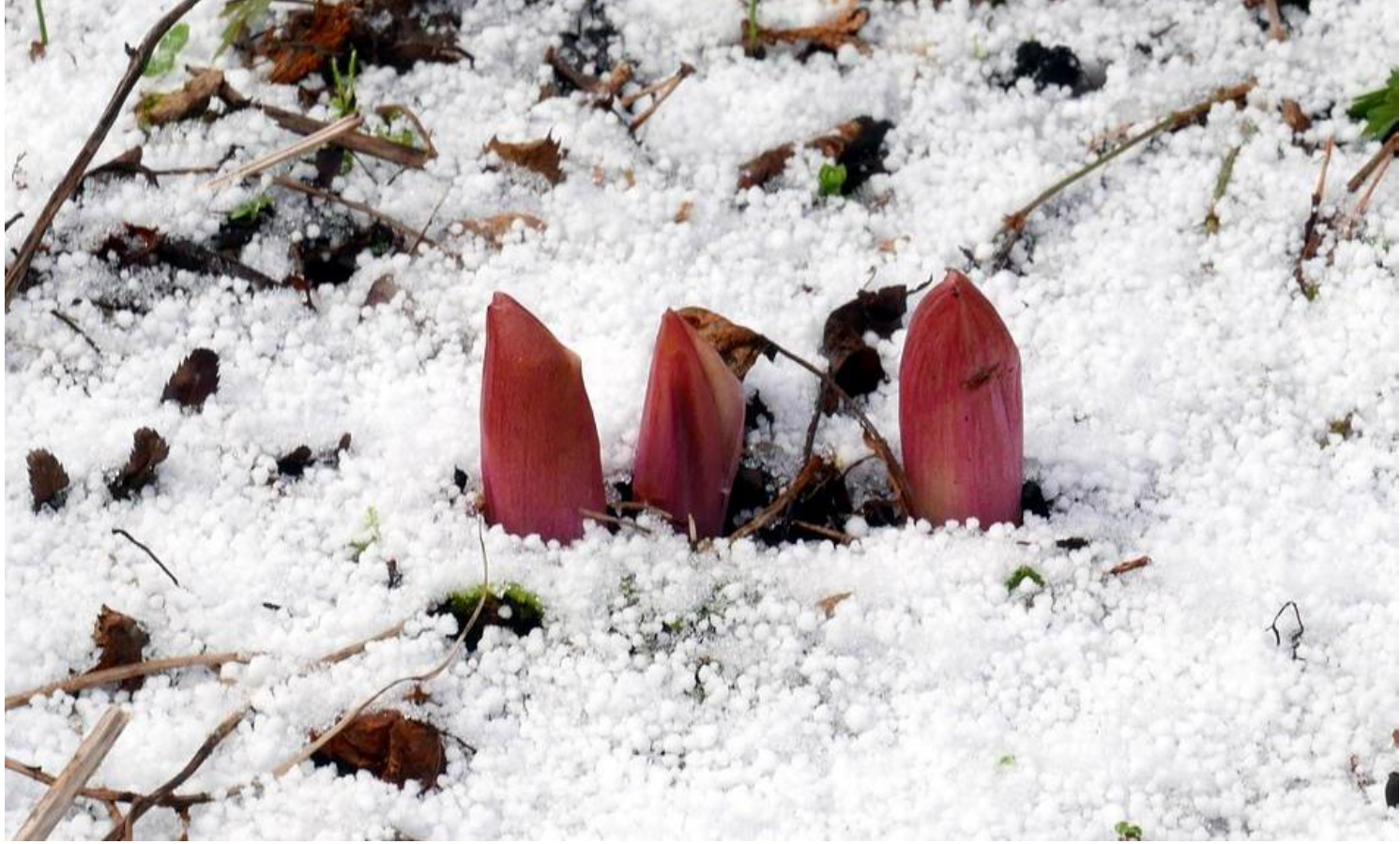
Fat Peony buds stand out against the light covering of snow.