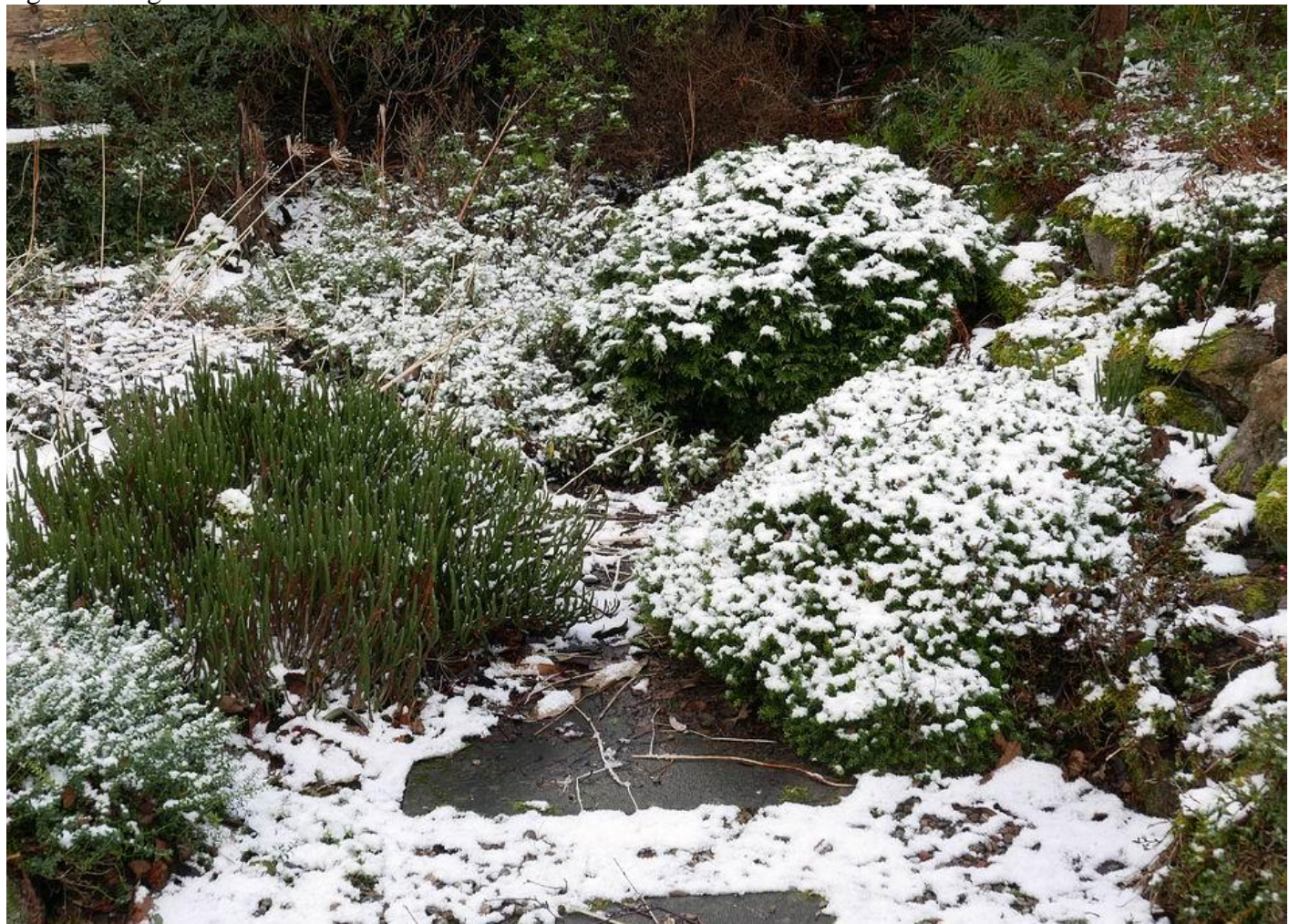
Cassiope fastigiata x wardii and Phyllodoce caerulea grow across the slab path with Chamaecyparis 'Green Globe' living up to its name in the background. Truly dwarf conifers are not that common but 'Green Globe' is one - our plant is now over 40 years old and while I occasionally trim excess growth and the occasional aberrant shoot this is how it grows.

Evergreen plants of various shapes and sizes provide the structure and they will soon be joined by the mass of spring flowering bulbs.