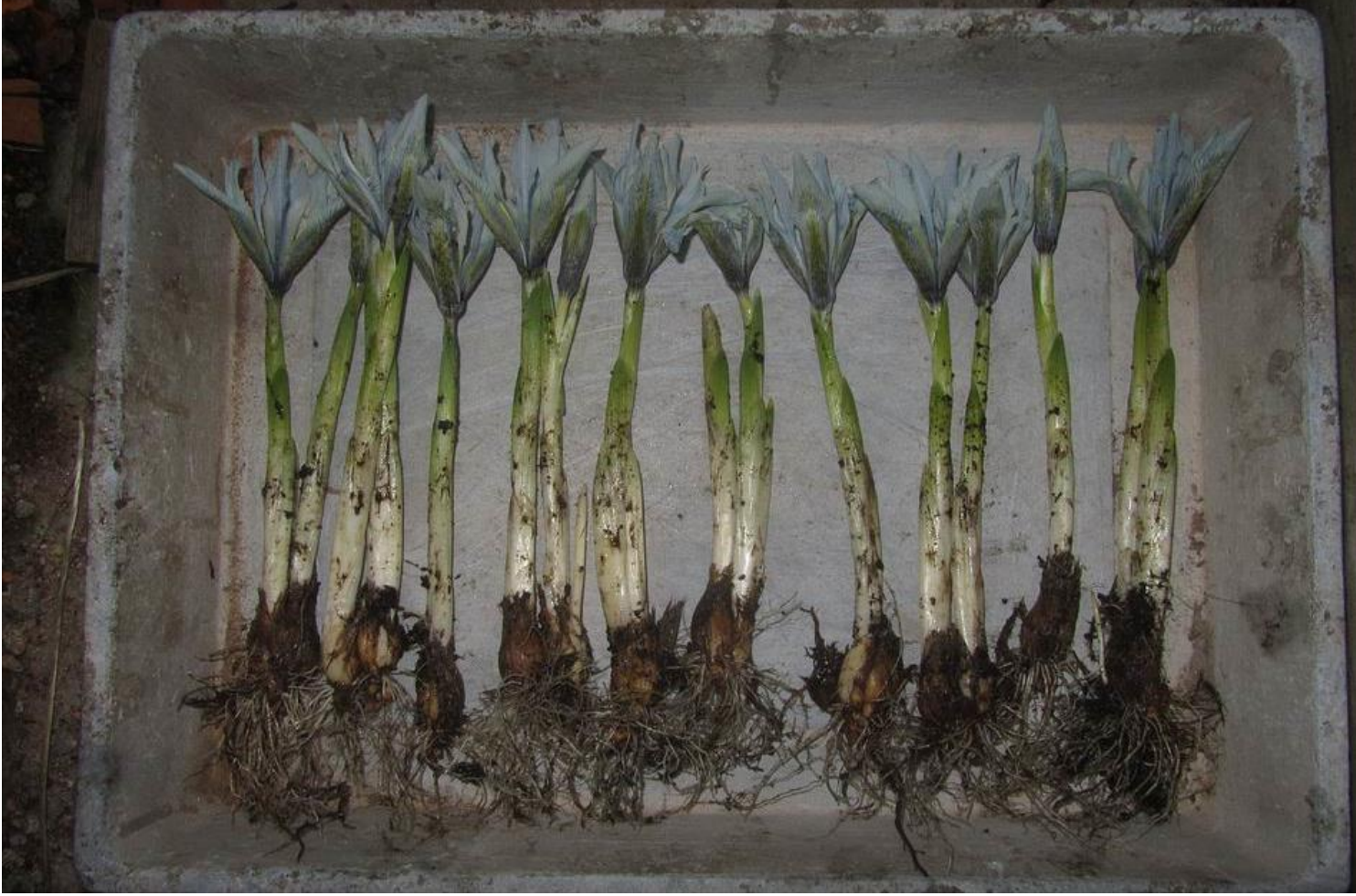
I now have ten bulbs many with two flowering shoots to replant spaced apart so that the flowers can open fully without overlapping each other.