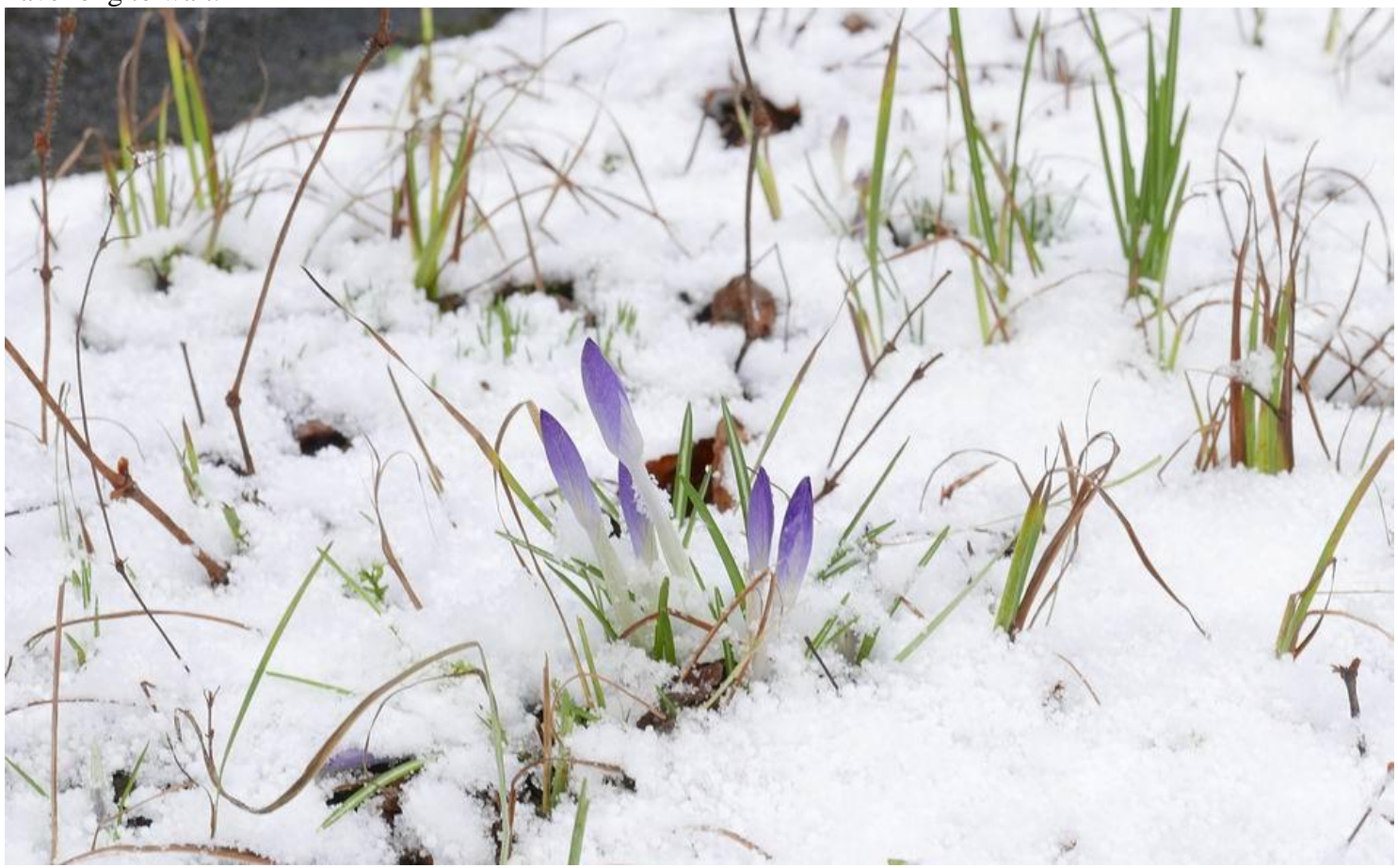
The first of the bulbs coming into flower in the drive is Crocus tommasinianus .

I have got the front drive nearly tidied ready for the first of the spring bulbs to make their appearance and I don't have long to wait.