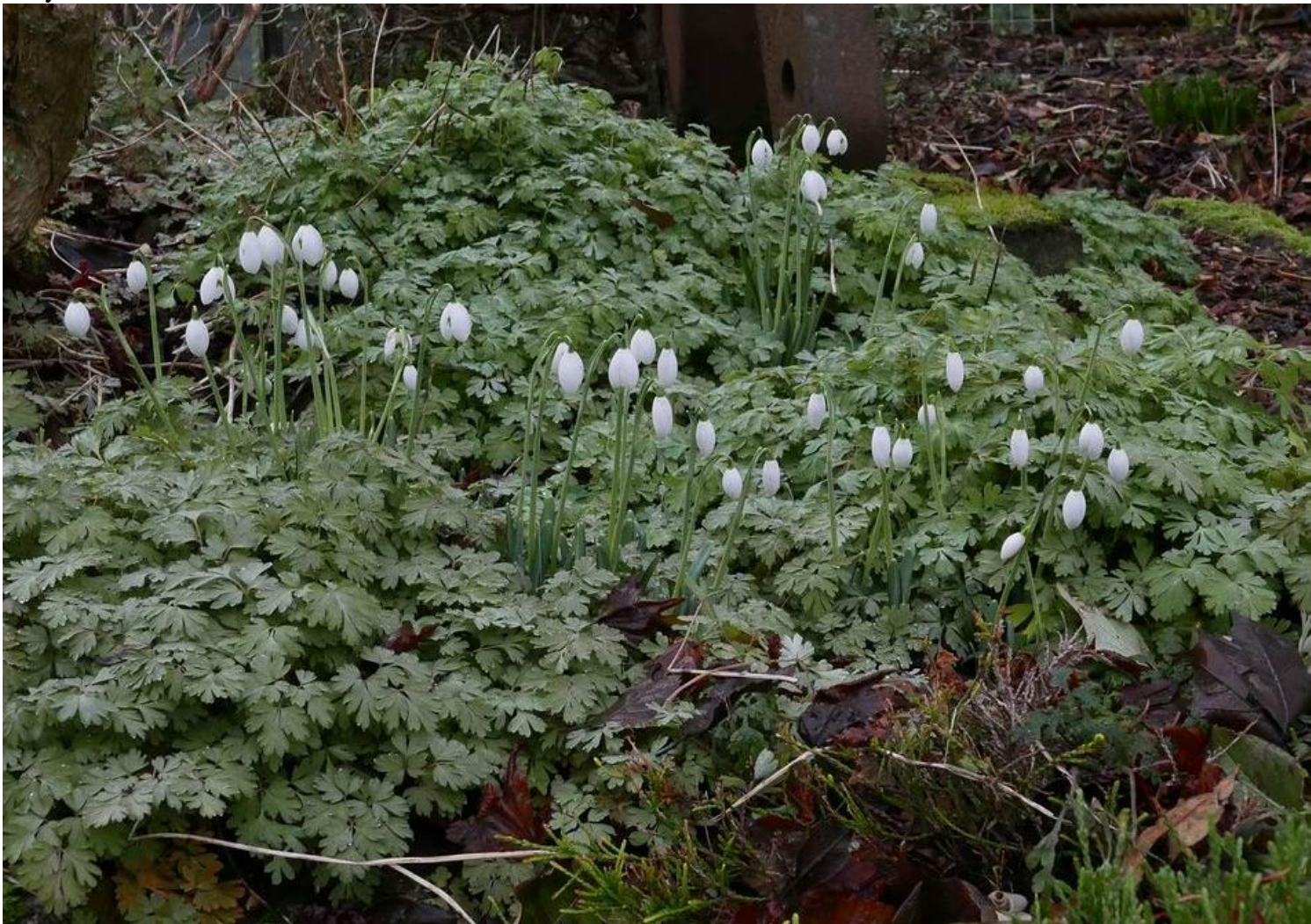
The same scene before the snow came.