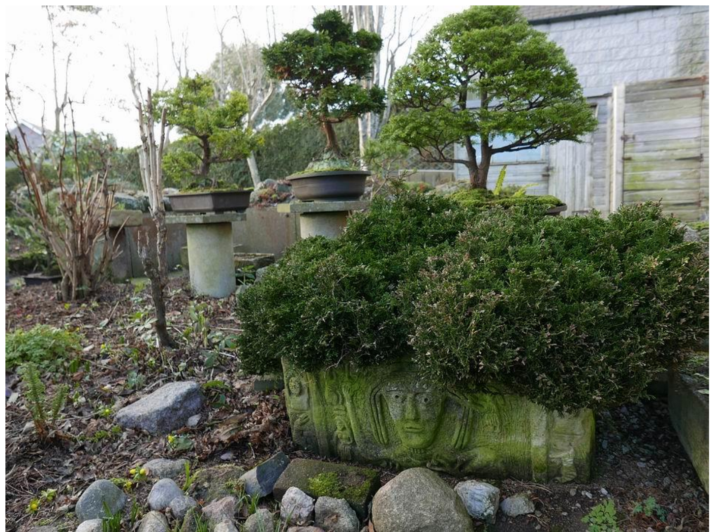
Another two dwarf conifers of the same vintage have been growing in this trough for thirty plus years. We bought