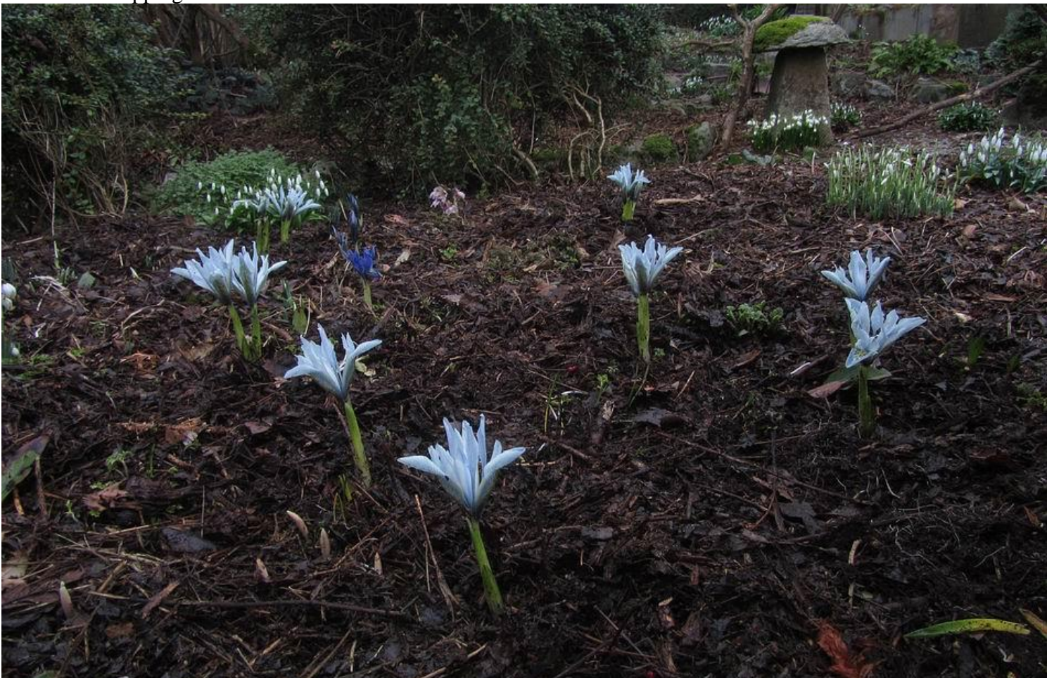
Iris 'Sheila Ann Germaney' lifted, split, replanted and watered in well. Even in winter or when the ground is wet it is very important to water any plants that you split like this in well so that the soil gets washed in to make good contact with all the roots.