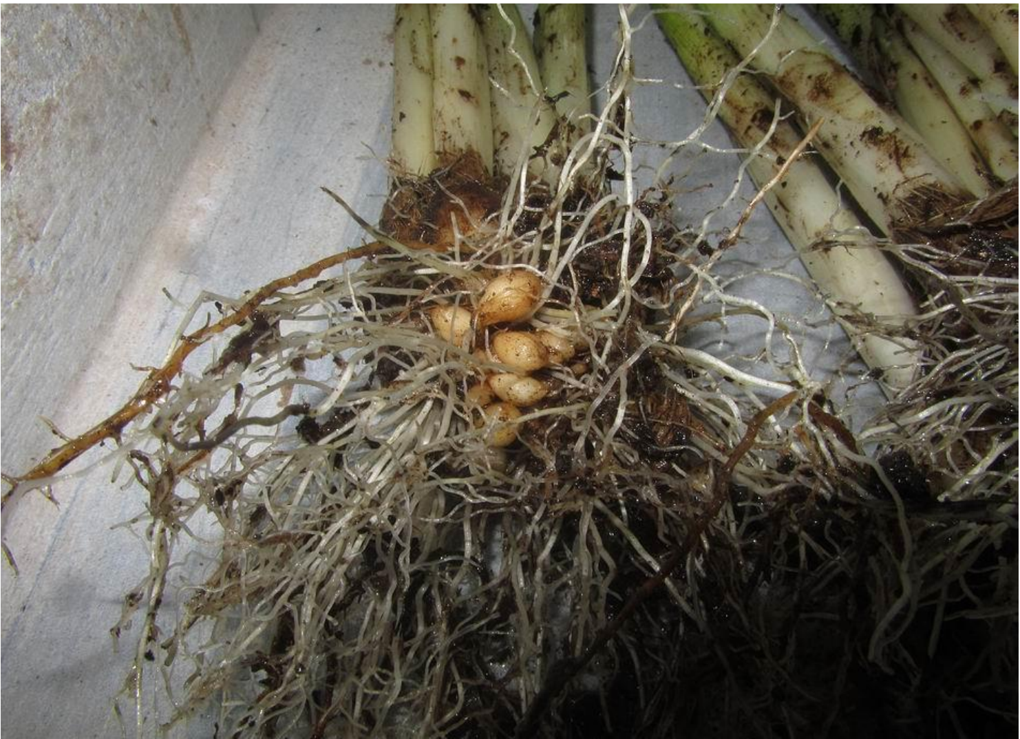
Bulbils at the base of each bulb.