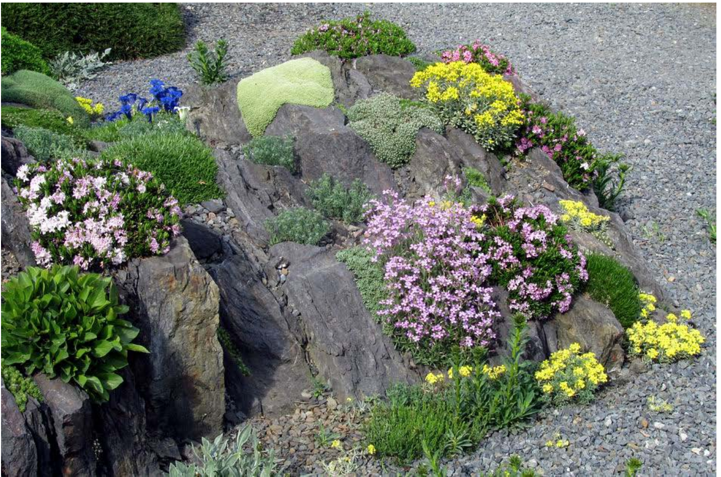
A tiny section of the extensive and expanding series of rock beds in the garden of Jiri and Ludmila Papousek.