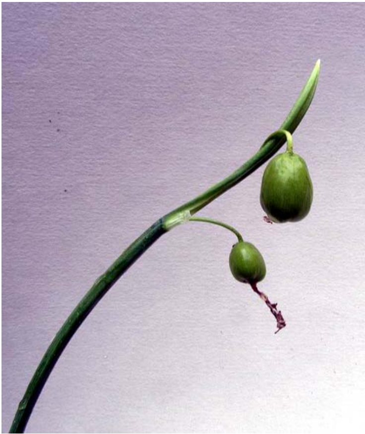
Galanthus 'Craigton Twin'