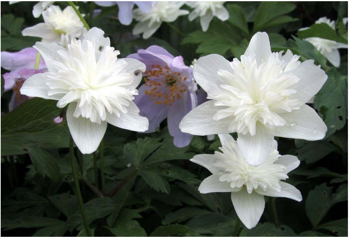
Double white Anemone nemerosa