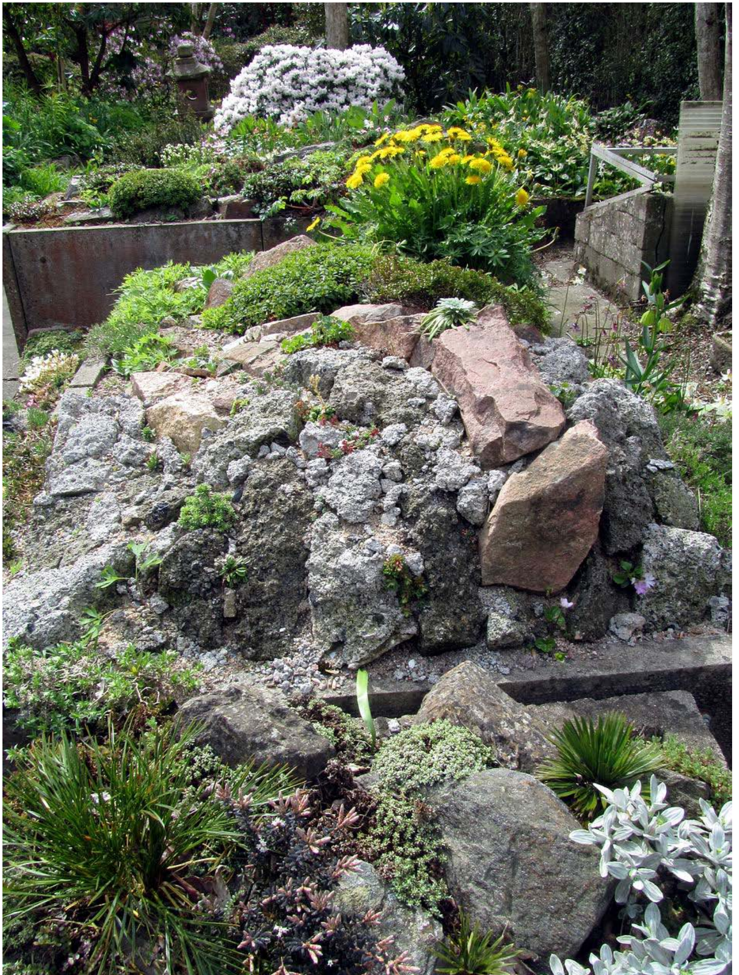
Some of my own rock work on a small scale.....

We were made very welcome by the Czechs and they organised a wonderful conference and tour. You will see many more pictures of the event and gardens now and in coming weeks as they are posted on the forum .