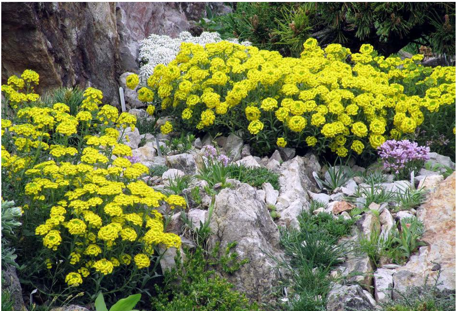
This vignette from the garden of master seed collector and explorer Vojtech Holubec.