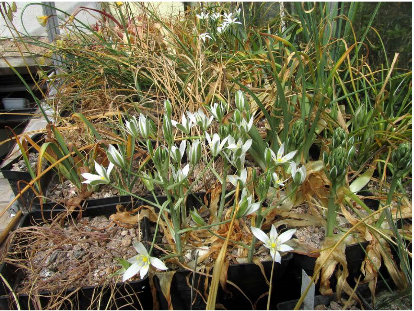
The Ornithogalum leaves have gone for this year but the flowers are only coming out now extending the flowering season in the prop-house.