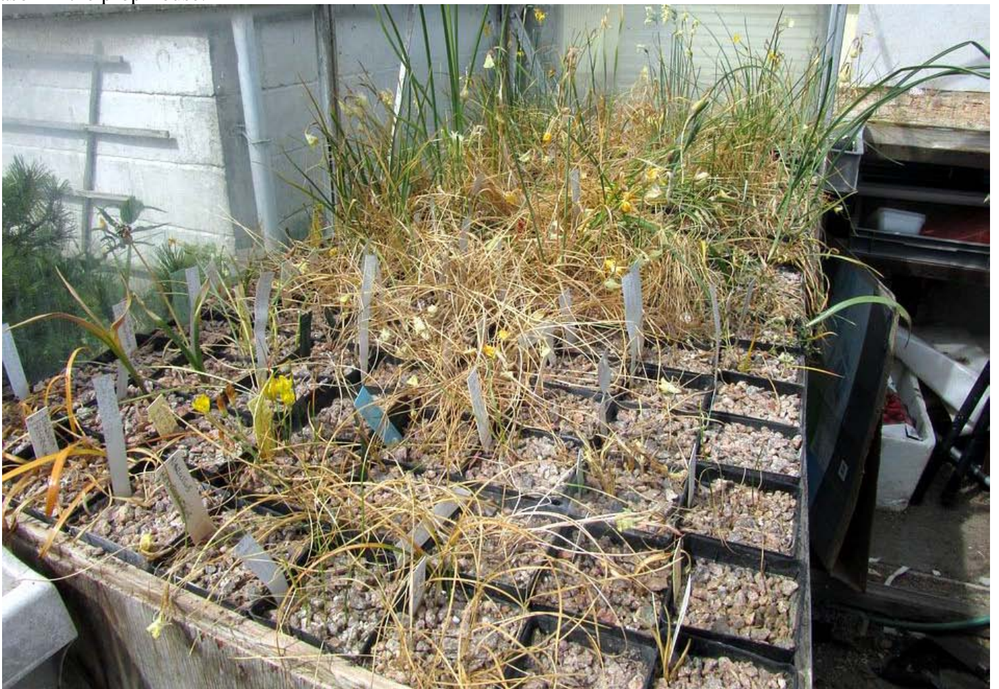
Most of the bulbs in the plunge of 7cm pots had green leaves when I left but now they are nearly all dried out. The few at the far end that are still green are Narcissus .