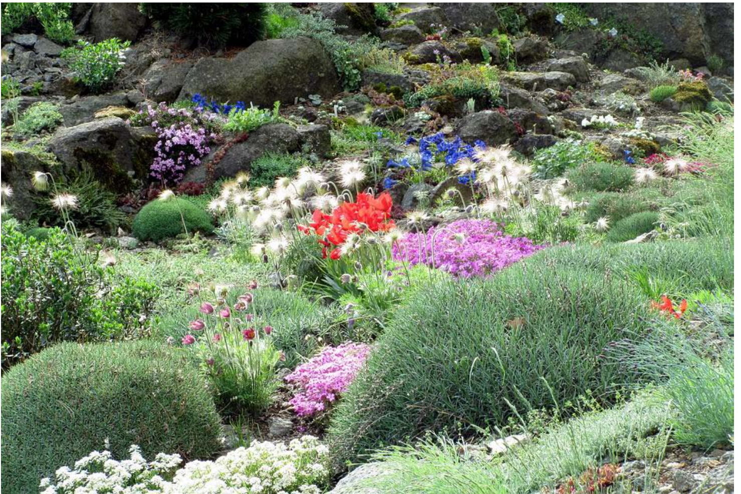
Just to give a small taster the next group of pictures show details taken in the gardens of the four main organisers of the entire event. Above is a colourful scene at the 'Beauty Slope' the garden of Zdenek Zvolanek, joint Editor of the International Rock Gardener.