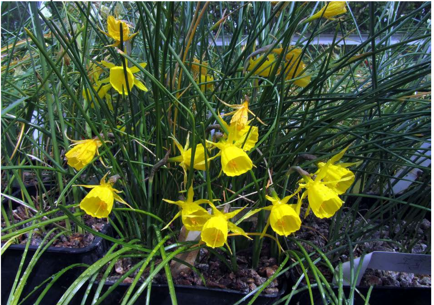
One still in full growth where I removed a glass pane is this pot of seedlings from Narcissus bulbocodium .

There is no point in trying to water bulbs in an attempt to get them to grow on once the leaves start to turn yellow in fact it is dangerous to do so. Once the bulbs start to go into dormancy they will not change their mind and adding water which will not be used by the plant can cause the bulb to rot. Despite the fact that if I had been home I could have kept the growth going for a while longer, most of these bulbs have had a good growing season and should all still flower next year.