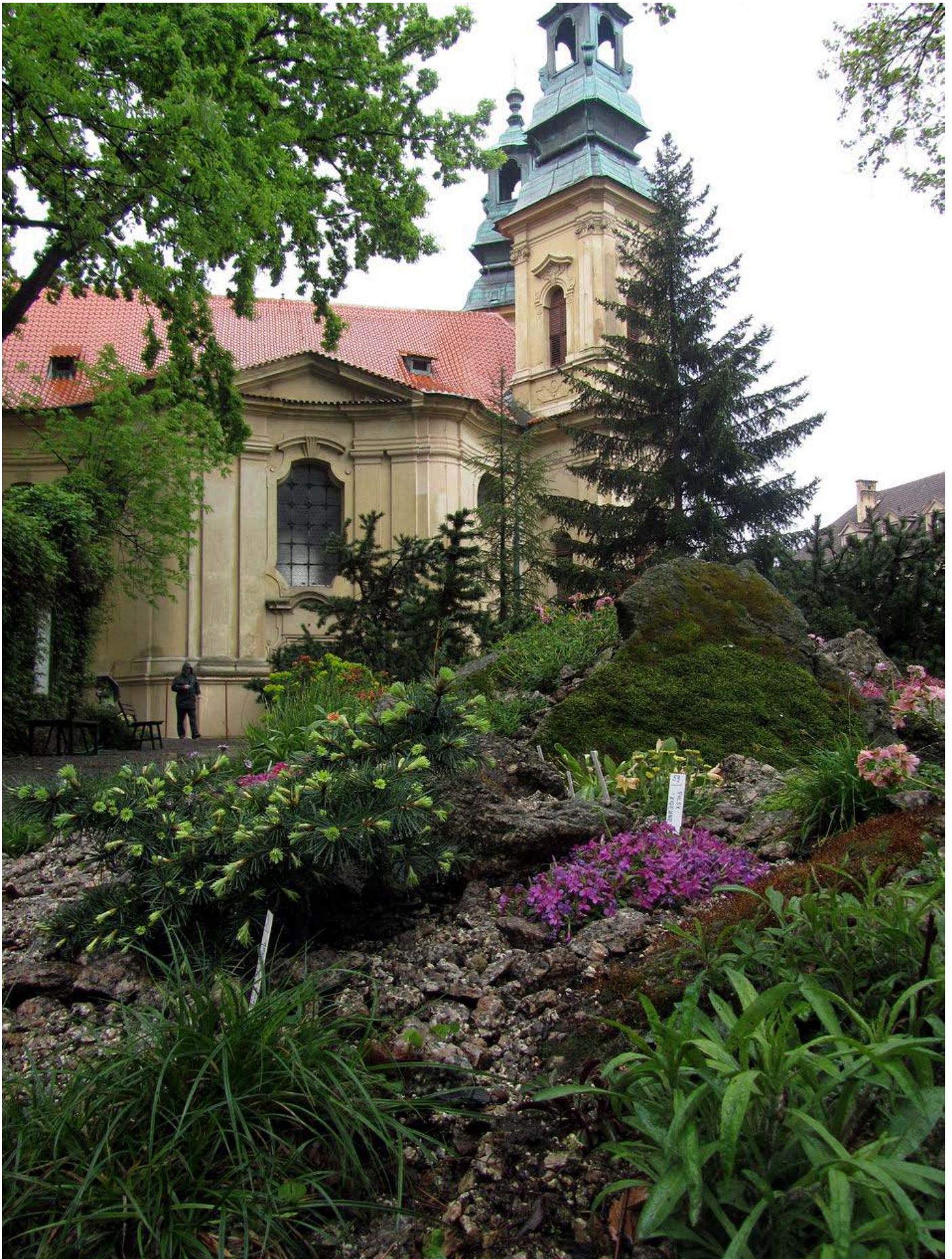
Rock Garden Show in Prague