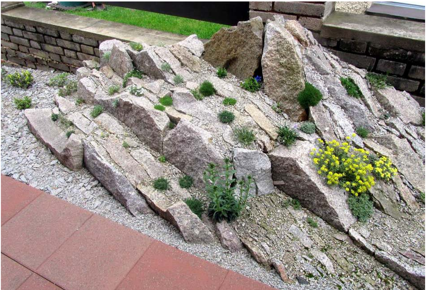
Petr Divis only caught the 'Rock Garden Bug' a few years ago but has already created a fantastic series of rock garden beds, using granite that show outstanding skill and artistry in the placing of rocks. I have always said in my trough workshops that you should be bold with the rocks and place them to look good before you add any plants – then you can further enhance the effect with plant highlights – that is well illustrated here.