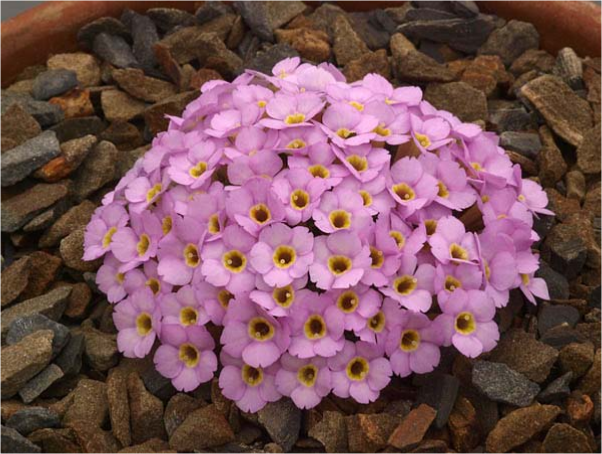
Above: Dionysia 'Corona' Below: Calochortus coeruleus