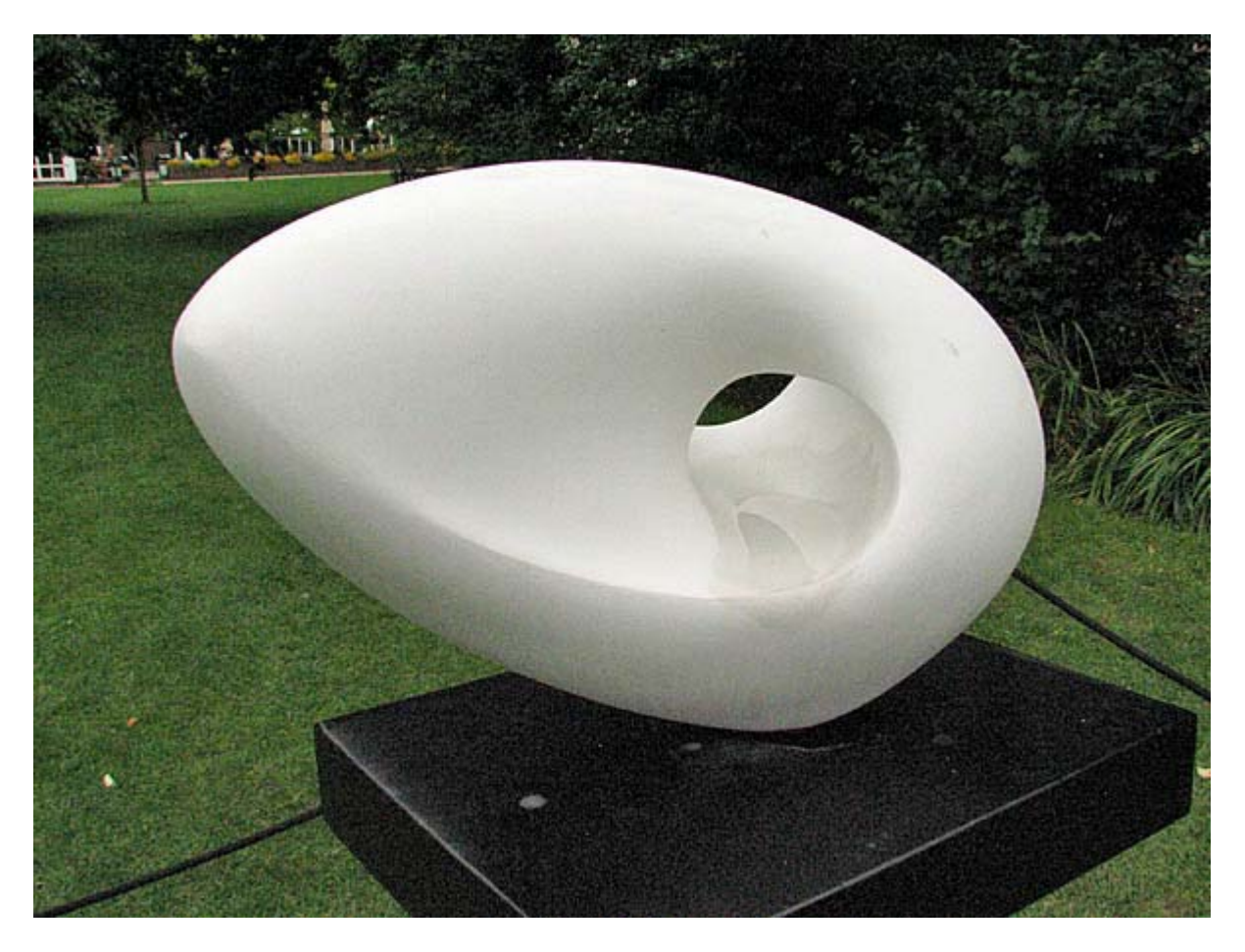
'Development' by Graham Heeley in jesmonite and steel:

'Day Breaks Over The Ocean' by Rosemarie Powell in jesmonite on steel: