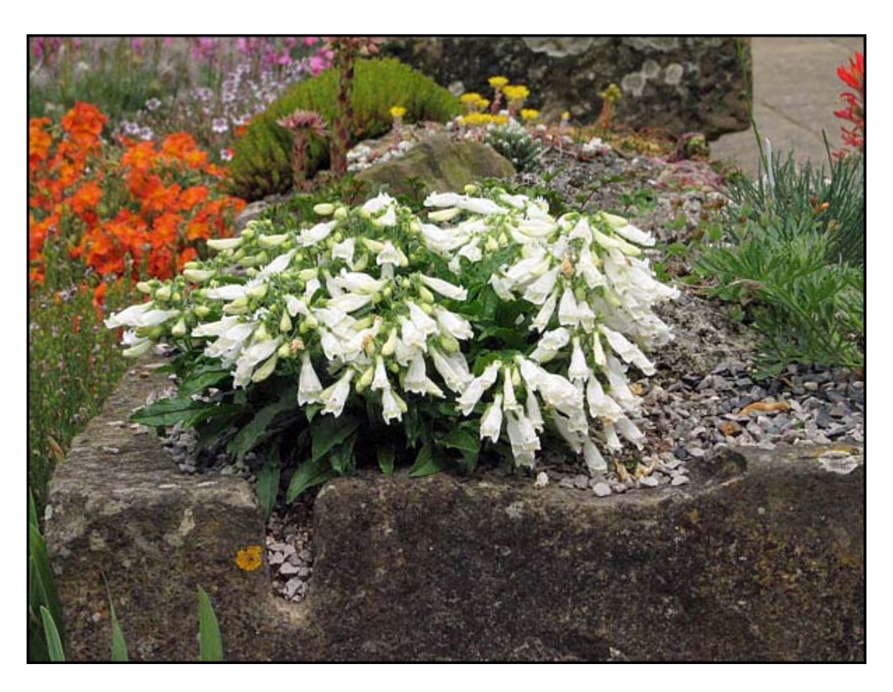
Above: Penstemon hirsutus var. pygmaeus f. albus