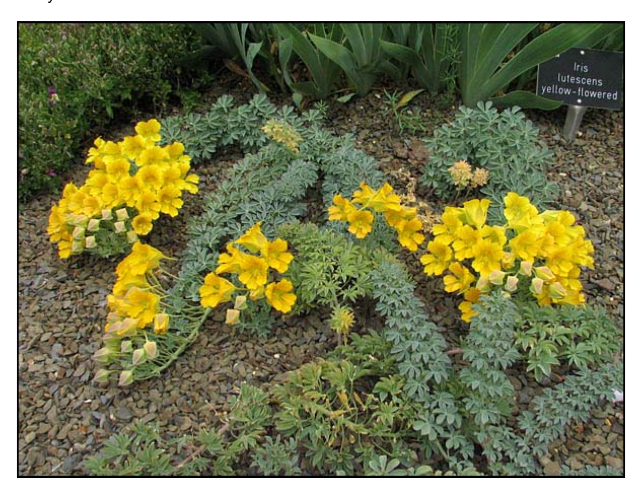
In the nearby Landscaped House, the well known Verbascum 'Letitia' is absolutely smothered in bloom:

Many years ago I saw a very large trough at Harlow Carr devoted to a single plant – Tropaeolum polyphyllum . About five years ago I planted some tubers of this species in a raised bed at Wisley. It has taken all that time to get anywhere, but finally this year it flowered reasonably well: