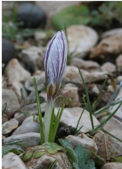
Crocus fauseri – far left