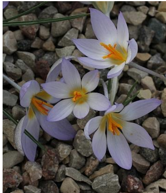
C. biflorus subsp. yataganensis