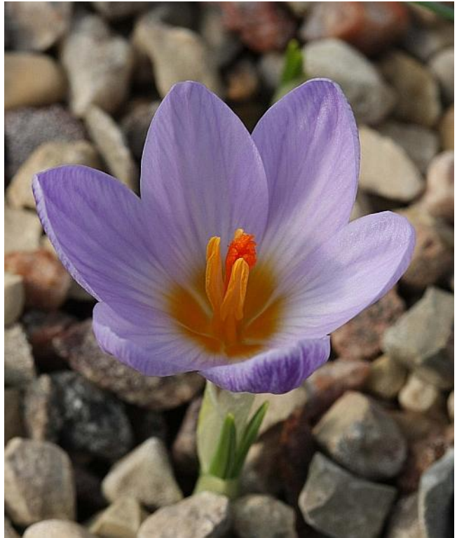
Crocus munzurense SASA- 211 -01