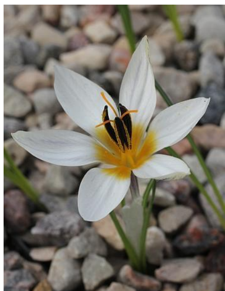
Crocus fauseri – far left