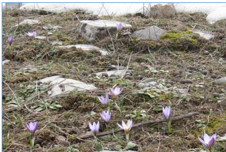
Crocus mawii in wild and cultivation photos Jānis Rukšāns

http://www.srgc.net/forum/index.php?topic=11230.msg291601#msg291601