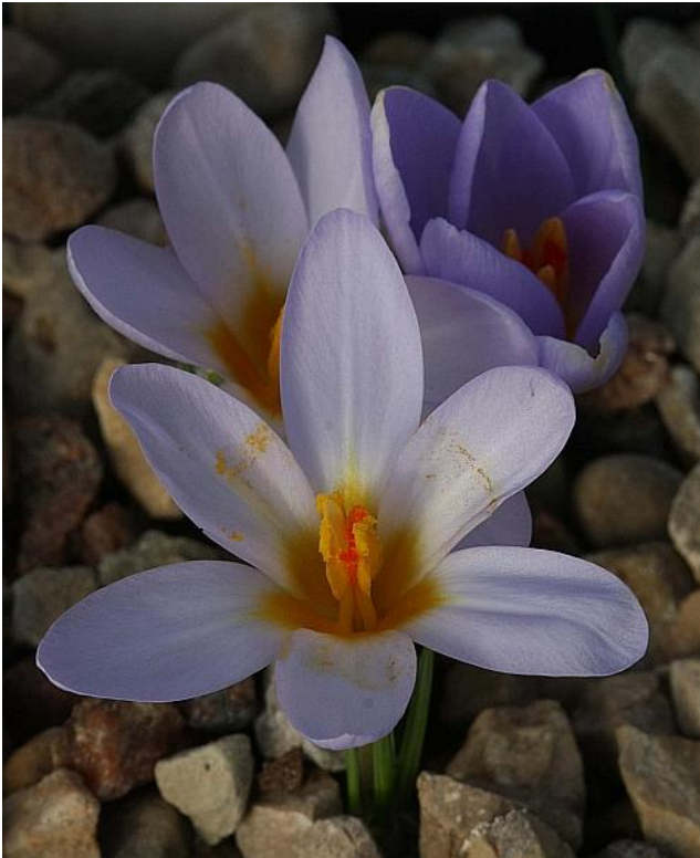
Crocus munzurense HKEP-9911-07