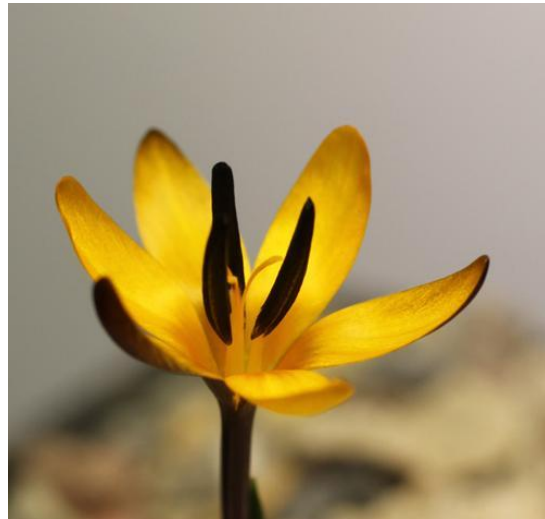
C. chrysanthus subsp. kesercioglui