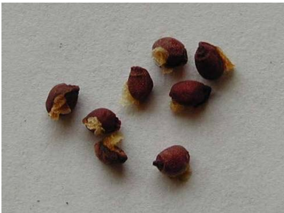
Crocus sieberi seed – actual size c1.5mm diameter